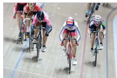
The National Cycling Centre is one of the venues that may have to reduce its back office resources