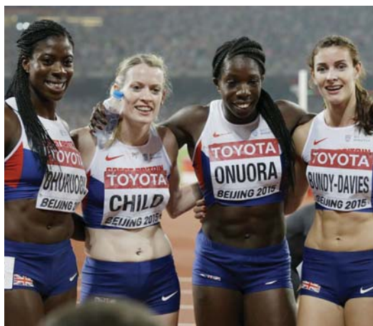
The World Athletics Championships is coming to London in 2017

"It's great to see more people getting out and exploring the huge range of quality