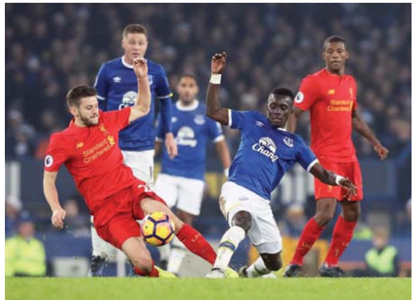
Everton wants to compete for honours with Merseyside rival Liverpool