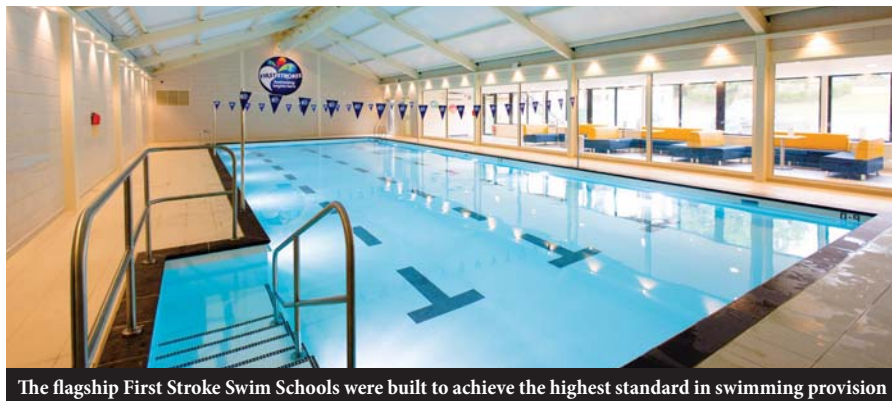
The flagship First Stroke Swim Schools were built to achieve the highest standard in swimming provision

For further information on the speakers visit www.spatex.co.uk