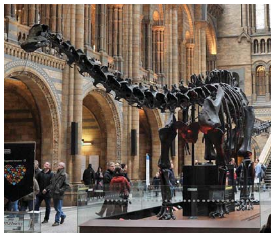
Dippy has been a feature at the museum for more than a century

NHM, which is currently renovating its exterior grounds, has plans to cast Dippy in bronze upon its return to the museum and