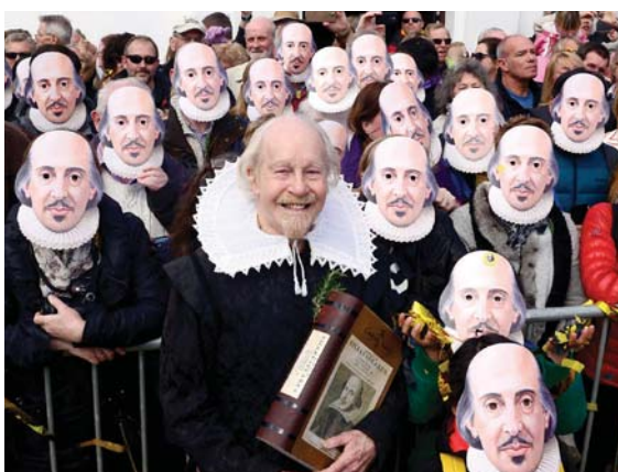
A number of public events were held to celebrate The Bard of Avon

"2016 has shown that Shakespeare's works are perhaps more relevant today than they