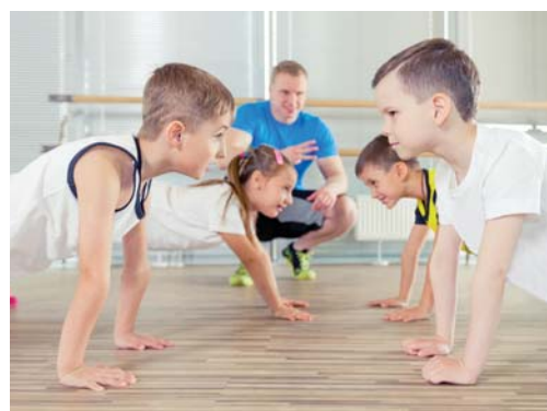
Children’s physical activity levels are a particular concern

Among boys, the decrease in the proportion meeting recommendations