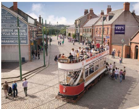
The report calls for a better 'regional balance' of culture funding

The inquiry called for a better regional balance of culture funding, with a significant disparity between London and the rest of the UK. London received the bulk of government funding for the arts despite being in a better position to raise alternative revenue than locations outside of the English capital.