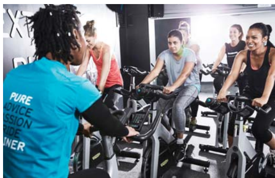
Pure Gym's 170 sites will become training centres for PTA

"We're committed to helping the public incorporate exercise as part of a healthy lifestyle and this partnership will enable