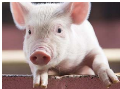
Folly Farm is located in Tenby in Pembrokeshire

The event will look at how museums and historic houses best tell their stories, ask if we should integrate the experience into the architectural space or reinvent it in a new visitor attraction and delve into the challenges theme parks are facing in a culturally-rich visitor attraction landscape. Details: http://lei.sr?a=C9w7a_O