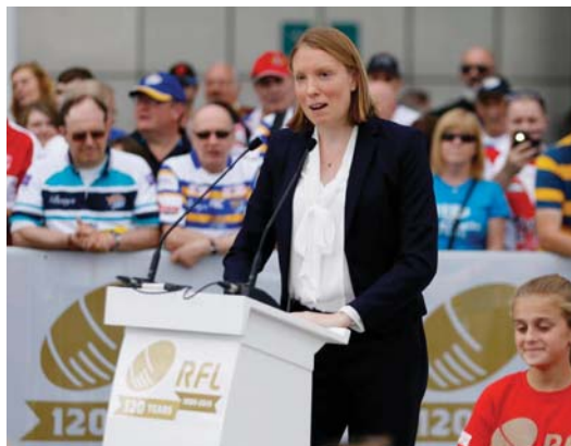
Sports minister Tracey Crouch said sports governing bodies will be able to bid for further funding to address other markets

Cycling has also lost a significant amount of funding compared to the £32m it was handed