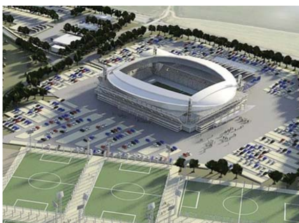
The stadium will be surrounded by leisure facilities and an ice rink

Full planning permission is yet to be submitted, according to a council spokesperson. A section of the local community in Grimsby