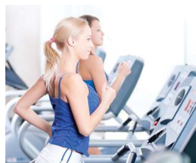
Around £2m will go towards the improvement of gym provision in Flintshire

The appointments are the latest part of the not-for-profit health body's ongoing mission to improve its governance structure and build on recommendations from a comprehensive review of the organisation by management specialist Portas Consulting in 2014. Details: http://lei.sr?a=4Zzh8_O