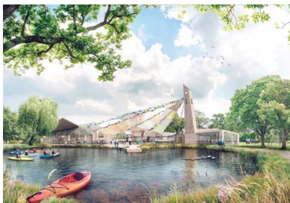
The museum in London is expected to open to the public in 2019

The Scouting Museum’s colourful design is intended to create a celebratory feel