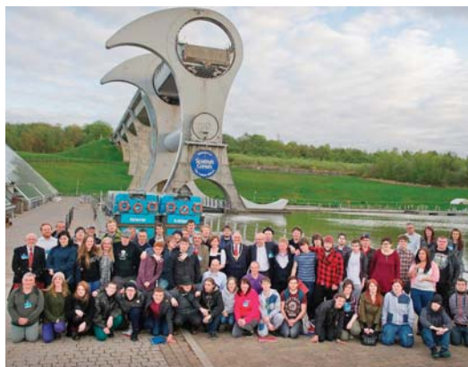
The scheme helped 162 young people Between 2013 and 2015

Learning through practical projects, volunteers will receive first-hand experience