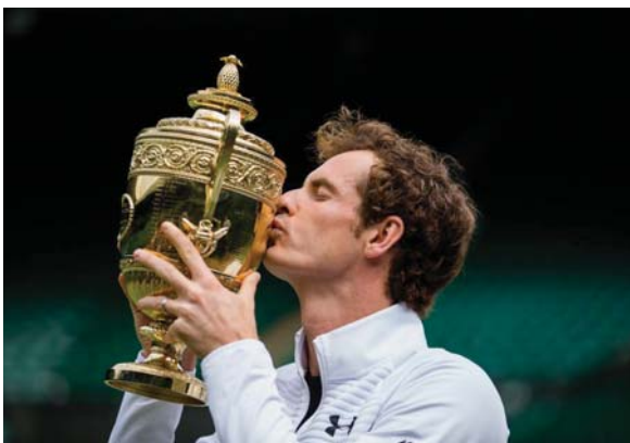
The LTA wants to capitalise on the success achieved by Andy Murray

“This investment will make tennis more accessible in the years to come, bringing certainty of play to a climate that sees on average 200 days rain a year and in a country