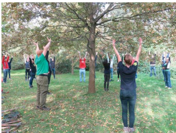
More than 50 per cent of patients on exercise programmes drop out

Those completing the scheme were on average 51 years of age, whereas the average age of those dropping out was 46 years old.