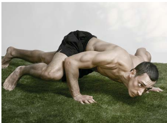
The gym's design utilises a wide range of natural materials and plants

“Our society needs to calibrate our relationship with the natural world, which is leading to a surge in this kind of biophilic, nature-inspired design,” said Jencks.