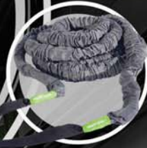
WAVE BATTLE ROPES