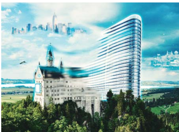
A study predicts that nanotechnology and 3D printing will soon allow environments and buildings to alter their own layout

According to the study, the hotel guests of the future will expect to be served by robot