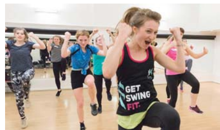
SwingTrain will launch with more than 50 instructors

Next month, SwingTrain will launch with more than 50 instructors holding classes in London, Belfast, Birmingham, Bristol, Canterbury, Exeter, Manchester and Southend-on-Sea.