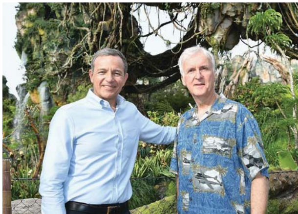
Bob Iger (left) and James Cameron (right) attended the launch

The Valley of Mo'ara is the US$500m (€446m, £386m) attraction's backdrop, with its seemingly floating mountains and bioluminescent rainforests creating an iconic attraction for Animal Kingdom.