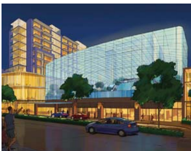
A waterpark anchors the development