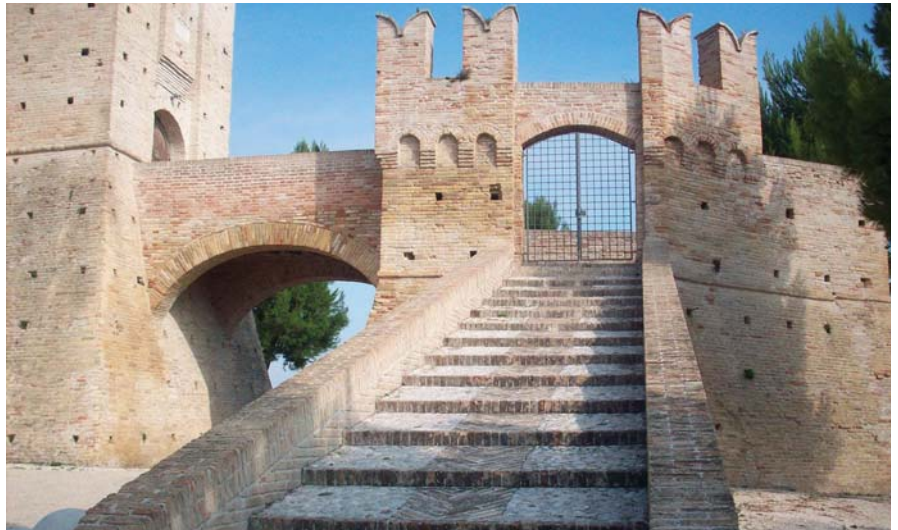
Montefiore Castle, located in the territory of Recanati, is among the sites up for grabs

Winning bidders will gain a nine-year lease on the properties, with the option to renew for a further nine years. Those who are believed to have a strong restoration and operation plan can be given a 50-year lease.