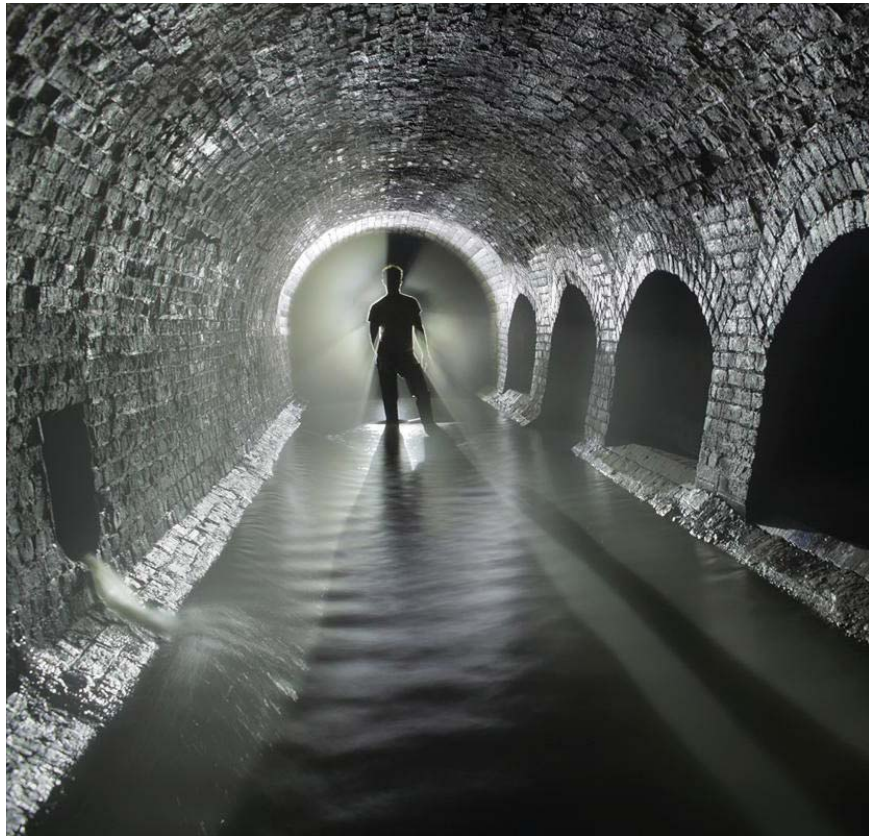
The ‘lost’ River Fleet, which runs under Smithfield, could become a museum exhibition

“At one side of the basement site, you’ve got the line where the river runs,” said Werner. “It’s one of London’s lost rivers covered over in the 19th century. It was converted into a glorified sewer but it’s still there. It runs quite close to the westernmost edge of the museum site. We’re exploring at the moment how to link that up and having a viewing point onto the Victorian-era sewers. The story is such a compelling one – the year of the great stink and the building of the sewers – saving London when it was on the brink of disaster.”