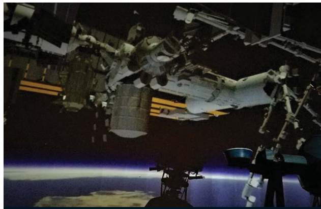
7thSense installed its media server and show control system

The 825-metre DrageKongen track is sited in a Asian-inspired jungle-themed area with a 4-metre-high dragon temple at its centre.