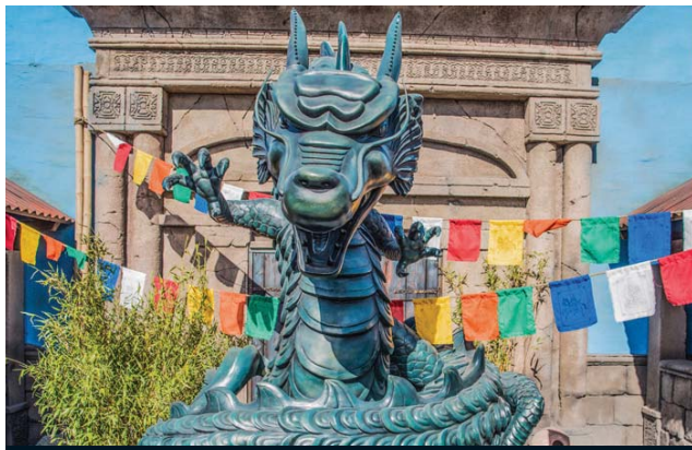
DrageKongen is part of the upcoming Asia zone at the park