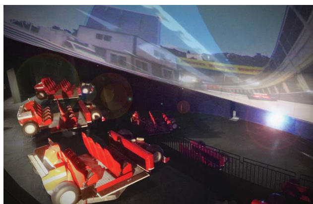
Racing Legends takes riders on a journey through time

For the Lucky Luke theatre Alterface used its Salto show control technology to create a media show. It features a wagon-styled room with a number of audience-facing screens concealed by sliding doors.