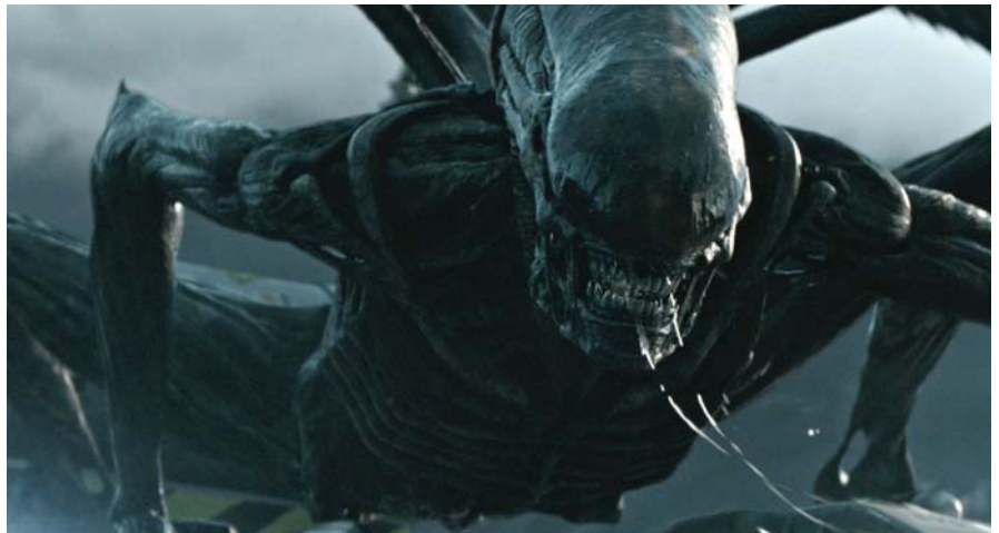
Fox recently released the latest film in the horror sci-fi franchise Alien: Covenant

AM2 is published fortnightly by The Leisure Media Company Limited, Portmill House, Portmill Lane, Hitchin, Herts SG5 1DJ, UK and is distributed in the USA by SPP, 75 Aberdeen Road, Emigsville, PA 17318-0437. Periodicals postage paid @ Manchester, PA POSTMASTER Send US address changes to Spa Opportunities, c/o PO Box 437, Emigsville, PA 17318-0437. The views expressed in print are those of the author and do not necessarily represent those of the publisher The Leisure Media Company Limited. All rights reserved. No part of this publication may be reproduced, stored in a retrieval system or transmitted in any form or by means, electronic, mechanical, photocopying, recorded or otherwise without the prior permission of the copyright holder. Printed by Preview Cromatic Ltd. ©Cybertrek Ltd 2017 ISSN Print: 2055-8171 Digital: 2055-818X