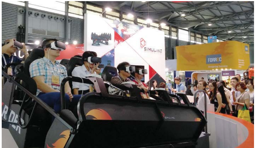
This year's event will take place at the Marina Bay Sands in Singapore

2017 is the Association of Independent Museum's (AIM) 40th year, so this year's National Conference will provide the opportunity to focus on how independents prosper under effective leadership, through inspirational stories from AIM members. Tel: +32 2 649 7383 Email: aimadmin@aim-museums.co.uk