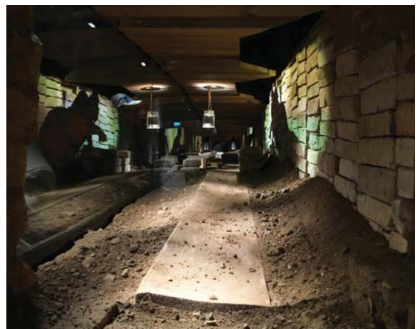
Kvorning Design created the new exhibition at the museum

The exhibition – funded by the Nordea-foundation – includes a replica of the tunnel, reconstructed from photos, drawings and archaeological excavations. Using