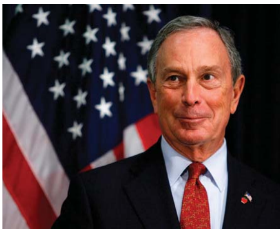
Bloomberg has donated a further US$60m towards the project

"I've always believed the arts have a unique ability to benefit cities by attracting creative individuals of every kind, strengthening communities and driving