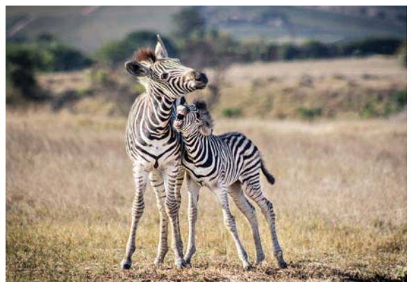
The plan would have helped Perth Zoo's breeding programme

Originally planned for Lower Chittering, north of Perth, the conservation and