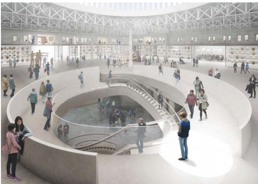
The Museum of London is scheduled to move to its new Smithfield home in 2022

The museum announced plans to relocate in March 2015, with management citing a number of problems at its current site including poor accessibility, an ageing building and a poor location. Stanton Williams and Asif Khan are the project architects. The new site is scheduled to open in 2022.