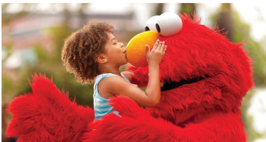
A new licence agreement will see the new attraction open its doors ‘no later than mid-2021’