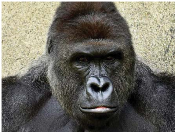
The primate's death was met with international outrage

Phase one of the development includes improved landscaping and more space in the outdoor habitat, with an energy-efficient stream and waterfall. The first phase also includes modernised living areas for the gorillas and a new behind-the-scenes configuration that provides them with spatial