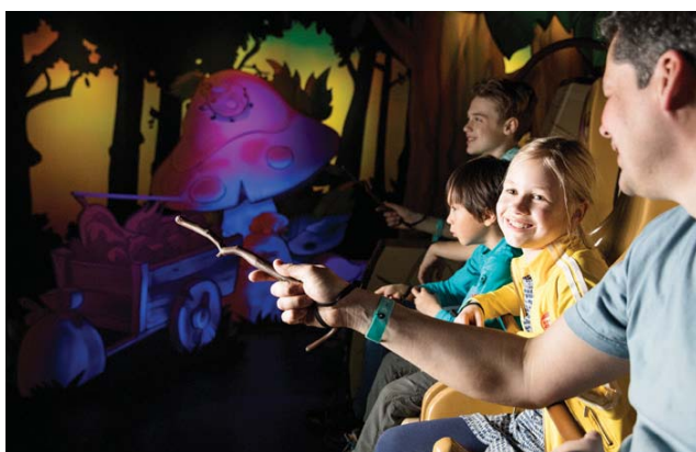
Alterface unveiled the Smurfs dark ride and Lucky Luke theatre