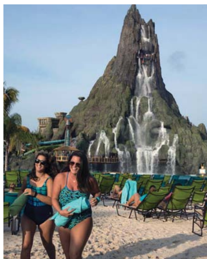
Volcano Bay replaces Wet N' Wild Orlando

Offering a fully immersive experience, the park features a multi-directional wave pool, sand beaches, a lazy river travelling through the volcano's hidden