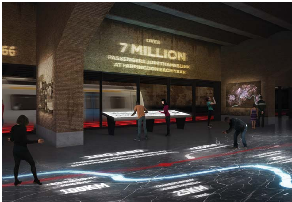
The Museum of London wants to turn a live railway track into a living exhibition at its new home

tunnels, which could be used as a live representation of London's history.