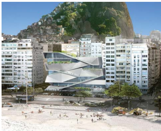
■ The museum's opening has been delayed a number of times