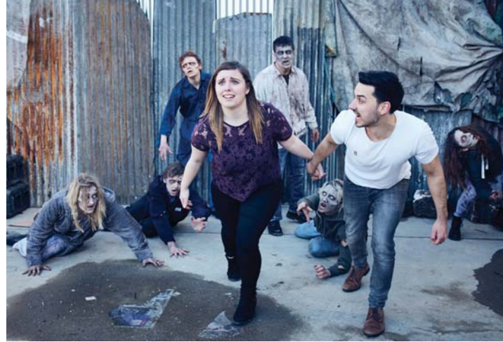
● The ride is the latest Walking Dead addition to Thorpe Park

Holovis created the immersive queue line, and preshow, as well as dramatic on-board effects and the climactic 'death defying' finale for the attraction, which is a retrofit of the park's X: No Way Out ride, the world's first backwards, dark coaster. It takes riders on a thrilling adventure as they try to escape from murderous 'Walkers' - the name given to the undead antagonists of the popular AMC show.