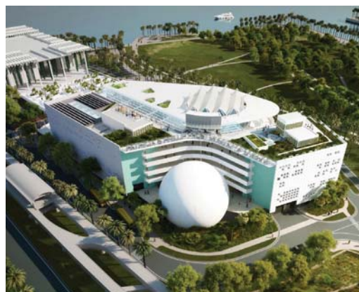
■ The museum opened in May 2017

“The public is enjoying Downtown Miami's newest museum, but the workers