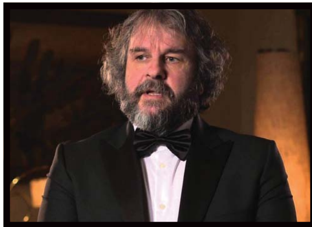
■ Peter Jackson has criticised delays in the anticipated project

The museum, to be operated by Jackson's The Movie Museum Limited (TMML), would be home to a collection of movie memorabilia, with a strong emphasis placed on Jackson's