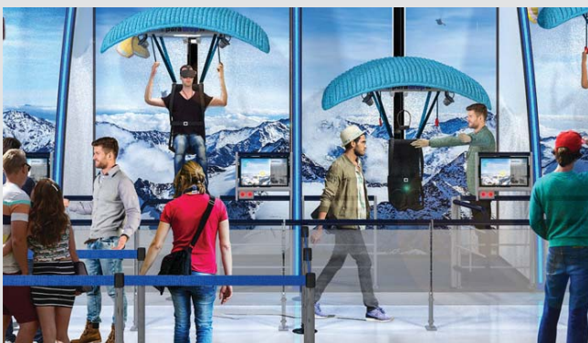
● Paradrop VR will be an extension of iFly's indoor offering