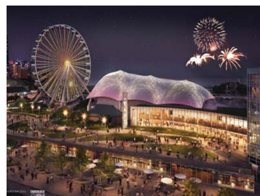
■ Navy Pier is currently undergoing a complete redevelopment

Navy Pier welcomes more than eight-million guests annually. Originally opened in 1916 as a shipping and recreation facility, it now has more than 50 acres of parks, restaurants, attractions, retail shops, sightseeing and dining cruise boats.