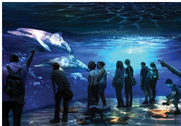
■ The first Ocean Odyssey in the Kingdom will open in 2019