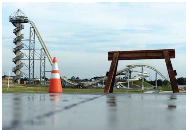
■ Caleb Schwab died riding the Verrückt water slide