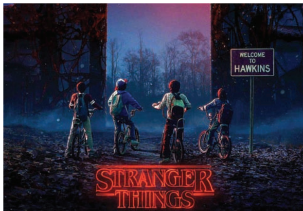
■ This will be Stranger Things ' first theme park appearance