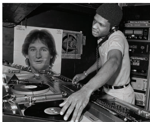
■ Art and photography feature in the exhibit

The exhibit, which runs until 9 September, looks at nightclubs in