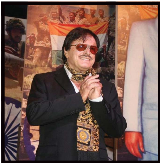
■ Khan is known in India for both his acting and producing skills

{ "Khan's Kingdom Entertainment was given a year to start work – which had lapsed" }