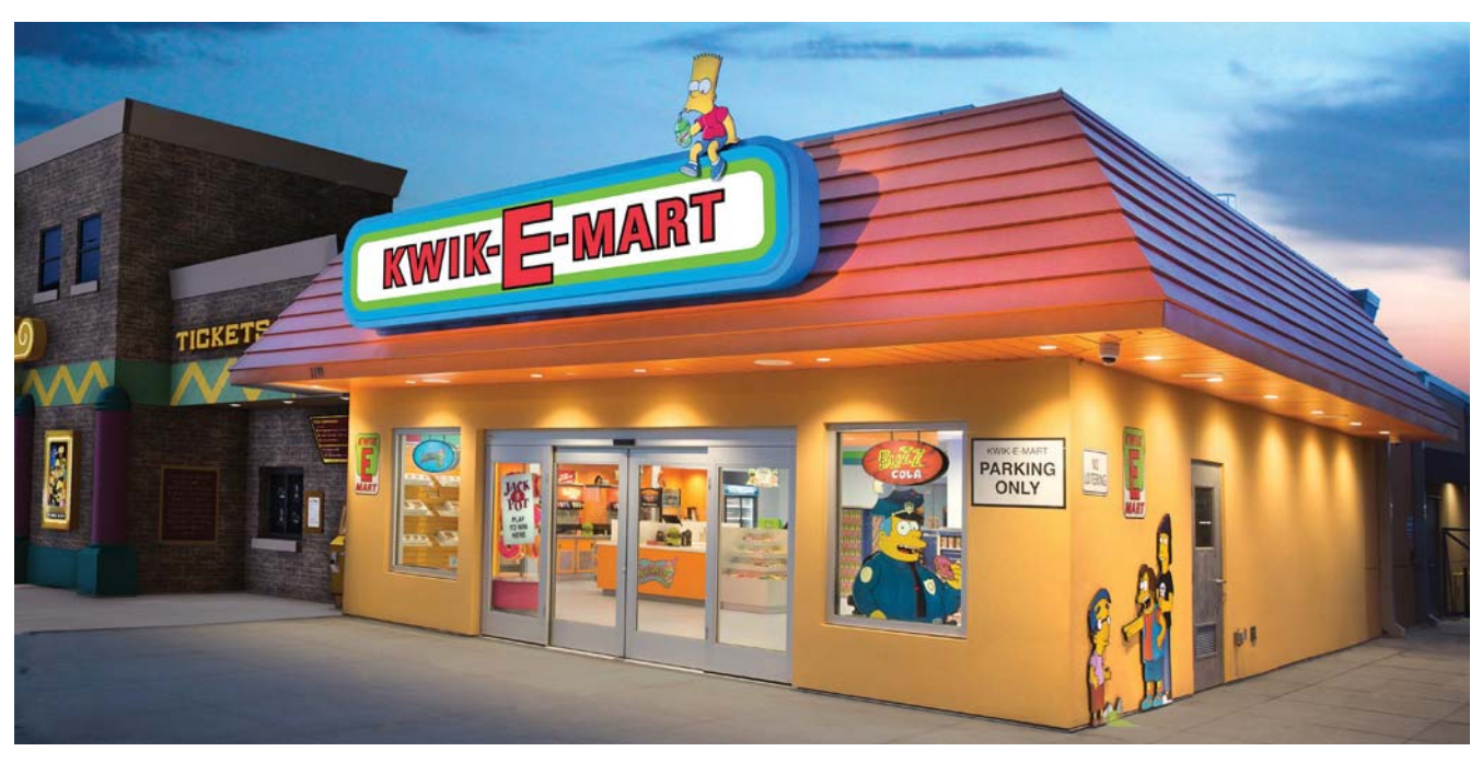
• Visitors to the Kwik-E-Mart will be able to buy iconic foods featured in the show, such as Lard Lad Donuts and Buzz Cola