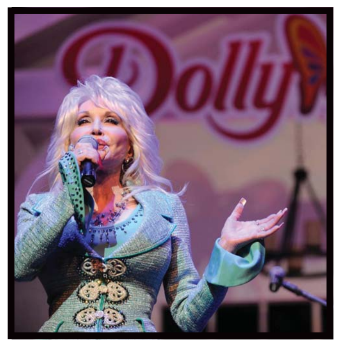
Parton has been part-owner of the theme park since 1986

"I used to imagine what it'd be like to fly with a dragonfly – now all these things are coming true to our guests"