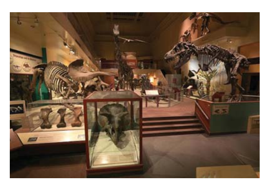
■ the room was closed for a US$129m (€113.2m, £101.4m) renovation in 2014

The hall's main exhibition will feature dinosaurs, plants and insects. Some of