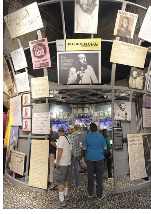
The museum was designed by JRA

"Culture is preserved by meaningful storytelling. What these artists have done is important, and it should be both celebrated and contextualised, drawing connections that make the past relevant to the present."