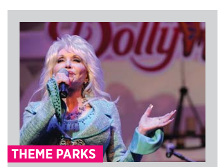
Dolly Parton reveals Wildwood Grove plans

US$37m project to include rides and entertainment