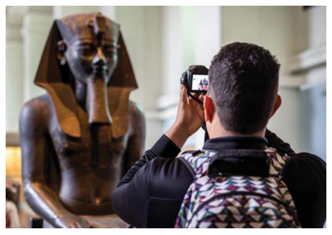
British Museum remains the most visited attraction in England

"Our world-class attractions have once more proven to be a huge draw for both UK and overseas visitors," said minister for arts, heritage and tourism Michael Ellis. MORE: http://lei.sr?a=S6C9B_A