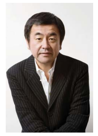
■V&A Dundee is Kengo Kuma's first building in the UK

The Kengo Kuma-designed V&A Museum of Design Dundee, Scotland's first dedicated design museum, is set to open its doors next month.