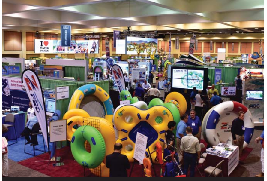
The show features a large show floor and more than 45 sessions and workshops

EAS 2018 is an all-encompassing destination for leisure and attractions industry professionals, including