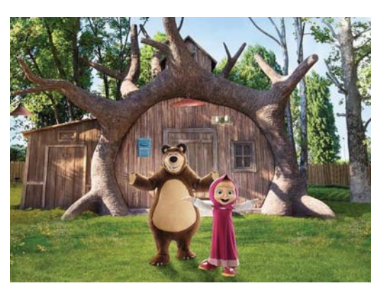
The attraction is based on Masha and the Bear

Vroom, a themed rollercoaster designed for children, themed shops and a train carriage-inspired refreshment point will all be available to children and their families as part of the area. The area will also include a landscaped