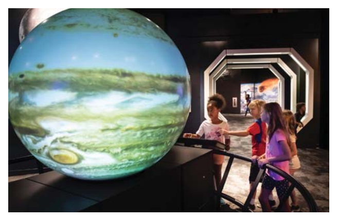
The new addition offers an immersive guest experience

The planetarium immerses guests in the night sky and distant galaxies in 10K resolution and invites them to see the Aurora Borealis – commonly referred to as the Northern Lights. MORE: http://lei.sr?a=j7n6V