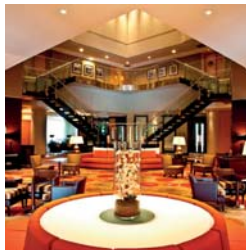
Each Crowne Plaza property will be 'realigned'

The ARK Academy's existing services include advanced courses in massage; bespoke training and support for all partners who retail ARK products; and assessor awards A1 & A2