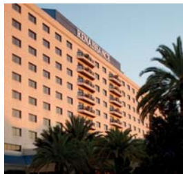
The property is located within the SeaWorld Resort

Spa facilities include eight treatment rooms; a manicure and pedicure area; steamrooms; and relaxation areas, while a 2,600sq ft (242sq m) fitness club is also on offer at the property. Product lines used in the nèu lotus spa at the resort include Zents; Thalgo; Dr Gross; Comfort Zone; and Deserving Thyme.