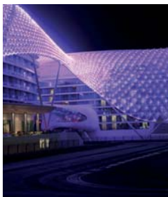
The hotel will be now known as Yas Viceroy Hotel

The 27-story Art Deco building, a Chicago landmark designed by C.W. and George L. Rapp Architects in 1928, has significant historic and architectural features that will be restored and recreated. The new hotel will have 250 guest bedrooms and a spa.