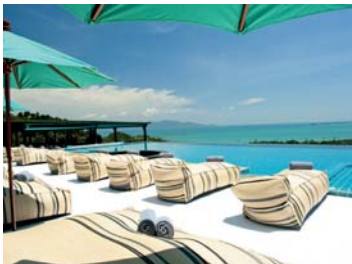
The Mantra Samui Resort and Spa took more than three years to complete