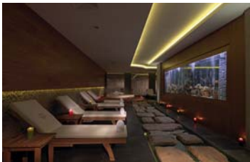
Facilities at the spa include 20 treatment rooms and a relaxation area