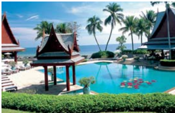
The company provides software products at a number of top resorts