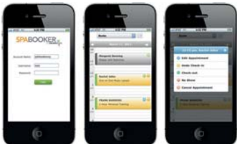
The company has announced a number of innovations in recent months

SpaBooker is the preferred software supplier for Hilton Worldwide, Six Senses and Exclusive Resorts and already has more than 2,500 customers in 56 countries. The company has announced a number of innovations in recent months, including an in-Facebook booking application. In announcing the deal, Revolution