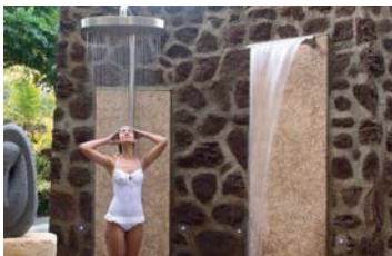
The design and treatment menu of the spa reflect Hawaiian traditions

Elsewhere at the Laniwai spa there is a 1,500sq ft (139sq m) purpose-built facility for teenagers, which is also situated away from the