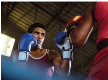
The gym will be the largest private boxing training gym in the city