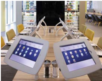
Modern technology and gadgets - such as iPads - are used across the hotel

For business customers, the hotel features seven meeting rooms that boast smart whiteboards as well as an area where they can play Wii