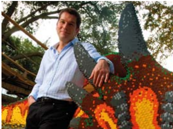
Varney accused the government of 'not taking tourism seriously enough'

Varney's comments came in the same week that VisitBritain launched a strategy to attract an extra 40 million visitors by 2020. The comments also follow a difficult summer