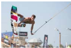
The 360 centre will offer a number of activities

She said: "I'm very eager to ensure that the Department for Culture, Arts and Leisure (DCAL) and the agencies play their full part in supporting initiatives aimed at promoting mental wellbeing."