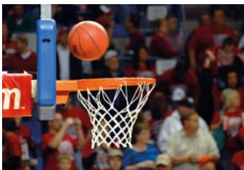
The scheme aims to improve participation numbers among the young

A survey, carried out by TNS-BMRB on behalf of Sport England, shows good