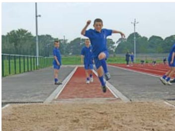
School sport is a key factor in trying to make youngsters more active

"This is exactly why [education secretary] Michael Gove and I are committed to working together, to ensure that school sport thrives and healthy competition is promoted. Great school sport is key in making sure more children get physically active from a young age."