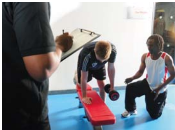
YMCA will make its apprenticeships and training available to YST

"We want to capitalise on this remarkable year for sport and reach as many young people as possible through our work, which is why