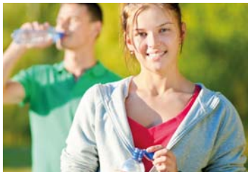
The initiative will result in 150 new full-time coaches at UK colleges

CSM will help individual sports to market their opportunities to students as well as linking colleges with community sports clubs, running leagues and sports groups and offering coaching for certain sports. Every sports professional employed under the scheme will be expected to help hundreds of students to make sport play a bigger part in their everyday college lives.