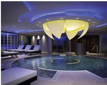
The new spa boasts three specialist pools including a hydro-pool

The spa will have three specialist pools, two hot tub spas and an extensive thermal experience suite. The thermal experience will offer a heat and ice journey, which will include use of the serenity pool and an indoor to outdoor infinity edge pool which leads you to one of two outdoor hot tubs, and an outdoor sauna.