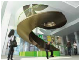
The expansion has been designed by Wilkinson Eyre

Wellcome Collection – a free attraction – was originally designed to accommodate 100,000 yearly visits but over the past year