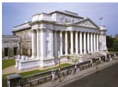
The Fitzwilliam Museum was targeted by thieves

The project is being led by Staffordshire County Council on behalf of the Staffordshire Museums Strategic Consortium and will commemorate Staffordshire's involvement in the Great War, improve the historical research base, and explore how the Staffordshire Great War Trail can be developed. Read more: http://lei.sr?a=F56n