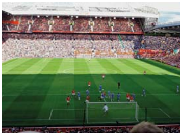
Nearly a million overseas visitors attended a game of football in 2011

The global appeal of the English Premier League (EPL) was further strengthened when VisitBritain joined forces with the EPL back in 2008 to help promote the home of football in key overseas tourism markets. There is also clear evidence that it is not only London which benefits from football tourism. Nearly 20 per cent of football visitors