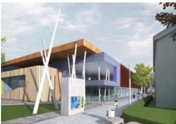
The old centre will be sold to fund a new £31m leisure centre (above)

Redcar Leisure Centre sits on a 4.72-acre seafront plot and is set to close when a new £31m Redcar Leisure & Community Heart opens in the town centre in 2014. Willmott Dixon has been appointed to build the new complex, which has been designed by leisure specialists S&P Architects in collaboration with Plus Three Architecture.