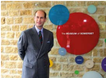
The Earl of Wessex opened the newly refurbished regional museum

Birmingham-based fit-out contractor The Hub was appointed to work on the scheme by SCC last summer, which has also