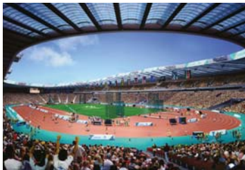
The 2014 Games will be the largest sporting event in Scottish history

"The Legacy 2014 Active Places Fund will