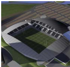
The proposed 13,300-capacity Tigers stadium