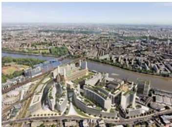
Viñoly's plans include two hotels and a range of leisure facilities

A new six-acre public park would form the setting for the new buildings.