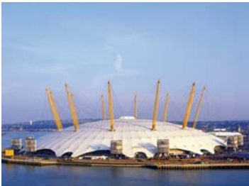
Measured by ticket sales, the O2 is the world's most popular music venue

AEG also owns concert venues in Berlin, New York, Shanghai and Sydney as well as the Los Angeles Galaxy soccer team (home to David Beckham) and the Los Angeles Kings ice hockey team. Corporate advisor, Blackstone, is working on the sale, which is speculated to be worth $7bn (£4.25bn, 5.4bn euros).