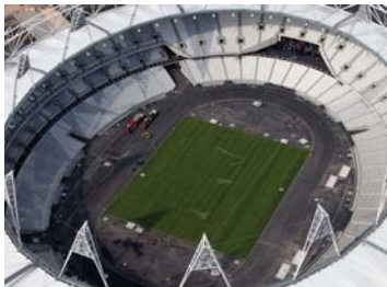
Despite fears that the budget would overrun, the Games 'saved' £400m

The anticipated final cost (AFC) of the ODA's construction and transport programme is £6.714bn - a decrease of £47m on the previous