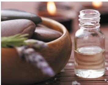
The wellness facilities at the Beach Club have now fully reopened

A full-scale demolition was carried out on the remaining hotel building after it was too badly damaged to save. With the demolition almost complete, owners are planning a new hotel for the sea-front site. It will keep with the original design but will maximise the number of sea view