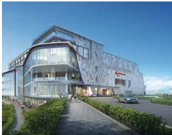
The Leisure complex is Genting's first Resorts World in the UK