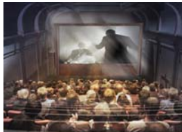
The cinema is due to reopen to the public in 2014

Additional funding from Quintin Hogg Trust and the Garfield Weston Foundation have brought the Tim Ronalds Architects-