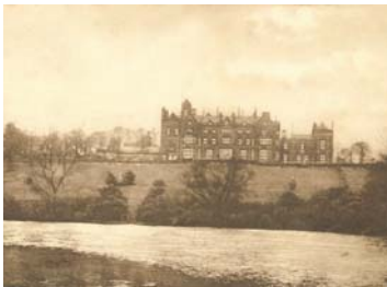
The historic New Hall as it once was - plans now include a luxury hotel

Allies & Morrison were selected unanimously by RIBA after fighting off competition