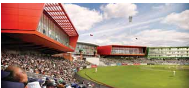
The stadium is seeking to recapture international cricket matches