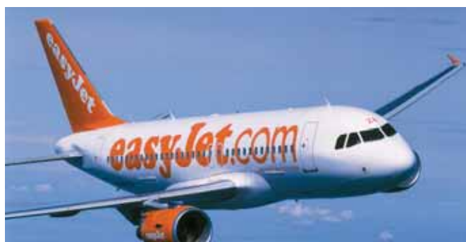
The airline can still use the 'easy' brand for its ancillary activities