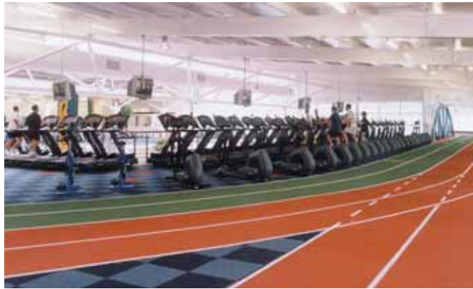
Total Fitness currently operates 24 clubs across the UK and Ireland

Situated in out-of-town locations, a typical Total Fitness club occupies up to 80,000sq ft (7,432sq m) with facilities such