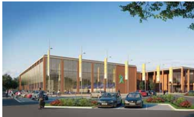
S&P Architects has designed the new £26m Luton Aquatic Centre

The new Aquatics Centre will boast a 50m, eight-lane swimming pool with diving facility and spectator seating for 400 people, as well as a 20m, five-lane community pool with moveable floor. A 100-station fitness suite and a large sports hall will also feature as part of the S&P Architects-designed complex,