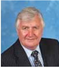
ALUN FFRED JONES is Welsh Assembly Government minister for tourism

A new strategy will boost Wales' growing reputation