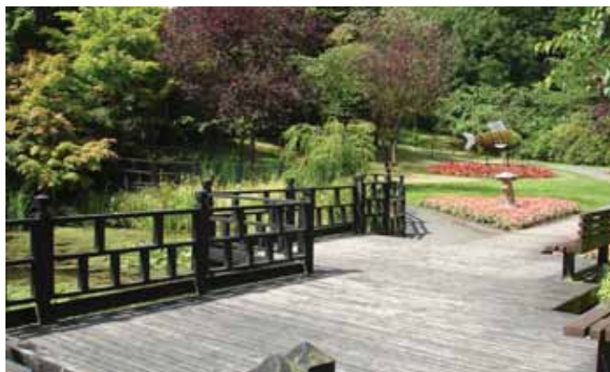
Telford Town Park has secured a share of the £10m HLF package

Woodland and flower beds at the Lordship Recreation Ground in Tottenham will be properly maintained, while the Shell Theatre and River Moselle are