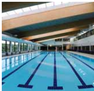
The pool at the Blaydon facility

Facilities that comprise the leisure part of the development