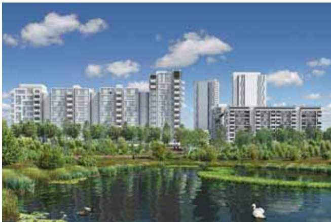
The Olympic Park will be named after Queen Elizabeth from 2013

The Olympic Park Legacy Company (OPLC) has already commenced work on a new events programme, which is