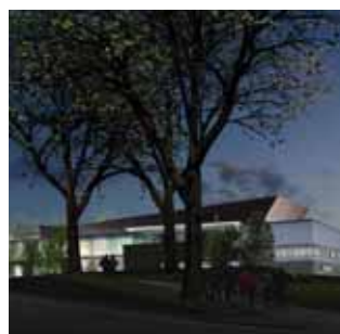
The venue will open next year

The council carried out a "comprehensive evaluation process" to select an operator to manage the Austin-Smith:Lord-designed venue, which is being delivered by Willmott Dixon Construction.