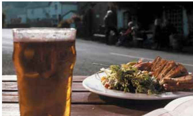
The joint submission has demanded a review of alcohol taxation

The British Institute of Innkeeping; the Federation of Licensed Victuallers; Business In