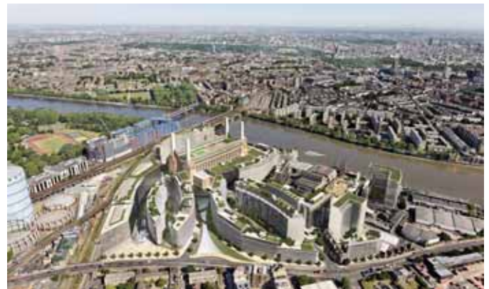
REO is planning a major regeneration of Battersea Power Station

However, that extension, which comprises the £225m Battersea Power Station facility and the £37.55m site assembly facility, had been dependent on the latest agreement.