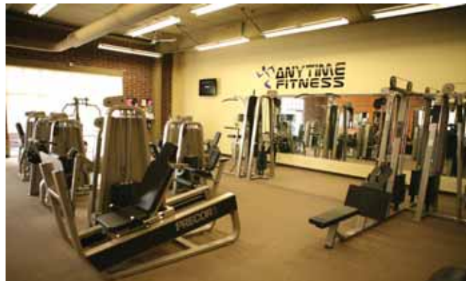
US-based Anytime Fitness is to embark on a major UK expansion

Anytime Fitness' UK clubs will be around 4,000sq ft