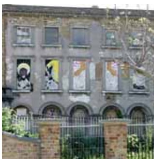
The Grade II-listed Raleigh Hall is to house the new BCA facility

A £910,000 funding package, to be spread over five years, has been provided by Lambeth Council towards the conversion