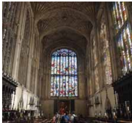
The initiative will target the UK's heritage

A joint promotion by VisitBritain and British Airways (BA) is to market the UK to inbound visitors as having "more world-class heritage and history sites than anywhere else on earth".