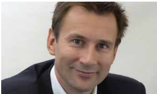
Hunt said the changes will offer 'value for money for the public'

The advisory committees for National Historic Ships and