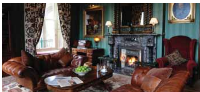
The luxury hotel was bought out of administration by two hoteliers