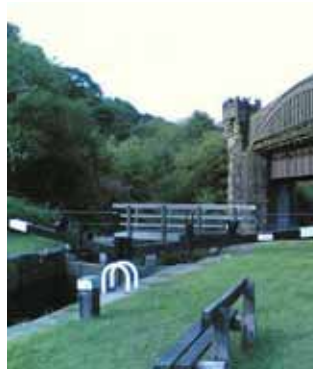
The Canal Connections scheme has been awarded funding

"These projects will improve local woodlands and green spaces, helping to restore