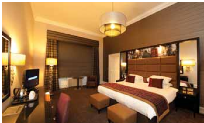
One of the bedrooms at Glasgow's revamped Grand Central Hotel

Work has included raising the grand ballroom's ceiling by 3m (10ft) in order to uncover windows that had been blocked for decades, as well as an