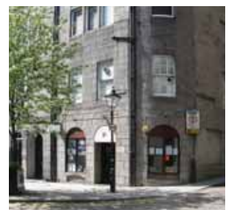
Aberdeen's historic Green area

Work featured the planting of trees and shrubs and the installation of new seating.