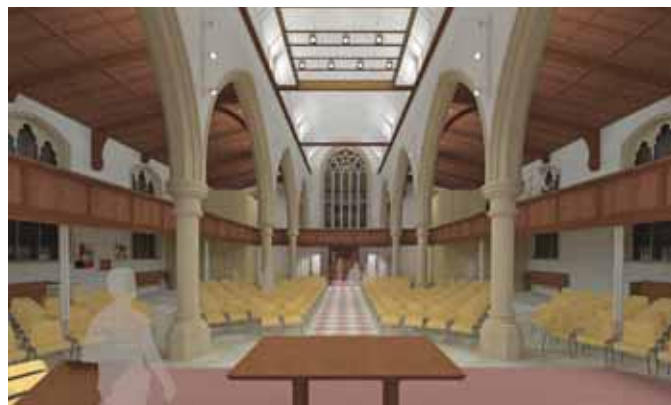
St Mary's Church will be transformed into a 'shared sacred space'

The £1.7m scheme has received £1.2m Growth Area