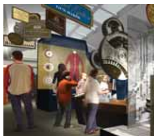
Redman Design has helped to draw up plans for the museum

A fifth gallery will also be incorporated into the 1,040sq m (11,194sq ft) wing, which