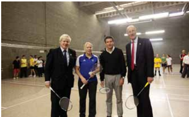
The mayor (left) with Gail Emms, Sebastian Coe and John Armitt

An additional 12 – primarily football training facilities sited outside London – are due to commit by the end of the year, with LOCOG managing the