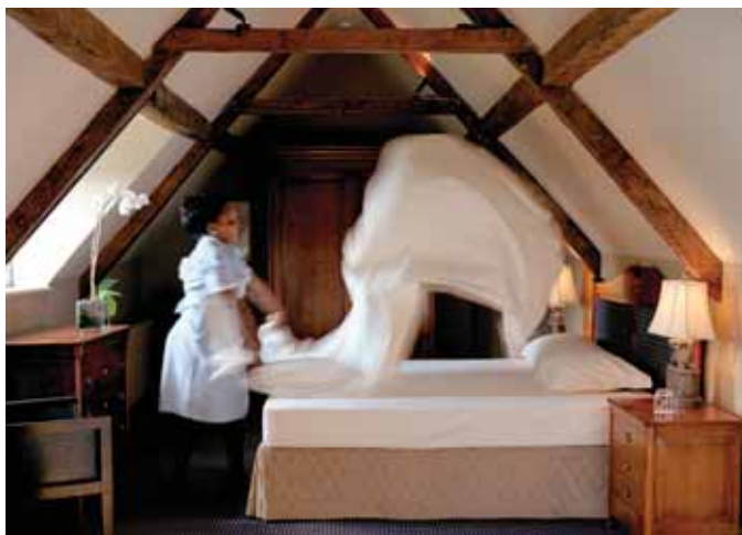
The academy will provide the foundations for a career in hospitality