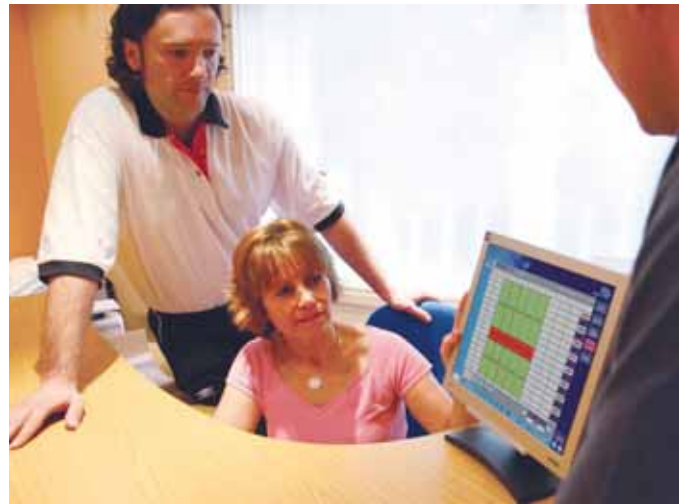
The report shows companies are no longer cutting down on staff