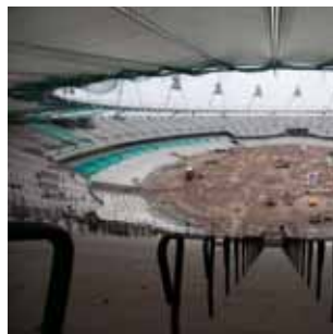
UKA has backed WHUFC's bid

The national governing body has announced the Premier League club as the sport's preferred bidder for the venue, which it said provides "the strongest opportunity for a vibrant sporting legacy".