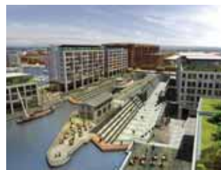
The docks are to be revamped

Liverpool Waters will provide more than 14 million sq ft (1.3 million sq m) of mixed-use floor space and will complement a similar project on the other side of the River Mersey.