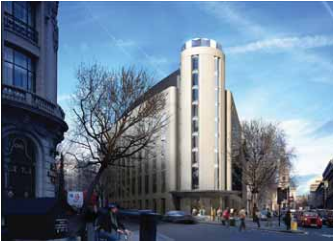
The ME London will include two destination restaurants and bars