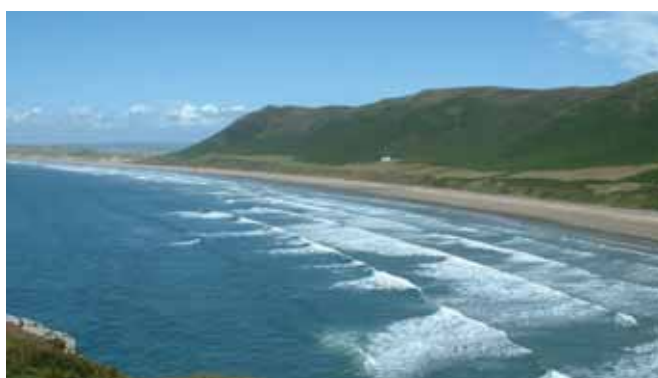
Rhossili Beach has been incorporated in the new section of path

A cave in which the Red Lady of Paviland – a skeleton dating back to the late Stone Age – was discovered will also be passed on the route.