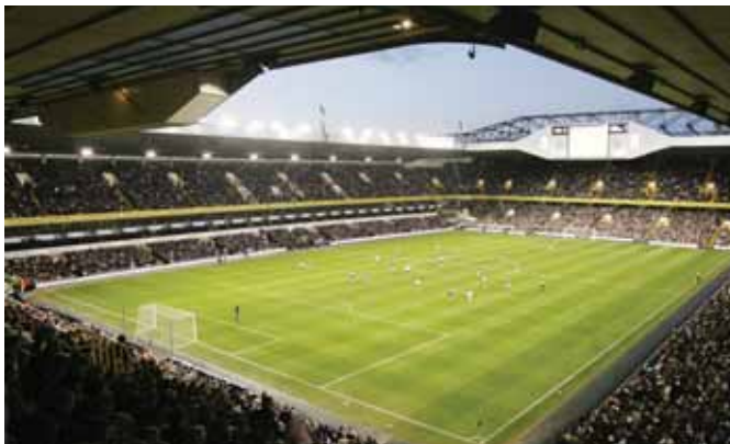
Premier League football is one of the main appeals to Gulf visitors

Gulf tourism makes an important contribution to the UK economy, with the average spend per person while they