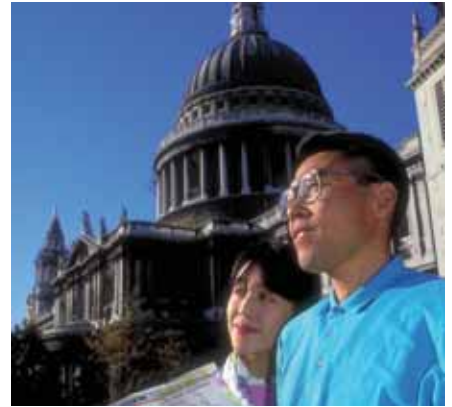
Britain retains its overall appeal to tourists

The UK also failed to inspire as a destination for sports tourism, finishing 8th on the list for 'excelling in sports', despite the perceived interest in tourists travelling to see Premier League football and major events such as the Ryder Cup.