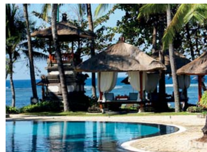
Laguna Resort and Spa will host the 2011 event

Deals already secured for 2011 include the Rosewood San Miguel de Allende resort spa in Mexico, where the company will provide treatments alongside PRIORI.