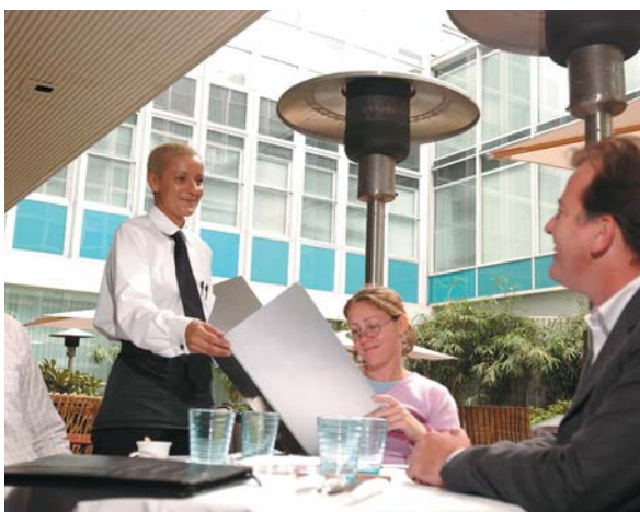
The report claims that the percentage of women in the sector is declining

Furthermore, on average, 25 per cent of the male workforce is employed in management or senior positions, compared to just 18 per cent of females. The report has suggested that there are five key barriers preventing