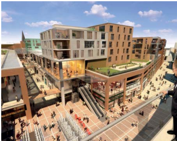
A cinema, cafés and bars are proposed as part of the Tithebarn plans