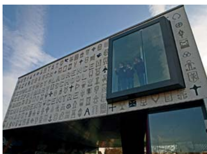
Lego modellers were involved with the work

Work is set to include improvements to the High Street and the Tan y Fynwent areas and is designed to help encourage more people to visit the city.