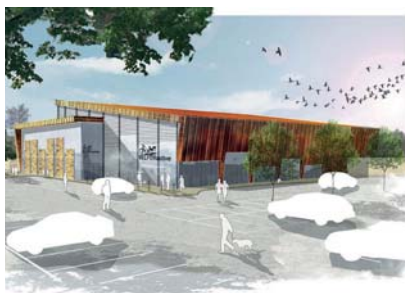
How the new Belper leisure centre could look

EDC is now in the process of recruiting five external directors to sit on the board of East Dumbartonshire Leisure and Culture Trust. Five councillors representing each political party have already been appointed to the board.