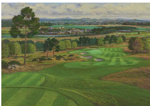
An artist's impression of the proposed 11th hole at The Angus

Forbes said: "We have worked tirelessly with officials to ensure that we met all of the vital