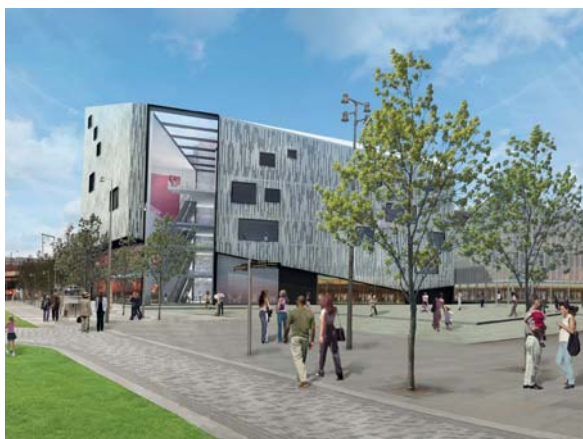
A design competition is to be held to find an architect for the scheme

The new venue will enable both the Cornerhouse and Library Theatre Company to work in collaboration and will help create a cross-artform production centre.