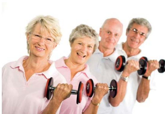
The £1m scheme aims to get older people more physically active

Minister for pensions, Steve Webb said: “We hope Active at 60 will make a real difference to the quality of life of those approaching retirement or who have just retired, by improving their wellbeing and preventing the risk of social isolation as they grow older.”