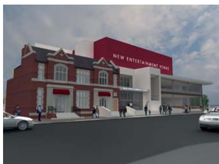
The new Baths Hall venue will be managed by SMG