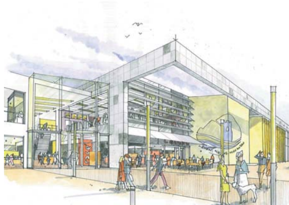
Facilities will include two swimming pools and a multi-use sports hall

A community hub – separated from the leisure part by a glass walkway atrium – will feature a library; an ICT training room; a youth facility; meeting rooms; and a crèche. The scheme is to be funded using capital