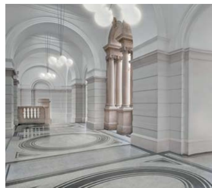
Artist's impression of the proposed Members Lounge

Caruso St John Architects' plans include the reconstruction of nine galleries in the southern part of the building and the revamp of its main entrance on Millbank. The River Room – formerly a watercolour gallery divided into three offices – will return to public use as a single room, while new learning spaces and