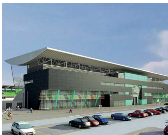
The stadium will have an initial capacity of 12,000, increasing to 20,000

Preparatory work is now complete, with the proposed stadium to boast an initial capacity of 12,000 before being increased to 20,000 in