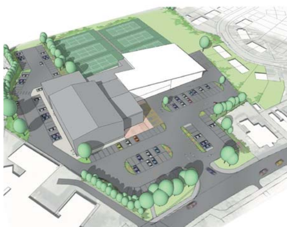
Concept image of the new-look facilities for Haslingden Sports Centre

Plans for the new leisure facilities are to be considered by councillors on 13 December, with work scheduled to commence 'within weeks' if approved.