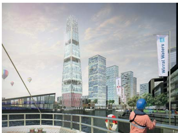
The development will lead to the transformation of the former docks

Glenn Howells Architects; BroadwayMalyan; Skidmore, Owings and Merrill; Allford Hall