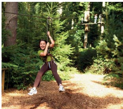
The PAA will cut red tape on health and safety