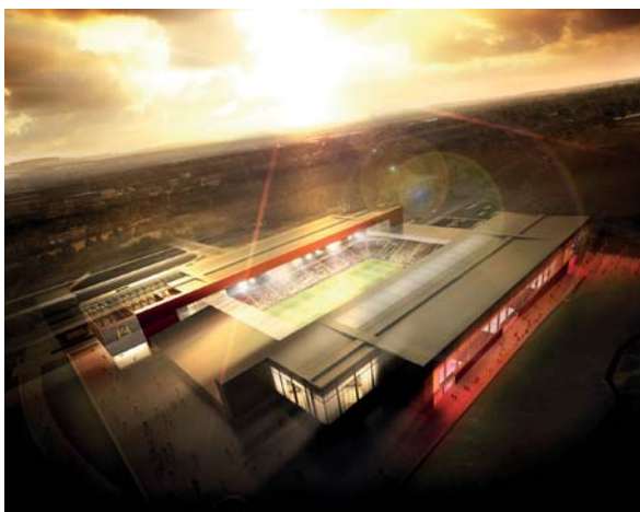
The proposed Bristol City venue has been designed by Populous

BCFC's plans for a 30,000-seat venue have been hit by efforts to have the proposed Ashton Vale site designated as a town green, while NFFC is eyeing up a move to Gamston.