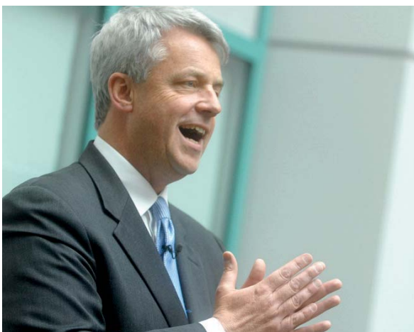
The government plans to overhaul the delivery of health and wellness

In his White Paper, Lansley said the approach would incorporate projects such as the new £135m Olympic legacy participation programme and the protection of green spaces. Government plans include ensuring communities are designed for 'active ageing', as well