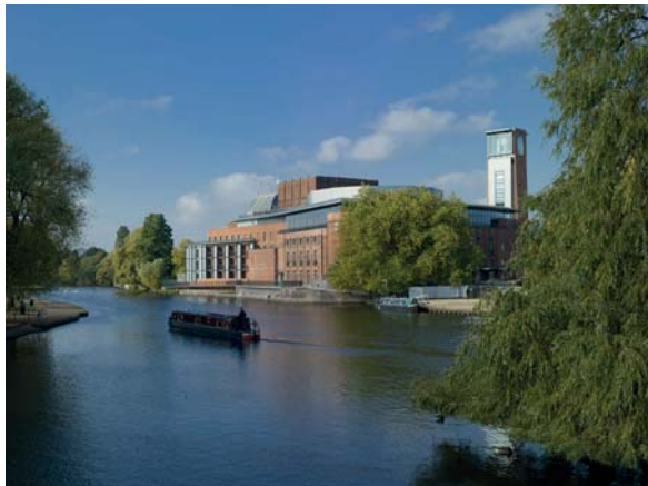
The Royal Shakespeare Theatre as seen from Stratford's Clopton Bridge

To coincide with the relaunch of the RSC's base theatre, the company has also announced details of its 50th anniversary seasons to be held from April 2011. The scheme was designed