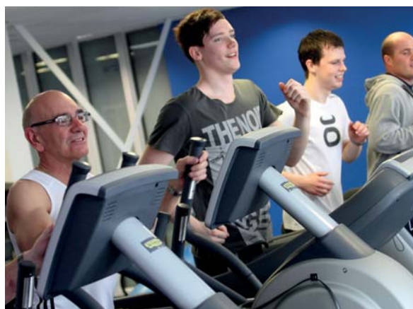
KAL is looking to become the region's first budget gym operator