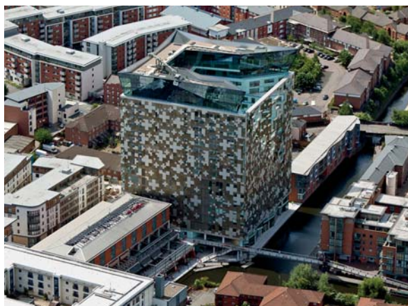
Denizen Contracts will start work on the phased fit-out in January

A wet area comprising a hydrotherapy pool, five thermal treatment rooms; a gym; and a ten-room spa will be among the facilities at The Club and Spa.