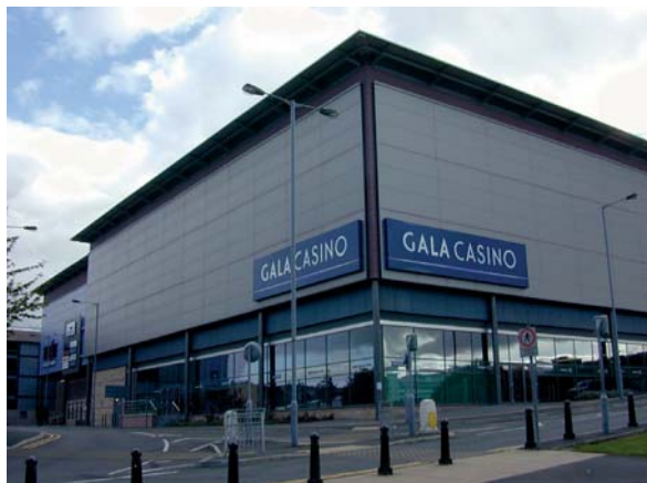
The new Gym4all site will open at the Leisure Exchange development