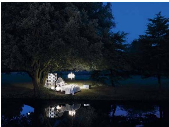
The hotel and Kallima spa have been designed by the Ability Group