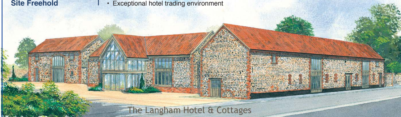
The Langham Hotel & Cottages