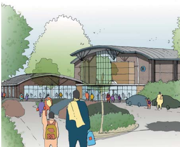
A new spa – including steamroom and sauna – forms part of the plans

There will also be a new building – to be built next door to the existing sports centre – housing a six lane, 25m deck level swimming pool, along with a separate training pool. Other planned improvements to the centre include the