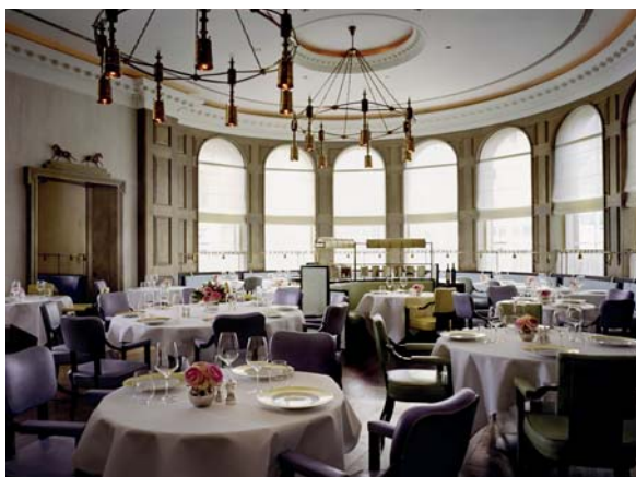
The Roux at The Landau is a venture by the father and son chef pair