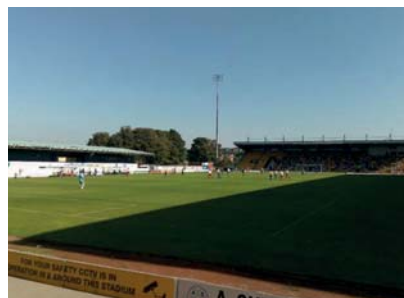
The football club has been forced to relocate

Facilities mooted as part of the FaulknerBrowns Architects-designed complex include an eight-lane, 25m swimming pool with moveable floor a 'Fun water' with jets and sprays, changing facilities and a café could also form part of the scheme, which also involves consultancy Mace, Curtins Consulting, Hoare Lea and Sense.