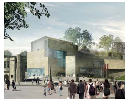
The venue is due to open its doors in early 2013

Three dates – 17, 18 and 19 June 2011 – have been scheduled; the first time the Royal Opera House-based company has performed in a UK arena. Performances will feature a filmed introduction to each act on live-relay screens. The cast will include dancers such as Carlos Acosta, Tamara Rojo and Edward Watson.