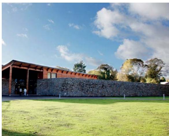
The new attraction explores Robert Burns's life across four themes

Exhibition designer Events Communication (lead designer) and Border Construction are among the firms to have worked on the