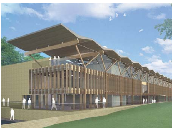
The centre is primarily for students but will also be open to the public