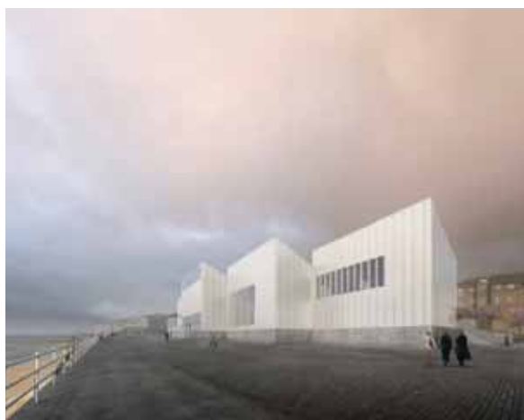
The new Turner Contemporary is scheduled to open on 16 April 2011

KCC cabinet member for community services Mike Hill has overseen the development