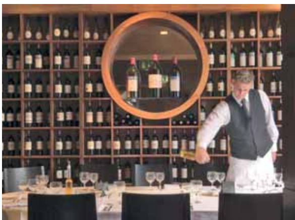
Hotel and retail is one sector that doesn't have such a bright outlook