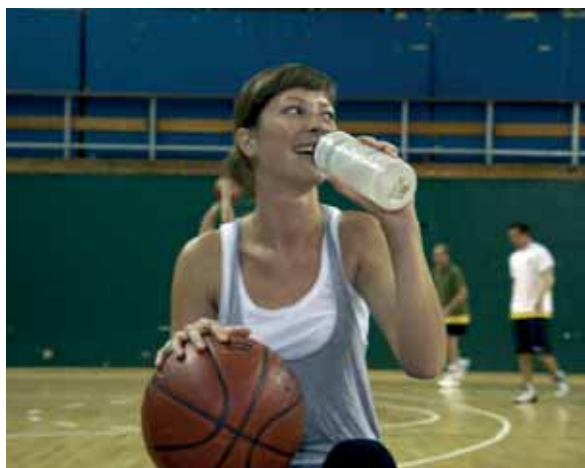
Women's participation in sport could suffer due to lack of female leaders