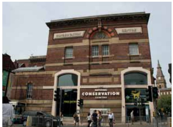
NML will continue behind-the-scenes conservation work at the centre