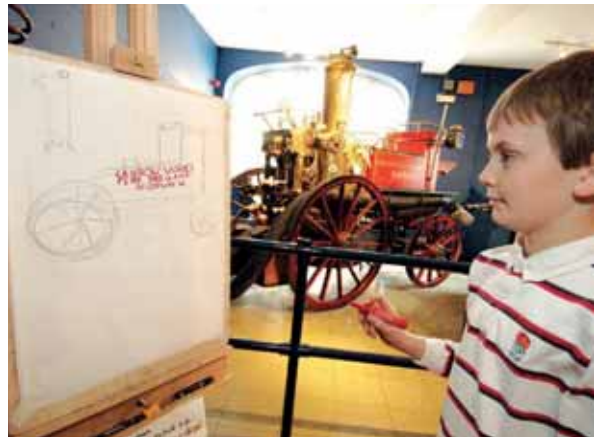
ACE will take on responsibility for the development of regional sites

It is expected that the transition process will see the functions move to ACE by the end of