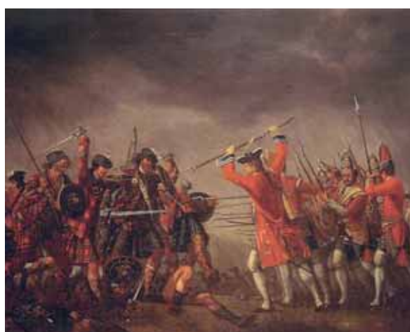
The Battle of Culloden, the location of which is contained on the list

Scottish minister for culture and external affairs Fiona Hyslop said: “The inventory