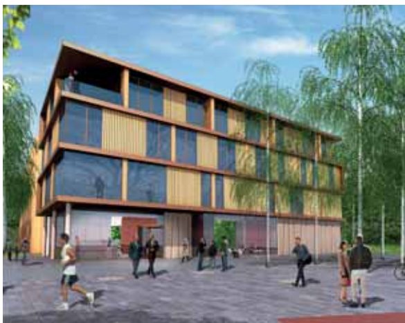
The four star hotel will be operated on social enterprise principals

As an early model of the hotel, the Calman Trust is to open Artysans, Inverness' first fully commercial social enterprise café. Featuring specially designed training kitchens and workshops, the café aims to employ four full-time staff and offer training for up to 42 young people in 2011, growing to 106 places by 2013.