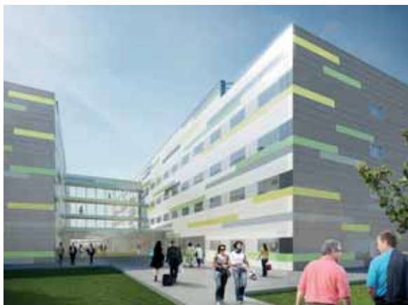
EPR Architects are behind the design of the Bristol Airport property

Facilities at the £20m hotel include a restaurant and bar, three meeting rooms, staff accommodation and administration offices,