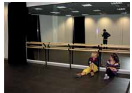
A dance studio has been created at the venue

When complete, the Assembly Rooms will provide spaces that will be made available for year-round events, including during the summer festival season.