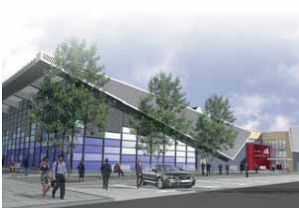
The multi-million pound centre will include thermal and fitness suites