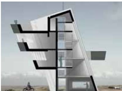
The tower will offer several viewing platforms

Other measures to be implemented include direct public funding for three industrial attractions – the Scottish Maritime, Mining and Fisheries Museums.