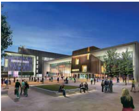
The venue will be the heart of Doncaster’s Civic and Cultural Quarter