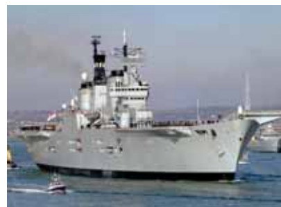
A fresh future for Ark Royal is being explored

The group operates 76 clubs across the UK and an additional 10 in Europe, with more than 450,000 members.