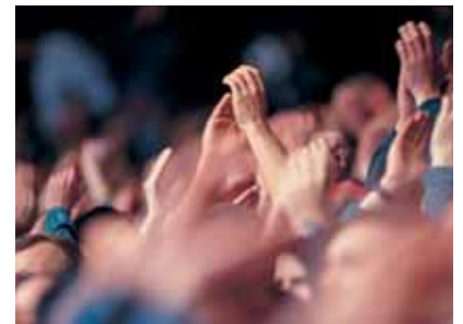
Increased fan involvement is being looked at

A new drainage system is to be installed and the greens and ditches are to be rebuilt, with the first phase due for completion in early summer 2011. The overall scheme is to be completed by summer 2012.