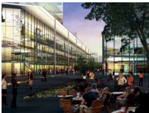
The scheme aims to transform the Shropshire town's night economy

The scheme, which also involves the Southwater Event Group, will also include the