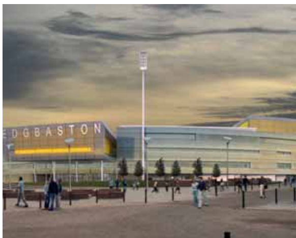
The development will be built adjacent to Edgbaston cricket ground

WCCC's Edgbaston ground is itself in the middle of a £30m redevelopment, with the