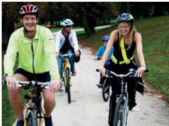
More than 263,000 people have taken up cycling in the past two years

According to the research, weekly participation in athletics - including running - has grown by more than 263,000 in the past two years. Cycling numbers are up by nearly 100,000. Netball has reported more than