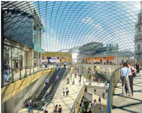
D&D London is to take up residence with two sites at Trinity Leeds