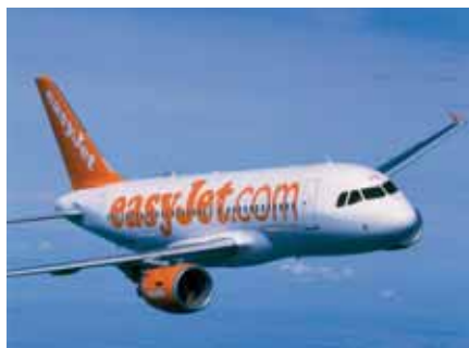
easyJet is to offer European holiday packages