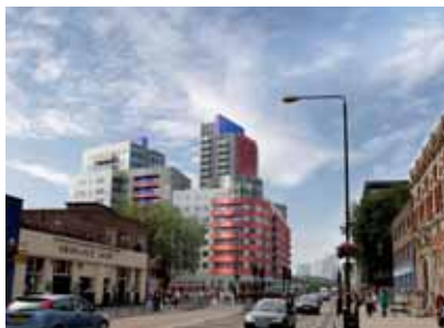
An 'iconic' 21-storey building will be developed