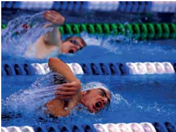
An Olympic-sized swimming facility is being proposed for the city

Private sector developers and operators have been invited to meet with council officers in the coming weeks before DCC looks to submit an OJEU announcement in March.