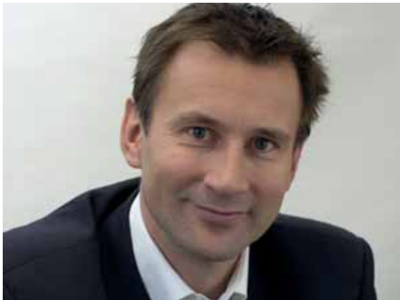
Hunt aims to create a ‘new generation of philanthropists’ for the arts

The ten point plan includes the £80m pot of gold, which the government hopes will lead to more than £160m being invested in arts via match funding; a commitment to develop and