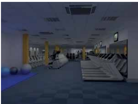
truGym is looking to attract franchisees from a range of backgrounds

"They will benefit from economies of scale and our expertise, from equipment purchasing and marketing to access control and security. We are also looking to partner with existing gym owners, that want to convert their gyms to the truGym model."