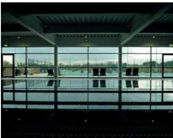
The new Exeter facility boasts indoor and outdoor swimming pools