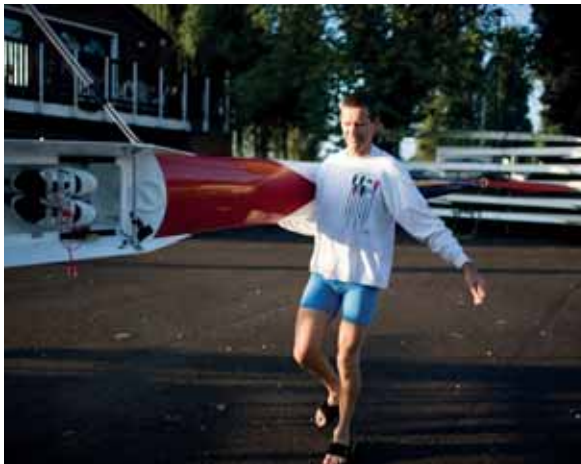
Rowing is one of the six Olympic sports to receive a funding boost

UK Sport chair Baroness Sue Campbell said: "Bringing winter sports in line with their summer counterparts is the final piece of the 'no