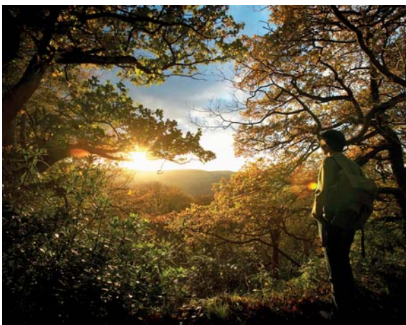
The manifesto aims to safeguard the future of native Welsh woodlands

Among the main plans set out in the manifesto is the adoption of a target to double the cover of native woodland in Wales over the next 50 years. The trust also calls for the creation of a National Forest Park in the South Wales valleys and the protection of ancient woods and trees.