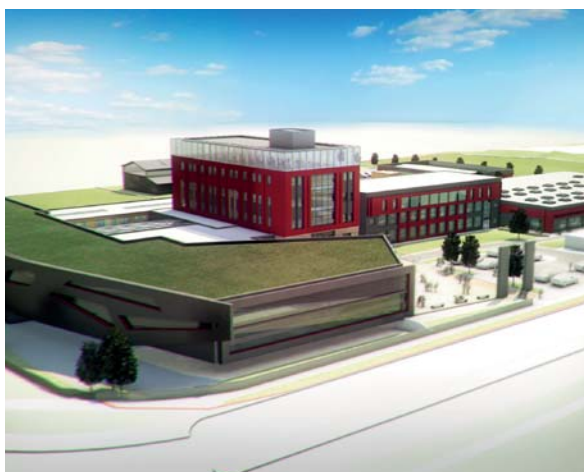
A new sports hall with badminton and basketball courts is earmarked

Improvements to an existing three-storey block will enable the college's visual arts to move from the Chesterfield Road site, while an enclosed courtyard is also proposed.