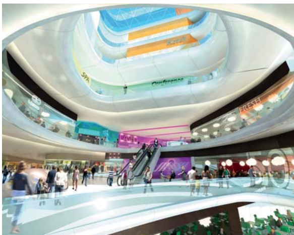
The new complex is set to feature a spa, a conference centre and a casino

The 55,000sq m (592,015sq ft) complex is set to feature a hotel; a spa; a casino; a banqueting and conference centre; a multi-screen cinema; and food and beverage outlets.