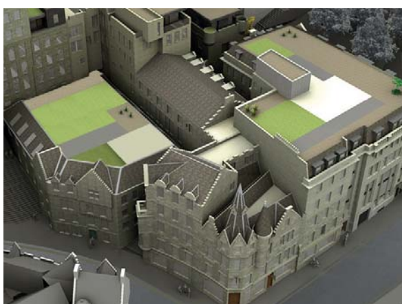
Motel One will open its first UK property as part of the £45m proposals