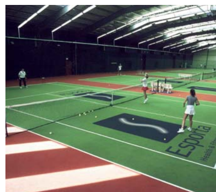
Virgin Active is set to acquire Esporta's UK business