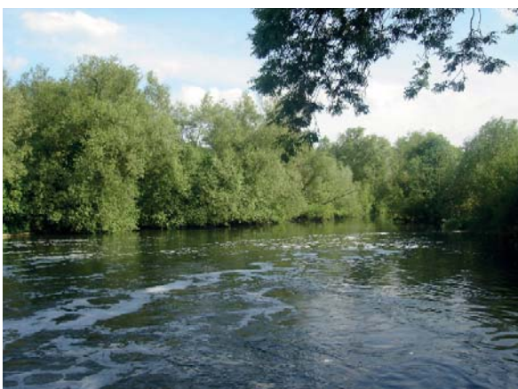
The Defra funding will be used to launch restoration schemes on rivers

Cash will be shared by the Environment Agency, Natural England and organisations such as the Association of Rivers Trust in order to build on existing projects.