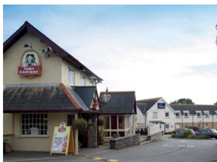
Travelodge already sits alongside pubs at 15 UK sites

According to the hotel group, the proposed co-location offers benefits in terms of providing guests with a food and drink offer, as well as making schemes easier to develop and more affordable compared to individual projects.