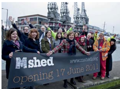
M Shed is to open its doors to the public in June

Two museums – Whitehall Museum and The Horniman – received Gold Awards, while a further eight institutions were given silver and two others a bronze award.