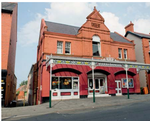
Theatr Colwyn is one of the oldest operating venues of its kind in Wales

The upstairs bar has been relocated to the foyer and a new box office has been created. Disabled access has also been improved.