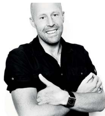
Little will join the OPLC from events agency Cake

A new visitor centre and a facility for park staff have been created, with the latter available for use as a community meeting room or a training venue.