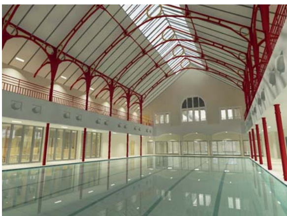
The £17m revamp was initially due for completion in January this year

Fife Sports and Leisure Trust operates Carnegie Leisure Centre, which closed in