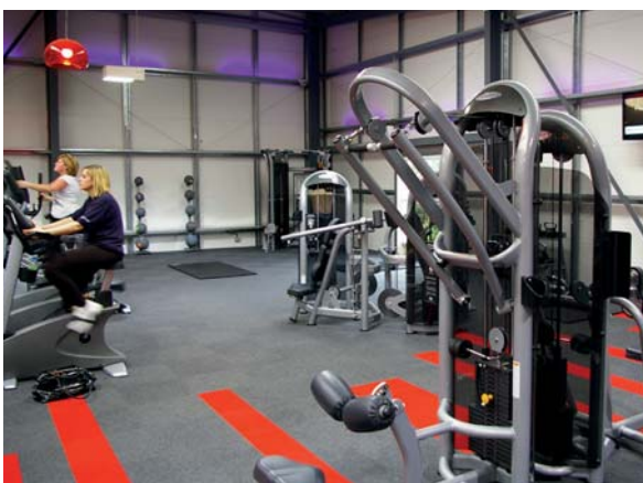
West Sussex is one of the areas to be selected as an ‘early implementer’