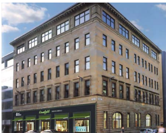
Hotel Indigo Glasgow is the brand's third UK site, with more to follow

A 151-bedroom Hotel Indigo is scheduled to open in Liverpool this summer, with three additional sites to launch in Edinburgh, Birmingham and Newcastle in 2012.