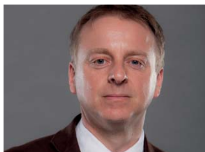
Long is the new director of the V&A at Dundee

Burgh Halls also features a gallery and the Glasshouse Café, while local community groups will also make use of the building. Malcolm Fraser Architects were behind the design of the redevelopment.