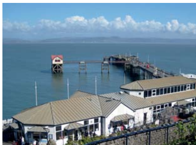
Mumbles Pier is set to undergo restoration work