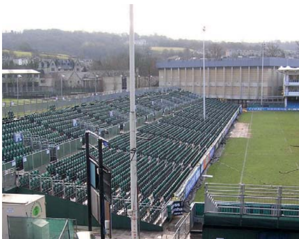
Bath Rugby hopes the latest plans will enable it to redevelop its ground

Bath Rugby said its consultation was 'in principle', although it hopes that it will end a long-running bid to build new facilities.