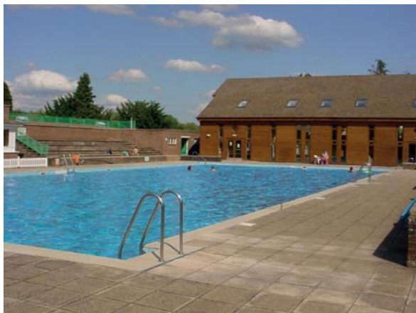
The reopening of the pool is the first phase of Fusion's investment plans

Work is due to begin on stage two of Fusion's investment plans this autumn, with facilities to be completed by spring 2012.