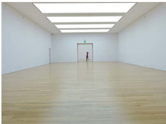
The new National Museum of Art is located at National Museum Cardiff

Work at the attraction will provide nearly 800sq m (8,611sq ft) of space in which to exhibit Welsh art, with the opening exhibition earmarked to feature artists such as Josef Herman and Shani Rhys James.