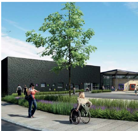
Holt Park Active Living Centre is among the four approved schemes

In Sandwell, the £15m Portway Lifestyle Centre will be built on the site of Oldbury Leisure Centre and is to be a centre of excellence for disabled and able-bodied people.