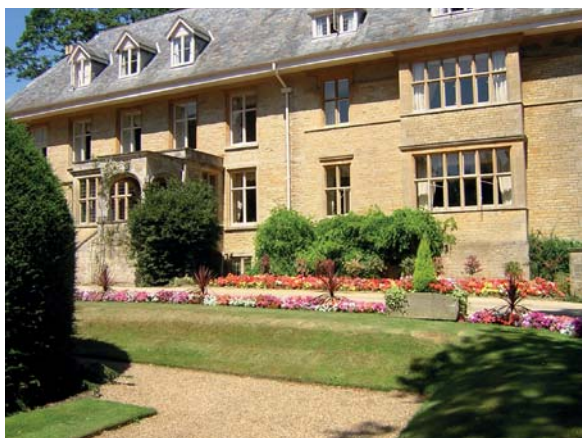
The von Essen Hotels group operates a number of luxury UK properties