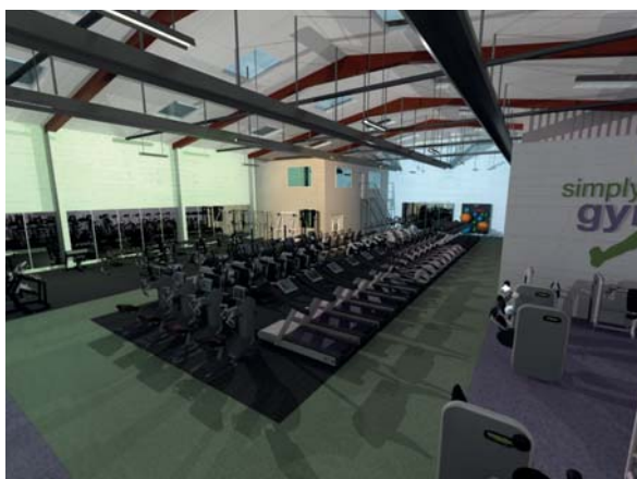
The Bay Life-operated Simply Gym will launch in Llansamlet this June

Simply Gym will be operated by the Swansea-based independent, not-for-profit