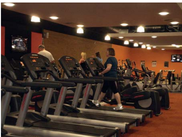
Life Fitness has supplied 100 pieces of equipment as part of the project

Meanwhile, a youth gym has also been created for 11-16 year olds, boasting dance mats and a target board, along with three new treatment rooms offering physiotherapy.