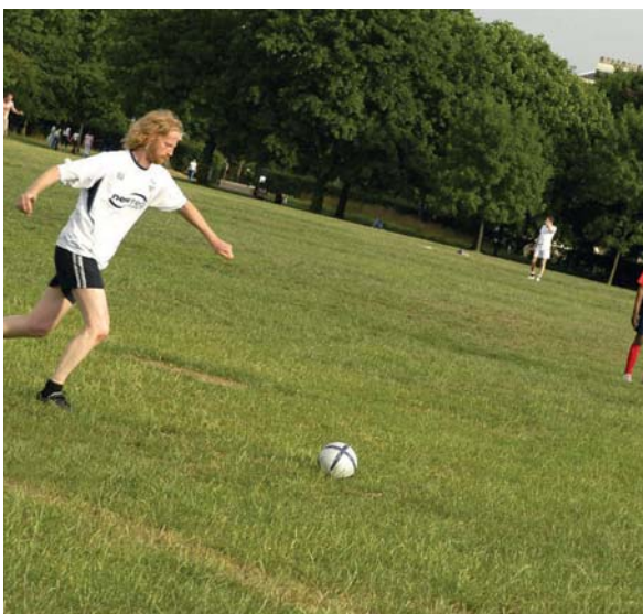
Playing fields that net funding will be protected for at least 25 years

Projects including the reinstatement of disused playing fields; improvements to the condition of pitches; and the purchase of new playing field land are among those set to benefit.