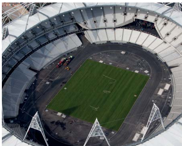
Tottenham Hotspur has widened its challenge over the stadium's future

THFC has now confirmed that it has sought permission from the High Court to bring a claim against other agencies involved, including the Olympic Park Legacy Company (OPLC). The Premier League club is calling for a judicial review of the decisions taken as part of the stadium process.