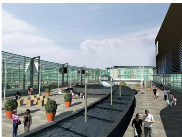
Hotels, a cinema and a gym are among the Benmore Group's proposals