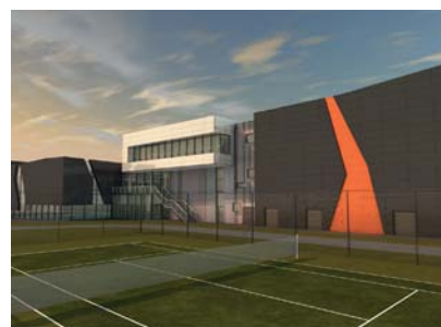
The complex will include a 25m swimming pool

Every scheme that receives support as part of the Protecting Playing Fields programme will also include protection for those sites from development for at least 25 years.