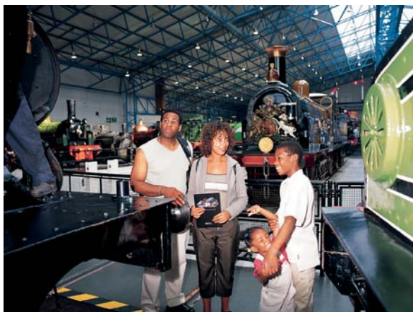
NRM+ would have led to an extensive transformation of the attraction

Under plans for the NRM+ project, the attraction's largest exhibition space was to be subject to an extensive transformation with new multimedia and multi-sensory displays.