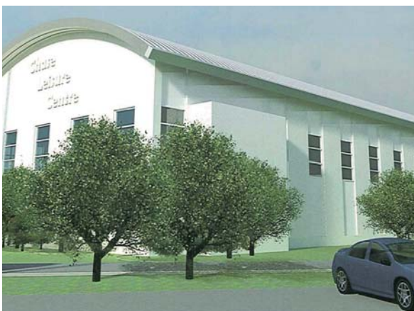
A 150-station fitness suite will be included as part of the new-look venue

Saunders Architects LLP carried out the initial designs, with Horsley Huber Architects now working alongside GF Tomlinson.