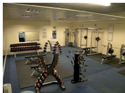
Fitness equipment has been supplied by Precor

Council architects worked on the design of the scheme, with Allan Joyce Architects appointed as project architects. GF Tomlinson is the main contractor.