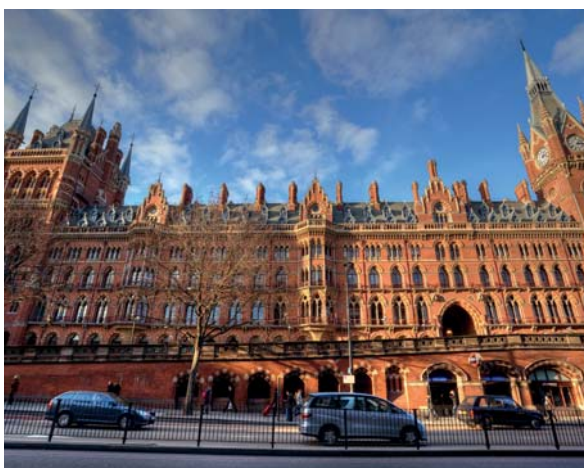
The historic Victorian property underwent an extensive £150m revamp

Facilities include a 6,226sq ft (578sq m) spa, which includes five treatment rooms and a couple's suite; a spa pool; and a relaxation area. Cinq Mondes will devise the treatment menu at the hotel, which opened 138 years to the day after the Midland Grand first opened on the site.