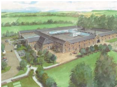
The development is to be completed by mid-2013