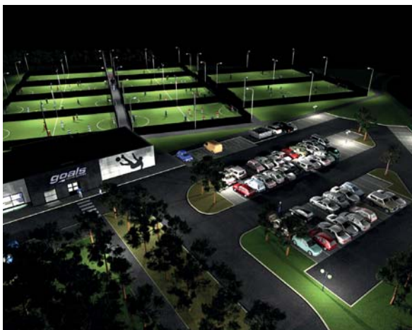
A Goals Soccer Centre is at the centre of the plans for the industrial site