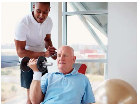
The employer-led report aims to encourage the sector's ongoing growth

SPELG will also support the inception of the new Chartered Institute for the Management of Sport and Physical Activity as the sector's one professional institute.