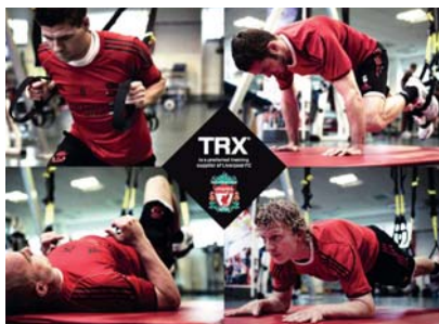
Liverpool FC is to use TRX's Suspension Trainer