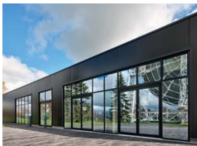
The Space Pavilion forms part of the new facility

TDC is working with the Dreamland Trust to create a new tourist attraction on the site, which will include a theme park containing a number of historic rides.