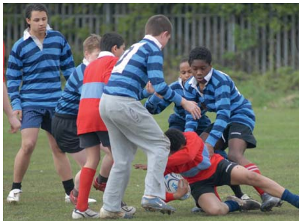
Participation in rugby union has declined over the past couple of years