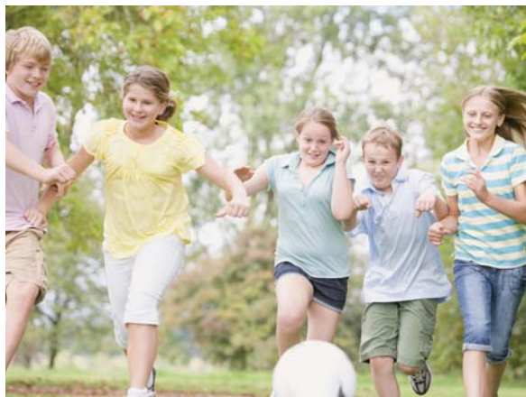
Only a third of children surveyed took part in sport in their leisure time