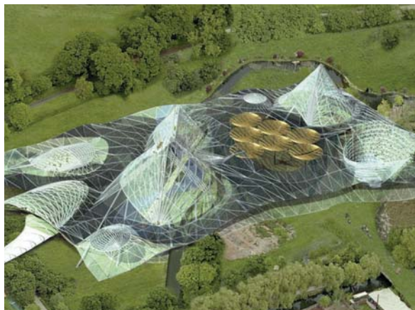
Chester Zoo has been forced to shelve its Heart of Africa development

Connected by a boat ride, the £30m Islands project will pull together some of the existing