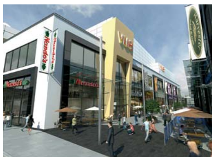
A number of leisure operators have already signed up

The scheme is due for completion in May 2013, while work on the hotel element is set to start in June and will open in June next year.