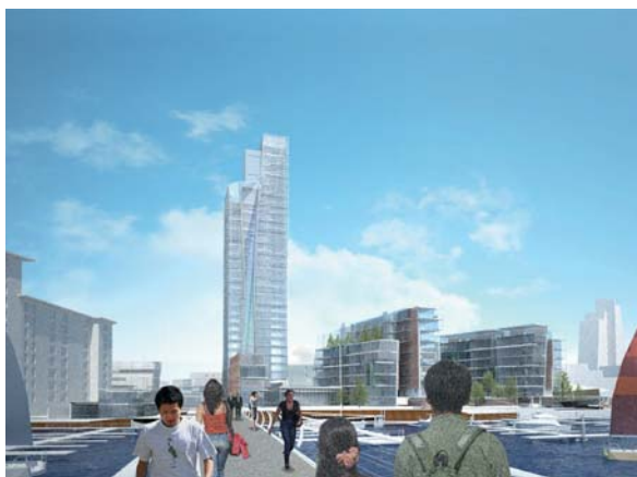
The new 32-storey Wyndham Hotel will be the tallest building in Wales

Talks are also ongoing with a series of finance partners with a view to finalising the funding for the project, which is to be managed by Day and Johnson. As part of the hotel, a signature bar and restaurant are to be located on