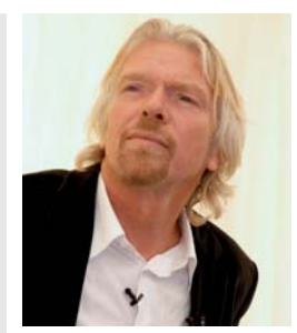
Richard Branson spoke at the Soneva Fushi resort

house is Elemental Herbology. A pool, relaxation area, sauna, hammam and fitness studio complete the offer. The five-star Badamdar Complex also features a 5,000sq m (53,820sq fi) entertainment and retail centre, a seasonal aqua park and 37 apartments.