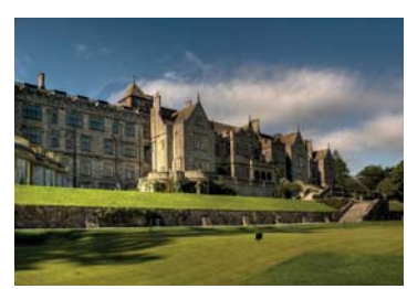
Bovey Castle will house the ayurvedic-inspired Sundāri day spa

pies lasting more than 90 minutes in duration to start with personally-tailored yoga stretches. Bovey Castle's Sundair 3pa currently includes five treatment rooms; a relaxation room; and a salon, as well as a sauna, a steamroom, a whirlpool and a fitness suite equipped by Precor.