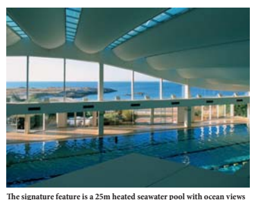
the signature feature is a 25m heated seawater pool with ocean views

There is also a brand new beauty centre, a hair salon (with Leonor Greyl products) and six single and one double treatment room.