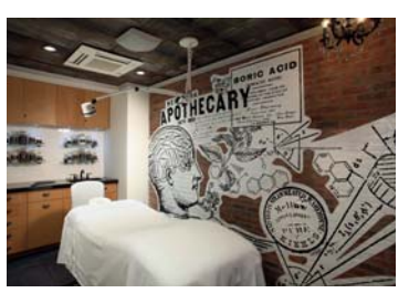
The first Kiehl-branded spa will house three themed treatment rooms

Meanwhile, signature facials will start with a personalised skin diagnosis to determine the course of treatment for each guest.