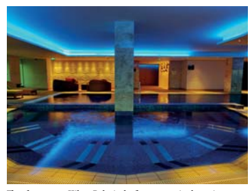
The eforea spa at Hilton Baku is the first to open in the region

Meanwhile, the presidential spa suite will include a private steamroom and sauna, as well as two treatment beds, a day bed. All areas of the spa are designed to "maximise" the views overlooking Baku. Products on offer as part of the treatment menu and in the retail area