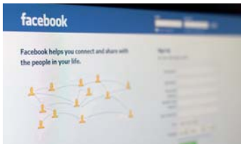
The app allows spas to offer printable vouchers from their Facebook page

According to GramercyOne, holiday gift certificates account for more than 33 per cent of total sales across businesses that use the Booker platform during the holiday season, with sales totalling US$8.3m (6.2m euro, £5.3m) in 2010.