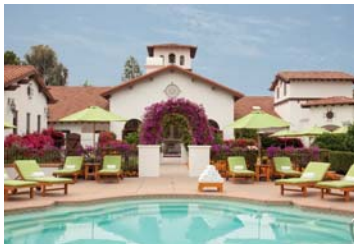
The resort's 28,000sq ft spa boasts a total of 42 treatment rooms

The Reflexology Path features smooth cobblestones or beach stones embedded in concrete and laid in specific patterns to stimulate the feet. Walking along the path aims to provide a deep-working therapy and simulate pressure points in the feet.