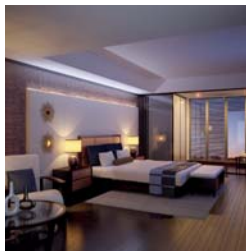
More hotels changed hands in 2011 than in 2010

As part of the reopening, a range of new treatments have been introduced at Le Spa, including the two-hour "ultimate chocolate treat".