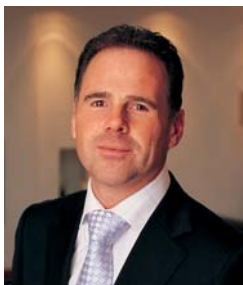
Payne will head a new management arm at Topaz

Meanwhile, the 777-bedroom adults-only Aventura Spa Palace, which will also be rebranded, currently incorporates a spa with a total of 75 treatment rooms and offering the signature Temazcal treatment.