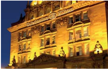
Hilton Worldwide is expanding its Waldorf Astoria portfolio in Europe