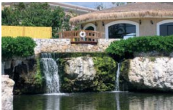
Facilities at Aventura Spa Palace include a spa with 75 treatment rooms

Elsewhere, Hard Rock Riviera Maya will combine two Palace Resorts properties - Aventura Cove Palace and Aventura Spa Palace - and is due to open in the second half of 2012.