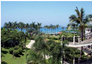
Marriott's Chinese pipeline has now reached 100 hotel properties

There are currently 11 properties operated under the signature Marriott Hotels and Resorts brand in China, with a further 17 more to open over the coming years. Luxury brand JW Marriott's presence stands at six hotels, with