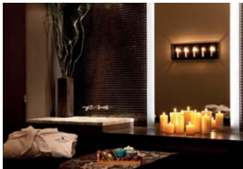
The eforea: spa at Hilton-branded products went on sale on 25 November