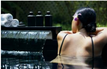
The opening of the spa will form part of a US$28m redevelopment

The full-service spa will offer services from anti-aging facials and massages to wraps and body treatments. The spa will also feature teen and junior treatments for younger guests ages 8-17 including TOEtally About Me pedicures