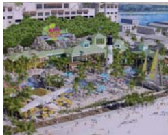
The 350-bedroom resort is due to open in 2014

Other facilities at the resort include an adult-only pool with café and bar; three infinity-edged whirlpools; and the Chopra Center for Wellbeing, which is located on the grounds of the resort.