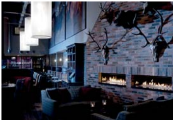
MWB operates the Malmaison and Hotel du Vin boutique brands

The period also saw the completion of five hotel sales and leasebacks totalling £102.9m, with proceeds used to reduce Malmaison's