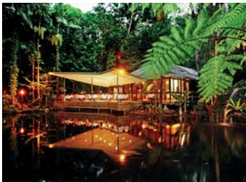
The eco-friendly resort has won a number of sustainability awards

The spa, which offers a range of Aboriginal-inspired treatments, aims to "harnesses potent natural forces to create a healing environment that is unique". The Julaymba Restaurant and Aboriginal Art Gallery is also among the