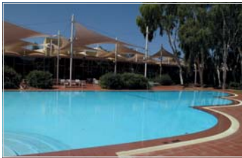
Accor has been brought in to provide a number of services at the resort

It is hoped Accor will open up new markets for the resort and increase domestic leisure and conference demand, while also creating new job opportunities for Indigenous Australians. A number of initiatives will be undertaken as part of the "new vision", which include a new 'under-the-stars' dining experience and the refurbishment of each of the resort's hotels.