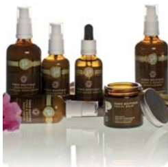
Pinks Boutique offers a range of organic products

However, the group said that global RevPAR growth stood at 7 per cent for the third quarter if Egypt, Japan and Bahrain were excluded. Elsewhere, IHG reported an increase in revenue for the three-month period and a reduction in its net debt, while operating profits were also up on the same quarter in 2010.