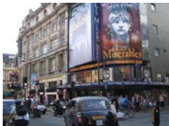
Most theatregoers believe the Olympics will help