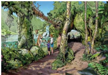
A Sumatran landscape will be among those recreated at Chester Zoo