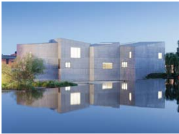
David Chipperfield Architects designed the £35m Hepworth Wakefield

Hepworth Wakefield (David Chipperfield Architects) was handed a special award after being confirmed as panel members' favourite scheme from this year's 27 winners. Bath's