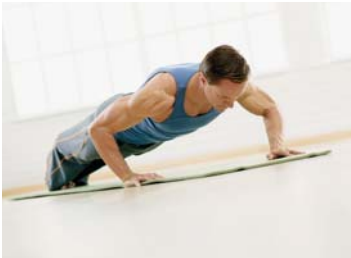
Virtual classes involves participants who follow an on-screen instructor