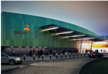
SportHouse will comprise one of the UK's largest multi-use sports halls

SportHouse will be used by handball, Paralympic judo and wheelchair rugby athletes during the Games. Its facilities also including a fitness area equipped by Cybex.