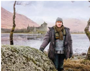
Harry Potter star Rupert Grint visited Loch Awe for the new campaign

The campaign is being backed by a range of leading tourism firms, including Marriott, De Vere and Millennium and Cophorne.