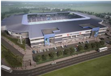
Arturus Architects are behind the design of Bristol Rovers' new ground

The 21,700-seat stadium will comprise a bowl design and will meet all FIFA and International Rugby Union standards, with proposed facilities including a gym and a jogging track.