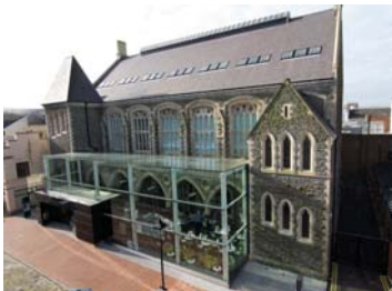
Neath's Grade II-listed arts venue has been restored to its former glory