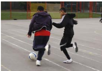
The lure of other pursuits is among the reasons for high drop-out rates

Under the new FA/Vauxhall Motors scheme, youngsters will be offered recreational football