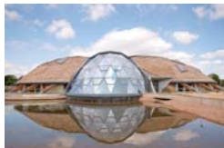
The landmark Pods leisure centre in Scunthorpe