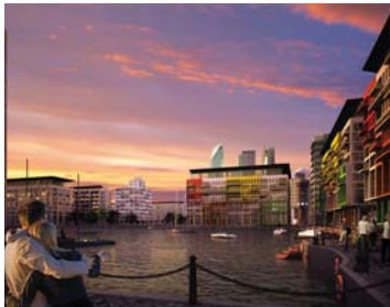
Liverpool Waters will transform an area of the city's former docklands

Liverpool Waters will complement Wirral Waters on the other side of the River Mersey but fears have been raised it might affect the heritage value of the former docklands.