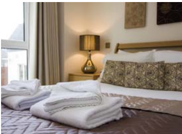
hotels.com: Higher global room rates point towards economic recovery

Ibrahim said: "A BHA study of 33 hotels representing 10,000 London rooms shows they