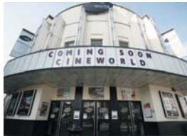
Most Cineworld venues have already been converted