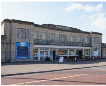
The complex will be demolished but NSC is hopeful for the site's future

A number of developers have sought to redevelop the site, with Mace selected in 1999 to deliver a leisure pool and family entertainment centre. However, it pulled out five years later. Henry Boot received the green light for a leisure complex in 2008 but cited European law changes and worsening economic conditions for its withdrawal in 2009.