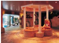
The holiday park will comprise an Aqua Sana spa

Outline planning permission has already been secured by the zoo, with detailed plans to go before the local authority in late May. Details: http://lei.sr?a=n2rot