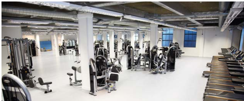
Investing in the latest kit ensures The Gym competes with the best

alone a private health club. This means we attract members from right across the social spectrum – from well-off professionals to students and the unemployed. We currently have more than 100,000 members and 35 per cent have never been to a health club before. Also, because Bridges is a social investing firm, 50 per cent of our sites have to be in city regeneration areas. At present, 80 per cent of our sites meet the requirement, so we're significantly out-achieving that target.