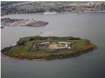
JAMIE HERT COOK

Spike Island will benefit from the restoration of buildings and structures that are to then be brought back into use on a phased basis and in keeping with the island's business plan.