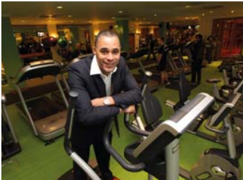
The scheme was carried out in collaboration with supplier Technogym

Meanwhile, Technogym is also working with the resort to overhaul the fitness facilities at The Forum Health Club, which closed from 4 March for work to be carried out.