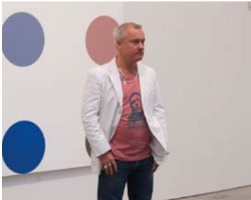
Hirst told the Observer the gallery will be used to display his collection

Among the artists whose work could be displayed in Hirst's gallery are the late Francis Bacon and iconic graffiti artist Banksy.