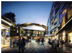
A cinema and a hotel form part of the proposals