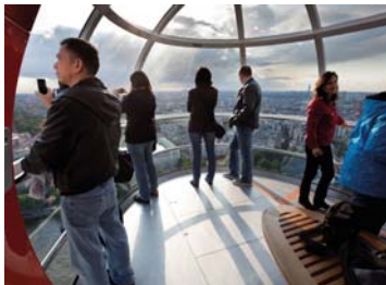
The domestic market helped boost visitor expenditure to a record high