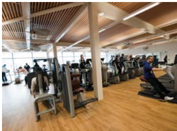
A 70-station gym is among the facilities at the £9m Nottingham centre