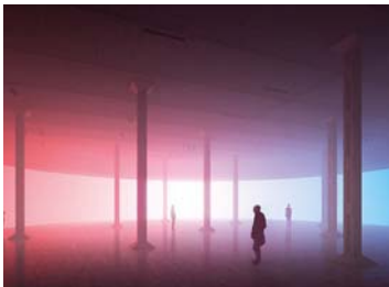
The former Oil Tanks will offer spaces for showing "art in the live form"

Designed by architects Herzog and de Meuron, the redevelopment includes the