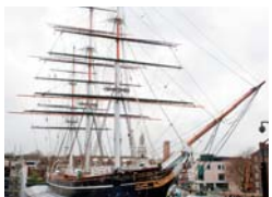
The historic ship has now reopened to the public