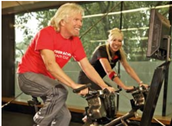
British Land now holds a core estate of 12 premium Virgin Active sites