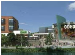
A seven-screen cinema forms part of the scheme