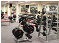
The extension doubles the venue's available space

Details: http://lei.sr?a=t7w1u (Shropshire)