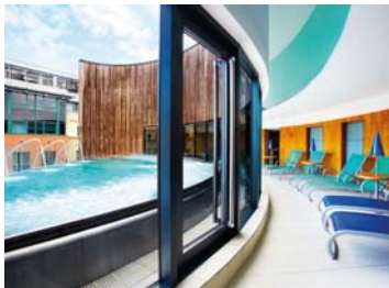
Sheraton's Edinburgh property comprises the extensive One Spa facility

The spa includes a rooftop hydromassage and a thermal suite containing a hammam; an aroma