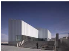
The gallery recently marked its first anniversary