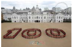
London's Olympic Games are moving ever closer