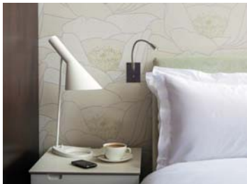
The new Exeter hotel will incorporate a spa with four treatment rooms

A fitness area and an 'inside-out pool' will also be among facilities at the hotel, which will join the group's first property – The Montpellier Chapter Hotel in Cheltenham.