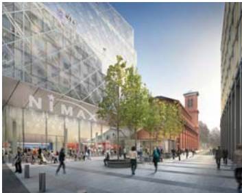
The new 350-seat theatre is to be built on the site of the former Astoria

Derwent London has already entered into an agreement with Nimax to operate the 350-seat theatre, which is part of plans for two of four development sites designed by AHMM.