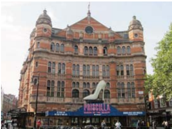
Lord Lloyd Webber owned London's Palace Theatre for nearly 30 years