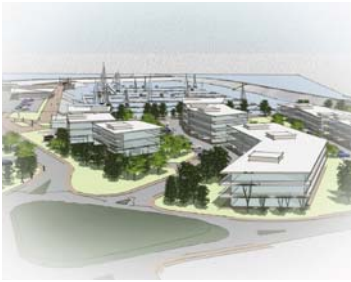
Conygar's outline plans include the provision of a new visitor attraction