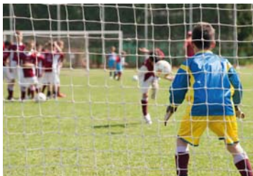
The MCC has urged pro-active steps to address "psychological warfare"

More than two thirds of the children (68 per cent) had witnessed verbal abuse during school matches, while 66 per cent of parents had seen "different forms" of mental intimidation.