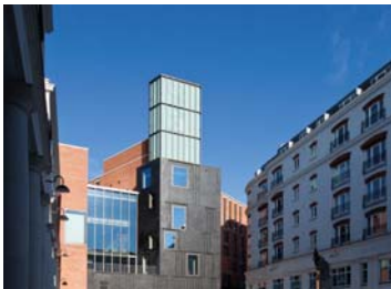
The £18m facility is "another symbol of progress" for Northern Ireland

Ni Chuilín said: "The MAC is an impressive venue and a focal point for the arts in the