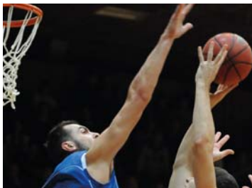
SportsDock's two indoor arenas cater for basketball among other sports

Meanwhile, Team USA has kitted out a strength and conditioning suite at SportsDock.