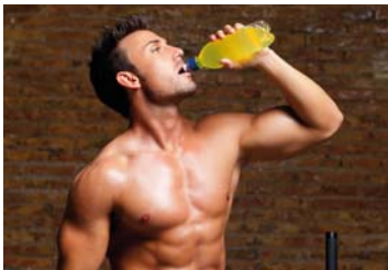
UKSSNA said the plans were a "disaster" to the sports nutrition sector