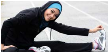
Women in the Middle East are increasingly taking up sport and fitness

Each leisure facility in these traditionally Muslim countries, however, needs to provide separate areas for men and women.