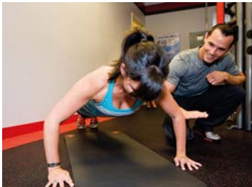
The new partnership is to assist young people working in active leisure

According to trade union UNISON there are concerns over the future for careers guidance with potential job losses in the sector.