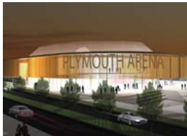
A remodelled facility is at the heart of the proposals

The future operation of the Pavilions Arena will be managed by PCC in partnership with the Theatre Royal (Plymouth).