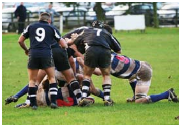
Sport Wales wants the sector to accelerate efforts to grow participation

The launch of the strategy was attended by Welsh sports minister Huw Lewis, who has announced a further £9m of Lottery funding will be invested over the next three years.