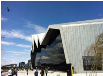
Glasgow's Riverside Museum has attracted more than 1 million tourists

Glasgow's Riverside Museum welcomed more than 1 million visitors since opening in