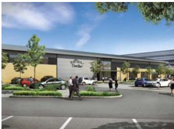
The new DLL venue will be located next to Worcester's Sixways Stadium

An "exclusive area" for adults is also being proposed by DLL, which is to accommodate a