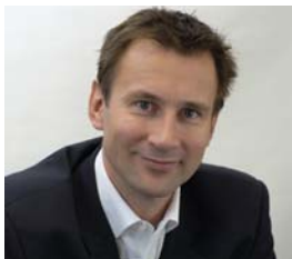
Jeremy Hunt is currently culture secretary at DCMS

The Institute of Economic Affairs (IEA) claims that closing the DCMS could save £1.6bn if all departmental spending ceased.