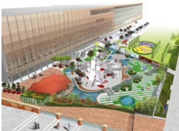
Thinktank Science Garden is thought to be the first of its kind in the UK

Thinktank Science Garden will open seven days a week and entry is included in the cost of a ticket to the attraction, which already boasts more than 200 hands-on exhibits.