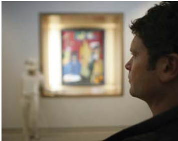
The Photographers' Gallery at 16-18 Ramillies Street in central London

"It is clear from our conversations with charities that any kind of cap could damage donations, and as I said at the Budget that's not what we want at all. So we've listened."