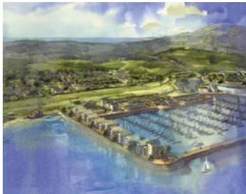
The joint venture is looking to transform Holyhead through the project

A 500-berth marina and a residential element is also part of the scheme, in addition to the provision for amenities and visitor attractions. According to Conygar, the development of the waterfront area will enhance and revitalise the town in a "sustainable manner" – such as attracting an increased number of visitors.