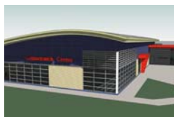
Pozzoni have drawn up plans for the new facility