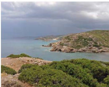
Crete's locality of Itanos is the site for the Minoan Group's development