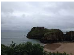
St Catherine's Fort was home to a zoo until 1979