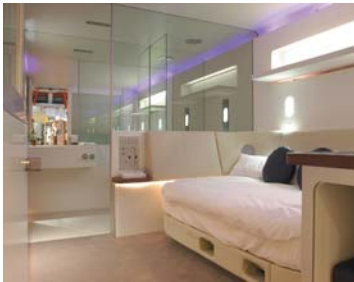
YOTEL is planning to add to its inaugural city centre hotel in New York

The two companies – along with long-term partners IFA Hotels and Resorts and Kuwait Real Estate Company – have joined forces to raise funds for the venture. The US$250m (EUR200m, £162m) private equity fund aims to help in the acquisition and development of more than US$650m (EUR521m, £421m) worth of YOTEL hotels over the next three years.