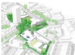
A 120-station fitness gym is included in the plans