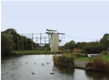
The new adventure course includes a 50m zip wire across the park's lake

The attraction will also boast a climbing wall, while visitors will be able to take a "leap of faith" on the Power Fan Descender drop – an 11.5m (37.7ft) vertical drop. Closer to the Edge has worked with BH Live on the attraction's planning, course layout, recruitment and staff training.