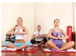
The foundation will support the FIA's initiatives