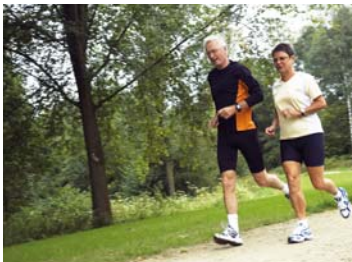
The scheme is designed to help improve the wellbeing of elderly people

Year Zero will provide an online application allowing individuals to manage personal health information and Liverpool's Feelgood