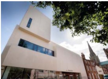
Keith Williams Architects are behind the design of the £6.9m museum

In addition to the remains of the Roman baths, The Novium will boast the Chilgrove