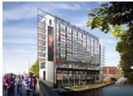
The AEW-designed scheme is sited near Old Trafford

"A lot of time was invested in the design