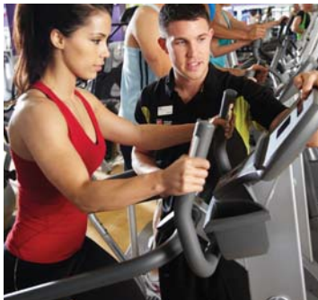
Fitness First is offloading the 67 gyms as part of a restructuring move

The clubs being sold – including sites in Birmingham; Chelmsford; and Stevenage – are