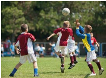
The plans will allow for greater participation in the game at youth level