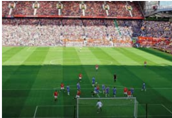
The 21st Annual Review reported further growth in combined revenues

Commercial revenue was up by 18 per cent – mainly among those with a larger global profile – and total matchday revenue also grew 4 per cent, although more than half of the 20 Premier League clubs reported a decline.