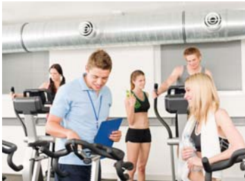
The programme aims to improve standards in the UK's leisure industry