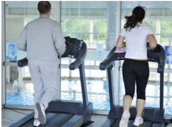
The new research claims exercise has no impact in treating depression

The results call into question current NICE guidelines drawn up in 2004, which suggest sufferers should do up to three exercise sessions a week. The study, however, is in contradiction with other studies on the subject of exercise and mental health.