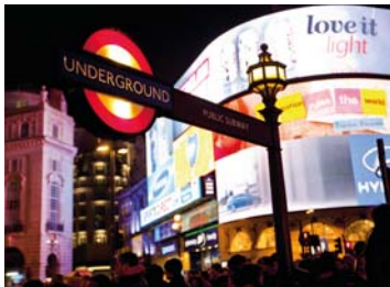
UK travel/tourism's growth is expected to outpace the overall economy