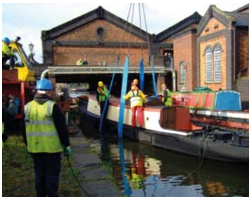
The funding boost will create opportunities across the heritage sector

Skills for the Future, which offers work-based training in a range of areas, received £9.5m of funding to support 43 projects across the UK.