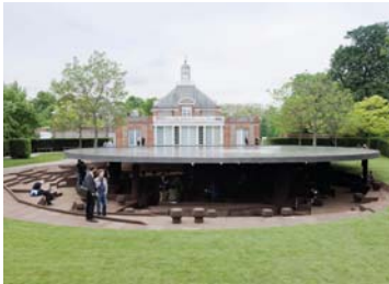
The Serpentine Gallery Pavilion 2012 will remain open until 14 October

Serpentine Gallery director Julia Peyton-Jones and co-director Hans Ulrich Obrist said: