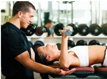
The report found that membership and facility numbers have increased

A total of 163 new public and private facilities opened during the year to 31 March 2012