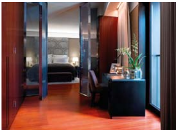
The new hotel features a 2,000sq m spa area and a 25m swimming pool

Elsewhere, the hotel boasts a private 47-seat screening room with cinema-quality vision and