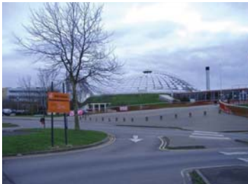
A multi-million pound refurbishment is planned for the leisure facility

Moirai has secured four long-term leases to the Oasis and former Clares site from SBC in a