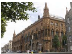
The gallery's photography space will be renamed