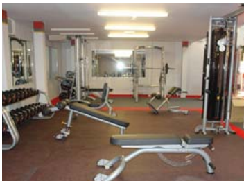
Snap Fitness has ambitious UK expansion plans for the next five years

The Sittingbourne club has been equipped with kit such as Olympic discs, fit balls and mats, as well as a range of dumbbells that have been exclusively branded for Snap Fitness. Facilities also include cardiovascular