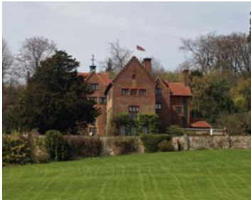
The promotion will run at at selected sites in the south east/south west