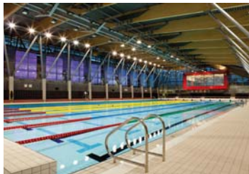
A 50m swimming pool is at the heart of the €50m UCD Student Centre

The gym contains more than 150 pieces of cardiovascular and resistance equipment, as well as a large free weights area. The equipment has been supplied by Art of Fitness with Life Fitness. Dance and group cycling studios also