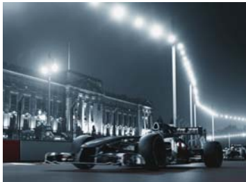
The concept sees cars speed past landmarks such as Buckingham Palace

Cars would travel at high speed in front of Buckingham Palace, around Parliament Square, along the Embankment and up to Trafalgar Square, with a total of 14 corners included in the planned route.