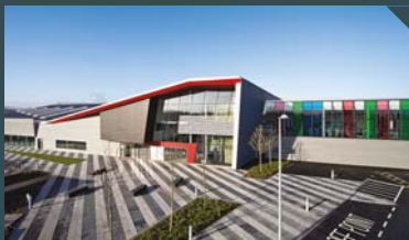
The Peak, Stirling Sports Village