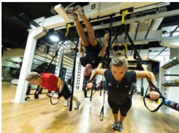
Queenax equipment has been installed at the new 200 Aldersgate venue

Elsewhere, the Classic Health Club boasts Queenax equipment – combining suspension and functional training – and Wattbike, as well as Technogym's Kinesis stations.