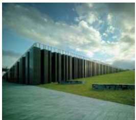
The centre is designed to fit in with its surroundings

A café and a retail facility also form part of the 1,800sq m (19,375sq ft) building, while guests can also access the grass-topped roof offering views of the Antrim coastline.