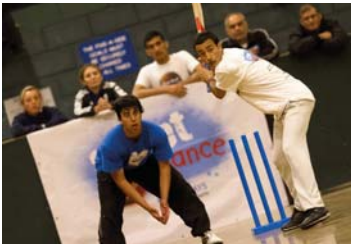
The StreetChance initiative is set to reach around 11,000 young people

Communities in Birmingham, Liverpool and London are among those set to benefit, with sessions to involve a fast-paced version of