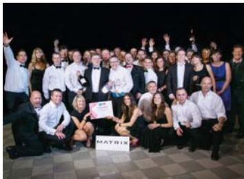
Everyone Active was the recipient of two FIA and Matrix Flame Awards

Meanwhile, there were also awards for the LivingWell Health Club in Maidstone, Kent – Club of the Year (under 1,000 members); Chartham Park Golf and Country Club, West Sussex – Club of the Year (1,000–3,000 members); Benton Hall Golf and Country Club,