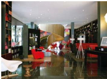
citizenM has worked with architects Concrete on the new London hotel

The group opened its first property in Amsterdam four years ago, and has already