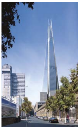
The 310m-tall Shard will change the London skyline