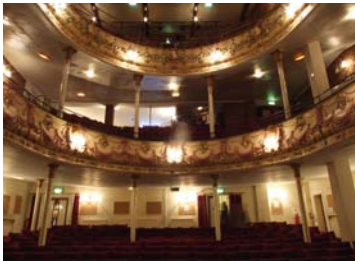
Margate's Theatre Royal is a new addition to the Theatres Trust register