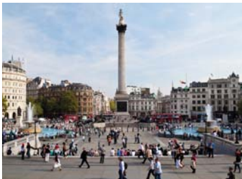
The government has been urged to do more to address UK sector issues