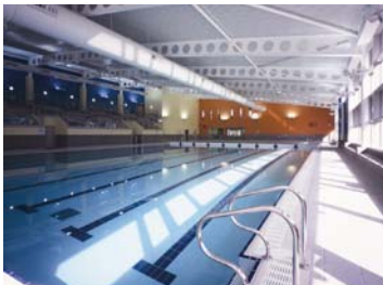
Each of the three design options come with swimming and learner pools

Sunesis Leisure offers three designs, which have been created with the help of industry