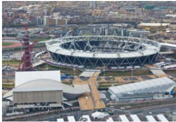
The 2012 Games will deliver benefits both this year and in years to come

LBG said the UK economy will be boosted by £5bn worth of games-related GDP in the legacy period following the Games - particularly in terms of physical infrastructure.