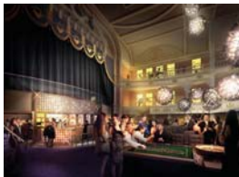
The historic venue has been completely transformed

Cadmium managing director Paula Reason said: "The sheer number of different areas within the building, on different levels, is what