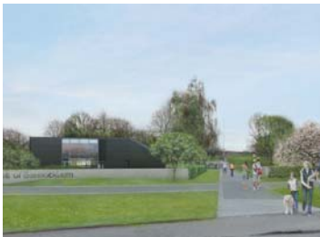
The visitor complex has been designed by a team led by Reiach and Hall

A further £4.1m has been awarded by the Heritage Lottery Fund, with the attraction set