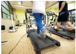
The UK study will be one of the largest of its kind