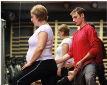
Learners will develop skills to work with pregnant/post-natal clients

Burrell said: "The course takes a very modern approach to the discipline, fully reflective of the very latest massage therapy theory."