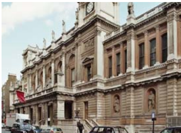
New York's Pace Gallery will open at 6 Burlington Gardens in late 2011