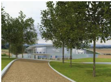
York's new £9m sports complex has been designed by Space Architects

UY has contributed £5m towards the development, while CYC has provided £3m. The rest