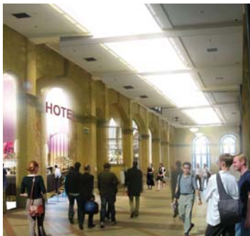
A hotel in the Panorama Room space is among plans being considered

Meanwhile, proposals for the renovation of Alexandra Palace's Great Hall could include