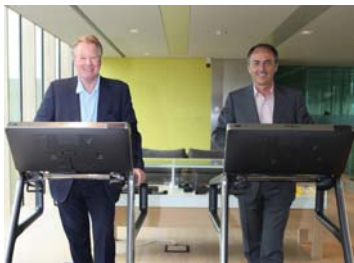
Technogym will equip a total of five fitness facilities at St George's Park

Perform, part of Spire Healthcare Group, has been appointed to operate the gyms, with the equipment to include Technogym's Excite+, Selection and PureStrength ranges.