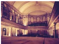
The venue's historic auditorium is to be restored