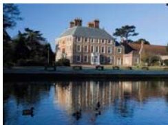
The hall and estate received a complete overhaul