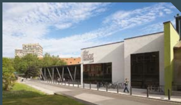
The Edge, University of Leeds

S&P works with you to deliver inspirational environments by solving your procurement demands and establishing new models of service consolidation and partnership working