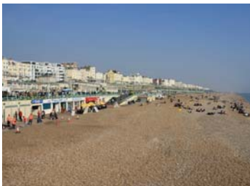
A new spa resort is to transform the former Peter Pan's Playground site

KRG's proposals for the spa resort include five pavilions - housing an indoor and outdoor children's club; a year-round spa and health