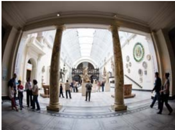
More than 110 services and institutions participated in the MA's survey

Other findings from the survey showed that 42 per cent of participants had reduced staffing levels, with nearly a third seeing budgets reduced by more than a tenth.