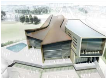
Wilkinson Eyre Architects are behind the design of the £17.9m complex