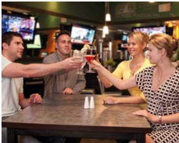
Generation Y consumers fuelled the growth in eating and drinking out

There was an 18 per cent increase in the number of times people in the south east currently go out for food or drink, although all other UK regions also showed signs of growth.