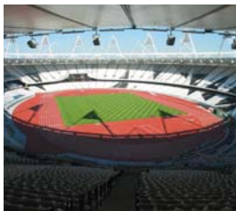
Two football clubs are among the four stadium bids

The other bidders are Intelligent Transport Services in partnership with Formula One and WCFB College of Football Business. All four will now be assessed for compliance.