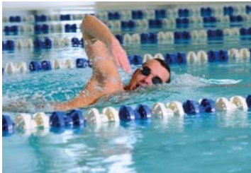
AECOM found that aquatic facilities are among those most in demand

Meanwhile, the Sports Report revealed that aquatics and water sports facilities are most in demand – 40 per cent of participants agreeing that more of such venues were needed.