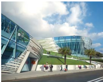
AEW Architects have drawn up plans for the new museum development