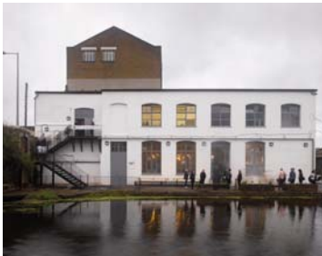
The former vacant building located adjacent to London's Olympic Park