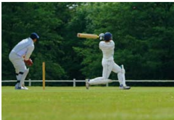
A range of community sports projects have received a share of funding

The budget for the latest round of Inspired Facilities has been doubled after Sport England secured a £15m increase generated by strong National Lottery ticket sales.