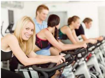
Fitbug's new games Framework members to compete against each other

The Games Framework supports Fitbug's corporate sales strategy of encouraging