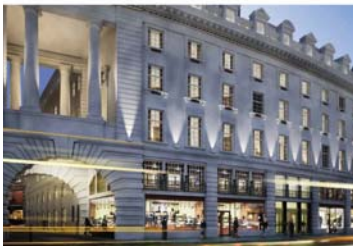
Café Royal is now set to open in October as a 159-bedroom luxury hotel

"During the extensive works, we have uncovered a number of historical treasures and we are working with David Chipperfield