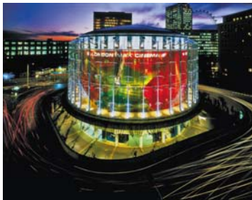
The BFI IMAX houses one of the largest cinema screens sited in the UK

Tickets will no longer be bookable via the BFI IMAX website or booking line, with all online services to be switched over to the Odeon website and booking systems.