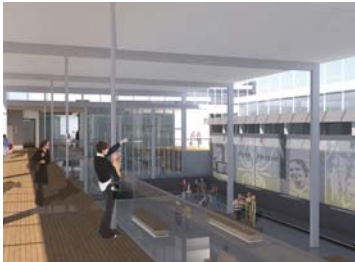
St Fagans is to undergo an extensive £25m transformation programme

Visitors will be given the opportunity to explore Wales' history through new exhibitions, a series of archaeological reconstructions and authentic historical buildings.