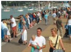
The research explored the cost of short breaks