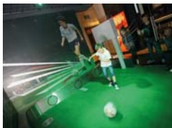
One of the museum's new interactive experiences