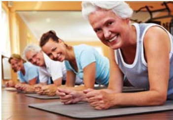
Edinburgh Leisure's activities helped avoid £25.5m of healthcare costs

In the case of Edinburgh Leisure, investing in the provision of good quality, accessible and affordable services results in a more active population which, in turn, requires far less medical interventions and fewer days off work.