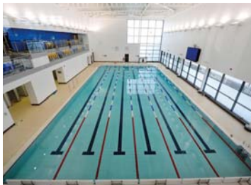
Leisure specialists S&P Architects are behind the new complex's design

The stations will also be supported with a communicator key, which – if purchased – will