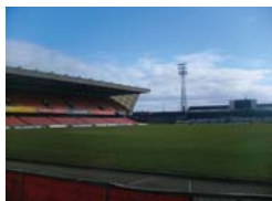
The current Windsor Park site will be overhauled