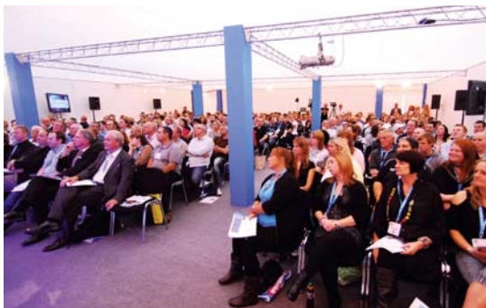
The Play Providers Association Conference will be held at the Drayton Manor theme park in Tamworth

The Play Providers Association (PPA) will hold the Play Providers Conference 2012 at LIW this September, with the ASPIRE awards taking place at the newly re-opened Drayton Manor Hotel complex in Tamworth.