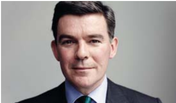
Sports minister Hugh Robertson was criticised by the committee for saying he "wasn't interested in improving the nation's health"

The committee called the result a "missed opportunity" as the city prepares to host the Olympic Games, and also heavily criticised the