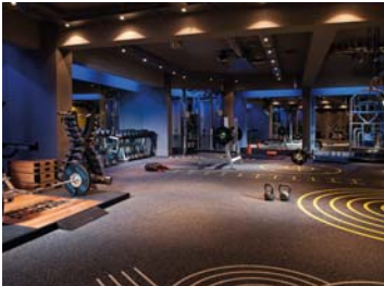
The Covent Garden club has been set up mainly as an open-plan facility

Escape's flooring expert, Paul Lipscombe, developed a bespoke solution for SIX3NINE, which has included levelling and screeding of the entire ground level and the hand painting of a sprint track on the floor.