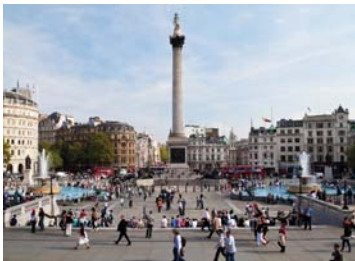
The number of overseas residents visiting the UK has grown 3 per cent