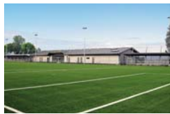
The new facility was designed by S&P Architects