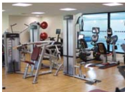
The new gym follows a £92,000 joint investment