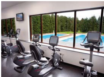
The new fitness suite overlooks the restored outdoor swimming facility

The venue's outdoor pool received more than £1m worth of investment and is already open, while there are plans to transform three outdoor tennis courts into all-weather pitches.