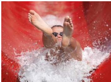
A waterpark is reportedly among plans for the Newhaven development

According to the local authority, it had been bound by confidentiality requirements during