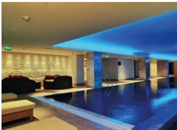
Hilton Hotels and Resorts is rolling out its eforea spa concept globally

The hotel operator is in the process of rolling out its own spa concept – eforea: spa at Hilton