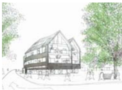
The new facility will be BREEAM Excellent rated