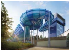
Tropical Cyclone is to open at the park in November

A Center Parcs spokesperson said: "The new £4m Tropical Cyclone water ride is the first of