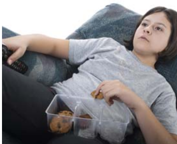
Inactivity is thought to be the “fourth leading cause” of global deaths