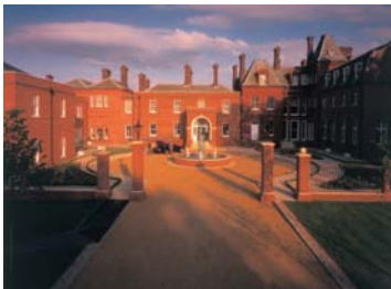
Champneys' spa resort in Tring offers a variety of health professionals

Meanwhile, Tring Medical Centre now offers services including injury and pain management; weight management and detox; and the Healthy Heart Programme.