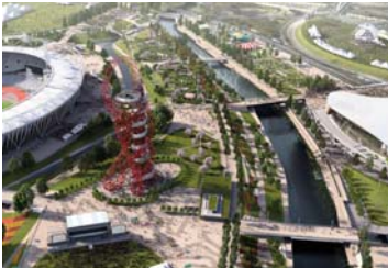
The new-look South Plaza area is set to open to the public in spring 2014

A park hub next to the ArcelorMittal Orbit will feature a café, a box office and a rooftop