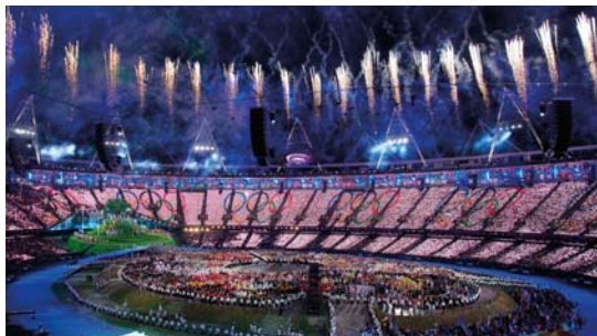
Launching a legacy: London 2012 has had a positive effect on participation levels at clubs across the UK

Daily news & jobs: www.leisureopportunities.co.uk