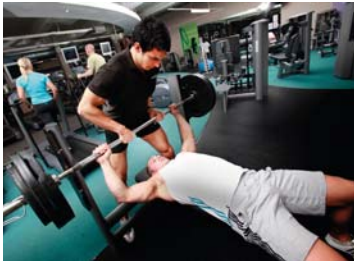
Premier Training is opening new venues in Birmingham and Liverpool

• The training provider has also announced plans to open a new venue at David Lloyd