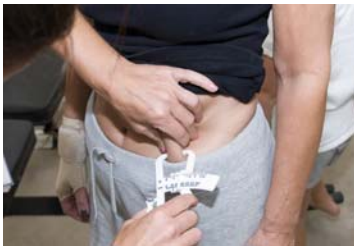
The new research involved academics from Tanzania, the UK and the US

"A diet high in fat, sugar and processed products has contributed to this epidemic. However, we should be wary of viewing physical activity through an obesity-tinted lens."