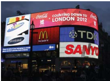
ETOA has highlighted the "good news" for potential visitors to London

London 2012 organisers are welcoming more members of the Olympic Family than previous Games, with half of the expected foreign visitors expected to come from this group. Meanwhile, accommodation remains available across London – offering rates at or below