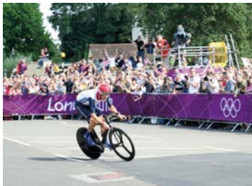
Bradley Wiggins on his way to gold in the London 2012 men's time trial

Meanwhile, Visas's London 2012 Games Spend Tracker has reported a 5.1 per cent year-on-year increase in spending on bicycle shops, sales