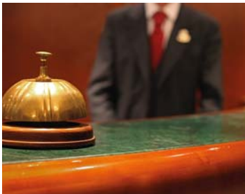
The new school will cater for young people looking to enter the sector

It is expected the school will cater for 300 students aged between 14- and 19-years-old, with mainstream qualifications including GCSE English, Maths and Science.