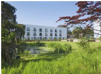
Lifehouse Spa and Hotel will officially launch its ESPA spa in September