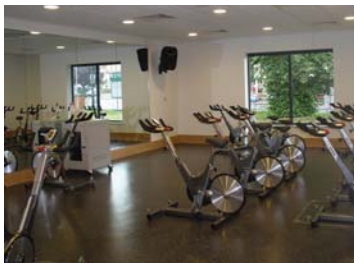
The new-look Albany Leisure Centre includes an indoor cycling studio

Albany Leisure Centre is one of more than 60 facilities across London and the south east run by Fusion Lifestyle, with the project part of a wider investment in Enfield provision.