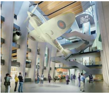
Imperial War Museum London is among the four recipients of funding

The V&A itself has also secured a HLF grant, with investment worth £4.3m going towards a restoration of the Europe 1600-1800 galleries back to their original Victorian design. Elsewhere, Imperial War Museum London secured £4.5m towards its new First World War Galleries.