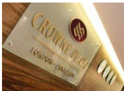
Crowne Plaza is one of IHG's nine hotel divisions