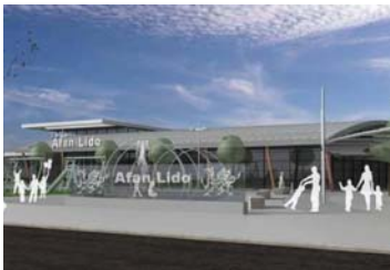
Hollywood Park has been put forward as the site for the new Afan Lido

Facilities will also include a teaching pool; a fitness suite with a free weights area; and