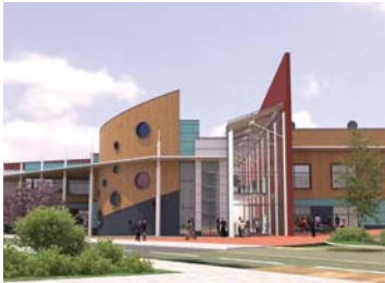
The new facility will house a 100-station fitness suite and dance studios

The proposed complex will be located on the corner of Moor Street and Barton Street, with a planning application due to be submitted later this year. Work will start in early 2013.