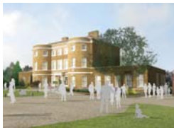
The historic gallery building has been renovated