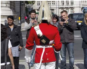
London 2012 is a key opportunity to market itself to emerging markets

London 2012 also gives the UK an important opportunity to market itself as a destination to tourists from emerging markets such as China, Brazil, Russia and India.