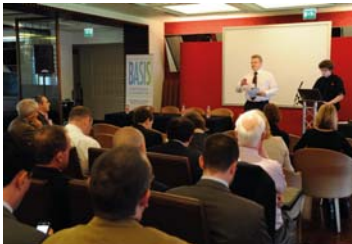
BASIS aims to integrate sustainability issues into the UK sports sector

BASIS officially launched in October 2011 in order to help "educate, share best practice