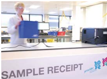
The Phenome Centre in Harlow, Essex, will be a 'world leading' facility

It will allow us to understand the characteristics of disease and how these link into genes and our environment."