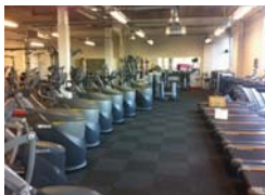
The club is the group's second to open in the UK