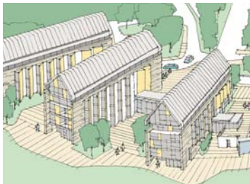
It is Wyndham's first UK hotel outside London under its flagship brand

Hotel facilities will include a luxury spa with eight treatment rooms, a 20m infinity pool and a whirlpool, while a fully-equipped fitness suite and two dance studios are also planned.