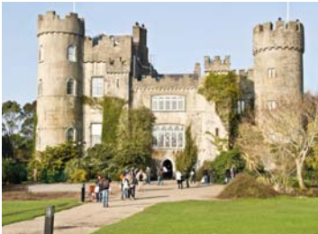
Malahide Castle and Gardens will now be operated by Shannon Heritage