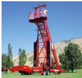
Innovative Leisure will supply the central feature

Interactive family attractions specialist Innovative Leisure are set to supply the central feature of the Play & Attractions section at LIW 2012. Among the products being shown by the Leicester based company will be a fully operational SkyTrail High Ropes course, in addition to a Climbing Wall and, for the first time at the show, a Mobile Zip Line leading to the outdoor section of the show where Innovative Leisure will once again be operating an example of its Water Wars water balloon game.