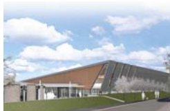
Faulkner Browns Architects designed the facility