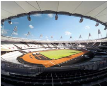
The Olympic Stadium is one of six shortlisted for the RIBA Stirling Prize

Dublin, Ireland-based O'Donnell + Tuomey were the firm responsible for the "crafted and careful reincarnation" of the theatre on a suburban site in the heart of the Northern Ireland capital.