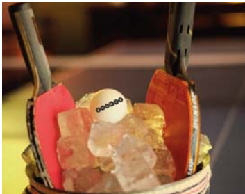
The new concept will combine table tennis with an hospitality element