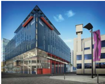
The new hotel forms part of London's wider Wembley City development

Meanwhile, the ninth floor roof bar – Sky Bar 9 – will provide views overlooking Wembley Stadium, Wembley Arena and Wembley Way with an outdoor terrace for 150 people.