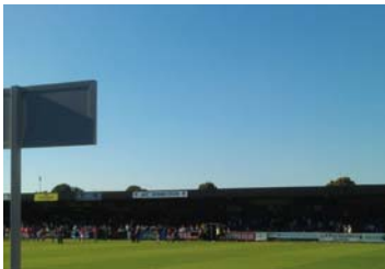
AFC Wimbledon currently plays its matches in Kingston upon Thames

AFC Wimbledon, which currently competes in npower League Two, was established in 2002