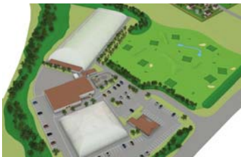
The largest of the domes (top) will contain small-sided football pitches

The 455sq m (4,898sq ft) fitness suite will be equipped by Matrix, while there will also be a TRX suspension training zone. Elsewhere, a sensory room to stimulate disabled children and a 72sq m (775sq ft), 12-station gym for