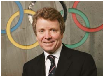
Lord Moynihan has chaired the British Olympic Association since 2005

"In this context of looking forward, I will let them know I intend to hand on the baton smoothly and securely to a successor chair