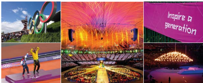
London's memorable and record-breaking Olympic Games were brought to an end in the main stadium with a dazzling closing ceremony directed by Kim Gavin

Daily news & jobs: www.leisureopportunities.co.uk