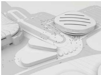
FaulknerBrowns Architects are behind the design of Derby's new arena

Designed by FaulknerBrowns Architects, the 14,500sq m (156,077sq ft) multi-sport arena received planning permission earlier this year and is to include a 250m cycling track and a 1.5km (0.9-mile) outdoor closed cycle trail.