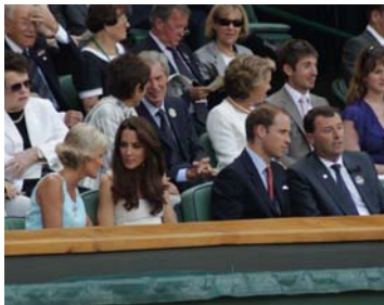
The Royal couple – at Wimbledon 2011 – have a keen interest in sport

Speaking at the launch, The Duke of Cambridge said: "What all three of us have