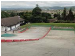
The snowsports centre has been acquired by GSL