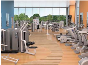
The Inspire: Luton Sports Village has been designed by S&P Architects