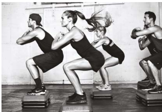
The GRIT SERIES is designed to assist operators maximise revenue and attract younger club members

Les Mills UK is set to launch GRIT SERIES, their latest High Intensity Interval Training (HIIT) programme at Leisure Industry Week 2012. HIIT has been scientifically proven to provide better results than any other type of training, in much less time.