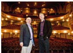
Work started at the venue in September last year