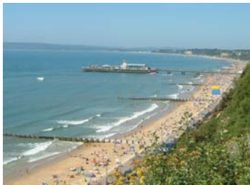
Bournemouth's new NCTA will be one of the first of its kind in Europe

NCTA will support 23 new jobs and 107 volunteer roles initially and is expected to grow Bournemouth's local tourism economy by 2.3 per cent to £9.5m within three years.