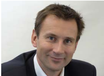
Hunt unveiled a target of attracting 40 million overseas visitors by 2020

He said: "Following success of London 2012 Festival, I've commissioned a report on feasibility of a London or UK biennale. We must use this extraordinary year to turbo-charge our tourism industry and create prosperity."