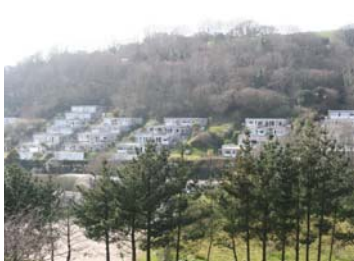
The holiday village's spa will house treatment rooms and an indoor pool

The project team includes Arup, the engineers which developed London's Olympic