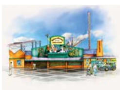
Thrill-o-Matic will replace the former Gold Mine