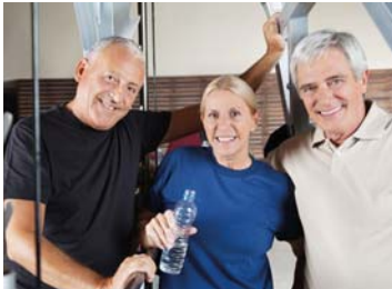
The research has underlined the importance of exercise in older people

For the study, more than 4,200 participants in the UK with an average age of 49 reported the duration and frequency of their leisure-time physical activities – such as brisk walking, vigorous gardening, cycling and sports.