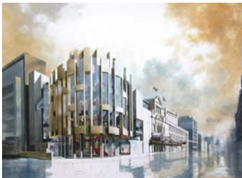
Work will take 18 months, although the theatre will only close for three

The arts organisation has owned the theatre since 1974 and is fronting a campaign to