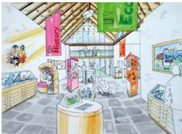
Querceus Design will lead the interpretative design of the visitor centre

A retail outlet similar to a National Trust shop and work space for community groups