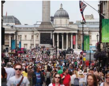
PwC's poll found that 95 per cent of Olympics visitors enjoyed their stay

Aside from the Games, tourists rated heritage sites as their best experience, followed by the British people. Museums came third, with the city's atmosphere and parks in fourth and fifth place respectively.