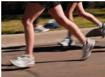
Exercise is an important part of the Welsh Government's new strategy

Meanwhile, the Welsh Government will promote the use of exercise in reducing heart