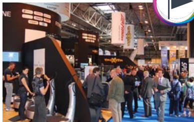
The show's tag line this year will be 'where innovation meets inspiration'

The new Trail will be highlighted on the LIW website, on the floor plan signage on site