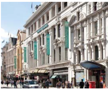
London's historic Trocadero will house the new 583-bedroom pod hotel

Current proposals for the LDN hotel have added 88 rooms and the rooftop bar within a space previously occupied by Funland, an amusement arcade acquired in 2005 that was phased out and closed in 2011.