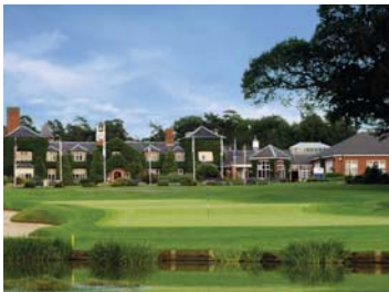
The Warwickshire property is the only four-time host of the Ryder Cup

Elsewhere, the spa includes a manicure and pedicure room and post-treatment areas.