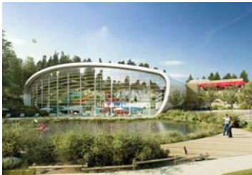
Work to start the accommodation element will commence in November

When completed, the £250m village will also include a 75-bedroom hotel, an Aqua Sana spa and two main centres housing indoor sports facilities, swimming pool and restaurants.