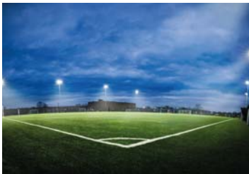
Facilities at @Worle Centre will include a 3G, full-size artificial pitch

Other facilities include multi purpose rooms, indoor and outdoor changing facilities