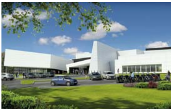
The centre, in Linwood, has been designed by Cre8 Architecture

Outdoor facilities at the centre will include an eight-lane, all weather athletics arena, flood lit synthetic football parks for both 7-a-side