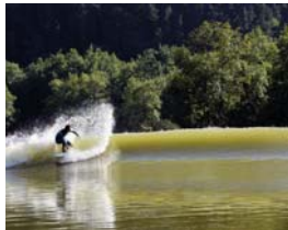
The waves created on the lake will be up to 1.6m high

The experience is suited to both experienced and first time surfers and the lake would be surrounded by botanical and healing gardens. Following a market review carried out by Colliers International, the group were approached by Wightlink and the Isle of Wight Council about the possibility of creating a site on the island. Both organisations have provided some initial funding to help establish the viability of the scheme.