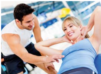
Applications for the skills development fund will close on 28 March

The programme is open to employers of all sizes and sectors within England, but bids from groups of employers working together in their sector, supply chain or locality will be viewed favourably. SkillsActive and ukactive will collate feedback from the online survey and develop options or themes that