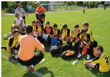
Sports Coach UK will use the funding partly on its development work