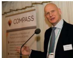
Duncan Goodhew at the Compass launch event

management of the Nunnery Wood Sports Centre and St. Johns Sports Centre to leisure trusts. Funding cuts from central government mean the council needs to save £686,000 in the 2013/14 year. Details: http://lei.sr?a=k4N9W