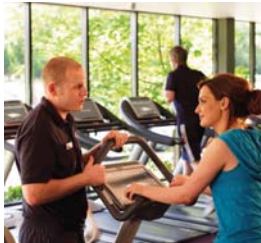
The health checks will be available at selected hotels

Resulting information is collated in a personal report highlighting areas where individuals have room for improvement, and advice given on how to improve lifestyle