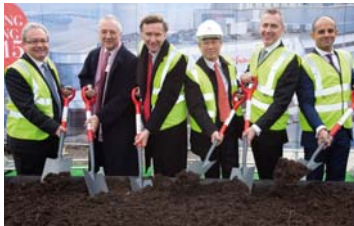
Construction work is now underway and the resort is due to open in 2015

The leisure and entertainment attraction, due for completion in 2015, is projected to contribute £58m to the regional economy during the construction phase, and £32.8m annually when complete. At 538,000sq ft (49,982sq m), over seven storeys, it will be one of the UK's largest integrated destination complexes and will include a designer outlet centre, 11-screen cinema, food and beverage, banqueting and conference centre, casino and a four star hotel and spa with up to 10 five star suites.