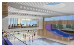
The contract will include the Redcar Leisure and Community Heart centre when it opens in 2014

Rebuilding on the current site was deemed unsuitable, as customers would be without a leisure centre while building took place, which is anticipated to take two years. A new facility is forecast to save the council considerable money with energy efficient facilities. Details: http://lei.sr?a=R4v50