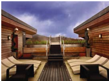
The ESPA partnership will introduce a wide range of new treatments

ESPA treatments aim to combine natural ingredients with the latest age-defying technology. Carrick Spa features 17 dry and wet treatment rooms, including a couple's suite and a roof-top terrace with infinity pool. It offers guests a range of thermal experiences,