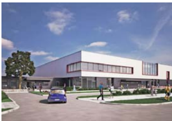
Facilities at the centre will include a swimming pool and large gym