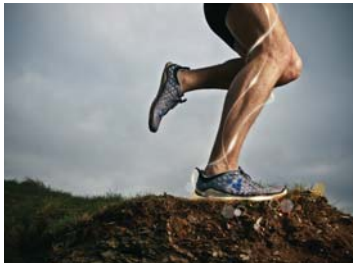
Barefoot running has increased its popularity over the past two decades

The health and fitness industry education provider is looking at the possibility