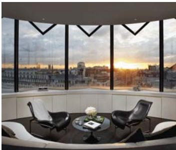
The hotel at the Marconi House was designed by Fosters + Partners