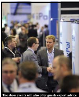
The show events will also offer guests expert advice