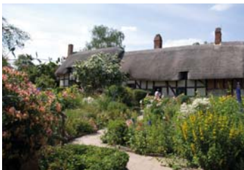
The cottage of Shakespeare's bride Anne Hathaway in Stratford

The marketing campaigns are part of VisitEngland's three-year investment project Growing Tourism Locally, which aims to