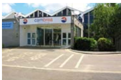
The ageing centre is facing an uncertain future

It showed that there was a demand for more cycling classes, so 10 new bikes have been added to the current space as well as a brand new functional fitness area. Details: http://lei.sr?a=qiv6V