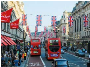
The number of inbound tourists reached pre-recession levels in 2012

A12 countries include eastern European and Baltic countries - such as Bulgaria, Romania,