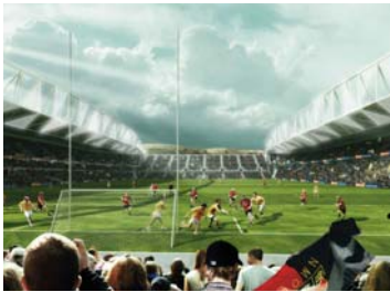
The stadium will be designed by Olympic stadium designers Populous

The project will include a new 38,000-seated stadium on the existing Casement site with the full demolition and disposal of the existing Casement Park Facilities. The Casement Park Stadium Project Board, which manages the project on behalf of Ulster GAA, expects the stadium to be open in time to host the 2016 GAA Ulster Final.