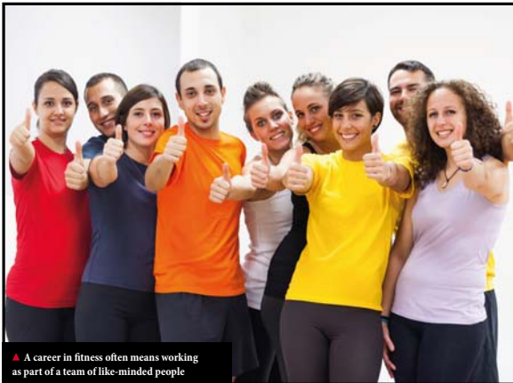
▲ A career in fitness often means working as part of a team of like-minded people

"In my opinion, anyone considering entering the industry should complete a vocational qualification first and then look to further their knowledge through academic study." ●