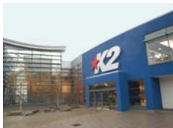
The K2 is set to receive £65,000 redevelopment