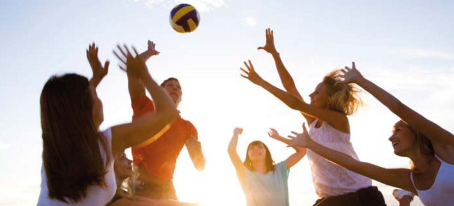
▲ The active leisure sector is thriving, with sports and fitness increasingly featuring in government health policy

and gone some way to maintaining those standards through its record of members' continued professional development."