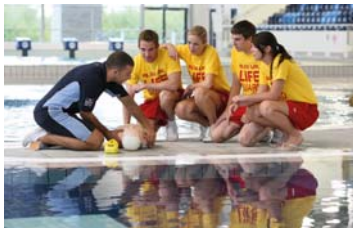
The scheme will initially be rolled out across England and then UK-wide

It is hoped that increased professionalism and standards will lead to increased