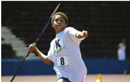
Only a minority of British schools organise and play competitive sport to a high level