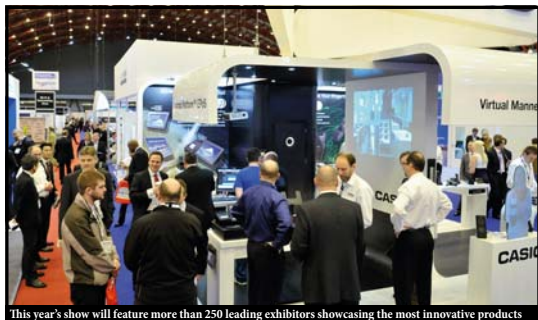
This year's show will feature more than 250 leading exhibitors showcasing the most innovative products