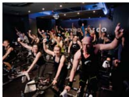
Launch event at the Cyclebeat indoor cycling studio

The concept offers riders an experience which starts the moment they log onto the studio website. Having decided which class they would like to attend, riders can reserve a particular bike just as they would when booking a seat on a plane, while checking out their instructor's profile and even listening