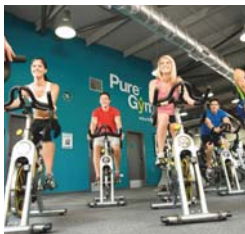
The app allows members book and cancel classes

A brand new fitness studio and health suite has been added while the reception and pool viewing areas have also been refurbished. It is the second of two centres operated by Fusion on behalf of Charnwood Borough Council that have received upgrades in the past six months. Details: http://lei.sr?a=Z4A8Z