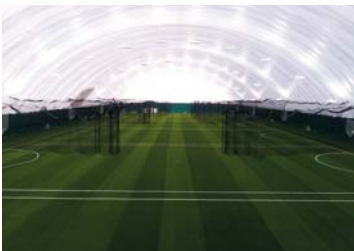
The Sports Domes have been set up with football and golf facilities

Facilities include four golf simulators that allow golfers to experience over 70 of the world's top courses with interactive graphic