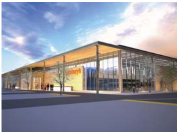
Sainsbury's will provide an upgraded supermarket and more shops

The council is currently undertaking a survey of leisure activities available in the town to determine what else the town needs, with core elements in the new centre expected to include gym and fitness facilities and a multi-use space for dance, meetings and events.