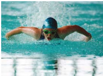
The software is initially programmed for swimming pool management