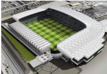
Plans include two new stands and an extension to the other stands

The project is part of a £110m pledge by Northern Ireland sports minister Carol