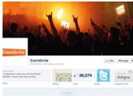
The new service aims to make buying tickets easier

Event organisers can create a Facebook event themselves and direct users to Eventbrite to purchase tickets, or create an event via