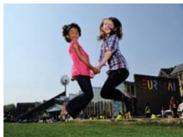
Eureka! will educate kids about healthy lifestyles

Featuring more than 100 interactive stations, the exhibition has been developed with the support of a £1.45m grant from the charitable foundation Wellcome Trust. Gallery content and interpretation was designed by At Large