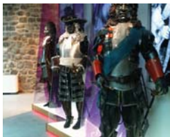
Eight galleries chronicle the town's history

It is the first ever exhibition held on the two cities at the British Museum, and the first such major exhibition in London for almost 40 years. Featuring more than 250 objects, it will have a unique focus, looking at the Roman home and the people who lived in these ill-fated cities. Details: http://lei.sr?a=08z3x