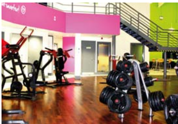
énergie's Scottish openings include a Fit4Less club in East Kilbride

The Fit4less that opened in East Kilbride in December is an 18,000sq ft (1,672sq m) space that includes the latest Precor and TKO equipment, extensive cardio, free weights, resistance and freestyle area and over 55 group exercise classes per week. Elsewhere, the new Fitness for Women club in Galashiels consists of a