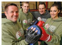
Mixed Martial Arts is 'exploding' in popularity

The partnership will include 16 Gym Group sites set to open this year. Matrix has already kitted out the company's 32 existing sites. The Gym Group also said it had seen a record intake of new members at the start of 2013 - an increase of 15 per cent in total membership in clubs nationwide during the first two weeks of January. Details: http://lei.sr?a=V3x8p