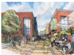
The council will consider the Mulberry Place plans