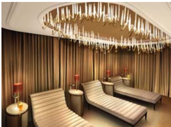
Facilities at the new Guerlain spa includes a luxury relaxation lounge

Among the signature treatments is the 150-minute Orchidée Impériale Prestige, which includes a firming massage, repeated three times by alternating deep massage sequences with softer relaxing ones. This is followed by three different masks using products from the Orchidée Impériale range including the new Longevity