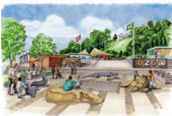
Dudley Zoo would get a new piazza entrance as part of the upgrade