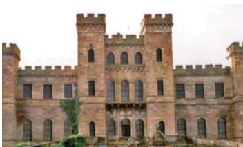
Thomson Architects will help redevelop the castle as a luxury hotel

Kilmarnock-based Thomson Architects have been appointed to create the blueprint for the site. It is anticipated the development will be powered by clean renewable energy. As