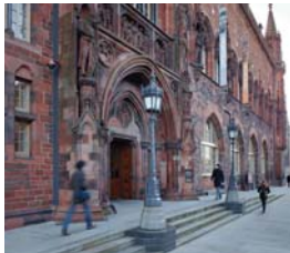
Three sites in Edinburgh alone attracted 1.6m visitors

Highlights of the 2012 programme included the Van Gogh to Kandinsky exhibition at the