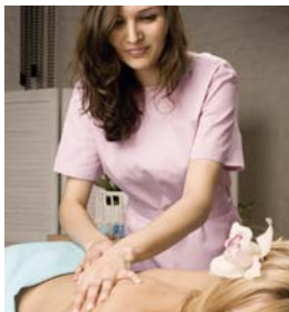
The award is for anyone working in the spa sector

Habia plans to take it on the road with courses across the UK by offering employers – or groups of employers – who can gather at least 12 delegates the chance to have Habia deliver the qualification on their own premises. Habia is the government approved standards setting body for spa, hair, beauty and nails, and creates the standards that form the basis of all qualifications.