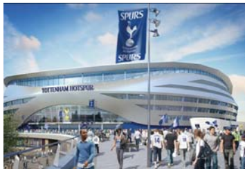
The new stadium covers a 20-acre area and includes plans for a hotel

The Northumberland Development Project's (NPD) proposal for the stadium covers a 20-acre area, which includes the site of the current ground and the industrial land to the