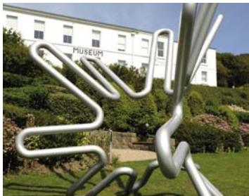
The money will go towards projects to diversify coastal economies

"We've seen enormous enthusiasm for this government fund and had to make some difficult choices but the projects we've chosen will create thousands of jobs and help many start-up businesses."