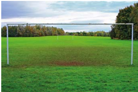
More than 80 per cent of people cite poor facilities as a concern in sport organisations

Figures from the Football Foundation show that 84 per cent of people cite ‘poor facilities’