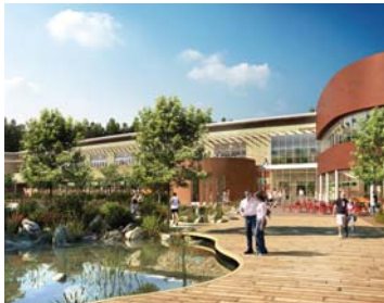
A 75-room hotel and an Aqua Sana spa with six suites will also feature