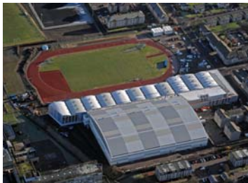
The Aberdeen facility has been designed by Faulkner Browns Architects

A 25m x 16.5m diving pool, fitted with water cushioning systems and an adjustable floor, will also feature, along with a timing and video