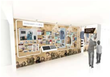
A permanent exhibition about RAF Duxford's history opens this month

Plans for the museum include a £2.5m revamp of the American Air Museum in 2015-16, a new hangar where visitors can see aircraft conservation in action, the transformation of the unused officers' mess into offices and