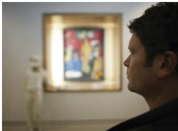
A total of £3m will be invested in supporting destinations across the UK

Describing the partnership, culture secretary Maria Miller said: "Our country is renowned around the world as a top cultural tourist destination - with iconic heritage sites, museums