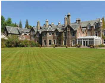
The Victorian mansion is not far from Murray's hometown of Dunblane

Murray said: "By re-establishing Cromlix as a leading luxury hotel at the heart of the Dunblane community we will be able to attract new visitors to the area, create a number of new jobs and focus on supporting other businesses. I'm pleased to give something back to the community I grew up in."