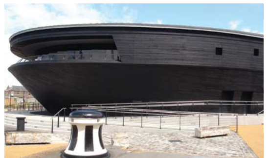
The museum has attracted more than 400,000 visitors since opening

The Mary Rose Museum was presented with the restoration/conservation award, fending off competition from the Oxford University Museum of Natural History. It also won the best permanent exhibition, beating the rival National