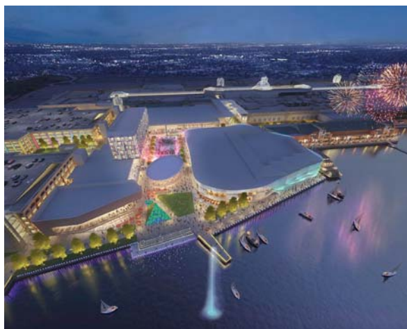
Intu looks set to pursue leisure projects like its £80m Lakeside expansion

Among the company's ongoing food and leisure projects are the £80m Lakeside development in Essex and large-scale mixed-use plans to refurbish its Watford centre. A company-issued management report noted that Intu