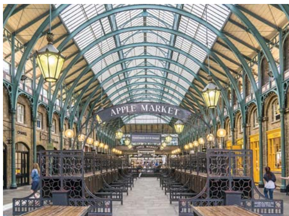
Records of the market go back to 1654, with the current structure built in 1830

The latest plans, which cover Vinci and St Modwen, have been backed by the Covent