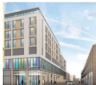
The new centre will replace two older facilities

Outdoor activity tourism also supports 8,243 jobs, with the survey including outdoor activity businesses as well as those which take part in Welsh outdoor sports such as climbing, watersports, airsports and rambling. The findings suggested that 54 per cent of businesses surveyed thought awareness of outdoor activities in Wales has increased over the past three years, with new high profile activities such as Surf Snowdonia and new mountain biking facilities getting large media exposure. Details: http://lei.sr?a=5V5G7