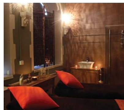
The design is based on Moroccan and Thai spas

Unlike traditional resorts, destination spas possess greater internal appeal – including services, specialists, F&B and activities – which makes them more flexible than resorts. While the site itself is less important to a destination spa – aside from concerns about air quality, water quality and potential future developments in the area – the report illustrates connectivity is a critical factor for consumers. The accessibility point was also made in Spafinder's 2014 trends report. Details: http://lei.sr?a=w9v5V