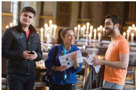
The training will teach the art of effective fundraising

99 workshops, starting in London on 3 June, will cover 13 topics on day-long events led by an IOF fundraiser in addition to a number of one-to-one surgery