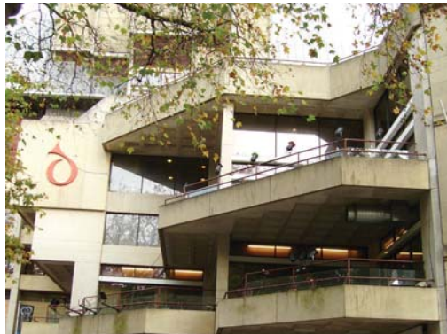
St David's – Welsh national concert hall – is also being considered

The council is currently looking at several possibilities, including social enterprises, not-for-profit trusts, commercial management contractors or staff mutuals, and has reportedly already had significant interest.