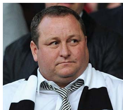
Newcastle Utd owner Mike Ashley founded the company

Leases for the 33 sites were put up for sale by LA fitness in March as part of a restructuring plan to reduce debt. It is not yet known how the sites would be branded or operated under any deal with Sports Direct. Leisure Opportunities