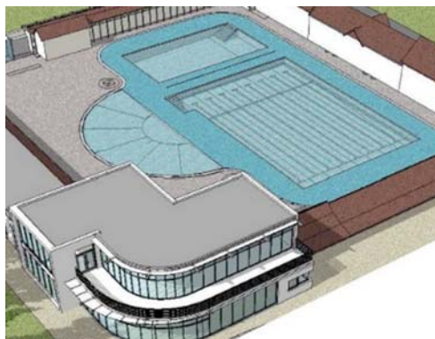
The new lido will hold a 25m main pool and an activity pool