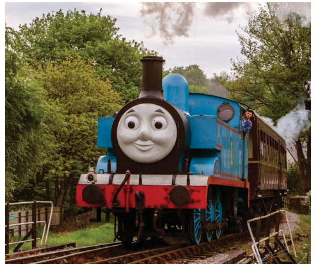
Heritage railways rely on special themed events to make a profit