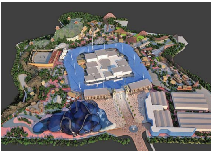
The proposed theme park and resort would become one of the four largest in the world

"The Secretary of State considers this proposal would be likely to have significant economic impact, be important in driving growth in the economy, and that it would also have an impact on an area wider than a single