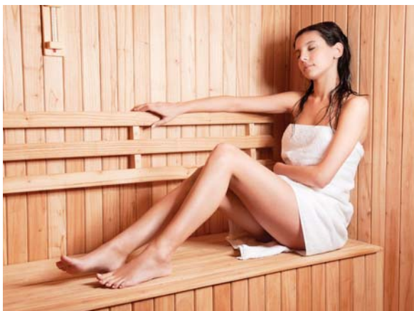
The category is designed to show spas which welcome all shapes and sizes

"For our customers sake, we must meet the request of the average-sized lady and above.