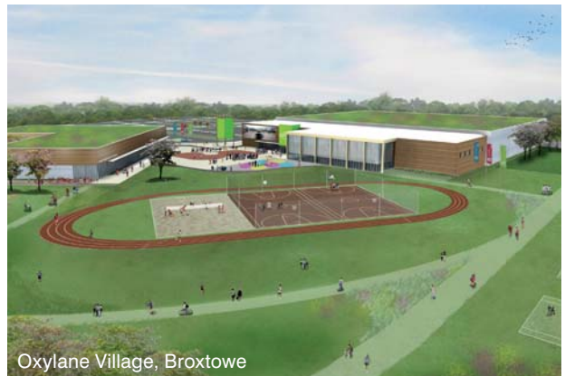
Oxylane Village, Broxtowe