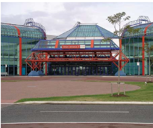
This year's LIW is at Birmingham's NEC from 30 September to 2 October

Some suppliers had expressed a desire for change from the current format when speaking to Leisure Opportunities, however, others