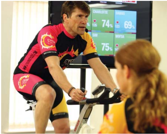
Live streamed heart rates appear on large screens during classes

All bookings are taken online and classes become cheaper the more they are purchased to encourage customer loyalty. Riders can obtain their own Polar heart monitor at a reduced price