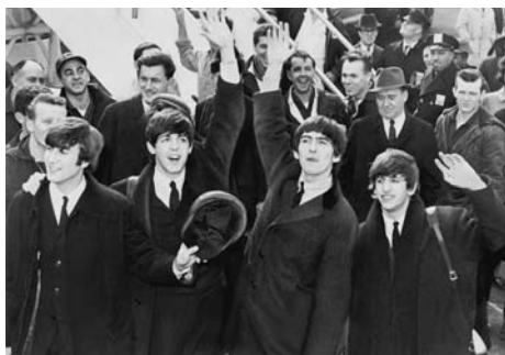
The Fab Four remain popular worldwide today

"Our recommendations are designed to help local and central government provide