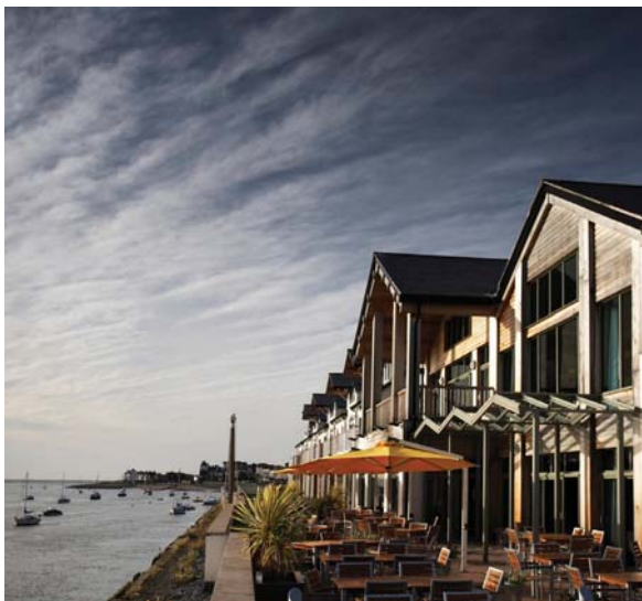
The site is owned by Albemarle Leisure and operated by Deganwy Quay

The hotel features a nine treatment room spa which uses products by Aromatherapy Associates and REN skincare. Treatments