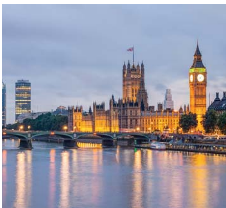
Overseas visitors' spend has doubled in the past decade

"Every single nation across Britain has seen an uplift in visitor numbers and, even