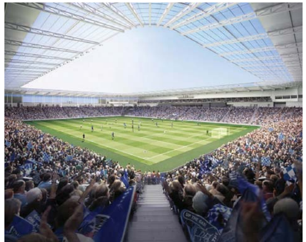
The club already has planning permission for the proposed new stadium

A Bristol Rovers fans' petition in support of a