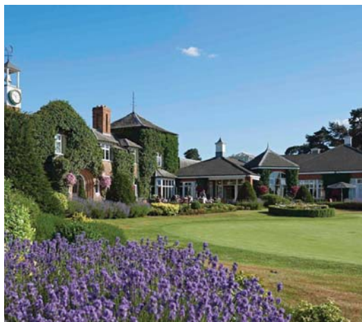
SIBEC UK 2014 took place at The Belfry golf course

Dand, meanwhile, pointed out that Everyone Active's new sister organisation – Everyone Health – demonstrated the industry was already making moves to engage with this new market. "But while it's possible for highly-trained fitness motivators to work across both the health and leisure sectors, less experienced staff currently lack the training required to be able to deal with subsequent challenges, such as working with mental health patients," added Dand. Details: http://lei.sr?a=Y6p9R