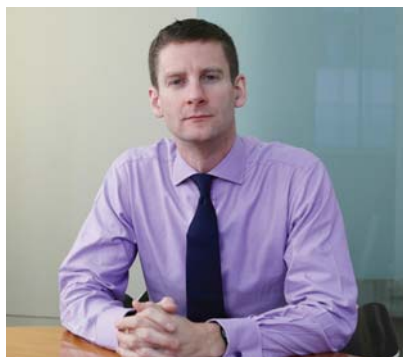
Graham is also a competitive triathlete

The course provides trainers with high-level TRX coaching and techniques to give clients results through driven workouts and the most recent science of functional training for tactical athletes. The Level 2 course delves deeper into the foundational movements of suspension training and features new exercises that were developed directly from work TRX undertook with thousands of service members of the armed forces worldwide. Details: http://lei.sr?a=U5E4y