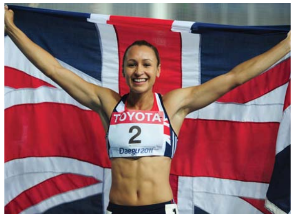
Female sporting success is still lagging at NGB board level

"I find it shocking that in 2014, we still have so few women in leadership positions in sport," she said. "Reaching a 30 per cent diversity threshold for NGB Boards by 2017 is