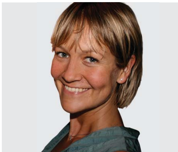
Cracknell says more talk is needed on 'how' people can exercise more

"How can people squeeze activity into their time and cash-strapped days? That's the key: making daily activity seem easily and enjoyably achievable. And where it starts is with a simple question: can you limit your sitting and sleeping to just 23 and a half hours a day?"