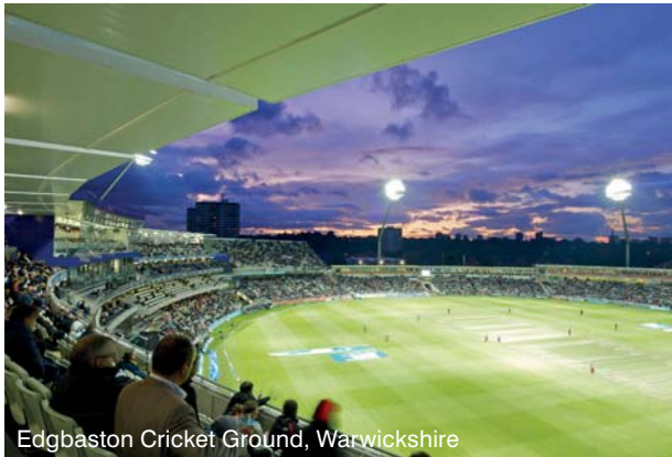
Edgbaston Cricket Ground, Warwickshire