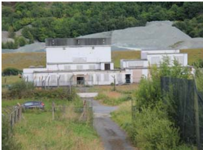
The former MoD site has fallen into disrepair

Penguin Ice Adventure has been five years in the making, according to Sea Life staff. Details: http://lei.sr?a=X6S2Z