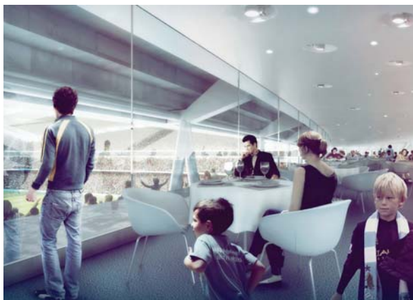
The images show various shots of the Etihad's new interiors

An integrated Laing O'Rourke Group team is carrying out the expansion – work began at the start of April. Interesting aspects of