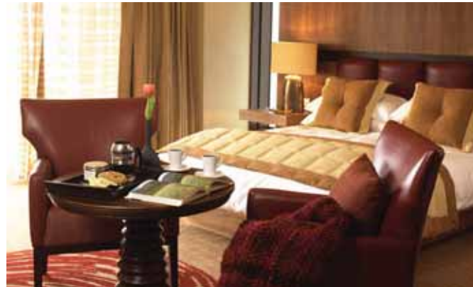
The number of empty hotel rooms is expected to rise in 2009

According to the PwC report, room rates and RevPAR for each quarter will continue to deteriorate over the course of the year, with the second quarter set to show a marked downturn. PwC's baseline