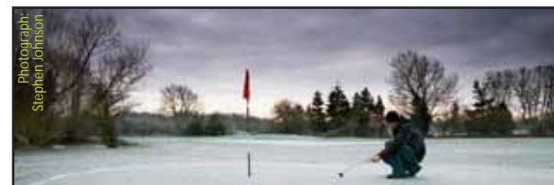
NEWBOLD COMYN GOLF COURSE