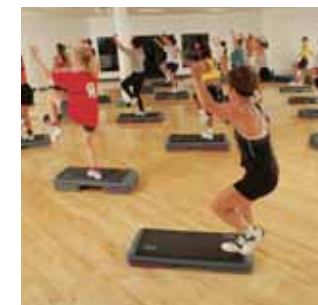
The centre is due to stay open

Prior to the final talks, Competition Line had supplied