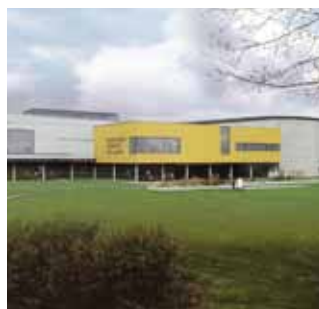
The new facility will include an Olympic-sized swimming pool

The new facility is set to include a 50m competition-sized swimming pool with a