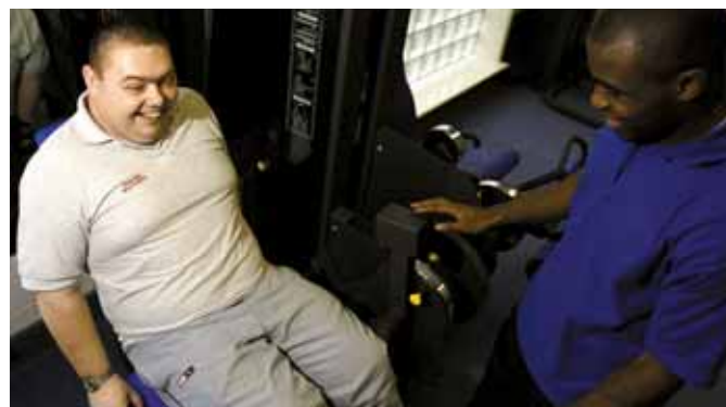
The IFI scheme will include creating more accessible areas at clubs

"We are thrilled to be working with the IFI in modifying