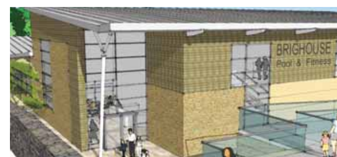
The Brighouse facility is one of two new pools that will be built