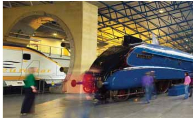
The National Railway Museum is in line for a grant worth £6.8m

A development grant of £227,640 has been awarded to Lincoln Castle, which houses