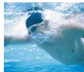
Public consultations have begun on the proposed centre

Proposals for the centre include a 25m, eight-lane swimming pool and a large learner pool with seating for 400 spectators, as well as a