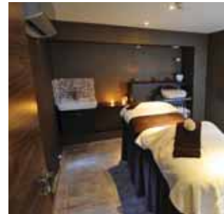
The spa will use ESPA products

The spa will use Guinot and ESPA products in its holistic