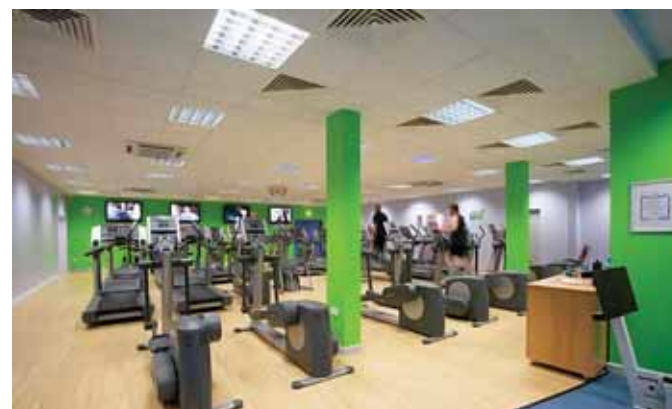
Blackbrook has already seen a significant increase in membership

Divided into three age groups, the classes offer guidance on how to eat and live healthily.