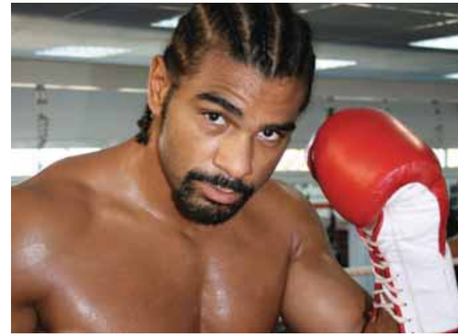
World champion David Haye is one of the trainers at Outbox

The channel's revenue stream will come from advertising, sponsorship, merchandising and a range of online activities.