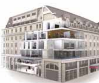
The Café Royal scheme is part of a wider £750m development

When complete, the property will form part of The Quadrant, a 93,000sq m (1 million sq ft) mixed-use development, including a revamp for the Regent Palace Hotel and Quadrant Arcade blocks.