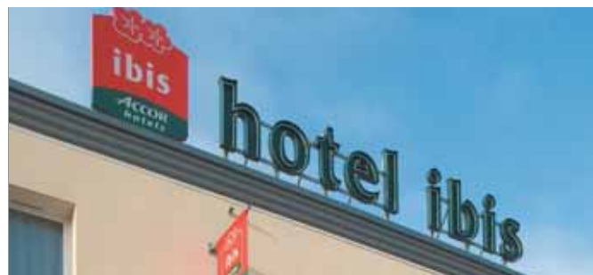
The hotel group is making budget cuts to balance a fall in profits