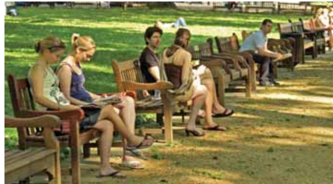
CABE wants funding from road building to be diverted into parks

According to Natural England and CABE, the creation of new, greener infrastructure in urban centres will lead to new, sustainable private-sector employment opportunities, as