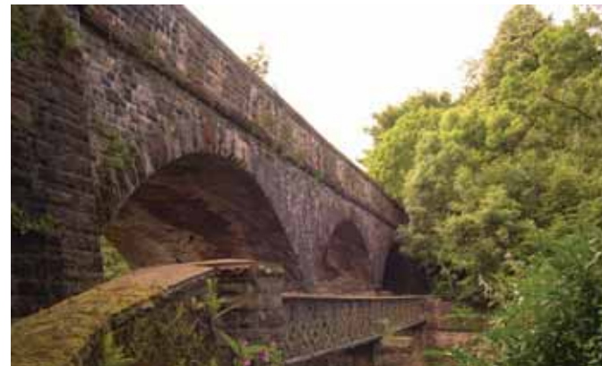
The former railway will be completely revamped as part of plans

In December 2007, Sustrans won £50m from the Big Lottery Fund's Living Landmarks: The People's Millions competition,