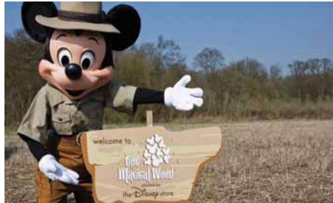
The Disney Store injects some magic into Hertfordshire woodland

From 2 April, Disney Stores will start selling reusable shopping bags featuring Winnie the Pooh and Piglet, with £1 from each sale to be donated to the Woodland Trust.