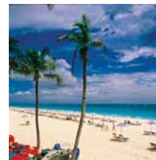
More than one million tourism jobs are under threat in 2009

It also expects 1.9 per cent of all jobs directly in the tourism and travel industry to be cut during 2009 – which translates to more than one million jobs.