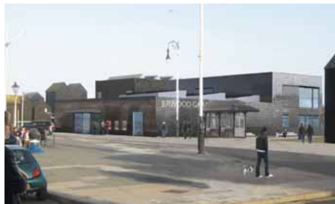
HAT Projects has drawn up designs for the new Jerwood Gallery

Designed by HAT Projects, the seafront building will boast more than 500sq m (5,382sq ft) of gallery space, a sculpture courtyard, an education space and a café with terrace, as well as a research and archive facility and offices.