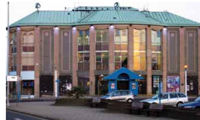
The council still intends to pursue the redevelopment of the site

WPBC said that it had no option but to seek legal action after Howard Holdings failed to submit a planning application for the project, while also offering no response to a demand issued by the council last November for £23,000 owed in consultant's fees.