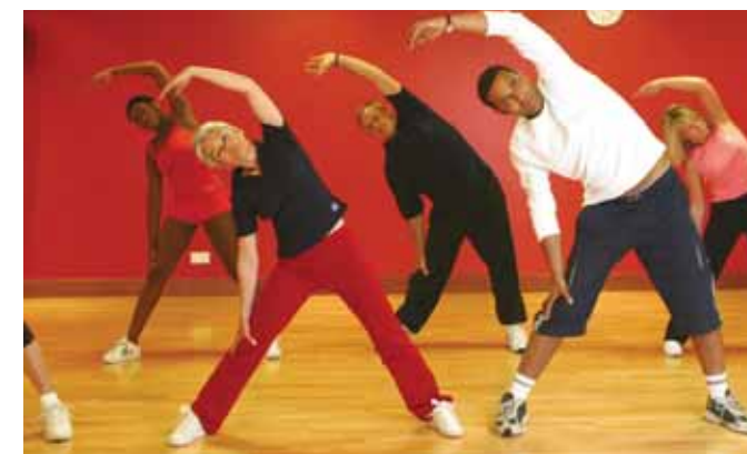
Physical activity levels were low compared with national statistics

The gloomy findings have forced the council to propose a leisure refurbishment project in collaboration with its current