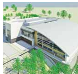
The plans includes a 25m pool

The council hopes to appoint a contractor by the autumn to allow work to get underway on the new Central Area Leisure Centre on a brownfield site called The Dimple.