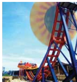
Paultons' new ride will reach speeds of 43mph (69.2kph)

Opening this Easter, Water Kingdom – a 8,500sq ft (789sq m) young children's splash park – will feature more than 20 ways of getting wet, including water jets, giant tipping buckets and a super soaker.