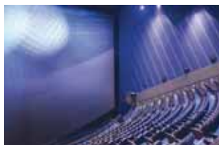
More than 53m tickets were sold at UK cinemas in 2008

The report revealed that big-budget movies such as Mamma Mia! and The Dark Knight helped British cinemas attract more than 50m visits for the first time in 40 years.