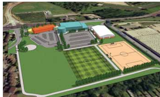
A hotel may also be included in plans for the new leisure centre

A fitness suite with 60 to 100 stations, a sauna and steam-room and a floodlit synthetic sports pitch will also be included, as well as a crèche, a soft play area, a café, a function area and dry and wet changing rooms.