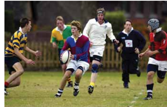
Rural communities will be targeted as part of the £10m initiative

"People in rural communities are the focus of the first round (of funding) because we know they face particular barriers to participation in sport, such as