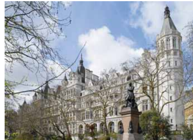
The revamped hotel was used by the secret service during WWI

However, Accor said it still plans to open 30,000 new rooms over the coming year, with a further 35,000 new rooms planned for 2010.