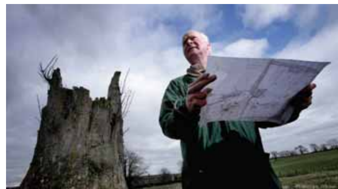
The 270-year-old plans were only rediscovered in a desk in 1980

It is rumoured that the plans that will be used at Kirkharle, which was the garden designer's hometown, were among the first Brown ever drew and had been forgotten about until they were rediscovered in 1980