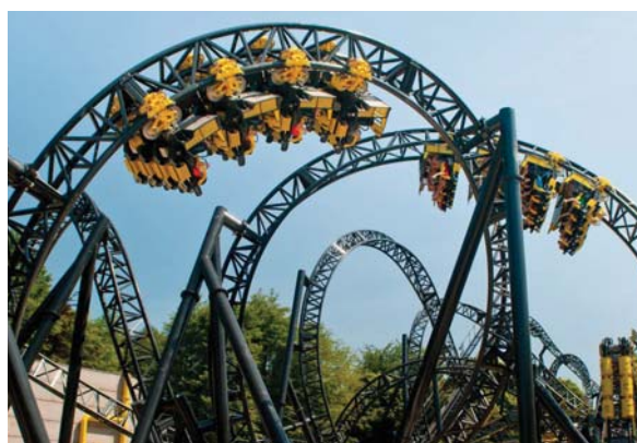
The Smiler accident has seen visitors stay away from Merlin's parks

"We anticipate some of these will be accounted for by a programme of non-replacement of existing vacancies, early