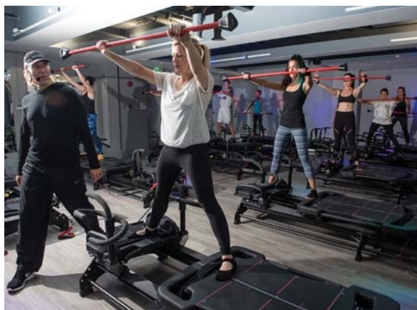
Lagree Fitness classes "burn maximum calories in a short time"

"The opportunity to bring the Studio Lagree brand and format to London presented itself with the recovery in the UK economy and the widely accepted boutique 'pay-as-you-train' format," Lepone told Leisure Opportunities . "As the sole provider of the Lagree Method in London, we