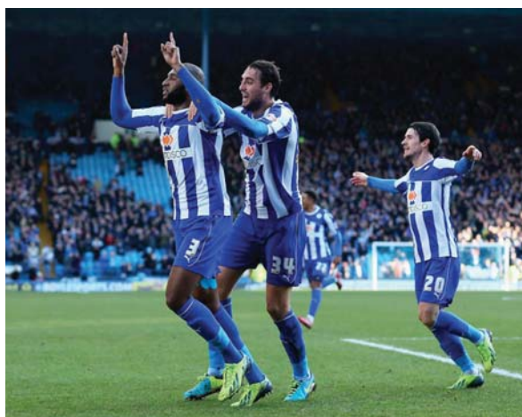
The move has been taken to project a 'uniform and modern identity'