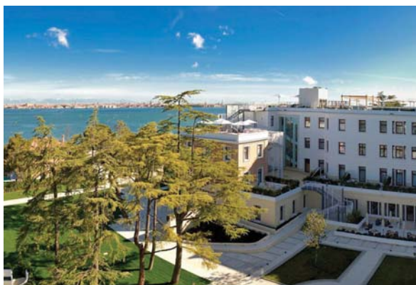
The JW Marriott Venice is one of 4,300 Marriott properties

Starwood has more than 1,270 properties in 100 countries, and operates and franchises the St. Regis, The Luxury Collection, W, Design Hotels, Westin, Le Meridien, Sheraton, Four