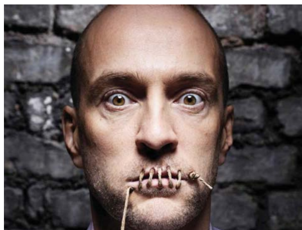
Derren Brown's Thorpe Park attraction will open in 2016

What is known about the attraction is it will feature multiple illusions. New technology will