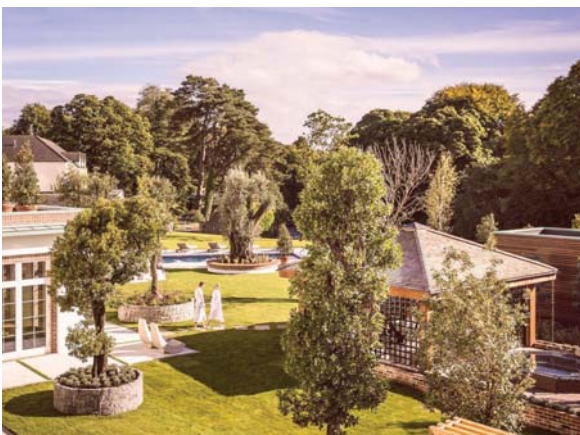
The Galgorm Resort & Spa now has 75,000sq ft of spa facilities

The new facilities complement the resort's already extensive thermal spa facilities, first opened in 2007, which include an infinity hydrotherapy pool, outdoor hot tub and whirlpool, laconium, herb caldarium, aroma grotto, ice fountain, sauna, experience showers and heated relaxation loungers. Products include Voya and Aromatherapy Associates.