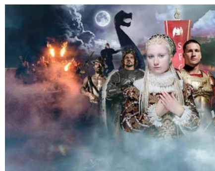
The show will be watched by 8,000 people a night

Playing out in front of the impressive backdrop of Auckland Castle, the 90-minute show – operated almost entirely by a cast and crew of more than 1,000 volunteers – will tell the