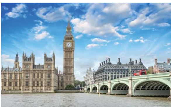
Ease of listing has aided Airbnb's rapid growth in the London market

Last month, Inside Airbnb listed 25,361 Airbnb units in London, 52.6 per cent of which were entire home units. The remaining Airbnb inventory comprised 45.8 per cent private room