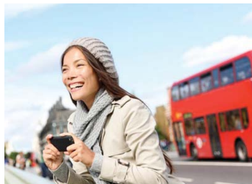
Photos of famous landmarks on social media help boost visitors

Almost 70 per cent of all respondents said content posted online by friends made them want to visit a destination. The influence of photos was highest in India, where 81 per cent agreed that seeing their friends' travel photos made them want to visit the