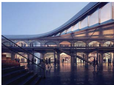
Heatherwick Studio's Coal Drops Yard project