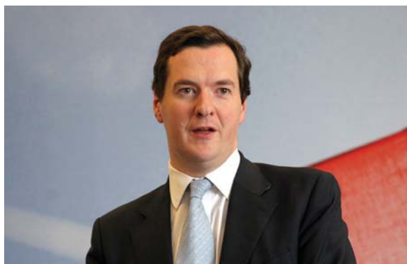
Chancellor George Osborne is expected to make a raft of spending cuts