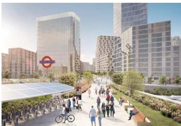
The scheme includes extensive regeneration around Willesden Junction

The Old Oak and Park Royal Development Corporation (OPDC), established in April, has been tasked by Mayor of London Boris Johnson with overseeing the planning of the project. The site will capitalise on the UK's development of the High Speed 2 and