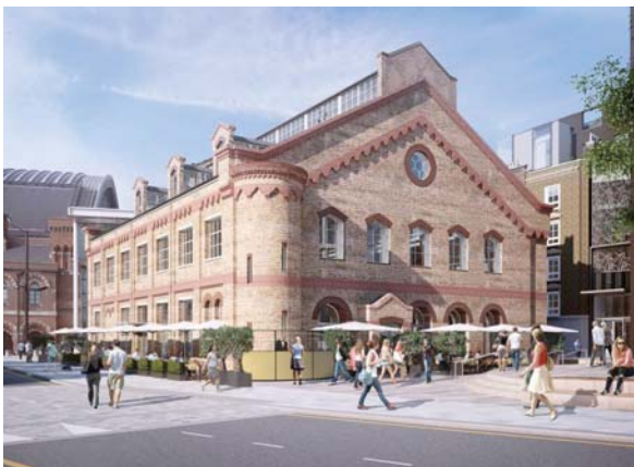
The Grade II listed building was a host for the 1866 Olympic Games

“We looked at the raw grandeur of German Gymnasium and wanted to create interiors that were glamorous and contemporary, but would also celebrate beauty found in unexpected places, in the same way as McQueen's work did,” said Norden. Conran and Partners' additions to the interior include two new