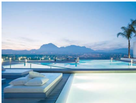
Spain's SHA Wellness Clinic won the Crystal Award for Europe