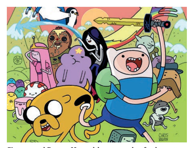
Simworx and Cartoon Network have teamed up for the venture

Attractions available under the new agreement will include Immersive Tunnels, 3D/4D effects theatres, AGV dark rides, RoboCoaster rides and fully themed, multi-experience attractions.