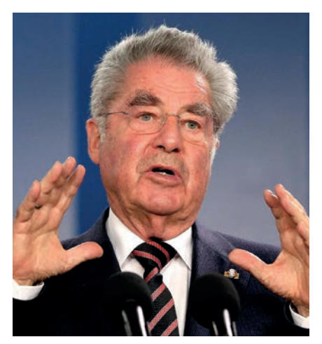
Fischer praised science centres worldwide

The President also praised science centres worldwide, calling them an essential extra layer in the school system that marries young people with science.