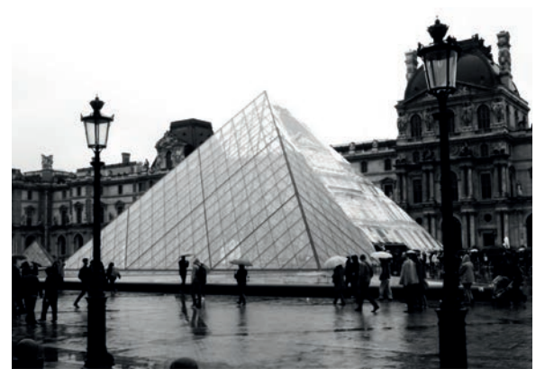
The Louvre closed to move its underground paintings to safety

Other visitor attractions have also been affected, with tourist boats banned from passing through the