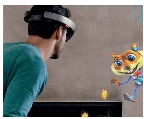
The operating platform will be available for all VR technology

Building on the existing Windows platform, Windows Holographic will include a range of bespoke components for virtual or augmented reality. Such features will include human-interaction systems, spatial mapping and special technology to best use the capabilities of the new software.