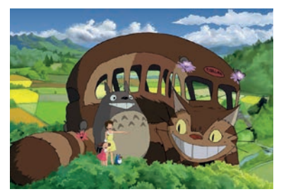
The catbus will be life-sized

"Dubai is an emerging entertainment destination with incredible potential and Vietnam is another exciting market where we believe the brand will be well-received." More:http://lei.sr?a=s9U2q_A