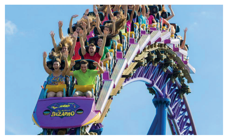
Six flags is looking towards the east using a franchise model

The operator – the world's fifth-largest, seeing an overall attendance increase of 11.4 per cent in 2015 to 28.5 million – is about to break ground on its first Six Flags in Asia. Six Flags Haiyan, not far from Shanghai,