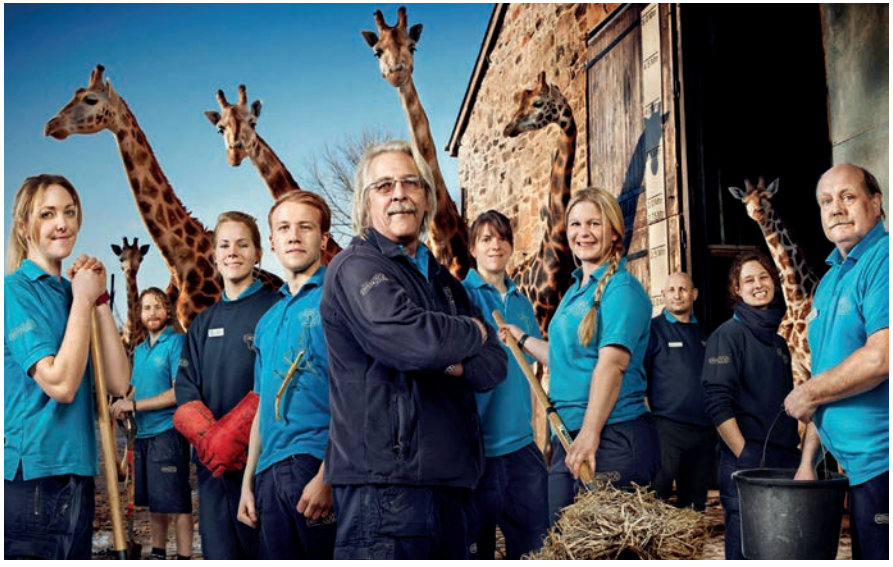
Attendance at the zoo increased by around 20 per cent in 2015, partly thanks to the series

Season one of the documentary series drew an average of 2.7 million viewers over a six-episode run. The show also proved popular on social media, trending on multiple networks each time it aired, estimated to be worth millions of pounds in terms of PR.