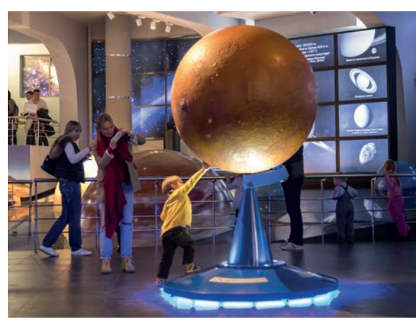
The UNESCO-backed initiative will be the first of its kind

Run as a joint initiative between major world