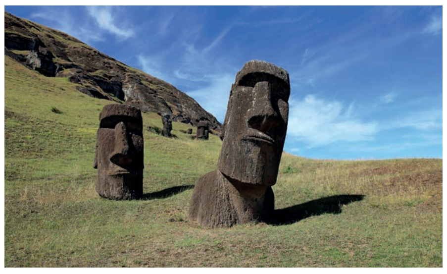
Some Easter Island statues are at risk of being lost to the sea because of coastal erosion

The report provides an overview of the increasing vulnerability of World Heritage sites to climate change impacts and the potential implications for global tourism. It also looks at the relationship between World Heritage and tourism, and how climate change is likely to exacerbate problems caused by unplanned tourism development, as well as other threats and stresses.