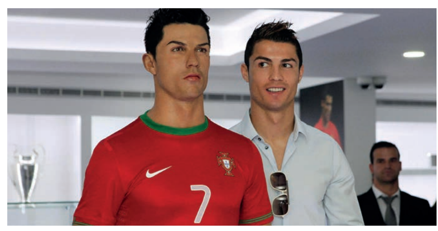
The museum offers 'new and improved access and the latest achievements of Cristiano Ronaldo'