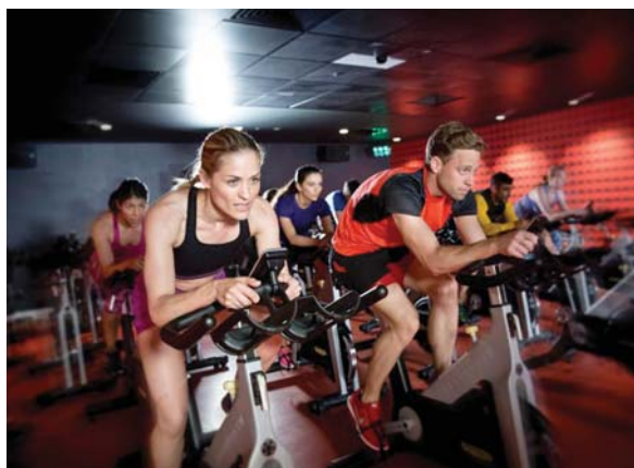
The gym chain was founded in the UK by Richard Branson in 1998