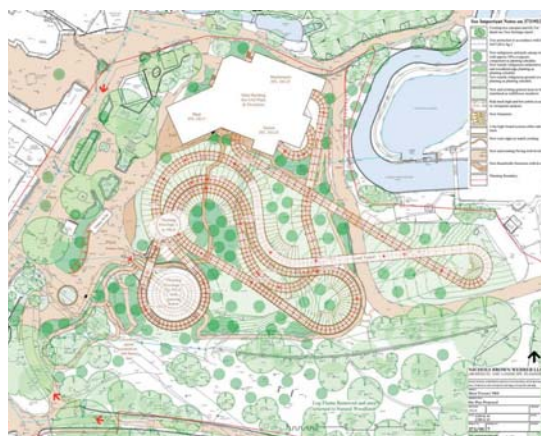
The plans show a wooden rollercoaster in place of the old flume

"To enhance the offer at the resort, it is proposed to remove the now dated Log Flume attraction and install a new rollercoaster to the west of the Congo River Rapids ride. The proposed new coaster