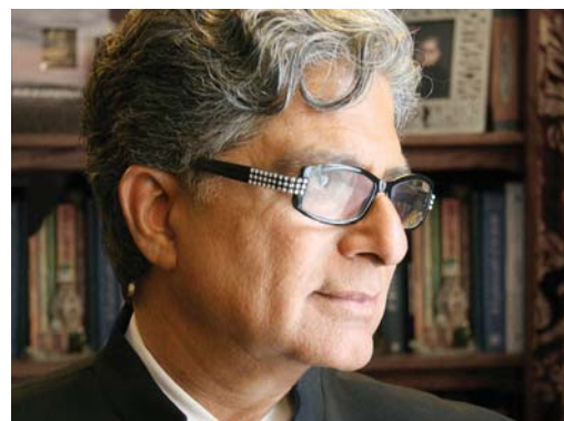
Physician, author and wellness expert Deepak Chopra

By focusing on the five pillars of wellness, including personal growth, exercise, nutrition, sleep and relationships, Jiyo aims to take a