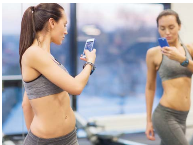
The rise of the gym selfie presents a major marketing opportunity

Facebook is the most common social media platform among the top 20 private brands, while Instagram is being under-utilised and neglected – only 8 of the top 20 have accounts. But despite the general upswing, the