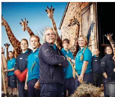
Zoo gate receipts jumped 20 per cent last year

Longleat, which has been touted as a possible location for the 2018 Glastonbury music festival, is planning to build on recent successes as it aims to facilitate growth over the next 10 years. The masterplan by Forrec aims to optimise the Longleat grounds based on the heritage management plan already in place, improving entertainment components and looking at strategies and layout to accommodate increasing attendance. Details: http://lei.sr?a=r7B6W_O