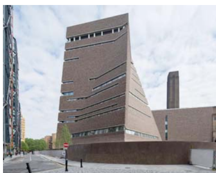
The extension has added 60 per cent of new space

New outdoor public terraces have been created, and a rooftop viewing point looks out onto the London skyline – including nearby landmarks such as Richard Rogers’ ‘Cheesegrater’, Rafael Viñoly’s ‘Walkie