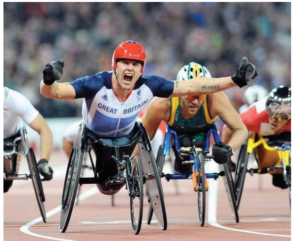
The IOC will support the IPC help it be more financially sustainable

IOC president Thomas Bach said the agreement was an "important milestone", adding: "The IPC's focus on sport for all and on high-level performance will enable it to reach more and more people around the world, and to ensure the organisation's long-term success."