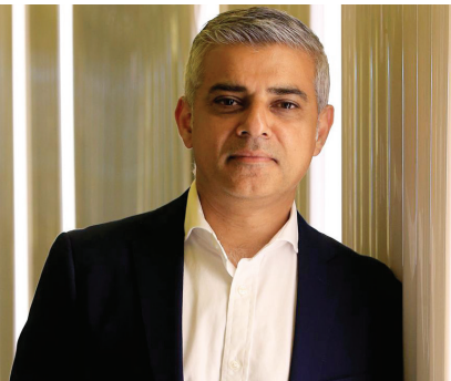
Sadiq Khan has declared culture a 'core priority'

New London mayor Sadiq Khan says culture will be as important as housing, transport and the environment in his administration. Speaking at the press opening of the new Tate Modern in the UK capital, Khan vowed to increase the number of cultural facilities and public spaces by "embedding culture in London's planning system." "For too long culture has been merely a nice-to-have," he argued. "We've got to change that." To achieve his ambitions, Khan said he would launch an infrastructure plan to increase public access to culture "in a way no world city has ever seen before."