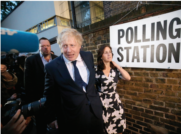
Leave backer Boris Johnson has been tipped as the UK's next prime minister

Leisure industry heavyweights have raised concerns for the future after the UK voted to leave the European Union (EU) following the referendum on its membership. In the wake of the narrow win for the leave camp – 51.9 per cent to 48.1 per cent – the London stock market plunged, with the FTSE 100 index falling more than 8 per cent in the opening minutes of trade. Prime Minister David Cameron has also announced his intention to resign as the country's leader, promising to step down by October of this year. The value of the pound plummeted as the results started coming in, at one point hitting US$1.3236 – the lowest numbers since 1985. The euro also suffered, marking its biggest one-day fall since the currency's inception with a 3.3 per cent drop. The weaker pound means it becomes more expensive to buy products and services from abroad. For the UK's exporters however there