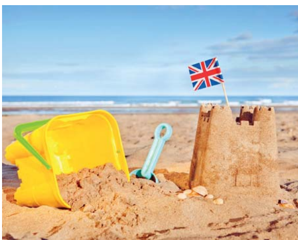
The 2008 recession introduced a trend for increased domestic tourism

“Domestic tourism will increase due to the fall in sterling combining with people’s uncertainty and concerns regarding the