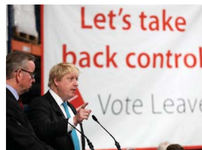
The UK will miss out on key EU culture funding