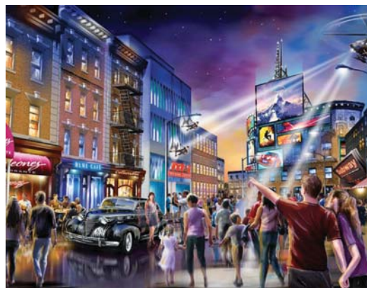
LRCH is insistent that work is progressing as scheduled

"We have decided that, given some of the