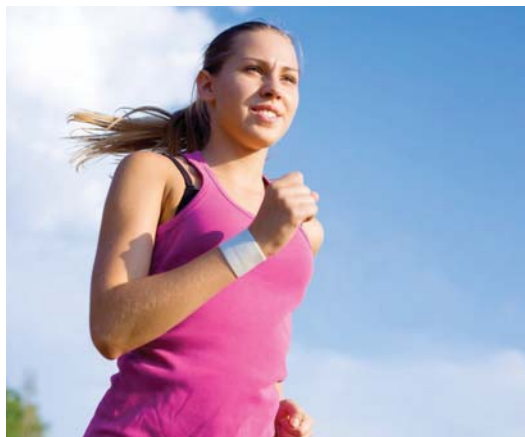
The number of women taking part in sport increased by 261,200

Running and athletics continued to see growth, with a 6 per cent boost in participants to 2.35m. Over the 12 months, mountaineering,