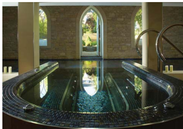
Mark Green of Curveline Design was responsible for the design

In addition to the spa's existing Relaxation Pool, The Bath House has been installed with a Vitality massage pool, a Himalayan salt-infused sauna and a new Blossom Steam Inhalation Room with soothing steam and fresh aromas of eucalyptus and menthol. The hotel's spa therapists use the Bath Spa Skincare and ESPA brands.