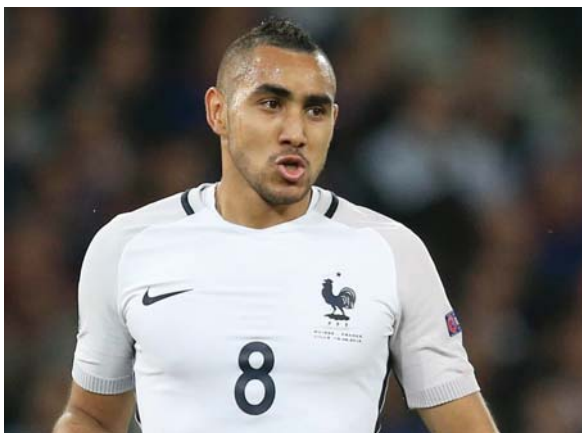
European footballers would need work permits to play in the UK