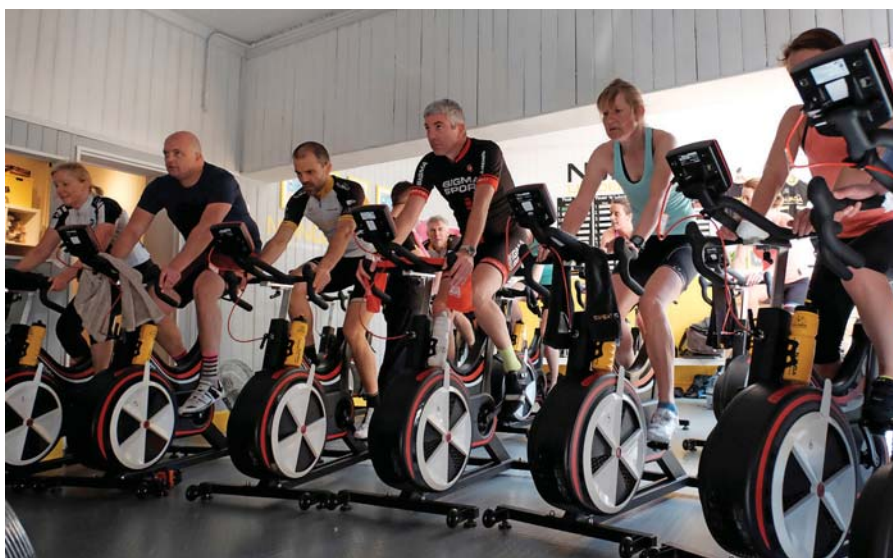
Njinga Cycling offers a Wattbike performance lab for training and testing