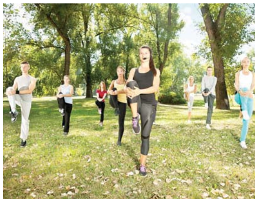
The new course helps exercise professionals move outdoors

"As an awarding organisation at the forefront of qualification development, Active IQ works closely with approved centres to address emerging skills gaps. The three new qualifications provide engaging and informative courses for fitness instructors or personal