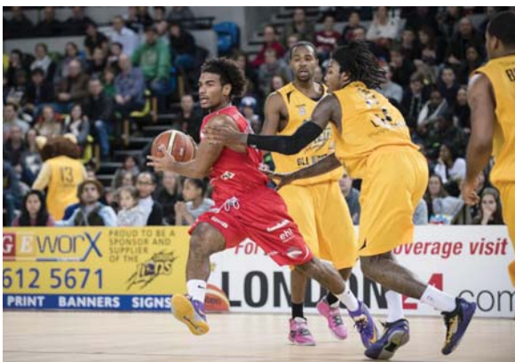
The Leicester Riders opened their own £6m facilities earlier this year