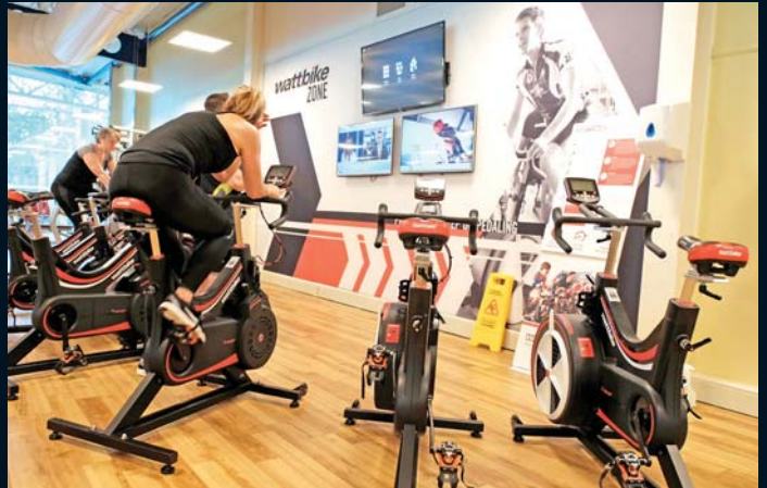
While some clubs are opting for dedicated Wattbike studios, others are creating special zones on the gym floor

researching indoor bikes we kept coming back to Wattbike. The build quality, the sports science and the amount of data and feedback for the riders is phenomenal. When we planned the studio, we knew that we would be catering for a lot of cyclists, from beginners through to professionals. It therefore made sense to transform the space to reflect Wattbike, because it is such a well-known, and respected brand within the sport and the industry.