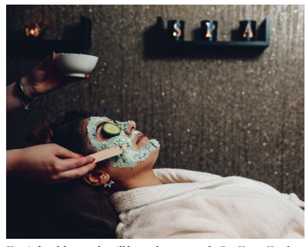
Hop-infused face masks will be on the menu at the DogHouse Hotel

In an attempt to disrupt traditional financial models, BrewDog launched its 'Equity for Punks' programme in 2009, allowing its fans to invest in the company while enjoying exclusive perks. So far, 55,000 people have invested in the business, contributing more than £40m (US$48.6m, €46m) to the company's expansion – including the upcoming 100,000sq ft (9,290sq m) facility in Columbus, which is scheduled