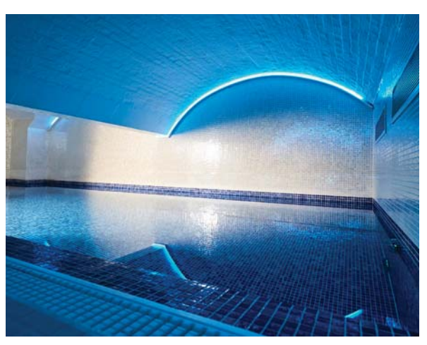
The underground urban retreat will offer a range of treatments by ESPA

ESPA products and holistic treatments will be available, alongside signature Harbour treatments, spa ritual experiences including the 160-minute Ocean Spa Ritual, holistic and advanced facials, specialised body massage