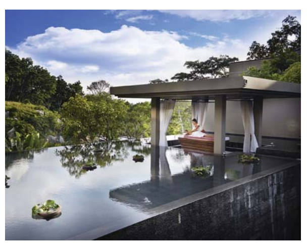
Aqua Spa features eight treatment rooms and two al fresco cabanas

With eight indoor treatment rooms and two al fresco cabanas, signature treatments include the Aqua Signature Massage, which uses a specially crafted blend of massage