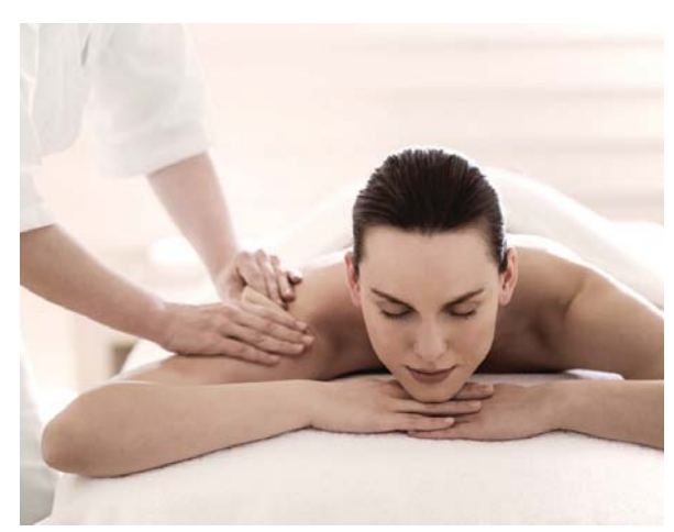
1 Hotel Brooklyn Bridge will feature a nine room Bamford Haybarn spa

Based on the connection with nature, guests will be able to choose from a selection of holistic treatments, services and classes using natural restorative ingredients, and designed