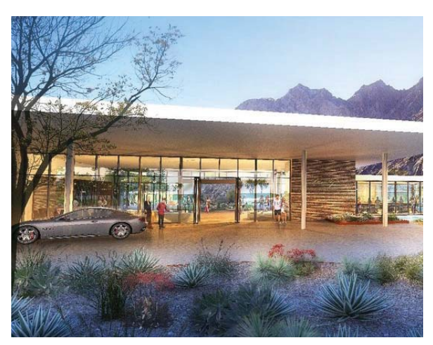
The two properties will feature a mid-century modern design aesthetic

The Montage La Quinta will include 140 guestrooms as well as the signature Spa Montage and fitness centre, a recreation centre, resort pool, and 29 four- and