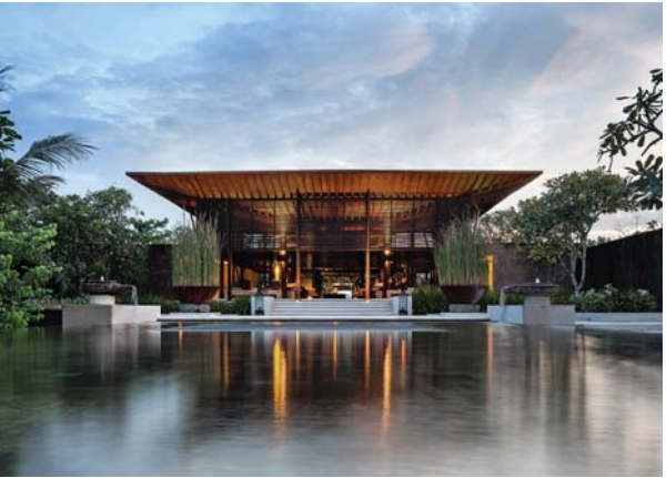
The Soori Spa will offer a range of treatments by visiting wellness experts

The design melds natural elements with traditional and contemporary design features, including local volcanic stone as the foundation for the resort's buildings.