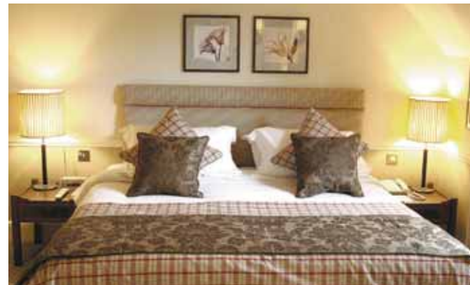
Nearly 200 per cent more hotels became insolvent in Q1 2009

Although the results will be welcomed by camping businesses, hotel operators