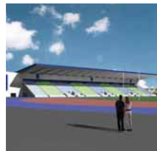
Facilities include a physio suite

Facilities at the stadium, which will be used as a training ground for the Glasgow Warriors rugby team, include a grass training pitch, a 3G all-weather training pitch, a strength and conditioning suite,