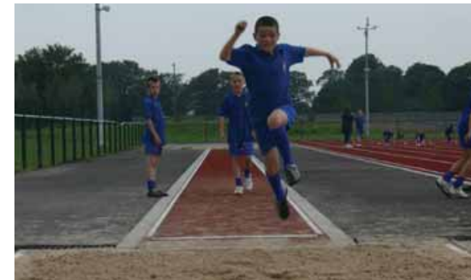
Proposals for the new dual-use complex include athletics facilities

Planned outdoor facilities include an athletics track, cricket pitch, BMX Track,