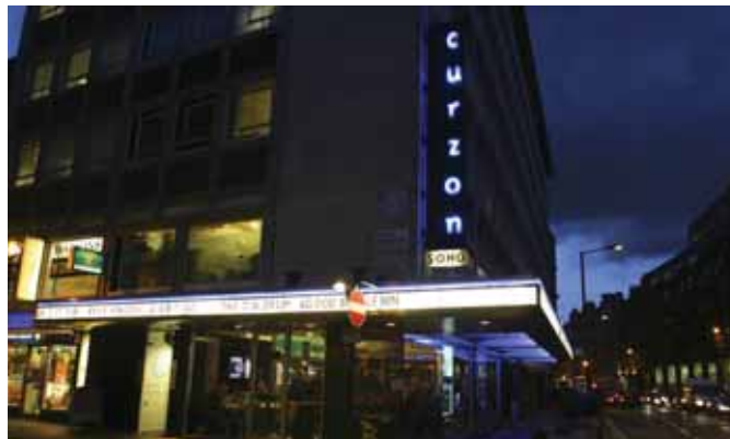
The hmvcurzon concept will be piloted at a London HMV store

The cinema will feature a café-bar and a merchandise area and will be equipped with the latest digital film technology.