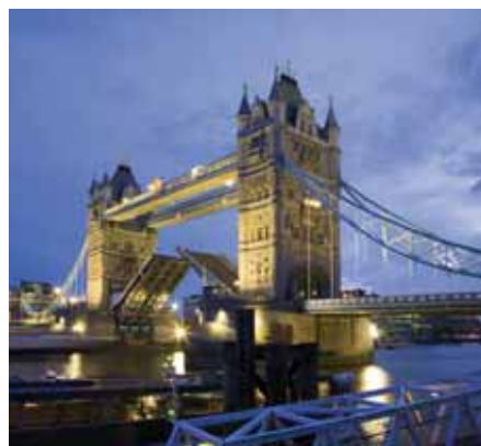
Visitors to London have risen by 2 per cent