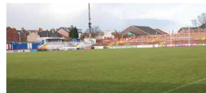
The Wildcats are looking to move away from the Belle Vue ground