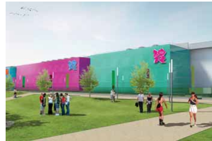
The planned media facilities have been likened to sheds by CABE