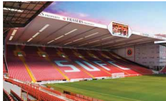
Bramall Lane could eventually boast a capacity of above 40,000

A planning application for phase two of the development is expected to be submitted in the near future and it is understood that the proposals will include the extension of the Valad Stand and development of the car park, ultimately taking the potential capacity to more than 40,000.