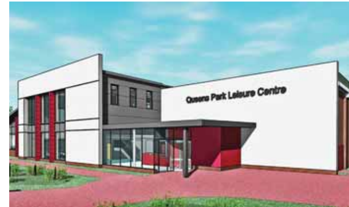
The council has opted to build a new facility including a 25m pool

The existing sports hall, which is relatively modern compared with the Victorian baths, will be refurbished to provide new fitness studios and a multi-purpose function room,