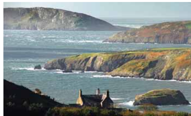
The Llyn Peninsula is one area that is earmarked for HLF funding

Among the six latest areas to benefit from HLF support is the Llyn Peninsula in Gwynedd, North Wales, which has been awarded a first round pass of £753,200 to preserve its cultural and linguistic heritage.