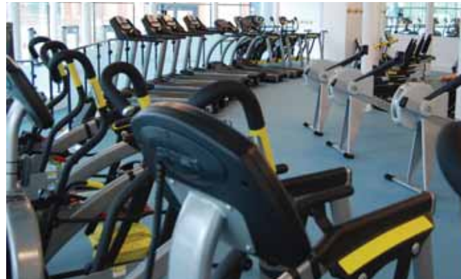
The gym includes 75 stations of equipment supplied by Cybex

In addition, there are also two spa rooms, a fitness pool, massage facilities, conference and meeting rooms and a licensed restaurant. To cater for the visually impaired users, and as part of the college's aim to become IFI accredited, the