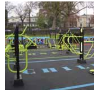
The gym is targeted at youths

Suitable for all ages and particularly targeted at young people, the new equipment has been funded by a £95,000 grant from NHS Nottingham City, which has been working in partnership with Nottingham