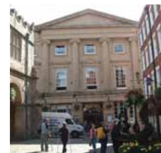
A new museum will be created

The Shropshire Portal scheme will include the development of a new, sustainable museum and visitor information centre at the 13th century, Grade II*-listed Vaughan's Mansion