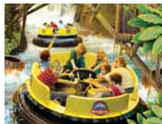
Merlin's visitor numbers are up

In its first set of full year results since the acquisitions of Gardaland and The Tussauds Group, the company said that visitor numbers continued to increase by 28 per cent compared with 2007, despite