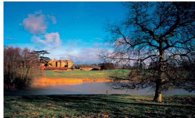
The spa is separate from the hotel within its 200-acre grounds

The spa is situated in the newly-refurbished Coach House, in close proximity to the main hotel. It boasts six treatment rooms, a hair and pedicure studio, thermal rooms and relaxation areas.