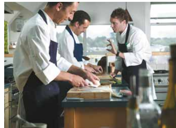
The NAS aims to ensure young people can access apprenticeships

Developed in Scarborough, North Yorkshire, STEAM is a mathematical model that has been adopted by a number of local authorities to monitor all aspects of tourism activity, including visitor numbers and expenditure