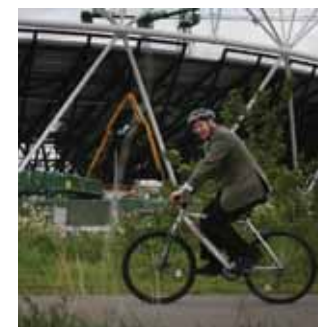
The Duke of Gloucester kick started the JWT's project

A number of London's visitor attractions and iconic land-