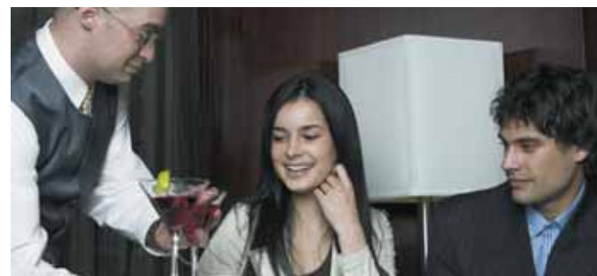
BHA is fearful of the effects the costs could have on the industry