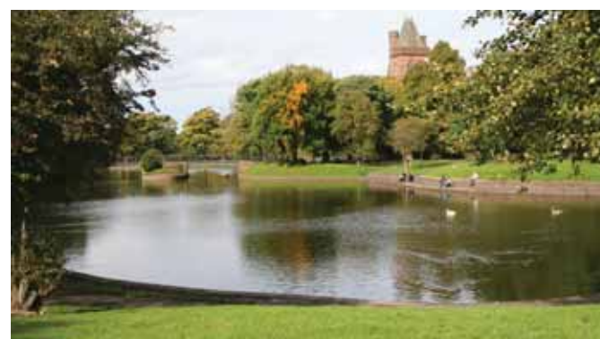
Newsham Park is one of the sites that will undergo improvements

Croxteth country park as well as Sefton Park and Stanley Park will undergo restoration work as part of LCC's plans, while Newsham Park in Fairfield, Springfield Park in Knotty