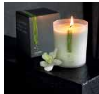
Take-home candles are offered

The Mandarin Oriental Signature Spa Therapies have been created in consultation with specialists in Traditional Chinese Medicine and master aromatherapists. Each signature therapy will consist of a body