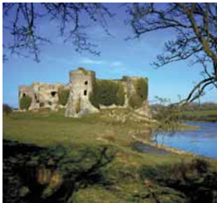
Heritage sites will become more accessible

Cadw - the guardian organisation for Welsh heritage sites - plans to work with communities, heritage partners and the tourism sector to create heritage tours, trails and events packages. The organisation intends to expand the visitor experience beyond individual heritage sites, to connect with the local community and