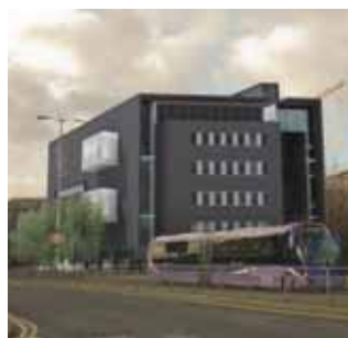
The centre is set to host new dance degree courses

The new six-storey venue, designed by the Strategic Design Alliance, a partnership between Leeds City Council's (LCC) in-house architectural consultancy and Jacobs Architecture, will also house Leeds Metropolitan University's new dance degree courses.