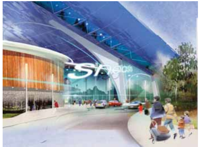
The SnOasis scheme has already been seven years in the pipeline

As a result, the developer now faces the prospect of having to fulfil all reserved matters before work can begin on site, which it says will take two years to complete at a cost of £15m, unless the condition is waived.