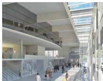
Leeds United is looking to increase non-matchday revenues at the stadium

Designed by London-based architects KSS, the Elland Road scheme includes two new hotels and an arcade extension incorporating retail facilities, a club shop, a restaurant and conference and banqueting space. The project, which is designed to provide increased commercial opportunities for LUFC, as well as forming part of