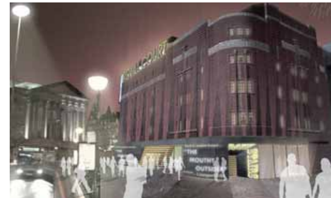
Trustees selected AHMM's designs for the new-look Royal Court