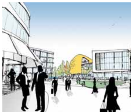
Council plans include a new public square