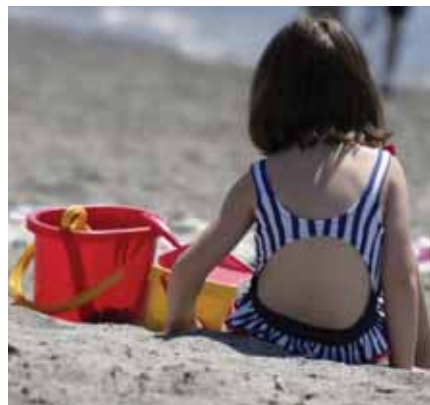
The beach is coming to central Nottingham