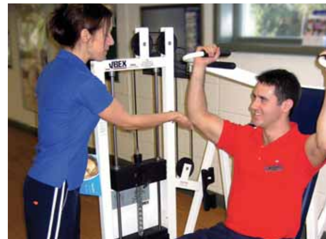
Funding will be made available to firms over the next two years

The CSO figures also revealed that the number of Irish residents travelling abroad also dropped by 15.4 per cent to 563,700, which has resulted in a 12.6 per cent fall in overall outbound travel in the first three months of the year.