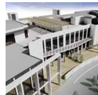
Plans include 12 sports courts

Plans submitted to the Vale of Glamorgan Council include a new sports centre comprising 12 sports courts plus two squash courts; an eight-lane, floodlit athletics track; 12 outdoor sports pitches for