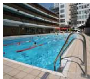
The two swimming pools will be revamped later this year

Meanwhile, the centre's fitness suite re-opened on 12 May following the installation