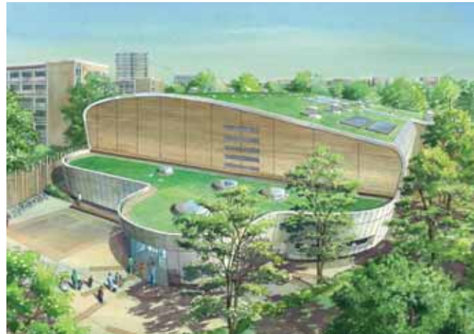
The £4.3m leisure complex has been designed by LCE Architects

The complex, which has been designed by LCE Architects, includes a 30-station, 172sq m (1,851sq ft) fitness suite equipped by Matrix Fitness Systems, as well as four badminton-court sports hall, a multi-use dance and exercise studio and a training suite with