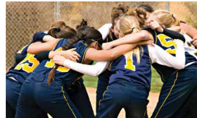
Falling revenue is threatening the survival of clubs across the UK

Financial constraints are also forcing almost half to consider reducing spending on coaching, kit, facilities and community