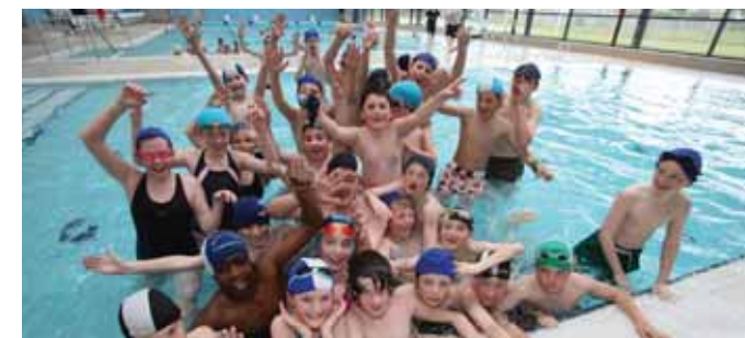
The Meadowbrook centre includes a 25m, six-lane swimming pool