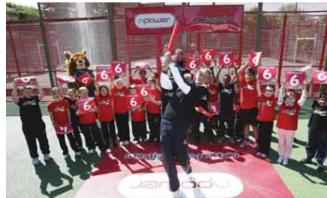
England cricketer Stuart Broad helped to launch the new facility

It is the fourth of five sites planned in cities across the UK as part of the scheme, which also includes the creation of five urban cricket zones in local school playgrounds in a bid to provide additional areas where the sport can be practiced.