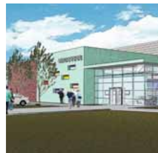
The centre will open in 2010

The scheme includes a refurbished gym with upgraded equipment and studio facilities, improvements to toilets and changing rooms and the introduction of a new crèche and soft play area. The six- to eight-month