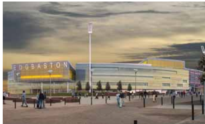
The completed venue will be able to hold around 25,000 people

The new stand has been designed to provide improved facilities for both spectators and players, with new changing rooms, bars and restaurants planned, as well as upgrades to corporate hospitality offerings and the media centre.