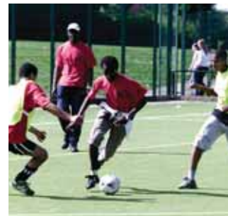
£5m is available for new ideas

National Lottery funding will be offered to as many as 20 of the most inventive ideas, which help to remove barriers preventing participation, develop new ways of exploiting