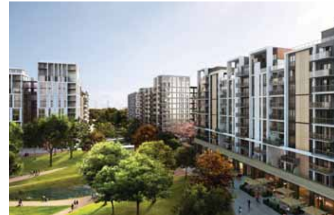
Olympic bosses hope to recoup the cash through the sale of flats

It now means that taxpayers have contributed a total of £650m to the Olympic Village project. Organisers hope to recoup the latest cash injection through the sale of flats after the 2012 Games.