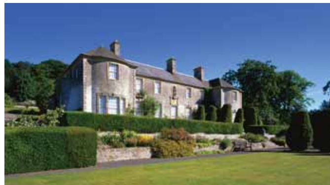
The cuts include the closure of Fife's Hill of Tarvit Mansion House

The union's attack has been compounded by criticism over funding for the Robert Burns Birthplace Museum project, which is putting the charity under pressure to find a £3.8m