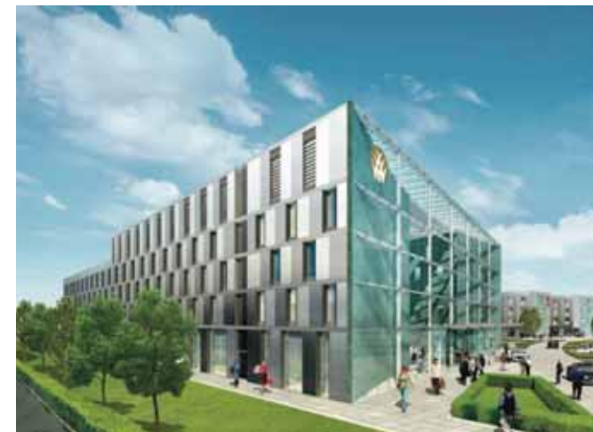
Two new hotels will be built on the site of a former Thistle Hotel