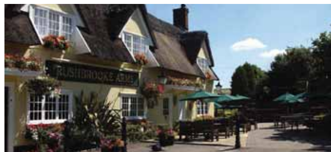
The committee has recommended an investigation into beer-ties

The Metropole Building, originally constructed by the Gordons Hotel Company in 1883, has been leased by the government since 1936 for use by various departments such as the Ministry of Defence.