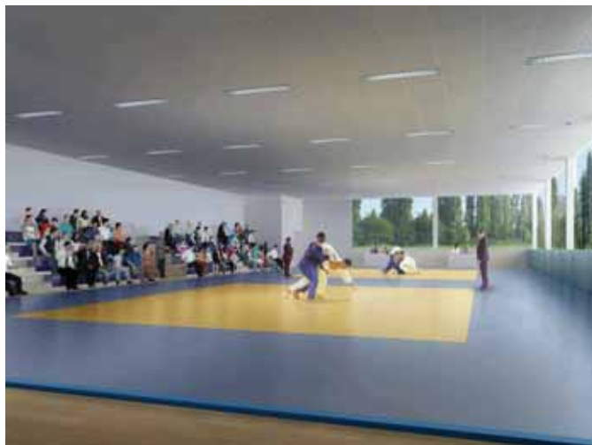
A martial arts dojo among the new facilities included in the plans

The scheme will be centred around a new park with a series of outdoor 'rooms', each with a dedicated use – such as sport, cultural activities, bio-diverse planting and wildlife.