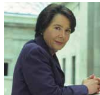
Forgan unveiled the proposals

The new proposals were unveiled by chair Dame Liz Forgan on 24 April at an ACE-sponsored seminar looking at ways in which the importance of arts and culture can be maximised during the recession.