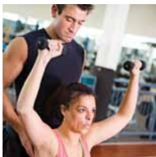
The sector has benefited from additional government support

The number of new public and private fitness facilities has also increased by 114, while one in eight consumers