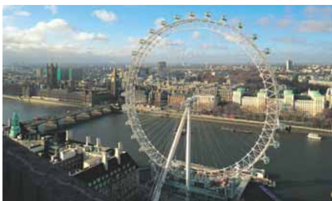
The work will help to improve the London Eye's visitor experience

A temporary capsule, which will not carry passengers, will be used to replace whichever pod is being upgraded.