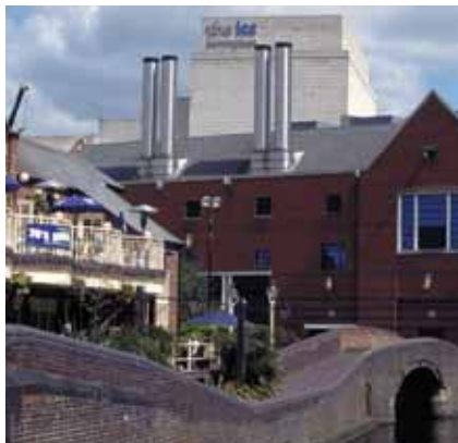
Birmingham is in line for a tourism boost