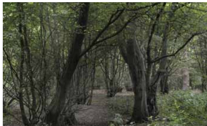
One scheme is aimed at getting more people visiting woodland

The Woodland Trust has been awarded £1.2m by Natural England in order to establish the VisitWoods project, which will include the creation of an online database of