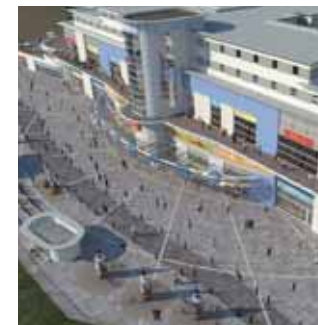
The £48m complex has been delayed due to the recession

The Lifestation@Tropicana project, which was approved by North Somerset Council's (NSC) West Area planning committee in October, had been set to get underway later this year as part of a wider scheme to revamp the town's seafront.