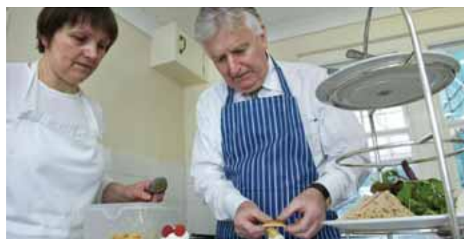
Gastronomic experiences will be used to tempt tourists to Wales