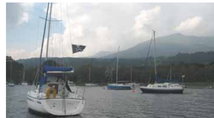
The review will assess redesignation of National Park boundaries

Although Natural England postponed its designation last year during a public inquiry into the South Downs National Park, the planning inspector has supported the designation of national parks around more