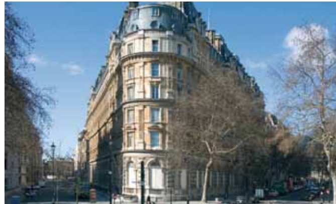
The property has been previously used by the Ministry of Defence

The property, to be called The Corinthia Hotel & Residence, will be the first investment IHI has made in the UK and will accompany its portfolio of hotels located in Malta, Libya, Portugal, and Russia. The five-star, 283-bedroom hotel is