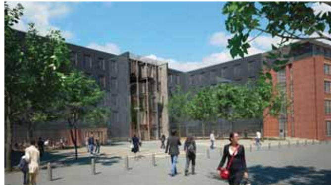
Plans include the refurbishment of the former Kettleworks factory