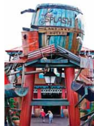
Alton Towers has two hotels, with one featuring a waterpark

"Over the next 10 years, many millions of pounds will be invested in the resort - on its infrastructure, rides, attractions, heritage, peripheral activities, and further accommodation."