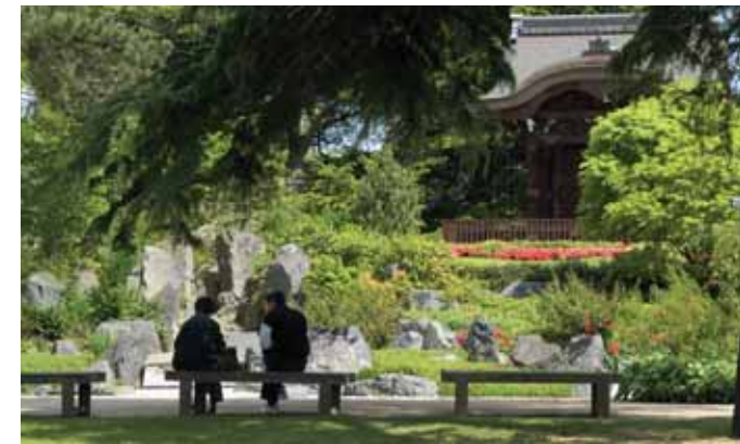
The masterplan is being created by Landscape architect Gross Max

Kew's role as a living botanical collection will also be evaluated, along with how the garden is being affected by collections growing and changing. It has been reported that a new river approach to Kew Gardens, with an adjacent dock, could be included as part of the plans as well as the