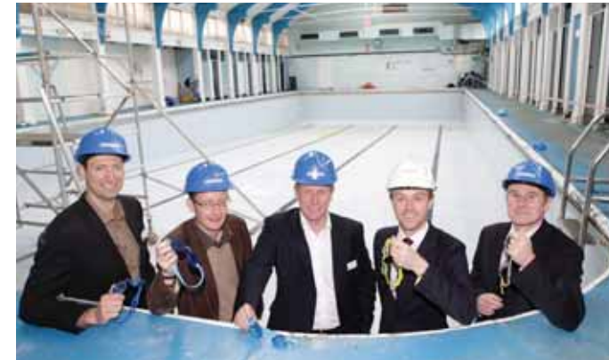
The 27m swimming pool and gym will be given a new lease of life

Although the centre's swimming pool, crèche and rear studios will be closed until spring 2010 to enable the refurbishment to be carried out, the gym will remain open.