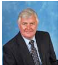
ALUN FRED JONES is Welsh Assembly Government minister for heritage

Wales can offer real value for holidaymakers this summer