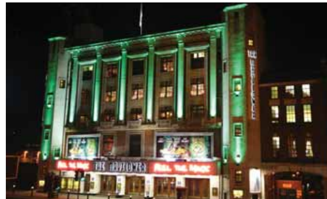
Backstage facilities at the Mayflower Theatre are to be improved

It is expected that the new backstage area, which will include a new facility to store scenery, will be fully operational by spring 2010, ensuring the venue can cope with the evolving demands of touring productions.