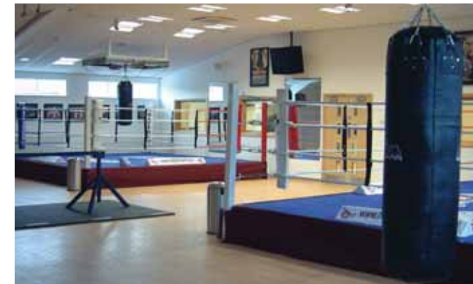
The boxing studio features two rings, punch bags and speed balls

Facilities at the centre, which had already secured more than 300 members ahead of its opening, also include a refreshment area, a shop selling Hatton's clothing line, a