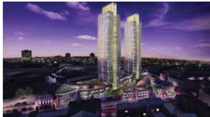
The initiative would have included an arthouse cinema and cafés

The project included two new entrances for Clapham Junction railway station, capable of accommodating a 1.6 million increase in users, as well as a two-level pedestrian street with cafés, bars and a 1-acre rooftop garden with restaurant and an arthouse cinema.