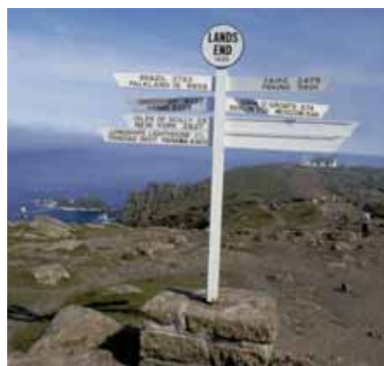
Visits to the area are likely to fall in 2009