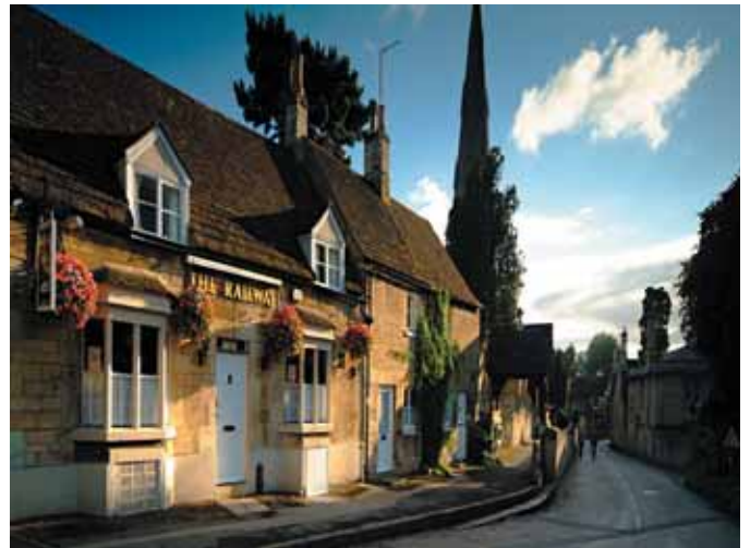
England's pubs will no longer be an untapped resource for tourists

"They are often the cornerstone of a local community and a great way to discover more about a destination, be it the produce on the menu, the history of the people and surroundings, or the great walks and activities in the area," she added.