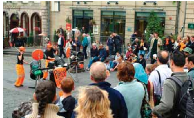
The new centre will aim to teach a range of expressive skills

Along with Luton's International Carnival, the centre is set to contribute more than £34m to the regional economy. It is expected to attract national and international visitors, from artists and creative entrepreneurs to school children and the local community.