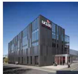
Plans include a new sports hall

The new complex will feature a sprung timber sports hall with more than 300 retractable bleacher seats and a viewing gallery, able to accommodate