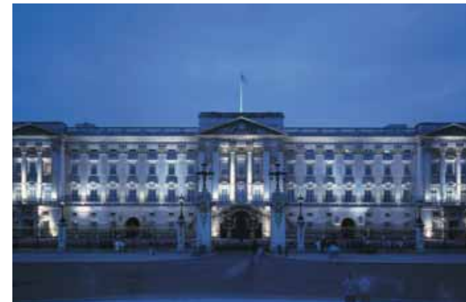
The palace is currently open to the public for 63 days every year

According to the report, the condition of the Victoria and Albert Mausoleum at Frogmore House near Windsor Castle, Berkshire, has deteriorated to such an extent that English Heritage has placed it on the