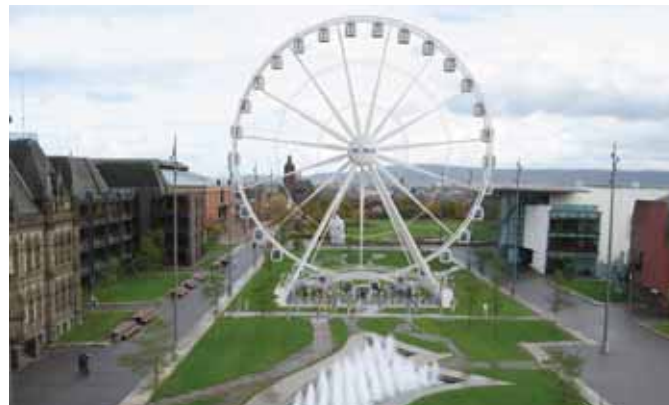
An artist's impression of how the site of the wheel would look

However, the council has now confirmed that the