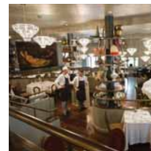
The restaurant has been themed with theatre props

occupancy figures for London are indicative of the capital's resilience to virtually every kind of economic, political, biological and climatic turbulence, hoteliers are clearly sacrificing margin in order to fill their beds. The longer the recession continues, the more it will eat into margins and the harder it will be for hotels to survive."