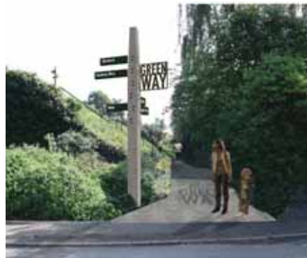
The 1.4-mile walkway will open in 2011

Work on the Greenway cycle and walking route is underway in east London, with completion scheduled for 2011.