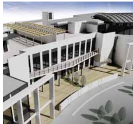
The site includes a large leisure element

A 25m, eight-lane swimming pool will also be built to Amateur Swimming Association (ASA) standards, while a crèche on site will accommodate the needs of the military personnel with any available spaces being open to community use.