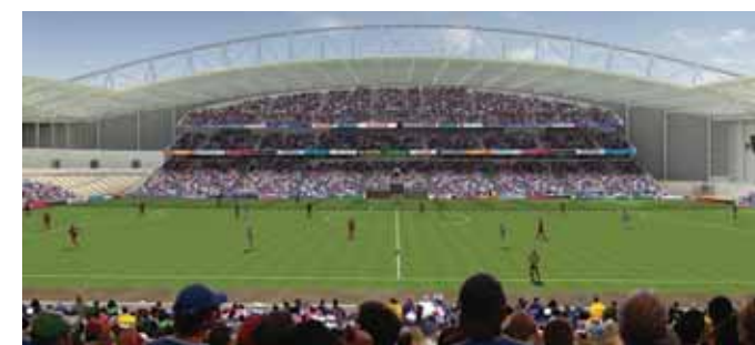
The new Falmer Stadium is to open ahead of the 2011-12 season