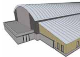
The £1.3m complex will replace St Davids Swimming Pool

PCC has already invested in a new multi-use games area and the upgrade of three tennis courts at the site, while further work is due to be carried out to improve the exterior of the adjacent secondary school.