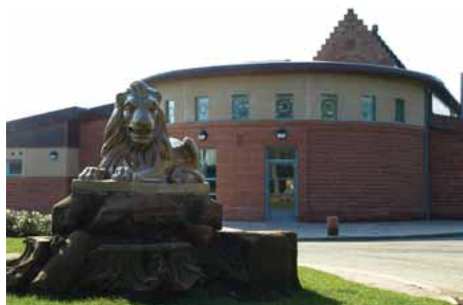
The facility will include a vast archive of Robert Burns' works

It is anticipated that the Burns Monument Centre, which has been inspired by the 250th anniversary of the poet's birth, will make it easier for local residents, as