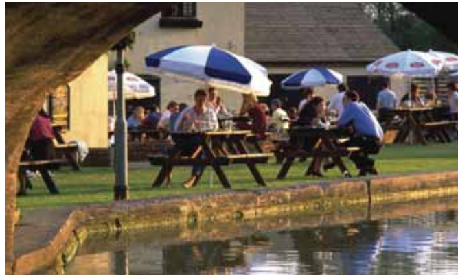
Warm weather encourages people to spend more during summer

A further 43 per cent of people said that the warmer weather encouraged them to feel more relaxed with their