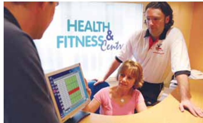
The survey aims to assess how the industry can attract new staff

"One of the survey's aims is to find out whether the industry is doing enough to