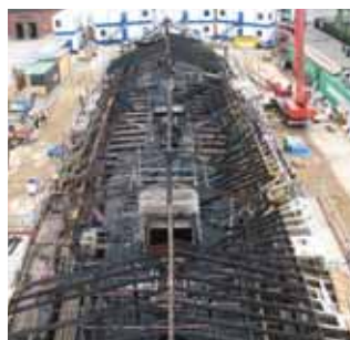
The historic tea clipper was damaged by fire in May 2007

A £25m restoration project was already underway to protect the ship from corrosion and to make it more accessible to visitors, but the fire – which was caused by an industrial-sized vacuum cleaner that had been left switched on – has now added a further £10m to the scheme's original cost.