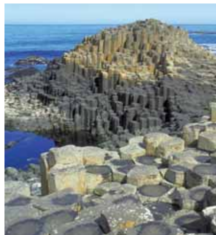
Giant's Causeway has gained popularity

"Closer to home markets are key to delivering long-term growth for our tourism industry. Short-term opportunities