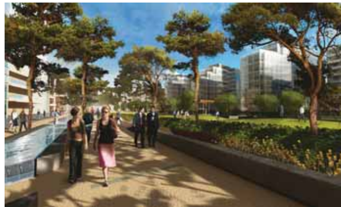
The new £11m park is expected to be fully funded by the council

A full business case for the scheme, designed by architects