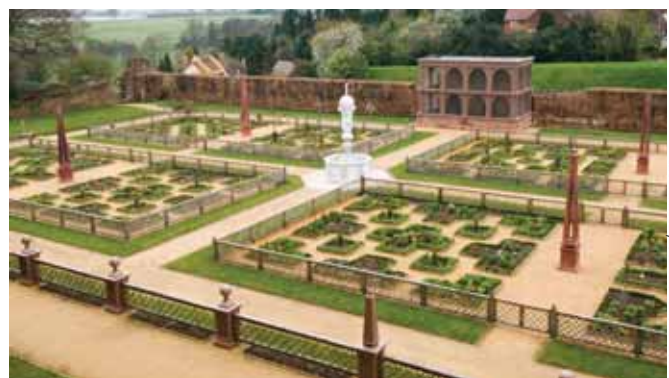
The 16th century garden has been recreated at a cost of £2.1m