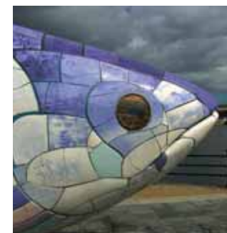
The grants will go towards arts schemes in Northern Ireland

The Northern Ireland's Legacy Trust programme, called Connections - Connect-