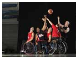
Summer Games are for all ages

To be held in Leicester between 25 -31 July, the event