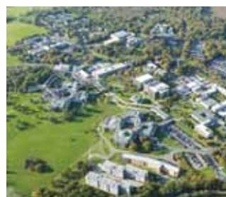
The centre will be built on the university's Canterbury campus

The new Colyer-Fergusson Building will contain rehearsal and performance space and will be built on the Canterbury campus to provide opportunities for music-making by