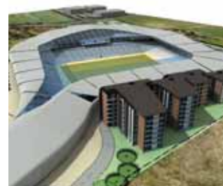
The £46m stadium is set to open by the 2010-11 season