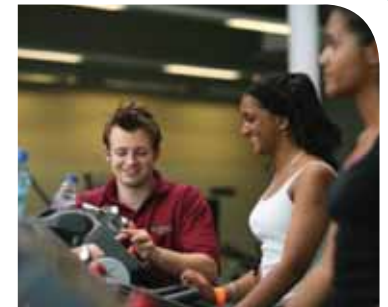
GLL - London's Most Successful Social Enterprise

Closing Date for all returned applications: Monday 22nd June 2009