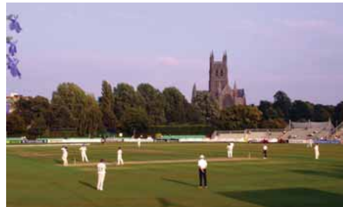
WCCC's New Road ground is currently undergoing redevelopment