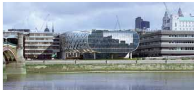
The hotel will be situated on Puddle Dock in Blackfriars, London