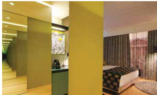
The fashion house hotel will offer 136 bedrooms and a restaurant

Additional facilities will include a 1,000sq m (10,750sq ft) spa, two tennis courts, a private beach, numerous swimming pools and meeting rooms, as well as a 400sq m (4,300sq ft) ballroom.