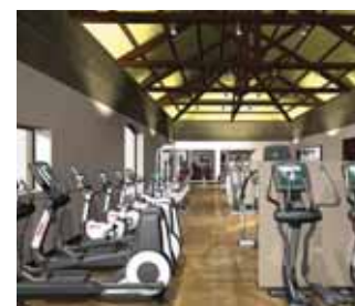
The new gym will be fitted with Life Fitness equipment

Additional facilities are to include an aerobics and dance studio, meeting rooms, a