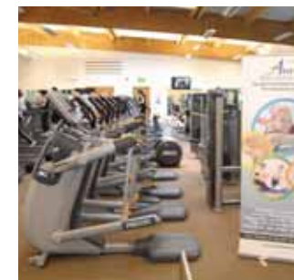
The gym boasts 33 CV stations

The 368sq m (3,961sq ft), Precor-equipped fitness suite offers 33 pieces of CV equipment, including four AMTs, plus Precor's new C Line