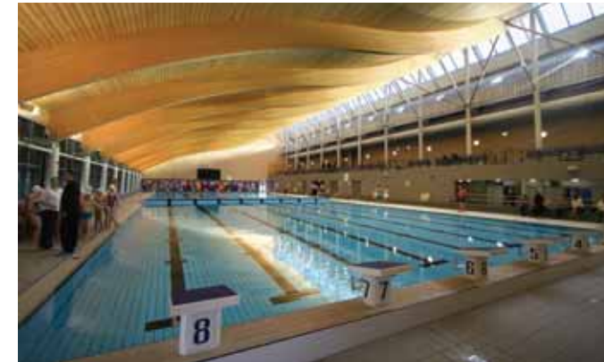
The centre, which has a 50m pool, will be managed by Parkwood

The centre also features a 12.5m teaching pool, a 200-seat viewing area, a 150-station Technogym-equipped fitness facility, a steamroom, spa and treatment rooms, and changing rooms. The existing sports hall has benefited from a new semi-sprung floor and improved lighting,