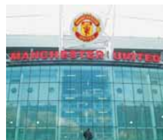
Big clubs are responsible for most of the £3bn debt

Deloitte's Annual Review of Football Finance revealed that clubs' revenues had increased by 26 per cent compared with 2006-07, and are expected to break through the £2bn barrier during the 2008-09 season.