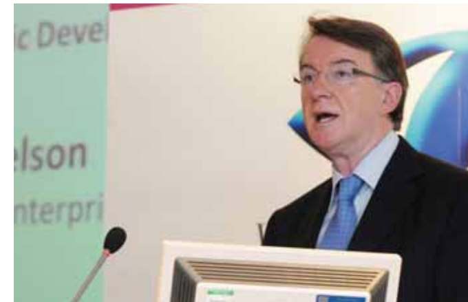
Mandelson said that BIS will help to bring Britain out of recession

It is also hoped that the decision to merge the two departments will place further education closer to the government's attempts to fight off the current recession, as well as helping to lay foundations for economic recovery.