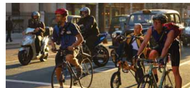
The superhighways are designed to provide safe cycling routes