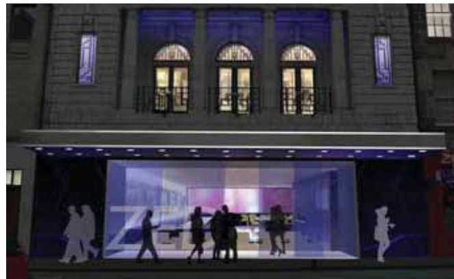
The hotel has been designed by London-based Make Architects

However, uncertainty over the auditorium's interior demolition as part of the designs proposed by Make Architects has resulted in the historic body referring the case to Scottish ministers.