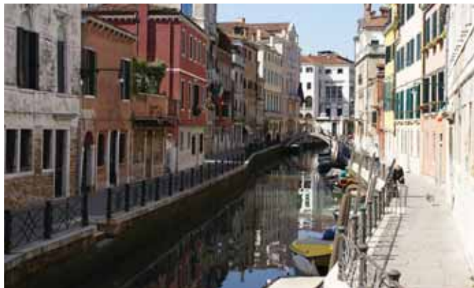
Venice is just one of the streetscapes to be created at Pinewood

The council, which allowed developers to keep planning permission valid for up to three years, has introduced the extension (at the discretion of the council) so applicants can avoid the lengthy process of resubmission so not to risk projects being scrapped.