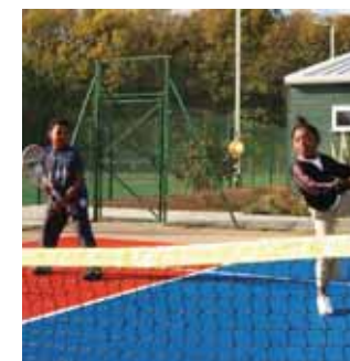
£200,000 has been set aside to help launch the new initiative

It will involve FIA operating members working with the government, as well as national