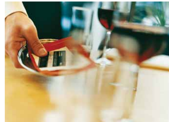
The average cost of eating out increased to nearly £12 last year

However, the decrease was partially offset by the strong performance at Costa Coffee during the first quarter, which reported a like-for-like sales increase of 2.6 per cent and a total sales increase of 18.5 per cent. Like-for-like sales at Whitbread's pub restaurants also increased by 2 per cent.