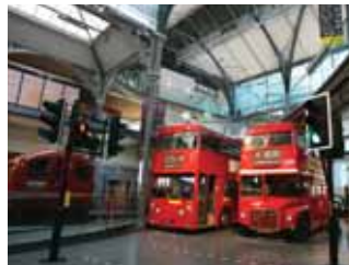
London boasts many museums

The plans have been approved by the Mayor of London, who currently holds statutory responsibility for culture in the capital, as well as trustees of MLA London who