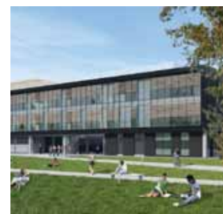
Plans include a courtyard space

A gym, a drama studio and a library are among the proposed facilities at the new campus, which will also provide