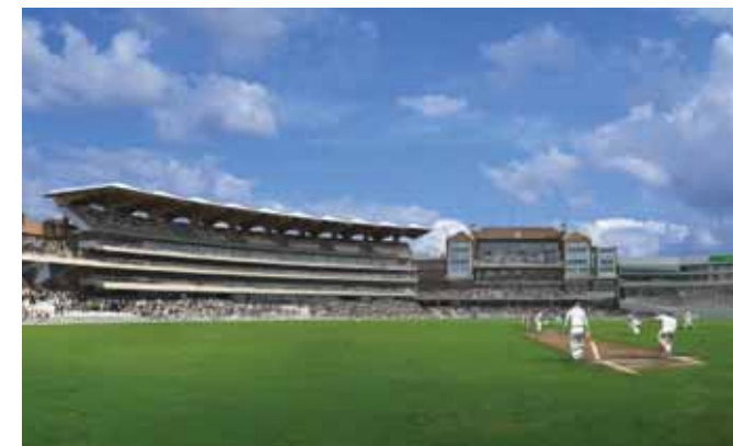
A new stand is set to increase the Brit Oval's capacity to 25,000

The scheme will be carried out in partnership with Arora