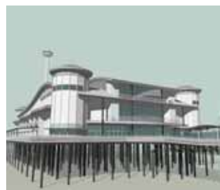
The owners hope to reopen the pier in summer 2010