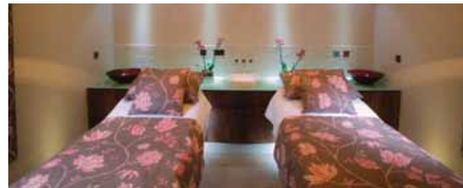
The spa will offer a 40 treatments carried out in its four rooms

All treatments will use the Elemis range of products. Other suppliers for the spa included Carlton Couches, Stan Ledbetter for the Rasul Mud Therapy,