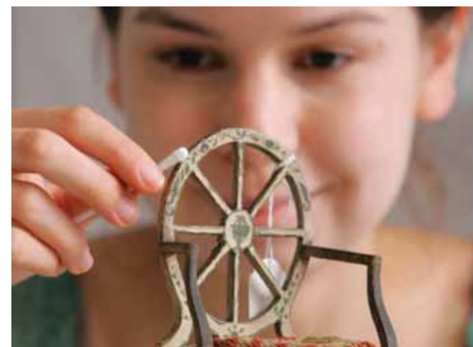
MLA will fund up to 50 apprenticeships in museums across the UK

The company admitted that it traditionally reported a loss in the first half of the year due to seasonal effects of the camping and education business.