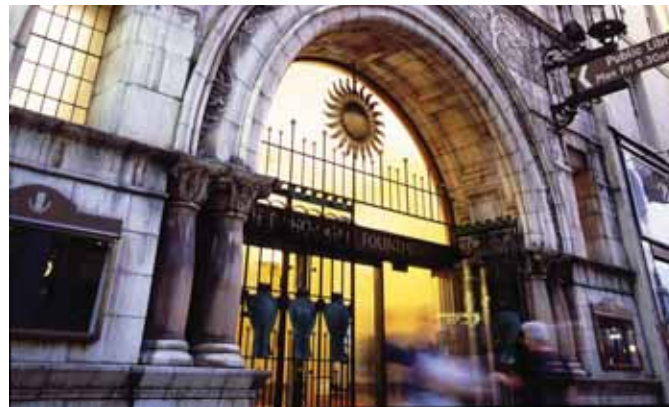
The Bishopsgate Institute first opened for community use in 1895

Phase one is expected to be completed by Spring 2010 before construction starts on the second stage in summer 2010, which will include the refurbishment of the Great Hall and the creation of a new café.