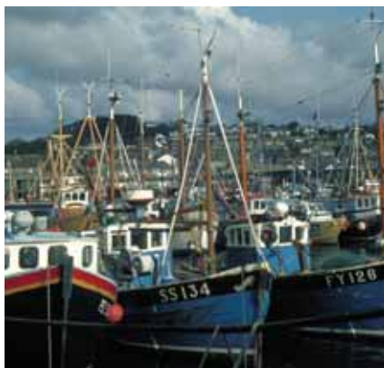
Penzance Harbour was set to be upgraded