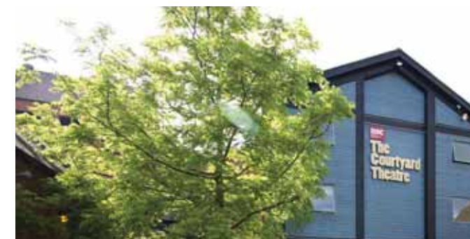
The Courtyard Theatre is currently RSC's main venue in Stratford