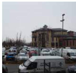
The site is currently a car park

Yorkshire Forward, the regional development agency, has confirmed that it will invest in Leeds City Council's proposals, despite concerns the project may threaten plans for the 13,000-seat Sheffield Arena.