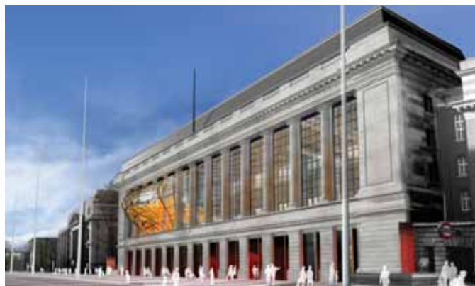
The museum, founded in 1909, is set to undergo a refurbishment

The museum will feature a new rooftop cosmology gallery called SkySpace and there will also be two new galleries: Making Modern Communica-