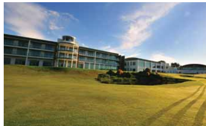
St Mellion is scheduled to stage the English Open event in 2011

The hotel also features two restaurants – the Bewdren Brasserie and An Boesti, as well as the Nicklaus Bar and 13 conferencing and banqueting suites, while the resort's golfing facilities have also received an extensive refurbishment.