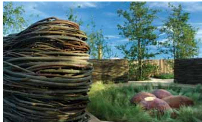
The attraction will have 12 separate gardens for visitors to explore