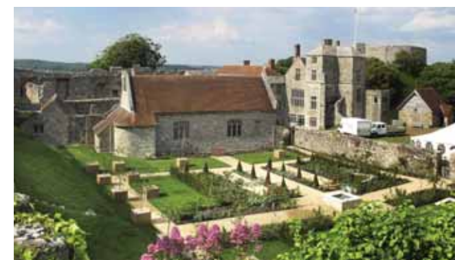
Improvements at the site include a new visitor centre and a shop

Period plants, fruit trees and a fountain have been incorporated into English Heritage's design in order to keep it as close as possible to the original layout of the garden, which was established as Princess Beatrice's private garden in 1913.