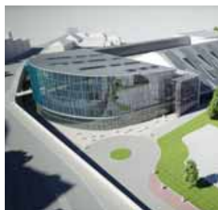
Construction work on the centre will begin in October

A fitness suite will house exercise studios, saunas and steamrooms, while sports facilities on offer include an eight-court sports hall, four five-a-side pitches and a