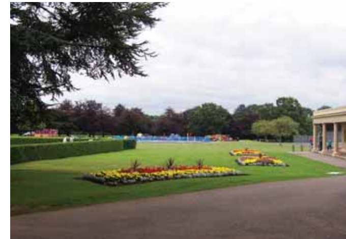
Work will include the restoration of the 88-year-old public park

Improvements to tennis courts and three football pitches and the restoration of gardens and pools are also outlined as part of the War Memorial Park project, which has received £2.8m from the Heritage Lottery Fund in April.