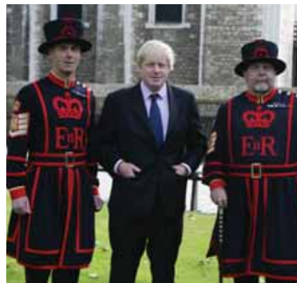
Events will celebrate London's rich heritage

A series of activities will also be focused around the smaller museums and sites situated in outer boroughs of London, with HRP and English Heritage providing funding for special events.