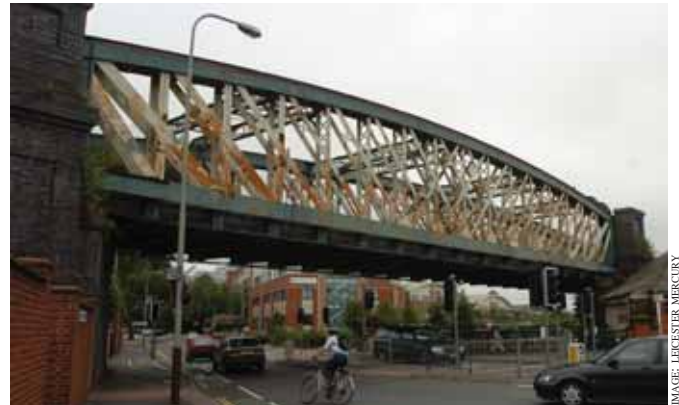
Leicester's derelict Bowstring bridge will make way for the centre

The complex, which will be available for public use as well as DMU students, is set to include a 25m swimming pool, a six-court sports hall, a gym and a fitness suite and will replace the existing John Sandford Sports Centre.