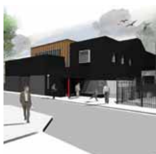
What the gallery will look like

Leicester City Council's (LCC) cabinet will decide whether to approve plans for the new building at the council-owned site on New Walk, which have been drawn up by Marsh