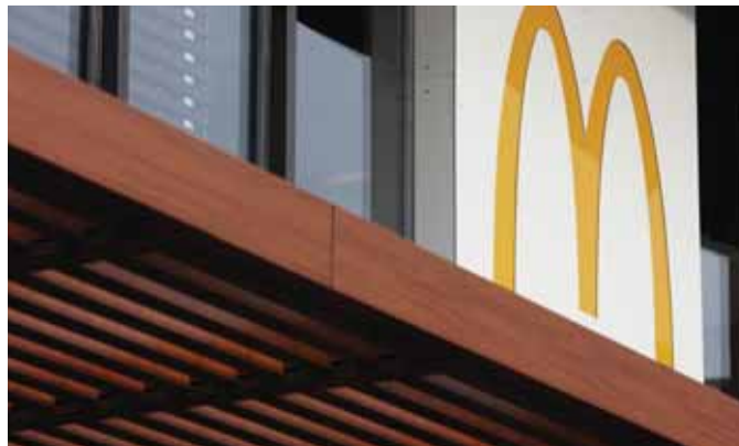
McDonald's is set to secure an exclusivity deal for London 2012

Under the arrangement, other food chains will only be able to sell their products on certain Olympic sites if they remove labels or change the packaging. Other venues will see existing restaurant and cafe owners having to make way for