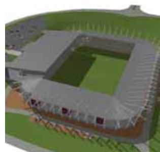
NBC has backed NTFC's plans

Northampton Borough Council (NBC) has now entered into a development agreement with the club and the Homes and Communities Agency to build a new 15,000-seat venue.