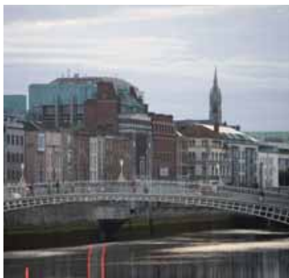
Visits to Ireland have continued to decline

Figures published by the Central Statistics Office (CSO) show a 15.1 per cent decline in the number of visitors to Ireland during June 2009, compared with last year.