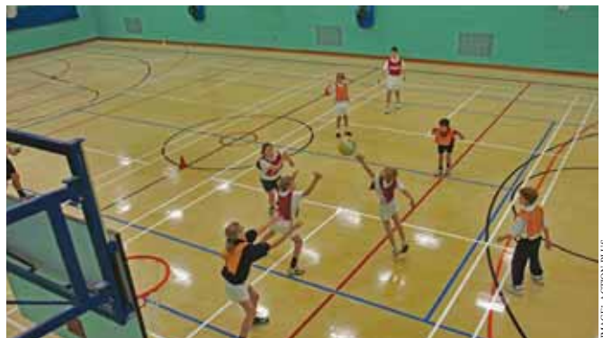
The DCSF said young people should be more aware of activities

The DCSF's Positive Activities Qualitative Research with Young People study also revealed that young people believe activities are reserved for sporty or talented children, while peer pressure and low confidence levels are an issue.