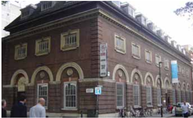
The facility is home to one of the capital's original Turkish baths

Facilities to be upgraded at Ironmonger Row Baths include a 30m swimming pool, a children's pool, changing facilities, two dance studios and a area for spectators, as well as the Turkish Baths. Plans also include increasing the venue's gym provision.