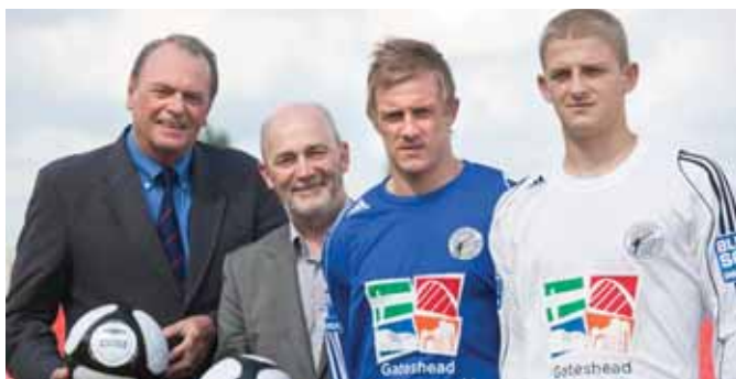
Gateshead's council and football club will promote healthy living