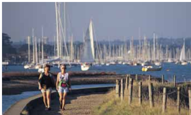
Natural England hopes more coastline will be opened to the public

According to the NE survey, just 44 per cent of coastline in North West England is open to the public, although at least 70 per cent in the East of England, the Yorkshire and Humber region, and South West England provide full access.