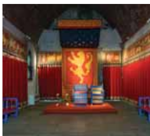
The historic royal palace was used by Henry II to entertain

Pepper's Ghosts (light projections of moving figures), costumed re-enactors and audio-visual presentation will be used to enhance the visitor experience, and tell the story of one of the most volatile periods of European history.