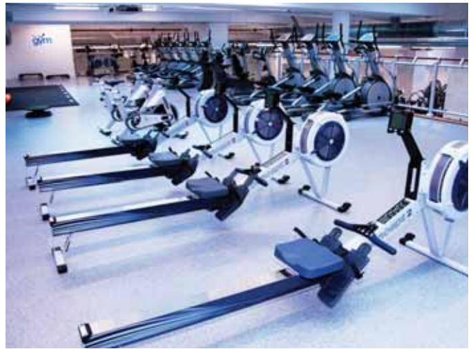
The Gym Group already operates clubs in Hounslow and Guildford