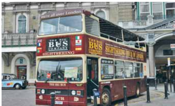
The report said that the UK tourism industry lacks clear guidance

The tourism industry currently sits within the remit of the Department for Culture, Media and Sport (DCMS), but the report claims that the department only directly contributes £50m out of the £350m annual public sector spend on support for the sector.