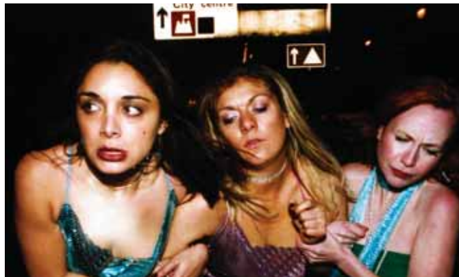
OMBC wants to tackle a "worrying trend" in alcohol consumption

OMBC has set the minimum price of one unit of alcohol at 75p, meaning that a pint of strong beer would cost no less than £1.90. Any premises selling drinks for less than that,