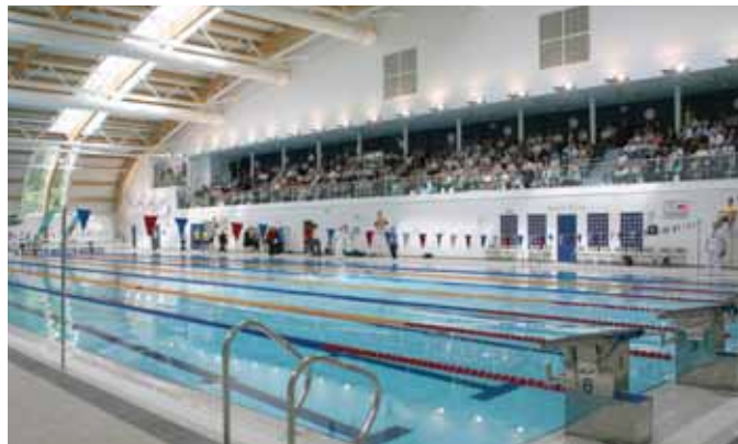
The pool will be used as a training facility ahead of London 2012

The pool also includes a health suite incorporating a sauna, a spa pool and a steamroom, a meeting room