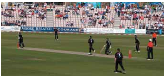
The 2010 domestic cricket calendar will feature three competitions