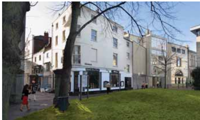
The art gallery and museum attracts 60,000 visitors each year

The designs for the development of the attraction, by architects Berman Guedes Stretton, feature new exhibition galleries, new open access storage, dedicated education spaces, improved visitor facilities and a ground floor café. The project has received a