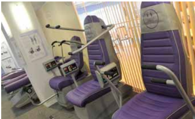
A 'Feel Good Factory' has been created at Pendle Leisure Centre

Pendle Leisure Centre will be the first site in the UK to benefit