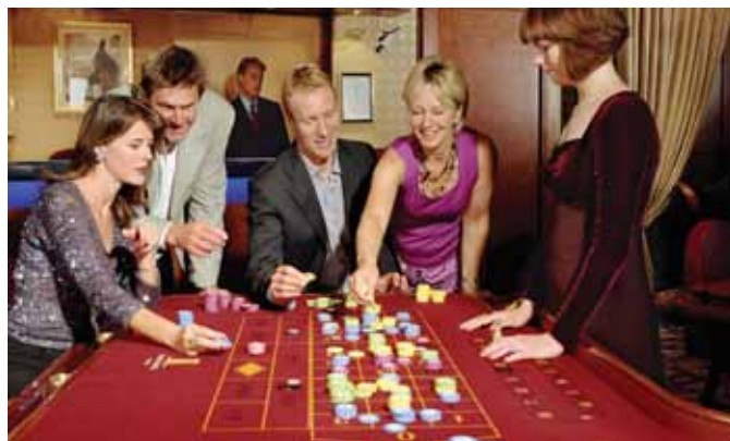
Hull City Council secured a license for a large casino in 2006

The proposed casino will have to complement existing regeneration plans for the city centre and be built within a set period, according to the council's criteria, although the awarding of any future large casino licence is currently subject to a wider review of licensing policy.