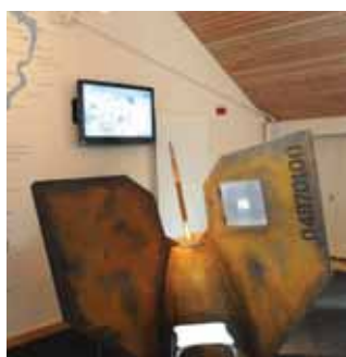
The new centre incorporates a range of eco-friendly measures

The eco-friendly renovation features a boiler fuelled by a