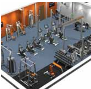
The scheme cost BPL £400,000

Royston Leisure Centre's fitness facilities are spread over