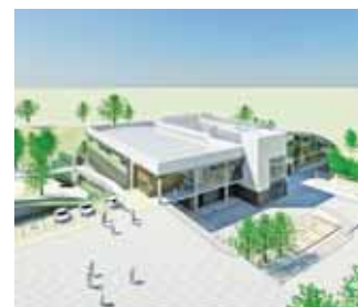
The CALC will include a new competition-standard pool

A second hall will accommodate aerobics, dance, martial arts, fitness and yoga classes, while a new café, meeting rooms and a community room