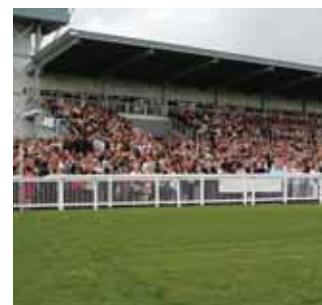
The racecourse is the first turf horse venue to open since 1920

Facilities at Ffos Las Racecourse, which hosted its first meeting on 18 June, include a grandstand with 150-seat restaurant and eight hospitality