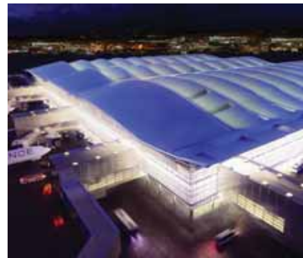
A new Terminal 2 is planned for Heathrow

Initial designs drawn up by international architects Foster + Partners and developed by HETCo – a joint venture comprising Ferrovial Agroman and Laing O'Rourke –