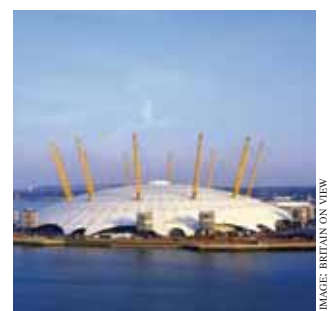
The land lease is on the market

In its interim management statement for the first quarter of 2009, Quintain Estates – which has a 49 per cent stake