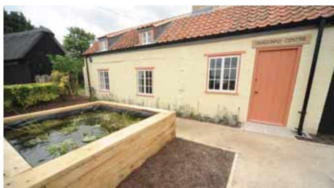
The new centre is designed to protect dragonflies from extinction

Volunteers will manage the centre, which includes displays containing information about dragonflies, while a regular programme of events is to be introduced, including guided walks and dragonfly safaris.