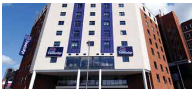
The budget chain aims to be the largest brand in London by 2012