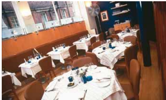
The company hopes to be able to continue its investment scheme