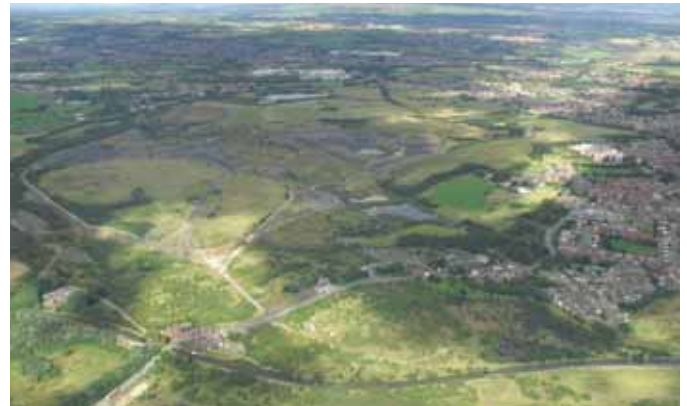
Work is set to get underway after £19.14m funding was agreed

Future plans for the overhaul of the North West Regional