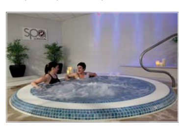
The spa is the latest in a string opened by social enterprises in the UK

A relaxation area, a steamroom and a monsoon shower also form part of the spa, which offers therapies and treatments using Elemis and Jessica products. It is the latest public sector spa to open in the UK, with Pendle Leisure