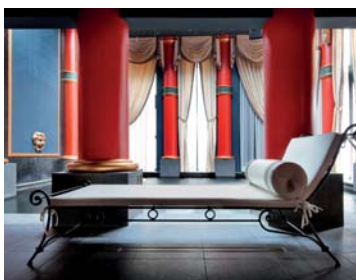
The 1,000sq m Les Bains de Lea spa is located on the hotel's sixth floor

All treatments are supplied by Nuxe and the signature treatment is the 90-minute Olympe massage, exclusively created for Les Bains de Léa. Les Bains de Léa will be open to both hotel