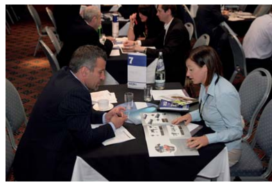
The Spatec events are based on one-to-one meetings between operators and leading suppliers

Focused on strategy and business issues the convention gives a platform to spa owners and senior managers to share their experiences of operating a successful spa. Running alongside a dedicated spa exhibition at Professional Beauty, the UK's