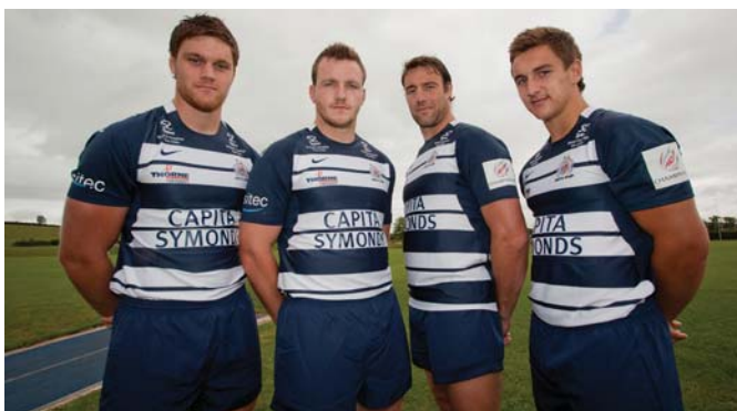
The deal will include sponsorship in both home and away shirts