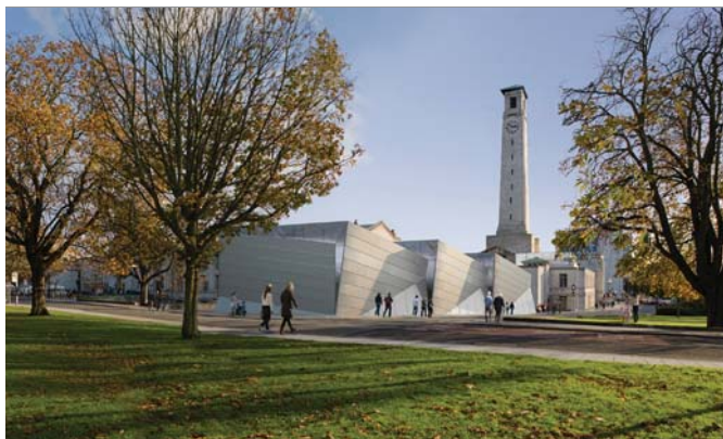
The Sea City Museum will be housed in a Grade II-listed building