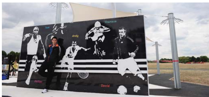
The concept is being rolled out in towns and cities across the UK