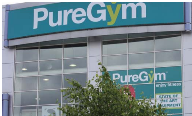
The Smethwick club will be the group's seventh site in the UK

The Smethwick gym includes a wide range of cv, strength and circuit equipment as well as a variety of group exercise classes for an extra fee. The new fitness club will also be one of the first in Birmingham