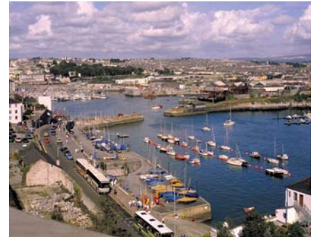
The decision could affect future leisure projects planned for the city

In a statement, SWRDA said: "Given the difficult spending decisions which will need to be taken across the public sector nationally the board was informed that there was no realistic prospect of further