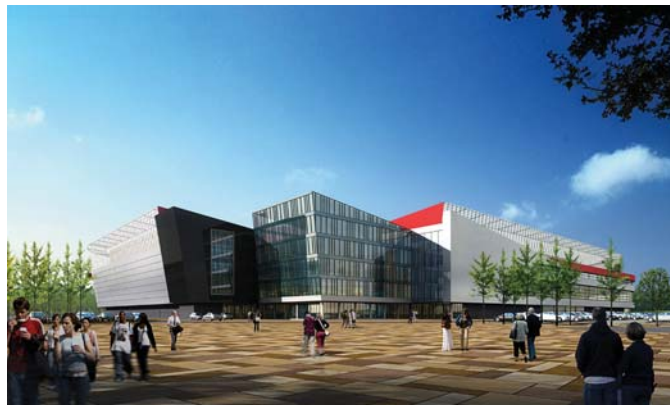
The new stadium will be located at Loirston Loch near Nigg

The new development – designed by the Miller Partnership – will feature hospitality suites; facilities for the players, supporters and the wider community; club offices; car and coach parking and a club museum. The all-seater arena will have three public stands and a main stand.