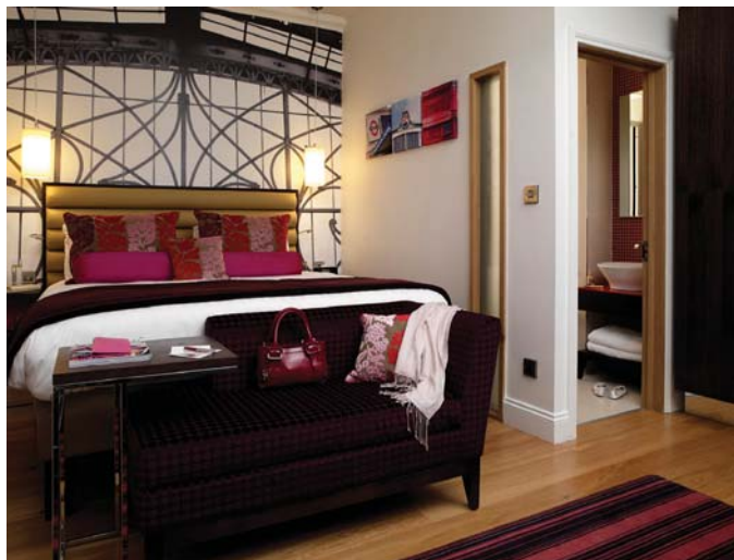
London's operators are helping to drive the UK sector's recovery