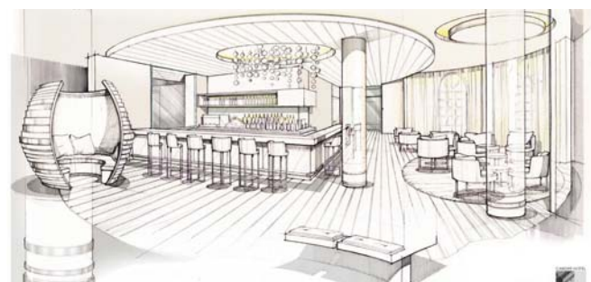
Aukett Fitzroy Robinson is behind designs for the refurbishment