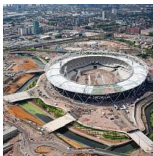
The Olympic Stadium site in Stratford, East London

More than 100 initial expressions of interest were submitted before a deadline in an earlier stage of the process held between March and June, although the formal bidding stage still remains open to new proposals.