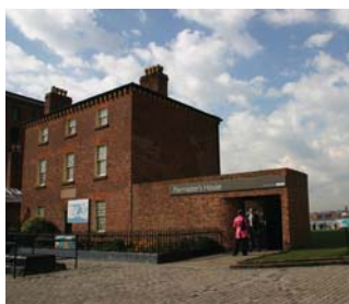
The Piermaster House is among the sites under threat