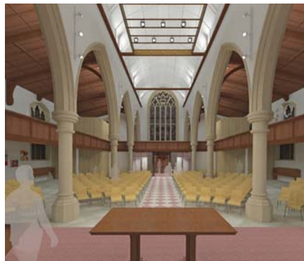
The church will become a new arts venue

A new flexible arts space is set to be created in the heart of Ashford, Kent, after the local authority was awarded £4.2m of Growth Area Funding for 2010-11 from the central government.