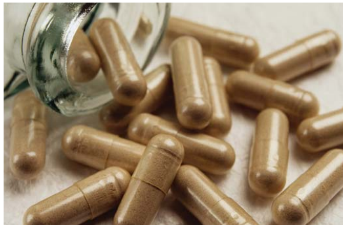
Alternative medicines have gained popularity in recent years

The FIH statement added that: "The Trustees feel that the foundation has achieved its key objective of promoting the use