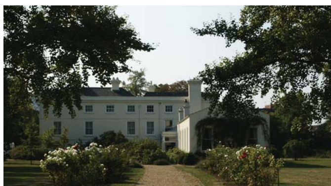
A two-year conservation scheme is planned at Morden Hall Park

The two-year project will allow access to the 19th-century stable yard for the first time in 130 years, as well as creating a centre for sustainable