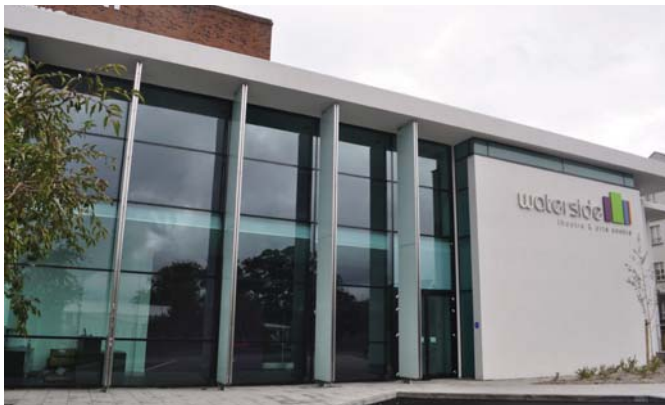
The city's Waterside Theatre is set to play a role during 2013

In a statement, the panel added that the decision was also made in recognition of "the passion and commitment of the city and its supporters and the strong evidence of engagement across all parties and communities in the city – and the potential step changes they envisage".