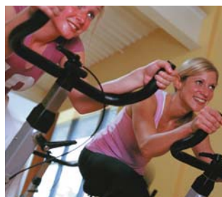
The study will measure the satisfaction levels of members

Called The Net Promoter Score (NPS), the method will measure satisfaction and loyalty levels of members by asking just one question: "how likely is it that you would recommend our company to a friend or colleague?".