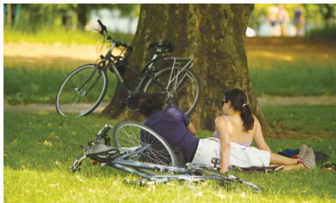
Natural England will help support a range of green space projects

Funded through the Big Lottery Fund's (BIG) Changing Spaces programme, Access to Nature is coordinated by Natural England, leading a consortium comprising British Waterways, the Environment Agency, the Forestry Commission, Greenspace, the National Trust and the Woodland Trust.