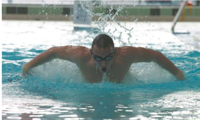
The centre will boast a 25m swimming pool and a health suite

However, a row has erupted due to the location of the scheme, with locals fearing that a lack of parking will adversely affect the high street shops.