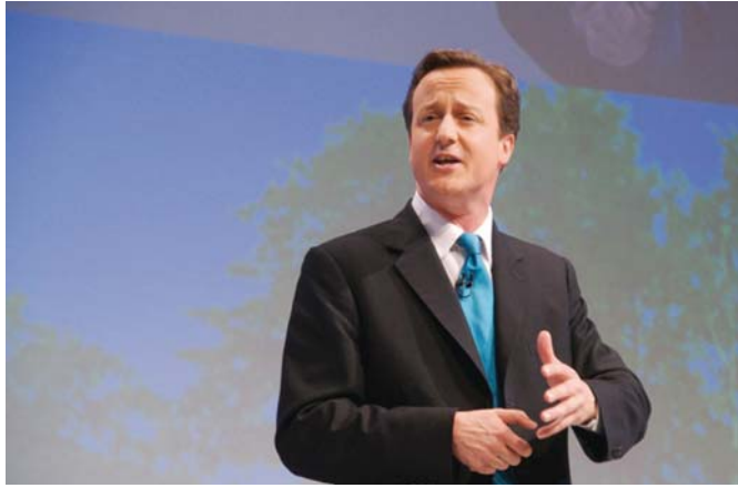
David Cameron said that tourism is driving new growth in the UK

"Tourism presents a huge economic opportunity. Not just bringing business to Britain but right across Britain, driving