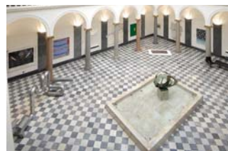
The aim is to raise £3m for arts charities by Christmas

Charitable arts and cultural organisations from across the UK aim to raise at least £1m in private sector pledges, which could subsequently result in £3m being donated to these