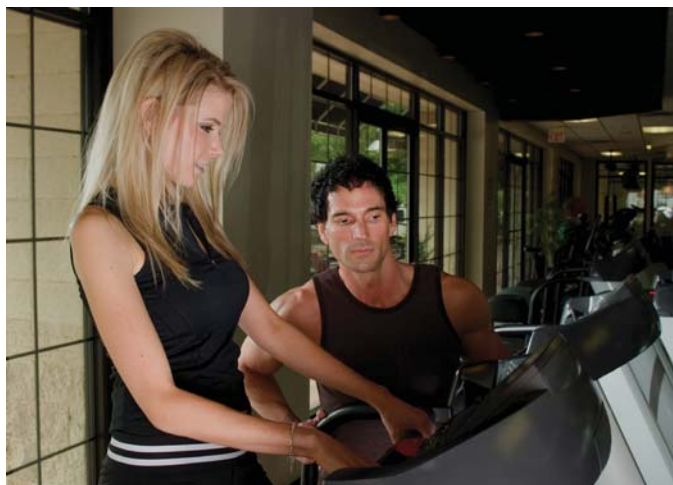
The training initiative includes workshops on customer service