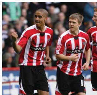
FL clubs will receive more cash

At an extraordinary general meeting, Football League members approved changes to regulations governing club finances, ownership and the criteria for grounds, as well as third party interests in players.