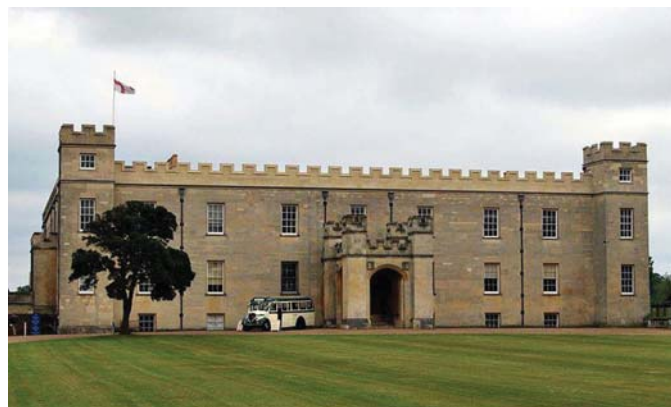
Hilton will rebrand the property as a Waldorf Astoria Hotel

In addition, there will be a swimming pool and full sensory spa experience, while an exclusive agreement will offer guests discreet treatments from