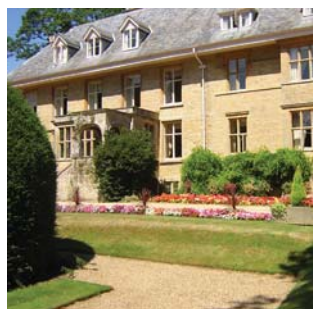
The Lower Slaughter property

First to launch was the spa at Homewood Park in Bath, which will be followed by a subterranean facility within von Essen's Hotel Verta development at the new London Heliport terminal in Battersea – the