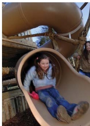
The cuts won't affect projects where work has begun

A DfE spokesman said: "The coalition inherited unrealistic spending commitments for 2010-11, where funding was reliant on underspend or