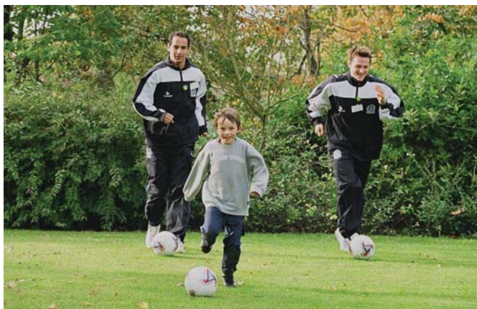
The majority of people in sport are employed by the private sector

The report also shows that a major factor in the sharp increase in announced developments in the past five years has been London's successful bid to host the 2012 Olympic Games.