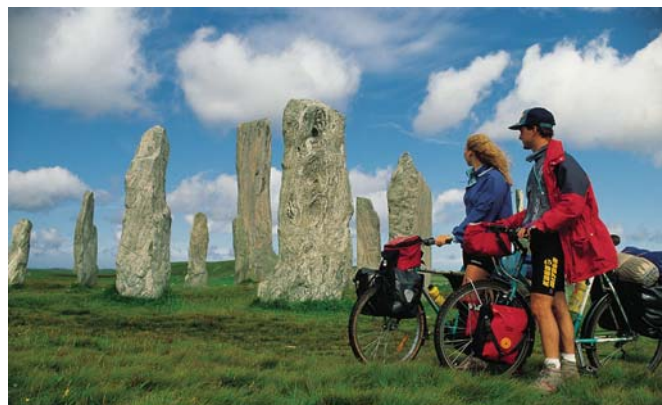
Cycle Xtra is being supported by Forestry Commission England

The destinations are Finlake Holiday Lodges near Exeter, Oakdene Forest Park near