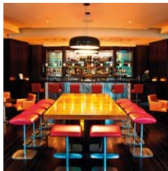
The new Colchester resort includes an on-site spa

"The space will be dedicated to the therapeutic value of essential oils. Every person who walks through the door will take a valuable experience away with them."