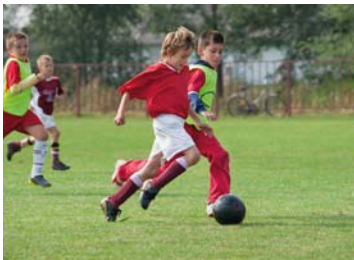
The former sports minister is critical of participation legacy proposals

He said that changing Sport England's role to one which merely funds governing bodies – instead of involving local authorities and regional sports councils in boosting participation – was a "massive mistake".