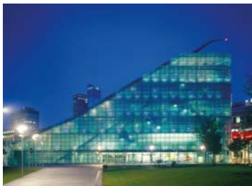
Manchester's Urbis venue will host the new National Football Museum