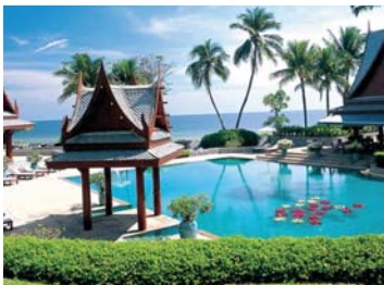
Thailand's ChivaSom is one venue to use Intelligenz Solutions software