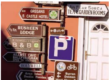
Tourism minister Leo Varadkar hailed the sector's continued resurgence

However, there was a 1.8 per cent decline in the number of Irish residents travelling abroad between May and July, when compared with the same period last year.