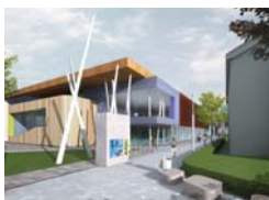
S&P Architects have worked on the venue's design

When the scheme is complete, 100 per cent of the heat energy generated from the flue gas cleaning process at the crematorium will be transferred to the facility and will help reduce running costs.