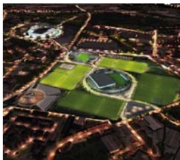
The scheme will offer youth and first-team facilities

Under MCFC's plans for the site, a new home for its youth development will provide a home for up to 400 young players who will train and study alongside senior players.