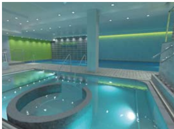
The Covent Garden centre's wet facilities have undergone a renovation

Three new-look studios; upgraded changing facilities; and a new 100-station gym, which