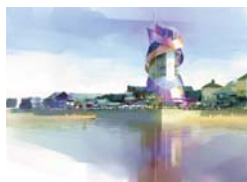
Willmott Dixon will build the new 80ft attraction

Due to open to the public in spring 2013, the project will lead to an extension to the existing Barn Cottage using straw bales and a 'green' roof planted with grasses.