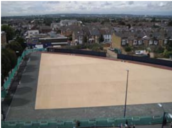
A cinema and leisure facilities are set to form part of the development

Pollard Thomas Edwards Architects (PTEa) will be responsible for drawing up plans for the project, which