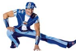
Scheving: LazyTown will be around for a long time

From December, Inspirit will also offer a training academy for all complex staff, which will feature six modules running at regular intervals over a three-year period.