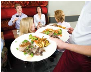
The government is planning to scrap 60 regulations for hospitality firms

Regulations covering the location and design of "no smoking" signs will be scrapped, while the government will also tackle excess charges for the inspection of private water supplies.