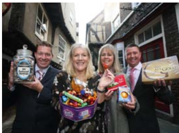
The chocolate attraction is due to open on the city's Shambles in 2012

Design company MET Studio has been appointed to create the attraction's interactive