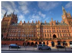
St Pancras Renaissance Hotel has been shortlisted