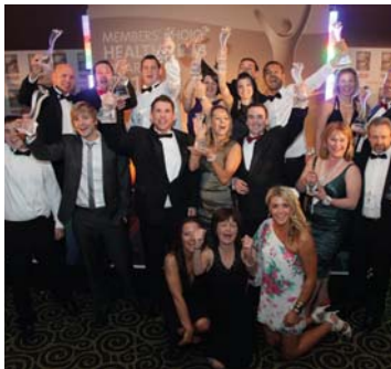
The ceremony was held at the Hilton Birmingham Metropole NEC hotel

The awards are unique in the industry as the only awards rated by members themselves