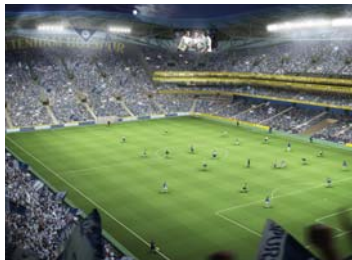
Tottenham Hotspur had previously labelled its NDP as no longer viable

Greater London Authority and Haringey Council officials met with the club on 28