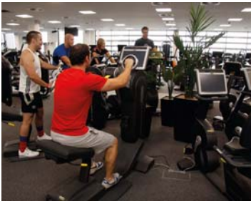
A 60-station fitness centre is among the facilities at Wigan Life Centre

The Health Living Zone represents the 'South Site' of the Wigan Life Centre and will be joined by the 'North Site', including a library and an Information Zone, in early 2012.