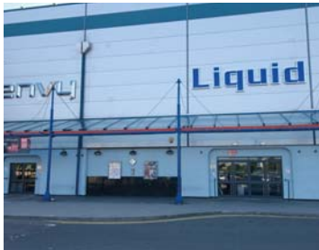
360 Play will replace the Liquid and Envy club that shut earlier this year

Covering 24,000sq ft (2,230sq m), the new Stevenage family entertainment centre will include an extensive range of children and family-orientated experiences and activities.