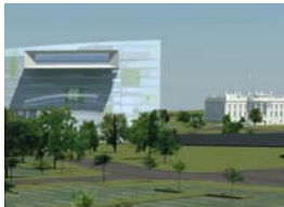
The scheme has been approved by the local authority

However, the Irish government is only planning to make statutory provisions that will allow for the development of "modest-sized casinos". It has recognised the need to support "a form" of casino entertainment, but felt there were "good reasons" not to back large-scale casinos as part of resort projects.