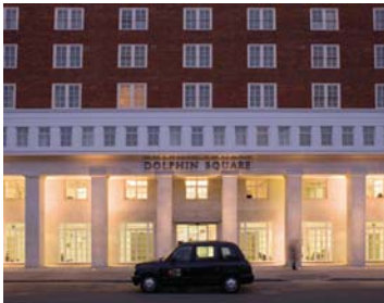
Dolphin House's Moroccan-inspired spa includes five treatment rooms

Facilities will include five treatment rooms, two studios, relaxation lounges and walled