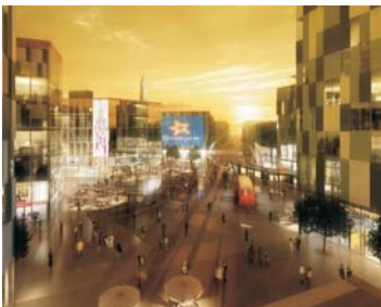
The £220m scheme is earmarked to boast hotels, restaurants and cafés

Outline planning consent for the entire development was approved by councillors in March 2010, although the proposals were dealt a blow after it was confirmed that the Northwest Regional Development Agency (NWDA) would not be contributing any financial support.