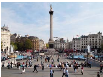
The campaign is set to play on a wide range of the UK's tourist attributes

"Reasons to visit" outlined include the 28 World Heritage Sites located in the UK; plus the 2012 Olympics, the 2014 Commonwealth Games and 2015 Rugby World Cup. Music festivals and the presence of three of the top five