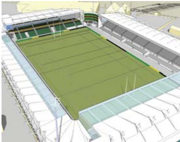
Northampton Saints is planning a major revamp of Franklin's Gardens

The club expects that the development is to be completed by summer 2013.