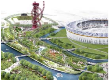
One of the five shortlisted ideas for the South area of the Olympic Park

It is hoped the South Park space will create an urban landscape similar to the South Bank and will incorporate a visitor centre, water features and play facilities. Meanwhile, the second area to the north of the park will be located in