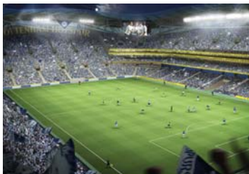
The Premier League club is looking to kick-start its development plans

THFC chair Daniel Levy said: "Increasing the capacity of the club's stadium is a key factor