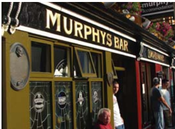
The lower rate of VAT on tourism products came into force in this year

Varadkar said: "This rate is significant because it principally benefits home-grown employers which are based in Ireland. The vast majority of hotels, restaurants and leisure businesses are Irish-owned and any profits stay in