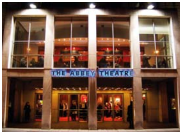
Dublin's Abbey Theatre is among those to receive ACI funding support

The latest study underlined how "the arts continue to be a major employer and contributor to Irish economic output", while also exploring the impact on the wider creative industries. ACI awarded €60.3m (£51.8m) to