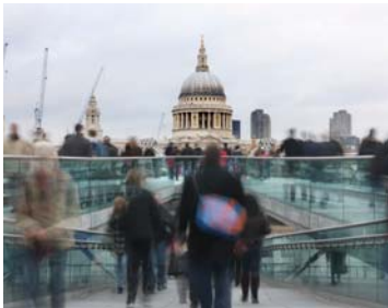
The four chief executives said APD has a negative effect on UK tourism

In a letter to Osborne, the four signatories said passenger numbers had fallen at UK airports over the last three years and was having a negative impact on the country's tourism sector. Osborne has also been urged to commission an independent study into the "true economic effects" of APD on the British economy.