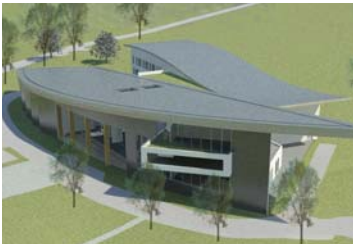
AWW will design the college's new dual-use leisure and teaching centre

Meanwhile, the upper floors of the new development will house teaching and learning spaces for the college and an aeroplane