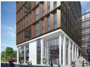
A gym with more than 100 stations is earmarked as part of the scheme

The council is working with KCCLP to deliver the LA Architects-designed project, which is to incorporate a two-floor sports centre with a gym equipped with more than 100 stations, a 25m, five-lane swimming pool; a small recreational lagoon-style pool; a poolside spa area with sauna and steamroom; and two exercise studios.