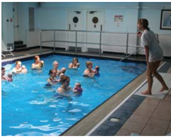
Aquababies is among the latest recruits to CYQ's endorsement service

"This independent quality assurance mark also adds value to in-house training and lessens the need for companies to send employees off-site to an external training provider."