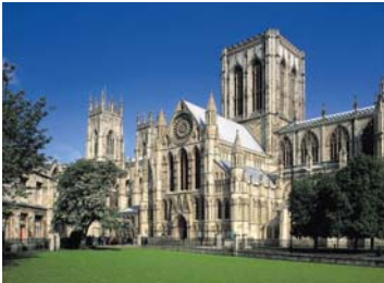
The historic cathedral has secured £10.5m of National Lottery funding

Multi-layered, mixed media presentations will be installed to help depict the stonemason and glazier skills used, as well as guiding guests