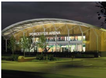
Worcester Community Sports Arena is to open its doors in spring 2012