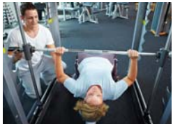
'Educated professionals' topped the list of trends

enthusiastic about working in the health and fitness sector, despite our research suggesting schools are not providing much in the way of information about such career options."