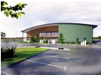
The new Farnham club will incorporate the group's largest Amida Spa

A new agreement signed by DLL last month will see Aromatherapy Associates, Rodial and Alpha-H supply products for treatments and therapies at Farnham's Amida Spa.