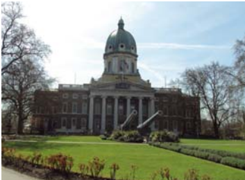
The WWI galleries are the first in a series of planned schemes for IWM

The new facilities will be created within the existing footprint of the IWM London building, with the central atrium space to also undergo a transformation as part of the scheme. It will be the first in a number of projects planned for IWM London over the next