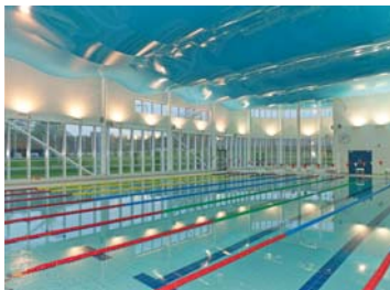
A 25m pool and a Shokk gym will be among the centre's new facilities