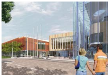
The group will work with S&P Architects to develop the leisure element

Plus3 Architects have also been involved in the design of the complex, which will also provide business space for small- to medium-sized enterprises, as well as community facilities.