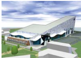
Work is due to start on Leisuredome early next year

Meanwhile, brands such as Subway; SOHO Coffee Co; Tennessee Chicken; and Butcombe have also signed up to the development.