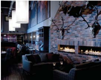
MWB operates the Malmaison and Hotel du Vin chains of hotels

The period also saw the completion of five hotel sales and leasebacks totalling £102.9m, with proceeds used to reduce Malmaison's borrowings by around £100m to £180m.