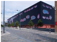
ACE said funding will help attract more visitors

Meanwhile, DBC has also announced that it has now removed the threat of closure from the town's Civic Theatre after a new management and funding model was drawn up for the venue.