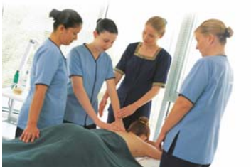
The new funding will be made available to increase vocational training

Collaborative proposals from businesses of all sizes and sectors will be able to submit bids, which will have to demonstrate how public sector support will bring in private funding. Support for apprenticeships and a commitment to enhancing skills levels across their sector will also be a requirement for applicants.