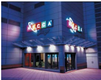
Rank's claims had already been upheld by the VAT and Duties Tribunal

The company said it would now consider the implications of the ECJ's ruling with regards to a claim for nearly £31m including interest in relation to amusement machines.