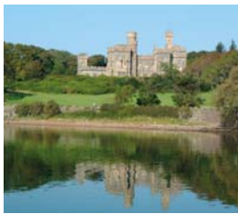
Lews Castle was awarded a £4.6m grant by the HLF

Elsewhere, The Dreamland Trust has secured £3m from the HLF towards plans for a major transformation of Dreamland Margate into