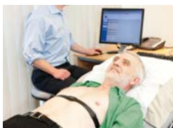
Figures have come from the Health MOT scheme

Meanwhile, swimming membership revenue and swimming school revenue also increased in the period, with Leisure Connection's adult swimming programme growing by 200 per cent in 2011.