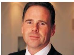
Payne led Champneys Health Resorts for 12 years

Visitors to The Spa at Guildford will be able to benefit from Pinks' manicures, pedicures, facials and waxing, with both The Spa and East River Spa also retailing the products. Meanwhile, Pegasus Spa (Heathrow) and The May Fair Spa (London) will feature Pinks' Organic Massage Oils in their body treatments following the deal.