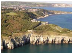
Durlston Castle is a gateway to the Jurassic Coast

It is expected that the Spode history centre will open to the public in spring 2012, although some work is required to refurbish the building and efforts to raise a further £20,000 have now begun.