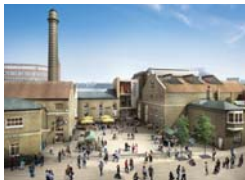
Minerva is aiming to transform the brewery site