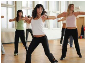
Exercise classes for 11-to-17-year-olds are among DLL's forecast trends

To capitalise on the expected increase in provision for young people, DLL has now launched Fitness Into Teens (FIT) for its members aged 11-years-old or older. FIT will feature multi-aquatics, to help 11-to-14-year-olds attain swimming qualifications and benefit from other water-based activities, as well as gym group exercise and fast track tennis.