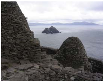
Tourism Ireland wants to attract 7.8 million overseas visitors next year

Irish tourism minister Leo Varadkar said: "The sector currently keeps 180,000 people in jobs right across the country, and there is great potential for further job creation. The Tourism Ireland marketing plan will build on this progress. We are now building up to the