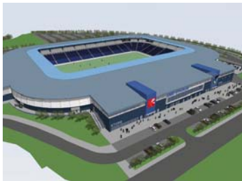
The new stadium will be built on land close to UWE's Frenchay campus

Plans for the new stadium and supermarket will be submitted to South Gloucestershire Council to Bristol City Council, following a