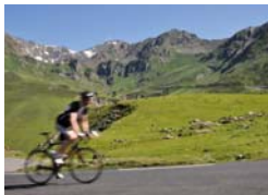
Alpine cyclists participated in the latest research

It is the latest indoor cycling studio to be installed at a council-owned leisure centre in Oxford, following the success of a similar facility opened in November 2010 at Blackbird Leys Leisure Centre.