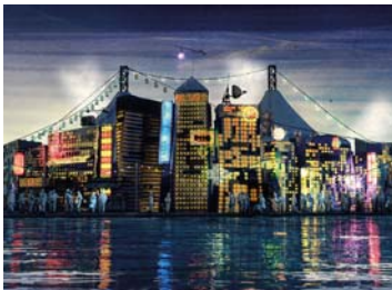
The scheme will lead to the transformation of London's Ponto Dock

Located within the Olympic Red Zone opposite ExCeL, London's Pleasure Gardens will transform Ponto Dock into a new destination for Londoners and tourists. Facilities will include a 36,000sq m (387,501sq ft) outdoor