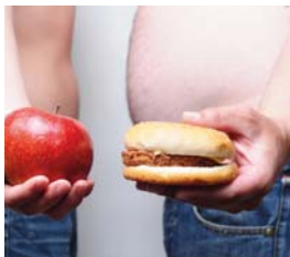
Healthier lifestyles could cut cancer rates in the UK

According to the report, which was published in the December 2011 issue of British Journal of Cancer , smoking has been found to be the most important lifestyle factor causing 23 per cent of cancers in men and 15.6 per cent in women – nearly one in five of all cancers.