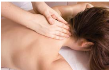
The report compiles the results of 740 separate studies into massages

It also highlights evidence that massages can delay the onset of muscle soreness (DOMS) and increasing pulmonary function.