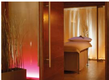
Killarney Plaza Hotel offers signature treatments such as Sundāri Zana

The Sundāri spa at the Killarney Plaza Hotel also offers a range of post-natal therapies such