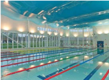
The Bert Williams Leisure Centre has replaced Bilston's existing venue

WCC in-house architects designed the Bert Williams Leisure Centre, which has been built on the site of a former ironworks by York-based contractor Shepherd Construction.