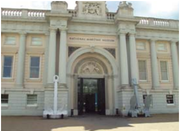
Casson Mann will create one of two new galleries at the Greenwich site

Meanwhile, the group has also been selected as exhibition designers for the Natural History Museum's new Treasures gallery, which forms part of a wider redevelopment project.