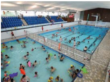
Remodelled swimming pools and a new gym formed part of the project

Kingswood Leisure Centre now boasts more than 30 pieces of new Technogym equipment, along with the supplier's Wellness System and more than 20 spin bikes.