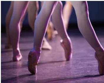
The £45m programme will support touring a number of arts disciplines

It is one of the methods in which ACE is planning to invest strategic funding between 2012 and 2015 and is financed largely through its National Lottery income.