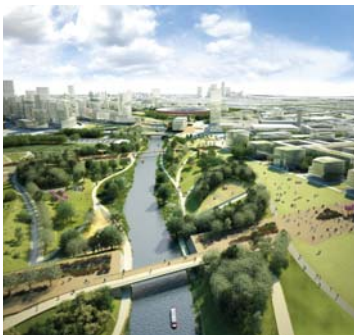
It is hoped the Olympic Park will become a major tourism destination

Both the Olympic Park Legacy Company (OPLC) and Lee Valley Regional Park Authority (LVRPA) have been urged to develop joint ticketing schemes by the committee.