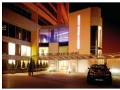
Hotel Verta includes the subterranean Spa Verta

Meanwhile, both organisations have also been asked to look into developing "complementary visitor attractions" near the four venues. More details: http://lei.sr?a=1j7V4H