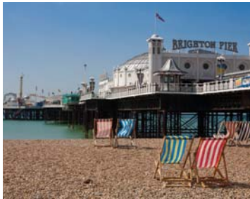
The iconic south coast resort could become an eco-tourism destination