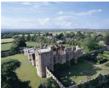
The 32-suite Thornbury Castle Hotel is among those bought by Halcyon

Other properties that have been acquired from von Essen by Halcyon are: Fowey Hall in Cornwall; Wooley Grange in Bradford-on-Avon; The Elms in Abberley, Worcestershire; Moonfleet Manor near Weymouth, Dorset; New Park Manor in Hampshire; and The East Wing at Ickworth, which is leased from the National Trust.