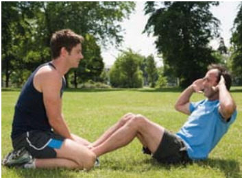
The HMRC amnesty is targeting private tutors such as personal trainers

Launched in October, HMRC's Tax Catch Up Plan is available to people teaching fitness or dance; sports; personal training; musical instruments; and arts. The campaign requires tutors and coaches to register by 6 January 2012 in order to 'notify' HMRC that a voluntary tax disclosure will be made, with owed tax to be paid by 31 March.