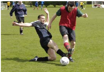
Football is one sport in which 16- to 19-year-olds are participating less

For those who were not playing sport as often as they were, nearly a third said it was due to a lack of time through work commitments or economic factors such as cost. Despite what have been labelled "disappointing" figures, there has been an overall growth