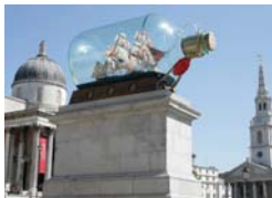
The piece has been in Trafalgar Square since 2010

Groups are being urged to bid for funding before a final deadline of 31 January 2012, with the Year of Creative Scotland part of a wider countdown to the Homecoming celebrations scheduled for 2014.