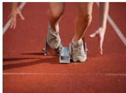
The initiative aims to establish an athletics legacy

Redbridge Sports & Leisure provided more than £2m for the project, with other funding coming from the Olympic Delivery Authority, Sport England, Mayors Legacy Fund and Badminton England.