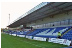
Macclesfield Town FC is eyeing up a new stadium