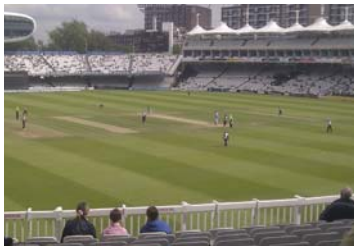
The cricket ground is set to be transformed on a "stand-by-stand" basis

However, the MCC has now agreed to focus on a phased overhaul of the venue, which it said is likely to start with the rebuilding of the Tavern and Allen stands at the Pavilion End. The revised plans will now only include the club's freehold land, with Lord's major match allocation over the coming years giving the MCC the confidence to pursue the scheme. Once the new development plans are drawn up alongside a