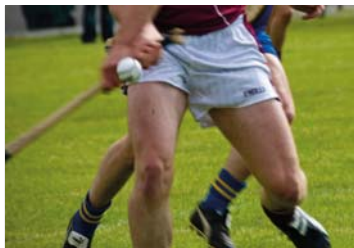
The scheme includes the first all-weather pitch to meet GAA standards

Facilities will include an indoor arena that can be converted into a conference or exhibition centre; a two-level, elite athlete gymnasium; and performance analysis suites. Four playing pitches and a 2,000-seat conference centre will also form part of the project, as well as ancillary