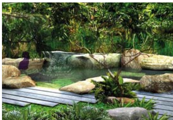
Barr + Wray will install a new onsen pool at Resort World in Singapore

Meanwhile, Barr + Wray has also been contracted to design the wet areas of the proposed