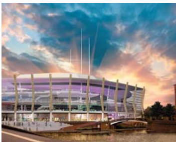
Plans for Birmingham's NIA will deliver the "next generation of arena"

An extra 5,926sq m (63,787sq ft) of pre- and post show retail opportunities will add to the 7,500sq m (80,729sq ft) of refurbishment work