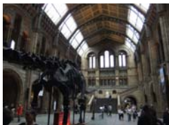
The Natural History Museum has free admission

Lindsay also said London's museums industry should increase its partnership working and join forces on areas such as promotion, lobbying and advocacy.