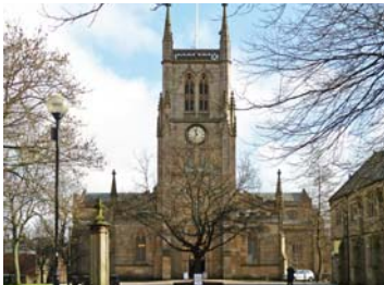
A new public square will be created on land surrounding the cathedral

Mitre Hotel, a 70-bedroom hotel with leisure and retail provision on the ground floor, is among the proposals for the scheme, along