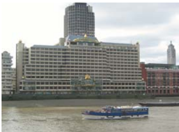
The landmark London building will house the Mondrian-branded hotel

MHG has revealed that it will invest around £9m (€10.6m, US$14.1m) of "key money" into the project, which is the third Mondrian management agreement announced this year. Earlier this year, the group announced its plans