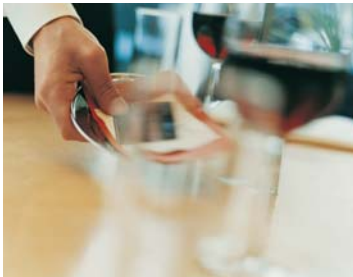
"Thriving chains" are set to fuel M&A growth next year by "cashing in"

Meanwhile, other predictions outlined in the BDO research include an increase in calorie and alcohol information on menus; a growth