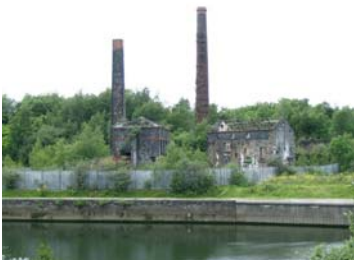
Funding will help make Swansea's Morfa Copperworks more accessible

A £521,000 award has gone to Swansea University for plans to make the Hafod and Morfa Copperworks more accessible and provide interpretation of the site's significance. Other recipients were Ffestiniog Railway Trust (£152,000); Pembrokeshire National Park Authority (£171,000); and the National Trust (£168,000) for a scheme in Carmarthenshire.