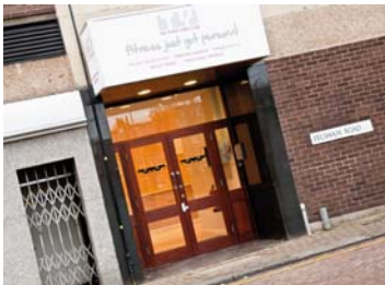
The Putney club is limiting membership numbers to a maximum of 100

Minetti said: "With this intelligence we create a bespoke programme tailored to you to help you achieve your goals fast, be that weight loss, improved speed and performance or just getting back into shape."