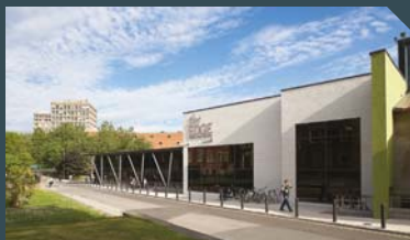
The Edge, University of Leeds

S&P works with you to deliver inspirational environments by solving your procurement demands and establishing new models of service consolidation and partnership working