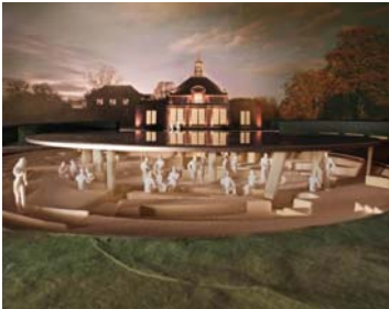
The pavilion is designed by Herzog and de Meuron alongside Ai Weiwei

A 12th column will support a floating platform roof 1.4m (4.6ft) above the ground, with the pavilion to operate as a public space and a venue for the Park Nights programme.