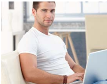
The eLearning platform allows students to learn at their convenience

Active IQ Academy director Yvonne Cooper said: "Just as Power Plate courses offer something different and new to the industry, our