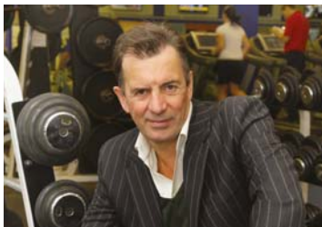
The relaunched Manchester day spa is Bannatyne's 34th across the UK

As part of the spa's relaunch, the company also showcased its new range of skin care products, The Bannatyne Spa Collection – boasting