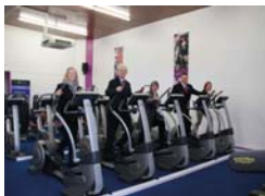
Technogym has provided equipment for the gym

Stadium Health and Fitness Complex is one of 11 facilities run by Kirklees Active Leisure on behalf of Kirklees Council. Details: http://lei.sr?a=D1p00