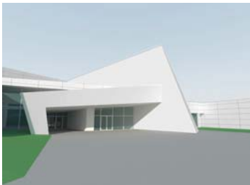
Barr + Wray is working at the new Cre8-designed complex in Linwood

Barr + Wray has recently begun work on installing the filtration systems for the pools, with the Glasgow-based group expecting to remain on site until early next year. It has also secured a £290,000 contract to refurbish the