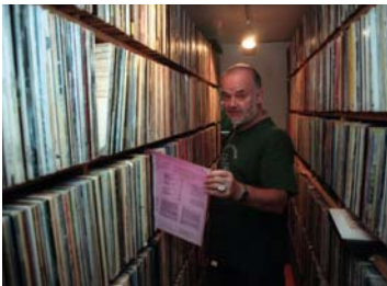
Highlights of DJ John Peel's record collection are revealed in The Space

Highlights from the first month of The Space also include full performances from the Globe Theatre's 'Globe to Globe' season and highlights from the record library of late broadcaster John Peel.