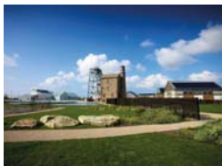
The attraction was created on derelict mine land