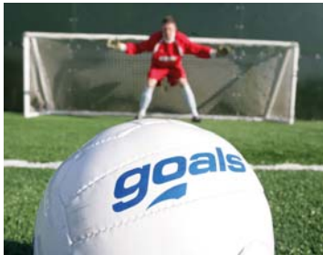
The pension fund was given extra time in which to lodge a takeover bid

Goals has now said – under Rule 2.6(c) of the code – that The Takeover Panel has approved a 14-day extension in which the group and the pension fund have continued their talks.