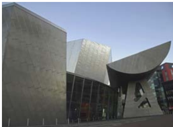
The Lowry Centre is one of Manchester's most iconic tourist attractions

The capital topped the list with nearly 15.3 million visitors according to the International Passenger Survey . Other top 10 cities include Glasgow, Oxford and Cambridge. Visitor numbers to Scotland remained level with numbers