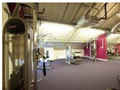
The gym was designed and fitted out by Motive8