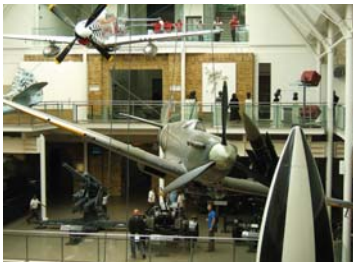
Cutting legislation may have "unintended outcomes" for UK collections

Among the regulations subject to the consultation is the Firearms (Museums) Order 1997, which permits museums to display items without the need for a firearms certificate.