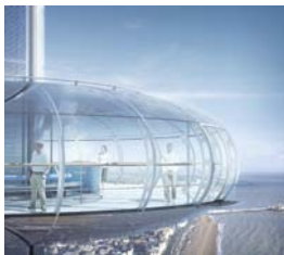
The i360 plans will deliver a 175m (574ft)-tall tower

Meanwhile, Brighton and Hove City Council is to mull plans to kick-start the scheme by borrowing funds to provide a £14m loan.