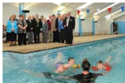
The pool has reopened after a two-phase revamp