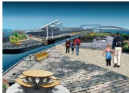
The project aims to revitalise a derelict London dock

More than £56,000 has been raised but the campaign requires a further £83,000 to proceed with the 2.5-acre (1-hectare) scheme.