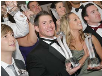
The awards enable members to rate their facilities in a range of criteria

Individual categories have also been introduced this year to recognise the efforts of fitness employees. The full shortlist will be