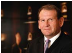
Cosslett will look to reverse the group's fortunes