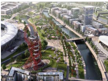
LLDC plans to open the new South Plaza area of the park at Easter 2014

It is the first phase of the LLDC’s planned opening programme, with acres of parkland and the Multi-Use Arena – a 7,500-capacity entertainment arena – among the first facilities to be made available.