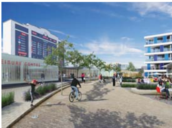
A leisure centre will be provided as part of the stadium redevelopment

The main Tote building will offer a climbing wall in order to provide a “dramatic feature to the historic space”, while a landscaped plaza in front of the Tote aims to “promote community interaction”. L&Q’s updated plans also