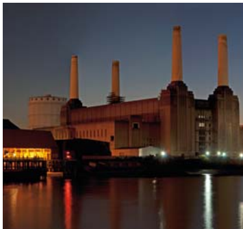
CFC is mulling the development of a new ground at the landmark site

The announcement that a bid for the power station site has been submitted comes after the club said an expansion of its Stamford Bridge home had "little chance" of success. Last month, CFC chair Bruce Buck told the IHT Sports Business