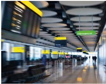
It is feared the border control plans will affect the UK's tourism appeal

Simmonds said: "The government is spending more than £77m on marketing the UK as a tourism destination overseas with the goal of gaining 5 million additional overseas visitors who will provide an additional £3bn for the economy.