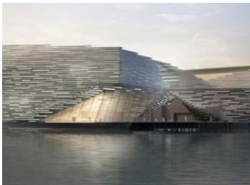
The V&A at Dundee is one of the UK projects to receive initial support

Another scheme in the capital – the restoration and redevelopment of the Royal Academy