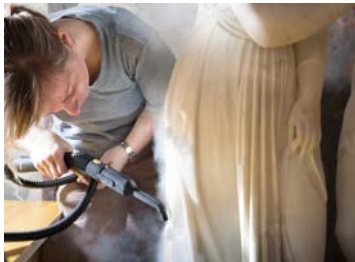
MA's guidelines aim to help individuals find appropriate opportunities