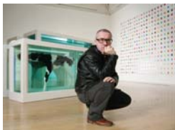
Damien Hirst is among the artists to participate