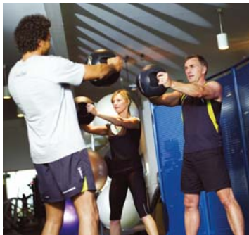
The first DL Studio is due to open in Putney by the end of September