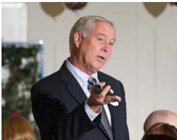
Disney Institute speakers will share their insights with Scottish firms

Targeted at chief executives and other senior executives, topics include Disney's Approach to Leadership Excellence and Disney's Approach to Selection, Training and Engagement.