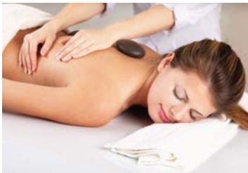
Plans for the Marina Centre include a day spa with treatment rooms

The launch of a spa and wet areas – such as saunas, steamrooms and relaxation spaces – is among the proposals being considered in a business plan drawn up by GYBC, which is understood to be using the recent