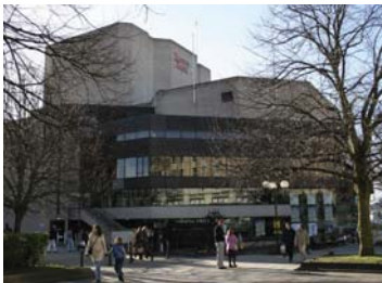
The theatre is set to undergo a £12m redevelopment of its facilities