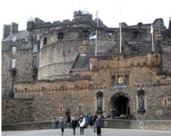
Up to 3 million Britons are looking to holiday later than usual this year

The new campaign forms part of its Surprise Yourself programme and encourages domestic tourists to holiday at home, while generating an £80m boost for Scotland's economy.