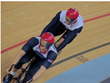
The facility will be renamed after Jason Kenny, here with Sir Chris Hoy