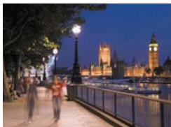
The scheme looks to transform the South Bank