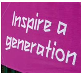
London 2012's ambition is to "inspire a generation"

Team GB's cycling success during the Games has led to 46 per cent of survey respondents intending to take up the sport, while 40 per cent are planning to start swimming.