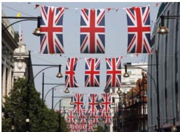
The UK is expected to attract more inbound visits from abroad in 2013

Attractions (22 per cent) and restaurants (21 per cent) are most likely to be the first point