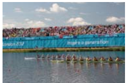
The venue was host of the Olympic rowing events