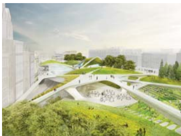
The Granite Web vision was chosen for Aberdeen's City Garden Project

It was agreed, however, that plans forming part of a revised Tax Incremental Financing