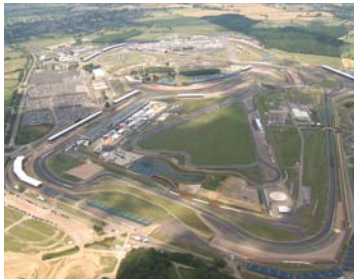
Silverstone Holdings is behind the ambitious plans for the race track

A kart track, an outdoor stage and a business park also form part of the project, along