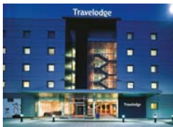
175 Travelodge hotels are to receive a renovation