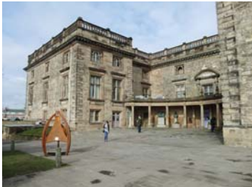
The Nottingham Castle scheme is lead by The Castle Working Group

An exploration of Nottingham's national role in social protest and rebellion and the creation of a new visitor centre at the entrance to the castle are also among the proposals.