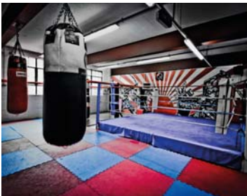
The club will become the largest centre for martial arts in the capital

The gym's current cardio space is also due to be extended and members will be able to recharge after a work out in the LDG café.