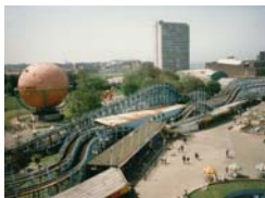
The Dreamland park site is currently derelict