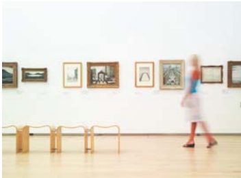
ACE is currently halfway through the inaugural year of the touring fund

Among the successful applicants in the third round is a nationwide tour of artistic work by dead and disabled artists led by DaDa, as well as a workshop fronted by Home Live Art.