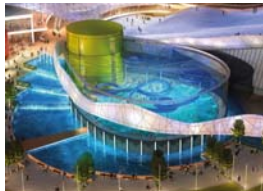
Plans for the development include a hotel and ski slope

Despite local authority approval, the project faced opposition from An Taisce and Louth Environmental Group among others.