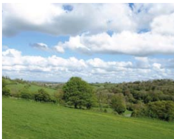
CPRE is urging more protection for Green Belt land around urban areas

The publication of both The Green Belt Threats Map and the briefing comes after a government pledge two years ago to "maintain protection of the Green Belt". In July 2010, communities secretary Eric Pickles said regional planning was to be abolished to give local people more say and ensure greater preservation of Green Belts.