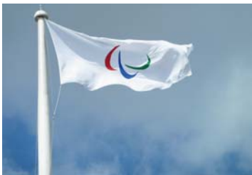
The Olympic rings have been replaced by Agitos, the Paralympic symbol

Among the preparation work carried out by LOCOC has been the transformation of the Athletes' Village from a complex housing more than 10,000 Olympic athletes to one catering for 4,280 Paralympians in just five days.