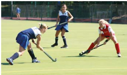
There has been strong growth in the number of women and girls playing sports in England

There has also been a sharp rise in participation numbers in the period since the London 2012 Games got underway. A range of Olympic sports have benefitted from the "summer of sport" as more people have joined clubs – particularly cycling and sailing.