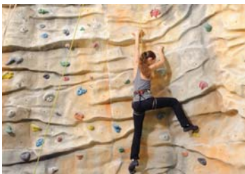
Facilities at the centre are set to include a number of climbing walls

Following a public consultation at the beginning of the month, Davies told local press: "The vast majority who attended the consultation were really enthusiastic about the