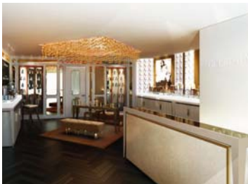
The Guerlain spa will be open to both hotel guests and for day spa guests

Other Waldorf hotels to open a Guerlain Spa include Waldorf Astoria Berlin, which launched in November this year and the Waldorf-Astoria in New York City which opened in 2008. In a statement, a spokesperson for the French perfume house said treatments would mirror the company's core values: "The treatment menu at the Guerlain spa will reflect luxury, emotion and refinement with a collection of indulgent treatments created using