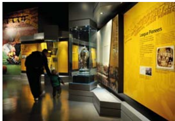
The museum was designed by exhibition specialist Mather & Co

Ron Flowers' World Cup medal and a drawing of Molineux as 'a pleasure gardens' are among the most prized items in the displays. School groups can attend workshops to learn