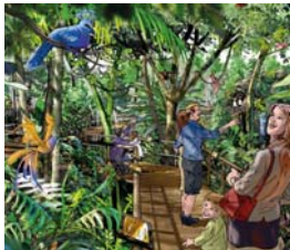
Plans include an indoor exhibit on Indonesian fauna

“For many of our visitors, taking a trip to these islands is just a dream. But we will be making those dreams a reality, transporting our