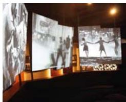
National Museum of American Jewish History in Philadelphia, one of Electrosonic's recent projects

Gairloch Heritage Museum will use the funding to host its first artist in residence for which applications are currently being invited. Details: http://lei.sr?a=G2woT