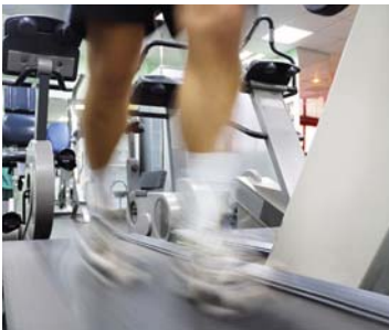
Subsidised health club memberships are increasing in popularity