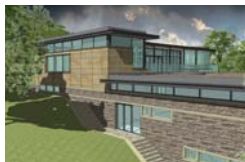
An artist's impression of the 17,300sq ft spa

The Haslauer stonebath is a theatrical wet heat experience where mineral stones are heated in an oven and then the basket containing them is dropped into a basin of cold water, releasing minerals into the steam. Details: http://lei.sr?a=J8Yn