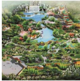
The entire 12-acre attraction will be China-themed

China Vision expects 1.5 million people will visit the park each year where