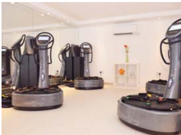
The club has been kitted out with Power Plate's new pro7 machines

Faircloth said: "We are both passionate about Power Plate equipment and