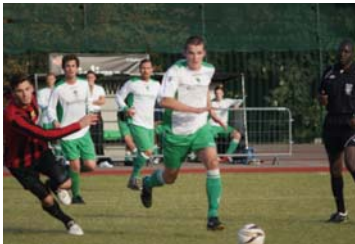
CCFC is looking to move to a new home for the first time since 2007

The club is currently in a ground sharing arrangement with Herne Bay Football Club