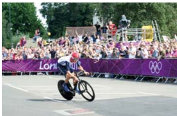
Team GB's triumphs at 2012 have been followed by financial success

He said: "The construction programme was completed on time and within budget, 11 million tickets were sold and our athletes excelled.