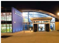
DC Leisure operates more than 100 centres