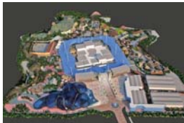
The 872-acre attraction is set to cost around £2bn

Townsend said: “It's probably going to be the country's biggest and most exciting regeneration project since the Olympics. The UK doesn't have a destination on this scale. The UK needs big regeneration projects to kick