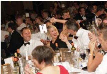
The awards gala night will be held in Birmingham during the LIW event

The competition provides a host of benefits including a confidential customer feedback report; a readymade local marketing campaign; a staff incentive scheme and a regional and national benchmarking tool. As well as recognising clubs in 12 regions around the UK