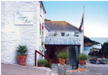
The Lugger hotel in Portlaoise – one of the properties included in the deal