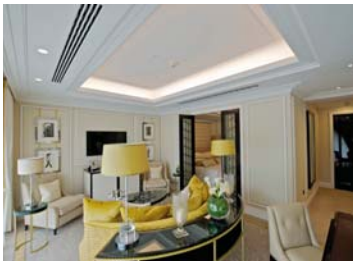
The Wellesley Hotel has been designed by London-based Fox Linton

Dining options include The Oval Restaurant serving authentic Italian cuisine while the Crystal Bar displays a specialist Whisky and Cognac wall. The Wellesley will house The Cigar Lounge featuring a heated cigar terrace offering a collection of cigars from around the