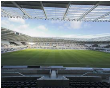
The demand for tickets for Swansea City's home games has soared

He said the expansion would be built in a phased approach and funded by the club, which last month revealed it was set to make