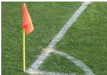
The club hopes to move into the new stadium for the 2014-15 season

The stadium is to be funded by replacing the existing Camrose stadium with a 90,000 sq ft (27,432 sq m) retail park. The club has been in negotiations with BDC which owns the area