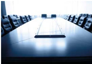
The training is open to director-level staff of all sporting organisations

The IoD runs the first day and SRA the second, to add some sport specific points. The course covers matters such as strategy, tasks of