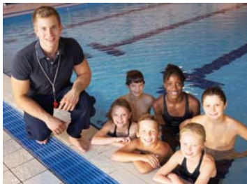
The scheme will look to tackle the shortage of aquatic personnel