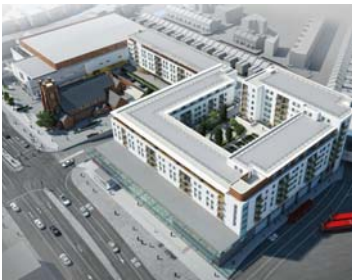
The centre's design will include a full-size ice rink above a 25m pool

The cost of the development has been largely met by Tesco with the Lambeth Council