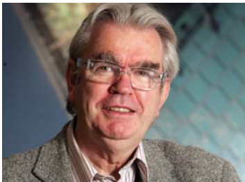
World-renowned architect Sir Terry Farrell will lead the review

Culture minister Ed Vaizey said: "Good design builds communities, creates quality of life, and makes places better for people to live, work and play in." He urged the architecture