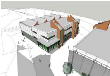
The sports and arts centre is being built with sustainability in mind

Also on three storeys, the visual and performing arts building will provide a performance hall; dance and drama studios; music,