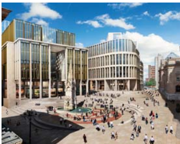
Developers Argent are behind the multi-million pound development

The development covers an Enterprise Zone – one of 24 nationwide developed as part of a