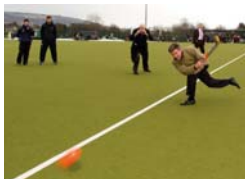
Sports minister Hugh Robertson tests facilities

Improvements at the centre will include the refurbishment and extension of the first floor fitness suite complete with the latest resistance and functional training equipment. A new health suite accessible from poolside will also be unveiled including a sauna, steamroom and multi purpose social area, which will include a new pool-viewing gallery. Details: http://lei.sr?a=zoxiv