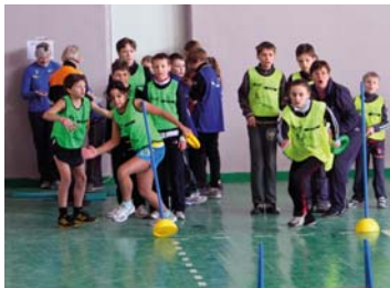
The extra funding is aimed at improving after-school sports provision

All schools with 17 or more primary-aged pupils will receive a lump sum of £8,000 plus a premium of £5 per pupil. Smaller schools will