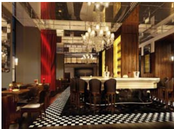
Great Northern includes destination restaurant Plum + Spilt Milk

The hotel's 91 rooms were refurbished with a Victorian inspired colour palette and three room types were created: Couchettes