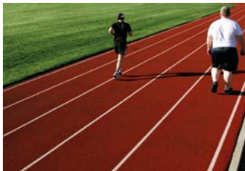
The scheme aims to get 130,000 inactive people taking part in sport

The Macmillan project will open up fresh sporting opportunities for cancer patients in 10 parts of England, including work in Oxford to help 14 to 25-year-olds with cancer to get active. Macmillan is investing a further £230,000 in the scheme. Almost 130,000 inactive people are expected to get involved in sport through