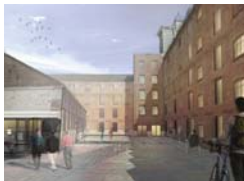
The site comprises seven listed buildings