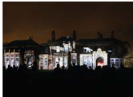
Newcastle design studio Novak created the 3D film