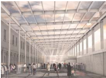
Paddington Station will house 'A Cloud Index' by artist Spencer Finch

The brief states artists should work in partnership with Crossrail's architectural design teams and manufacturers of keynote materials for their station. Already, American artist Spencer Finch has been chosen to produce