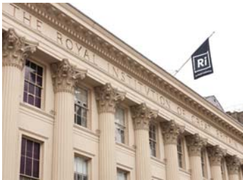
RI's headquarters in London underwent a £22m refurbishment in 2008

Its headquarters at Albemarle St include the free-entry Faraday Museum and some of