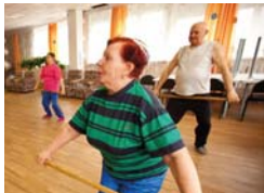
The Bedfordshire scheme will target the inactive

delayed each time due to the poor economic climate. Varney said 2012 was the 13th consecutive year the group had beat its profit target. Details: http://lei.sr?a=r3B8m