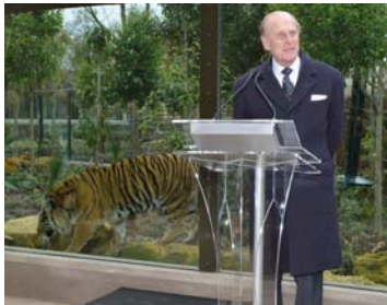
The Duke officially opens Jae and Melati's new home at London Zoo

The Duke officially opened the exhibit on 20 March, unveiling a plaque to commemorate the occasion, before it officially opened to the public two days later.