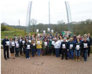
Oakwood Theme Park staff celebrate at the end of their training day