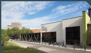
The Edge, University of Leeds

S&P works with you to deliver inspirational environments by solving your procurement demands and establishing new models of service consolidation and partnership working