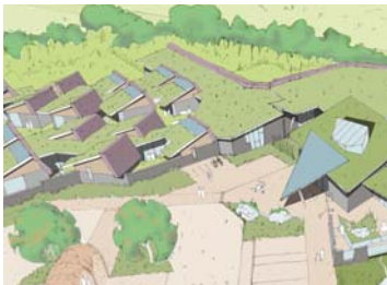
The JDDK concept plans include thatched roofs and whinstone walls

Design concepts will focus heavily on sustainability, incorporating locally sourced materials, heather thatched pitched roofs and whinstone walls.