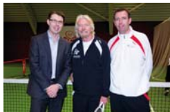
Virgin boss Richard Branson signed the deal

The multi million pound development is a partnership by the football club, Burghley House Preservation Trust/Burghley Estate Leisure Limited and New College Stamford. Located on land west of Ryhall Road, the stadium will feature a new first team grass pitch with a two-storey covered stadium for spectator seating and standing. Details: http://lei.sr?a=g5t5x