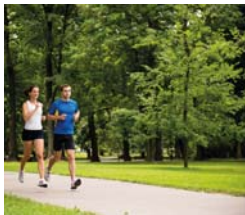
Running produces 90 per cent greater weight loss

The first SLZ, installed in Watford's Meriden Estate in April 2012, has significantly improved activity levels in the area. Details: http://lei.sr?a=z2a4T