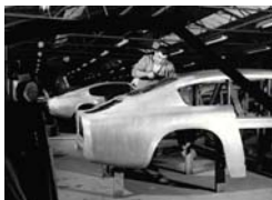
Displays will feature behind-the-scenes photos

Dorchester's Old Crown Court and Cells, famous for the trial of the Tolpuddle Martyrs, is set to be transformed into a visitor attraction as part of Heritage Lottery Funding awarded to Shire Hall, in which they are housed. West Dorset District Council has secured £69,000 of development funding to build plans to transform the Grade I listed Georgian property into a major visitor centre with exhibitions and educational resources. It would be part of a proposed heritage quarter for the town. Details: http://lei.sr?a=Q8RoR