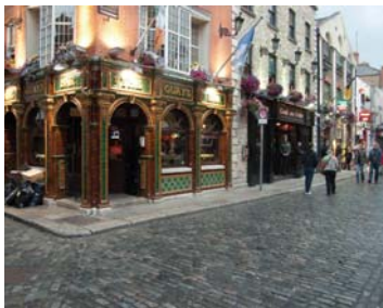
An increase in city breaks provided operators and hotels with a boost

9.8 per cent to 13,331,000. Tourism Minister Leo Varadkar said as a result the government was introducing Visa Waiver Programmes and attracting new air routes to target long haul