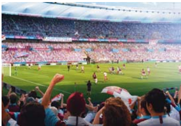
West Ham hopes to move into the stadium ahead of its 2016-17 season

The redevelopment of the venue and the planned use of retractable seating will allow