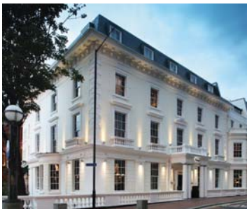
Malmaison Reading is one of 12 hotels included in the group