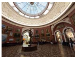
Birmingham will provide works by 17 artists

The resulting research will be used to develop assets like new or enhanced digital databases, archives, galleries and creative outputs. Details: http://lei.sr?a=r2D7N