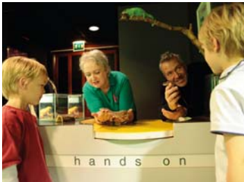
It's hoped the scheme will benefit volunteers, museums and the society

They will get the chance to work with some of the most prestigious heritage venues in the North West, including the Whitworth Art Gallery, Manchester City Galleries, People's