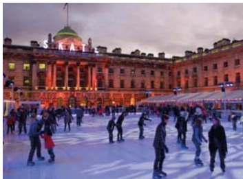
Inbound visits to the UK increased during 2012 – despite the weather

"The overwhelming success of hosting the Olympics and the likelihood of a better summer this year means that tourism expenditure