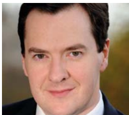
George Osborne's budget was seen as a win for pubs

The new scheme will take the first £2,000 off the employer National Insurance bill of every company in the country, meaning that around 450,000 small businesses will pay no employer National Insurance at all. The