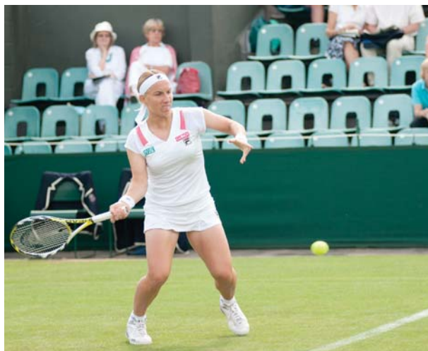
Women at Wimbledon are facing stricter rules on non-white garments

Former Wimbledon champion Pat Cash condemned the rules, calling them "ridiculous".