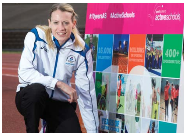
Olympic hurdler and Active Schools Ambassador Eilidh Child

The latest figures from 2012-13 show a 13 per cent increase in participant sessions compared to the previous year – a rise of more than half a million to 5.1 million. According to sports minister Shona Robison, the programme has become embedded as part of the “fabric of