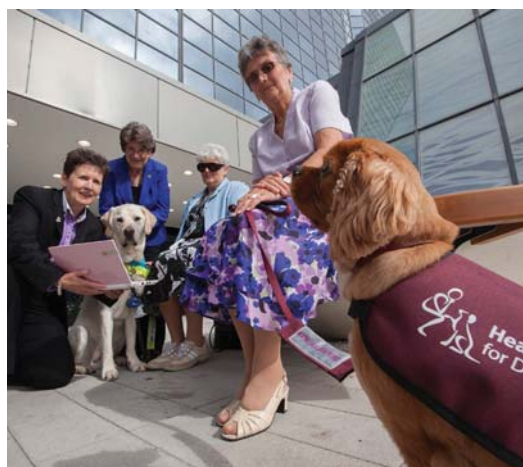
Minister for tourism Fergus Ewing (left) launches the scheme

Tourism minister Fergus Ewing said the scheme ensures Glasgow businesses can cater for all visitors. Details: http://lei.sr?a=d6P3T