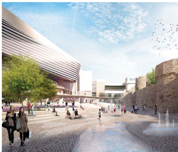
Work is expected to start on the initial phase later this autumn

ACME is masterplanner and architect for Watermark WestQuay, Grant Associates is