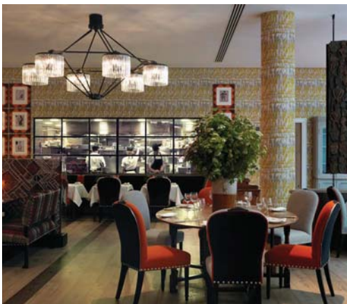
The Ham Yard Hotel is Firmdale's eighth property in London

The Ham Yard will also provide guests with the use of Firmdale's first Soholistic Spa,