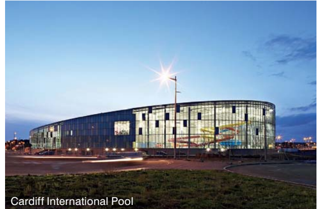
Cardiff International Pool