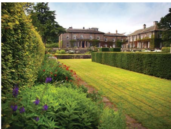
Doxford Hall hotel's existing staff will be trained by Mosaic

"As hoteliers we know how to run hotels, however, running a successful spa is a