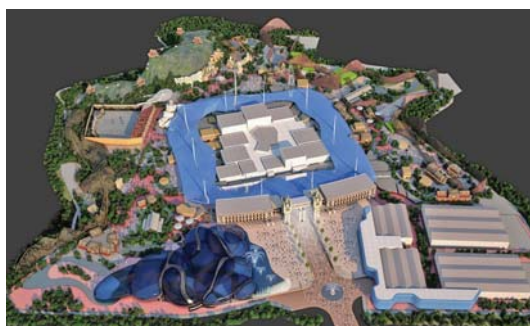
A year-long public consultation begins this month

Four public exhibitions will take place this month, and the community has been asked to attend, ask questions and provide feedback to LRCH. According to the developer, these observations will flag up key public issues on.