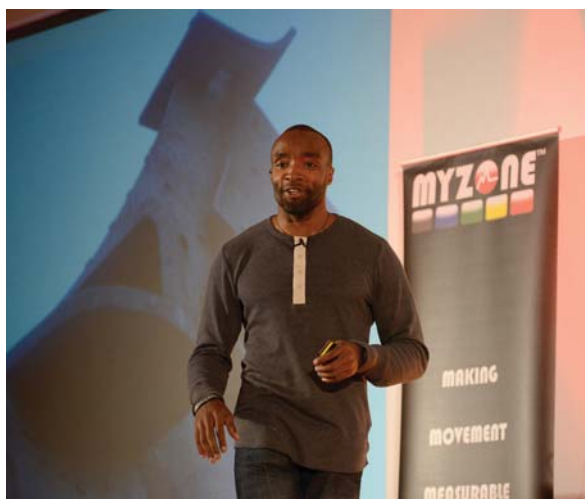
Foucan showcased his skills in the opening scenes of Casino Royale

Revealing that he has a chronic fear of heights, Foucan likened the battle to overcome physical activity to his struggles conquering his phobia in order to perform the complex sequence of stunts that saw him do battle with Daniel Craig on top of a crane. “We need to help (inactive) people to not be ruled by fear and help them turn obstacles into stepping stones,” he said. “We’re born to walk, climb and jump as a human species and Parkour embraces all of these movements.”