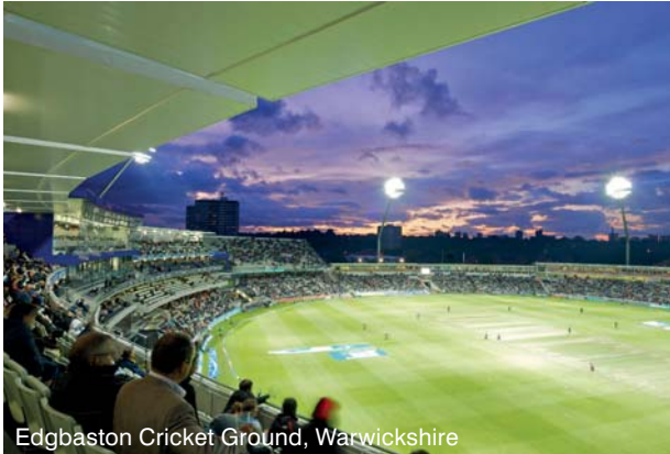
Edgbaston Cricket Ground, Warwickshire