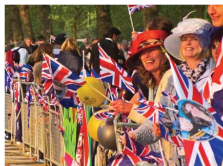
The cut 'would raise £5bn for the public purse' in 10 years

Campaign supporters range from industry bodies such as the BHA and BALPA, to small B&Bs, attractions, zoos and major brands.