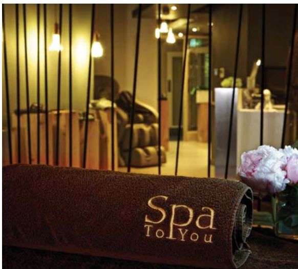
The facility is within walking distance of West End theatres

In addition to oriental bird faeces facials, the spa will offer vino-therapies from France and a wide range of massages from across the globe. These comprise traditional Swedish massage,