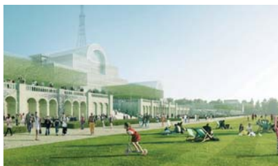
An artist's impression of Crystal Palace