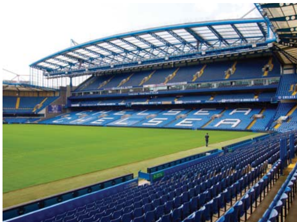
Stamford Bridge has been home to Chelsea Football Club for 109 years

"A study of the area from Fulham Broadway town centre to Stamford Bridge and beyond has been commissioned by Chelsea Football Club's owner Roman Abramovich," read a statement released by the London club. "This study will review the potential for