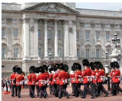
Pulse supplied MoD sites like Buckingham Palace

The £10m centre is a joint venture between Reigate & Banstead Borough Council and the Surrey County Council and is to be operated by GLL. It will feature a 25m (82ft) six-lane swimming pool, a teaching pool, a 60-station gym, plus a dance and exercise studio. The centre will also boast a four-court sports hall and football pitches. Details: http://lei.sr?a=C6V3f