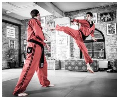
Xen-Do instructors boast a range of accolades

Equipment from the VR1 and VR3 selectorised strength lines were also installed, plus plate-loaded smith press, benches, dumbbells and functional training equipment from Jordan Fitness, as well as the Bravo Functional Trainer. Details: http://lei.sr?a=Z4E5r