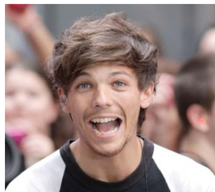
Tomlinson is a lifelong Doncaster Rovers fan

"For me, this is all about the football, the community and restoring excitement and desire