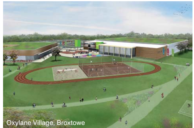
Oxylane Village, Broxtowe