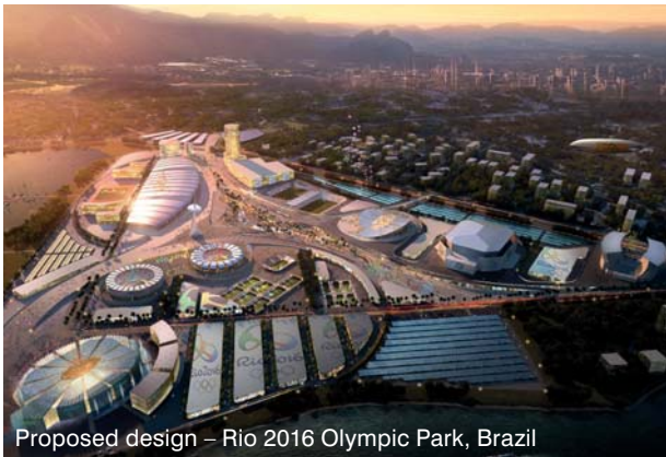
Proposed design – Rio 2016 Olympic Park, Brazil