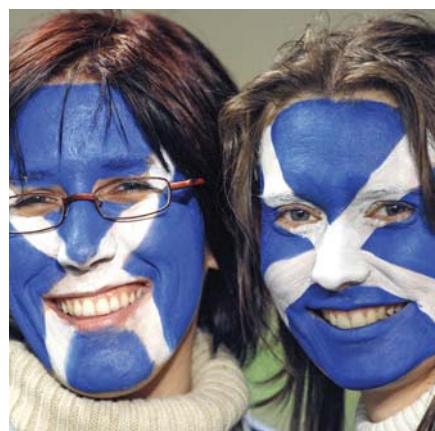
The summer of sport is expected to bring lots to cheer

"The investment in the events of 2014 such as Homecoming Scotland, the Commonwealth Games and the Ryder Cup will undoubtedly keep up this momentum throughout this