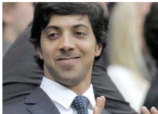
Sheikh Mansour is the owner of Abu Dhabi United Group (ADUG)

According to Manchester City Council, the economic impact of phase one is expected to create significant employment opportunities and lead to increased demand for retail, leisure and commercial developments.