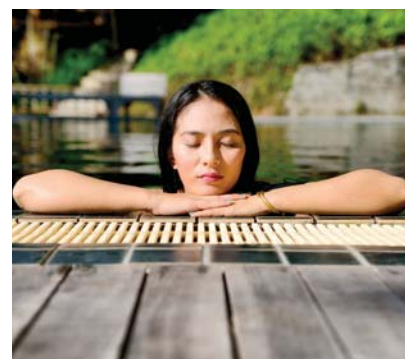
Wellness tourism is a fast-growing market

SRI International – the not-for-profit research organisation originally founded as Stanford Research Institute – led the landmark Global Spa Economy study presented in 2008 at the GSWS and will reprise that role this year. The new survey will provide the revised results required to compile the baseline for annual updates going forward. Participants must fill out their details by mid-July. Details: http://lei.sr?a=r4f8Q