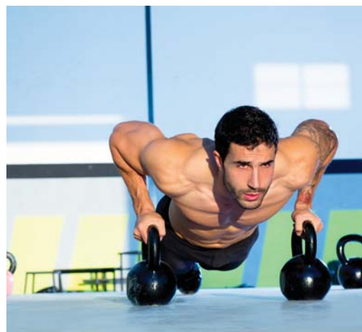
1REBEL aims to cash in on demand for high intensity training

The first set of studios are due to launch in October and funding has been put into the hands of the public through Crowd Cube, with 1REBEL attracting over £400,000 on the first day. The company aims to raise a total of £1,150,000 through the initiative, in return for 27.56 per cent of equity. A total of 27 investors had pledged money after 24 hours on the