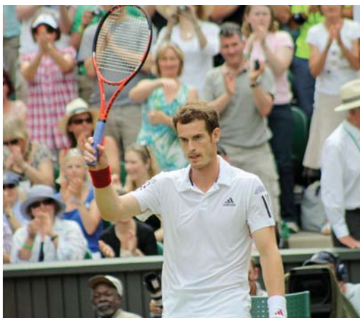
Murray was knocked out of Wimbledon last week

A spokesman for Murray's management company, 77, told local media that references