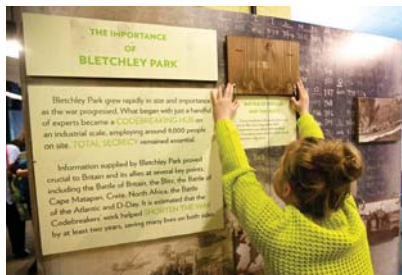
The code-breaking was vital to the war effort

The Computer Club is a new museum-wide initiative launched by the Imperial War Museum in May. The Digital Media department runs informal monthly lunch-time sessions – open to the general public – that aim to develop digital awareness and skills. It's open to all and runs across all five UK sites. The scheme is specifically informal and non-museum focused. Details: http://lei.sr?a=a7Q3d