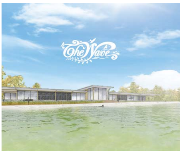
A CGI of how the visitor centre will appear, overlooking the surf lake

The Wave: Bristol is a £6.4m scheme that includes a 300m by 150m surfing lake, capable of producing 120 perfect 1.6m (5.2ft) waves per hour, with each wave big enough for an experienced surfer to ride for 20 seconds. At the centre of the development will be a freshwater lagoon, which will use Wavegarden technology created by a Spanish firm to replicate tidal movements.