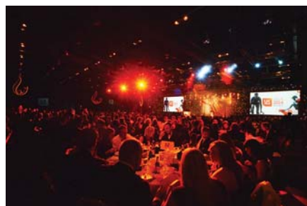
Around 800 industry representatives were in attendance