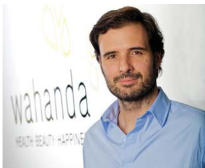
Wahanda founder and CEO Lopo Champalimaud

There are five treatment rooms in the spa, featuring contemporary décor. Also included is a salon with three nail bars and two pedicure stations, as well as a hairdressing zone. Beyond the treatment rooms, there is a spa relaxation room with access to a sauna and hydrotherapy whirlpool. Outside the relaxation room is a seating area for guests to enjoy complimentary herbal tea. Spa products are supplied by Caci, Dermalogica, OPI, Eyelash Emporium, Mii Makeup, XenTan and L'Oréal. Details: http://lei.sr?a=g7F2h