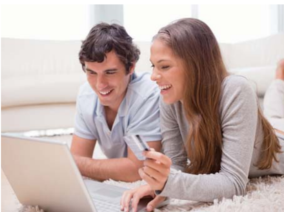
Using multiple platforms negatively impacts sales conversion rates

An increasing number of tools allow consumers to search and compare thousands of flights and hotels in an instant. For example, Deloitte's research shows 59 per cent of holidaymakers compare prices online. It also found a third of holidaymakers used two or more devices when researching their most recent holiday, but only 17 per cent of vacationers researching on their smartphone also used the device to book.