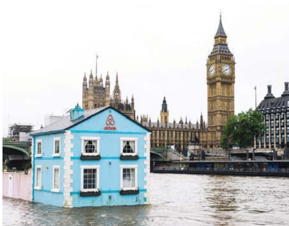
The Floating House offers a unique tour of London landmarks

"For the Floating House, we were inspired to create a fairy tale structure in the middle of London – something that would allow people to see the city from a different angle," said the twins. "It was crucial to us that this was a real house, not just a stage set. That's why it had to provide more than just bedrooms