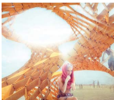
The Infinity Tree pavilion reflects natural design

The pavilion will be made from latticed timber and offers foot and hand holds, so that