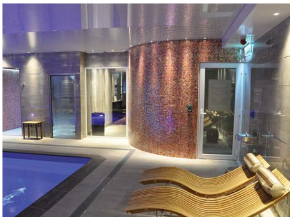
The extensive development started in September 2014

"The hotel's co-owner, Tim Hassell, came with me to Barcelona to source the wet zone