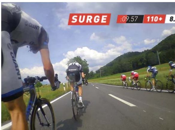
The Sufferfest features officially licensed footage from the biggest races

With a passionate fan base spanning more than 70 countries, The Sufferfest has been developed by world-class cycling coaches and is driven by synchronised soundtracks,