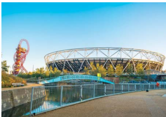
The UCL campus is part of the wider Olympicopolis development

The UCL campus is part of the wider Olympicopolis development, which will also include projects involving the Victoria & Albert Museum, the University of the Arts and Sadler's Wells. Talks are also ongoing with the Smithsonian about creating a presence at the site. The first phase of the UCL East project aims to create a collection of innovative knowledge centres, bringing together