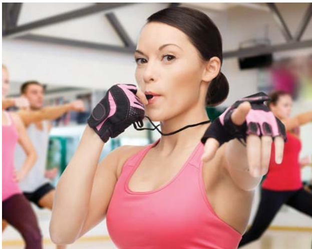
Women make up the majority of the industry's workforce