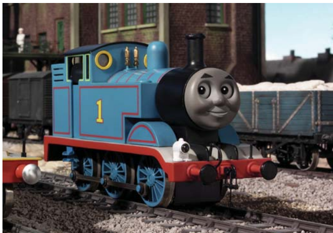
Thomas The Tank Engine has been a huge success since its creation in 1945

In the attractions realm, Drayton Manor recently spent £2.5m expanding its Thomas Land attraction, which has gone from strength to strength since its launch in 2008. Plans are also in the works for a Thomas theme park in Massachusetts, US, while the IP has frequently been touted as "key" to the survival of heritage railways worldwide.