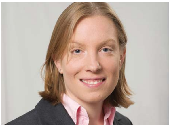
Crouch is an active footballer and has coached a team for nearly a decade

Crouch replaces outgoing sports minister Helen Grant, who – despite claiming “sport was in her DNA” – drew criticism in 2013 for being unable to answer five simple sports questions.