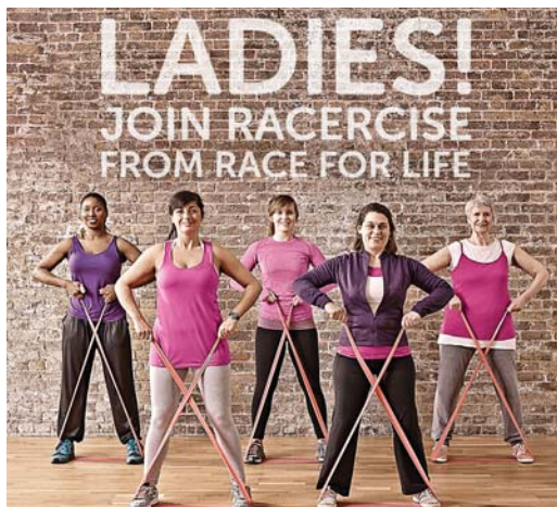
Racercise instructors will enjoy a "unique opportunity"

According to Cancer Research, instructors will have a "unique opportunity" to appeal to the millions of women in the UK