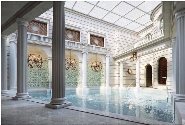
Designed by Champalimaud, the hotel will retain its Georgian characteristics

The 99-bedroom hotel will include an exclusive spa suite and two further spa rooms with in-bath access to the thermal waters via a second tap. YTL claims these are the only guestrooms in the UK to offer this option. The Aroma Bar within the spa allows guests