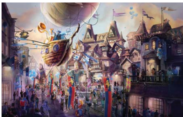
A computer graphic of Farrells' vision for the £2bn development

The masterplan aims to create a major entertainment resort with the added complexities of integrating a large development into an area of existing communities with their own identities, as well as integration with the planned Ebbsfleet International Station and Ebbsfleet