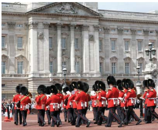
Britain's cultural heritage is a big driver of inbound tourism

The report also showed that new middle classes from countries like China, senior