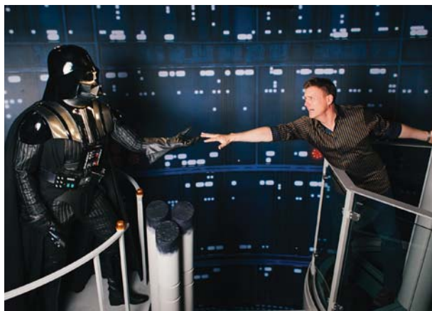
Fans are able to recreate classic scenes from the Star Wars series