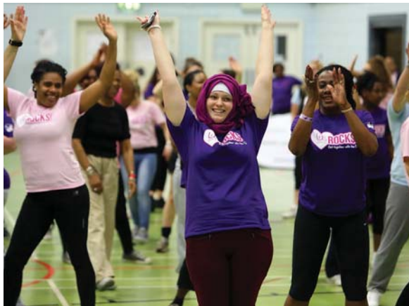
The Us Girls campaign will be rolled out right across Wales

The problem is related to girls becoming physically inactive at a young age – at the end of secondary school, only 44 per cent of Welsh girls take part in sport. The newly appointed