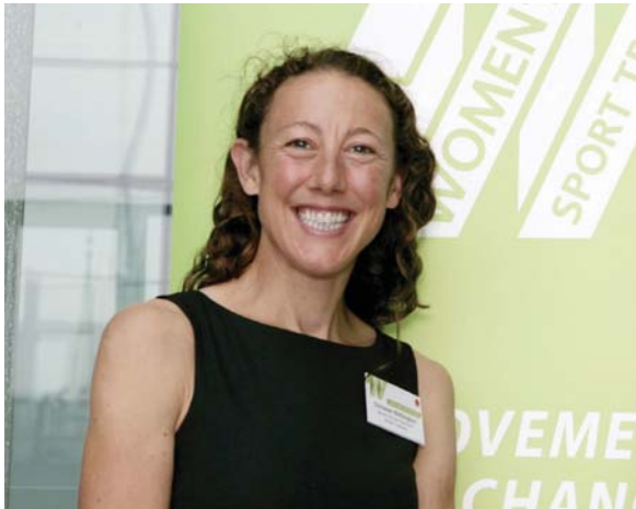
Triathlon champion Chrissie Wellington is among the keynote speakers