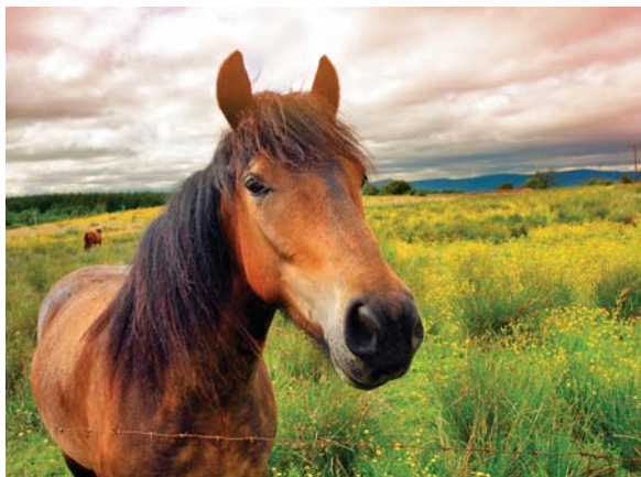
The equestrian centre will be built near Hayfield Riding Centre

"The five-star hotel will complement the existing recreational uses within Hazlehead Park and will bring real economic and social benefits to the city by providing a riding centre, swimming pool, spa, restaurant and