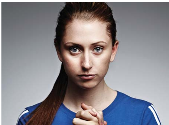
Role models like Laura Trott – can encourage women to take up sport