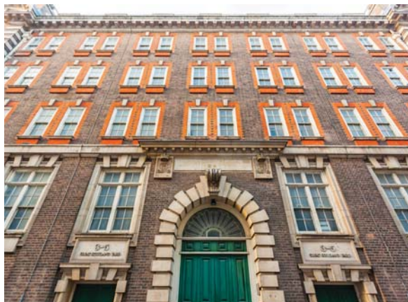
The 92,000sq ft (8,547sq m) hotel will be fully-refurbished

The completed hotel will be seven-storeys high with two basement levels. It will retain