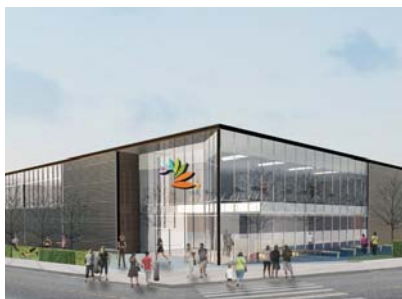
The centre is designed to be dementia-friendly