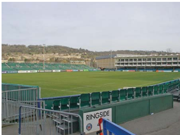
The Recreation Ground stadium has a maximum capacity of 14,000

"The trustees would like to thank the tribunal for the clarity of their judgement on this complex issue and for the guidance offered on the next steps required," the statement said. "The appeal addressed a specific point of law around the status of the Recreation Ground and the judgement has clarified that in essence the land is to be used as a recreation ground for the public and can