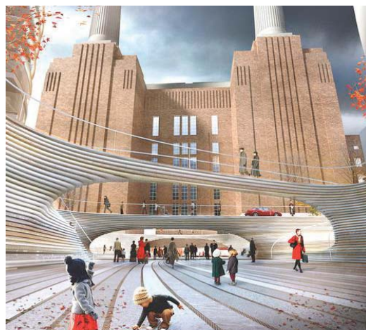
BIG is designing a public square next to Battersea Station

It will be conceived as an urban amphitheatre for public, and spontaneous, performances. Both Malaysian stone grains and reclaimed power station chimney material will be used. Ingels recently told an audience at the Royal Academy in London, that they are speaking to experts in Tesla coils to see how