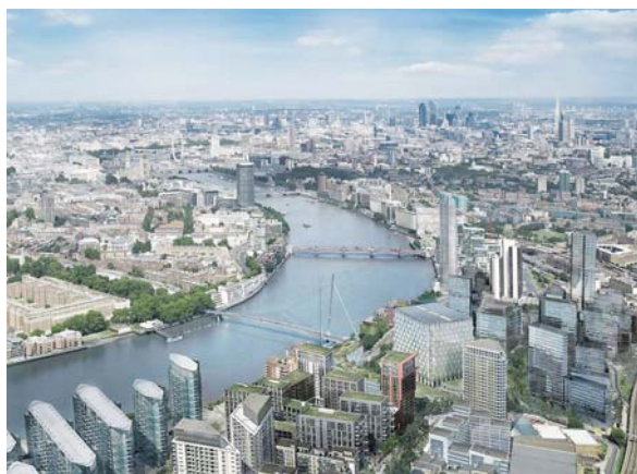
The crossing is expected to offer a car-free alternative to boost activity

Wandsworth Council, which is running a design competition for the new London bridge, has unveiled proposals from the four architecture and engineering teams which have been shortlisted for the contest. One of the challenges for the teams – picked from a field of 74 entrants – is to create a bridge which is high enough for boats to pass under, but not too steep for pedestrians and cyclists to climb. The bridge is seen as a key part of a