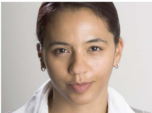
BHA chief Ufi Ibrahim wants forthcoming strikes to be called off

"London's economy is heavily reliant on its fast and reliable public transport network to