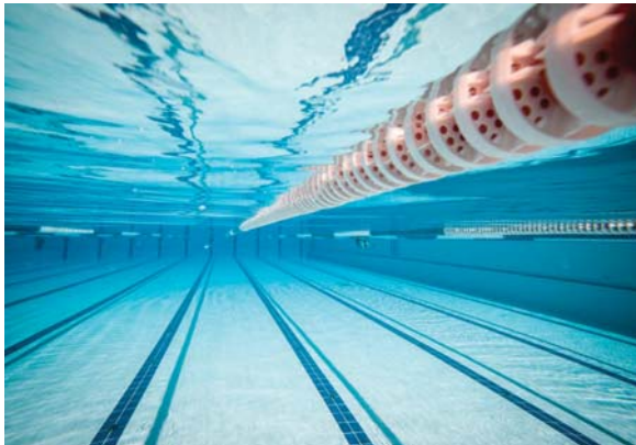
There are 3,265 swimming sites in the UK, down from 3,287 last year

Despite being the most popular participation sport in England – with more than 2.5 million adults taking part in 30 minutes of moderate intensity swimming at least once a week – swimming has lately been on the decline. The most