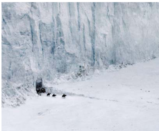
The Wall is one of the focal points of Game of Thrones

"To have the set there would be the icing on the cake," said East Antrim MP, Sammy Wilson. "It is a magnificent site and it would be a massive tourist attraction. The number of buses and people who stop to try and get a view of it is an indication of that." Tourism Ireland teamed up with HBO and Game of