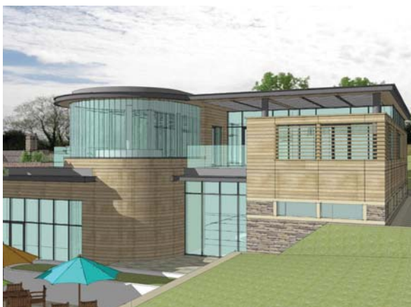
The new spa is designed by Plymouth-based firm Design Development

The new spa, designed by Plymouth-based Design Development architects, is a strikingly modern building constructed of glass, wood and stone that was inspired by the surrounding moorland. The hotel itself is steeped in history; housed in a manor house that Henry