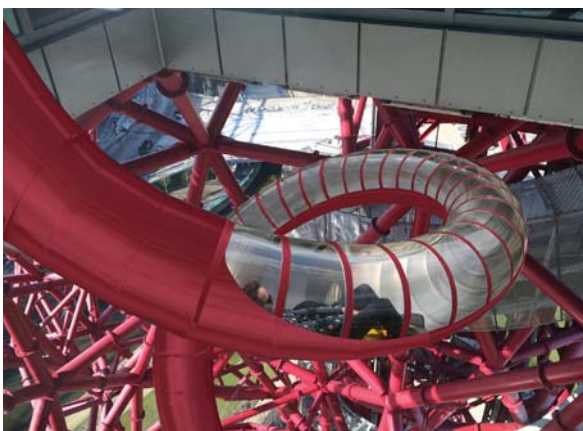
The helter skelter by Bblur Architects will circle the tower five times

"What more exciting way to descend the ArcelorMittal Orbit than on the world's longest and tallest tunnel slide," said Peter