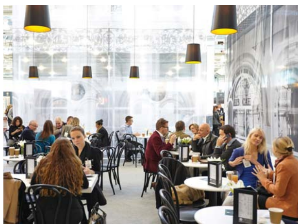
More than 300 exhibitors from the hotel industry will be in attendance

Organisers say this year's show promises to be "bigger and better" with a number of new features, including an expanded Destination Spa area, dedicated to hotel spas. As well as giving attendees access to suppliers from the health and wellness sector, the area will also offer spa business sessions featuring industry insights and ideas.