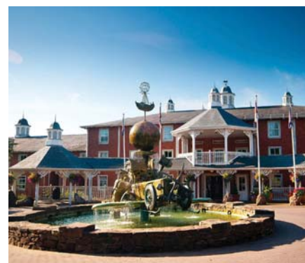
It joins the existing Alton Towers Hotel and Spa

Most recently, the park launched its Enchanted Village accommodation, which is made up of 120 fairytale lodges and five luxury tree houses, offering an alternate