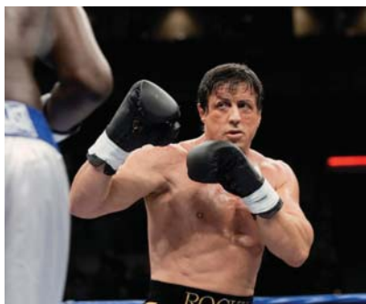
Rocky has been a fitness inspiration to millions