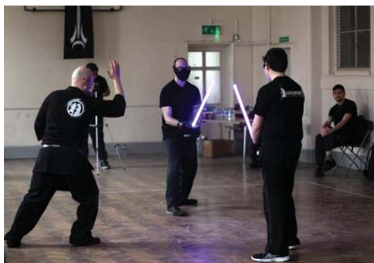
LudoSport has several academies across England

There are currently four LudoSport academies in the UK – Bristol, London, Cheltenham and Cardiff – which teach the seven styles of the sport from the Star Wars world using flexible blades mounted on weighted hilts. "We're not here pretending we've got special