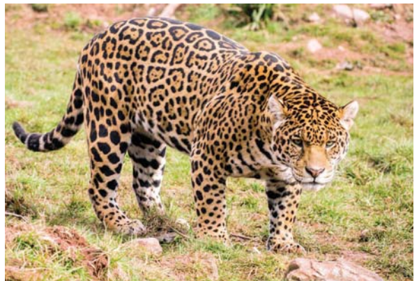
The zoo was initially set to close permanently on 11 January

"We hope that 2016 will bring increased funds and awareness to all our overseas projects