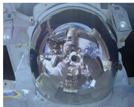
Space-themed Galactica will be a UK first

Alton Towers is leading the way for development of VR coasters worldwide in 2016, with Mack also telling Leisure Opportunities that it is working with several major IPs for