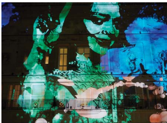
Installations for the event were spread right across the city

The event was given the full support of the city and was backed by London mayor Boris Johnson, with founding support from Bloomberg Philanthropies, Atom Bank, London & Partners and the Heart of London Business Alliance. Each location showcased a number of artists. Highlights