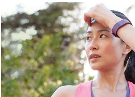
The Fitbit Charge HR is one of the devices mentioned in the suit

The lawsuit states: "Plaintiff Black was approaching the maximum recommended heart rate for her age, and if she had continued to rely on her inaccurate PurePulse Tracker, she may well have exceeded it, thereby jeopardizing her health and safety." Fitbit has indicated that it will