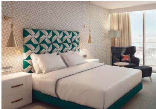
Classic design and innovation are central to the aesthetic