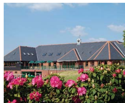
Wharton Park is the firm's latest acquisition