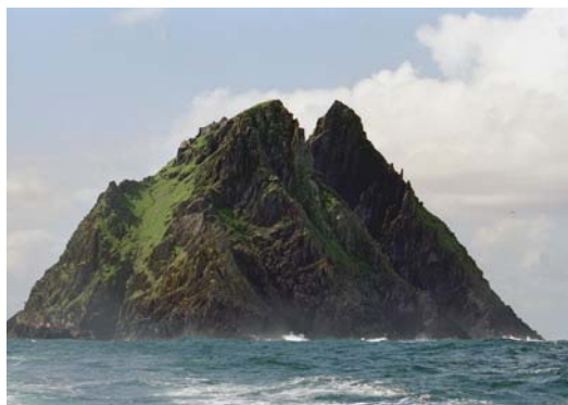
Skellig Michael is at the heart of Ireland's tourism push

In addition to the video, Tourism Ireland has created a dedicated website for Star Wars fans, as Northern Ireland did for Game of Thrones with great success, pin-pointing where filming locations were and how to reach them with ease.