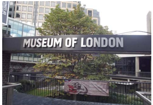
The Museum of London is expected to relocate by 2021