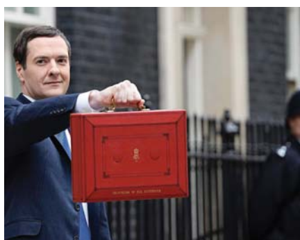
Austerity cuts have hit regional museums hard

On a brighter note, while year-on-year public funding decreased by 2 per cent and income from grants and donations had fallen by 4 per cent, self-generated income from regional museums increased by 6 per cent, indicating an attempt to counter cuts by