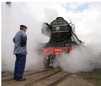
Rides for the public will begin in February

VR is about to take a big step into the mainstream, with not only the Rift, but also the newly-announced HTC Vive, Playstation VR and Microsoft Hololens all preparing for commercial launches. Details: http://lei.sr?a=U4N7W_O