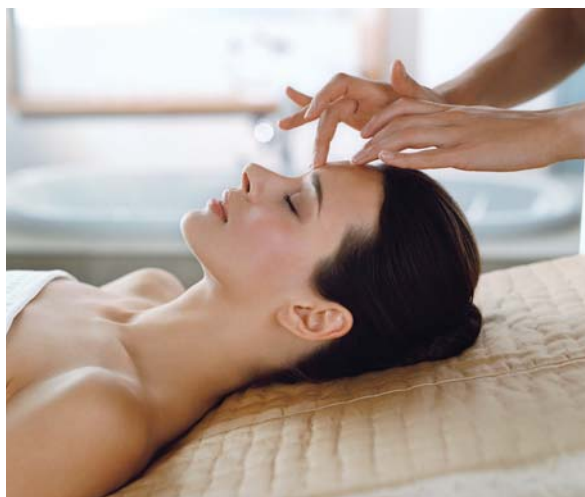
The training centre teaches a broad curriculum of topics

"The heartbeat of Elemis has always been education. After 25 years, it's incredibly important our delegates are brought into an environment that represents the journey of the Elemis brand to its fullest. To be immersed in that environment is key to enabling delegates to fall in love with the brand." Taking cues from the Elemis journey,