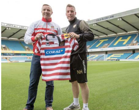
Wigan Warriors took on Catalan Dragons at the New Den last year

He said the Super League plans to take "three good rugby league events" to London