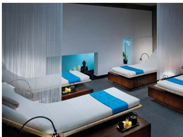
The first Voya pop-up spa will be at the Mandarin Oriental London