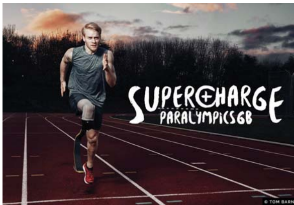
Jonnie Peacock features in the campaign video and imagery

Baroness Tanni Grey-Thompson said the team needs "as much support and preparation as possible" and highlighted the importance of