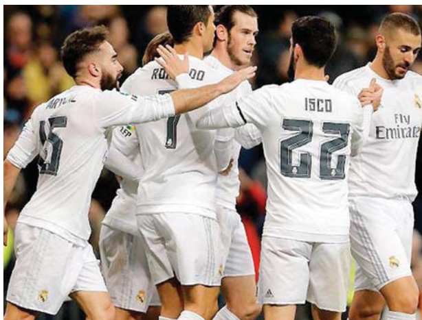
Real Madrid was the richest club in Europe for the 11th season in a row

La Liga rival Barcelona was second in the table, leapfrogging Manchester