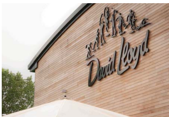
The deal accounts for 44 of DLL's 80+ UK portfolio

"Long lease property investments such as this provide attractive cash flows that are