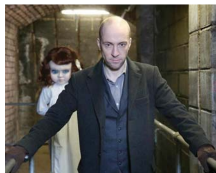
The 15-minute ride is said to have multiple endings

“After careful consideration we’re moving the opening date for Derren Brown’s Ghost Train,” said a statement. “This attraction is a completely new invention and we are making final tweaks to the remaining elements to get things absolutely perfect. We want you guys to have the full mind-blowing experience from the very first time you ride!”