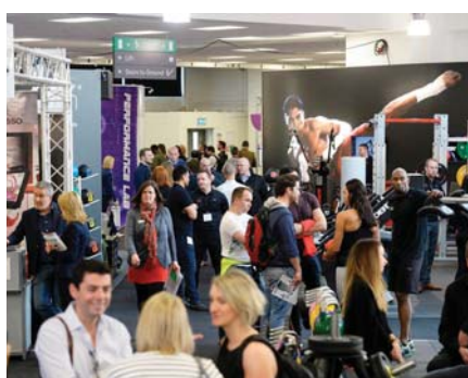
Next year's Elevate show will be at ExCeL London

In her opening address, Davies called on health professionals, fitness professionals, teachers and sporting role models to come together to help promote