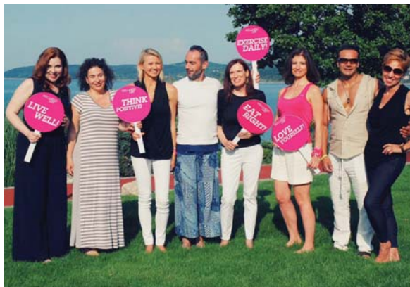
GWD 2016 is gaining support from elected officials worldwide

“Global Wellness Day is now recognised as an agent of change and transformation,”