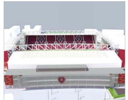
An artist’s impression of the new Tynecastle

When permission was granted, Celtic CEO Peter Lawwell said safe-standing represented an “investment in spectator safety.” Details: http://lei.sr?a=G6v8C_O