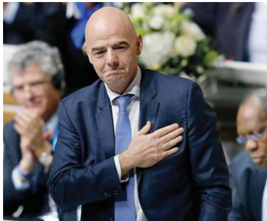
Gianni Infantino wants expansion of the World Cup to 40 teams

An England bid – backed by Prince William and David Beckham – lost out in the race for the 2018 tournament to Russia, but the Football Association’s (FA) outgoing chair Greg Dyke hinted at a renewed bid for 2026 if Sepp Blatter was removed from his role as FIFA president. So far Canada, Mexico and Colombia have confirmed their interest in bidding.