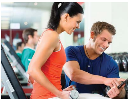
Lack of 'soft skills' among PTs is a perennial industry concern

Key areas of concern highlighted by operators, employers and the PTs themselves include: communicating with clients, preparing and implementing client-centred solutions, mastering behaviour change and developing a defined identity, business image and professional manner in the workplace.