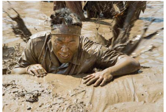
Consumers are willing to splash out on extreme endurance events