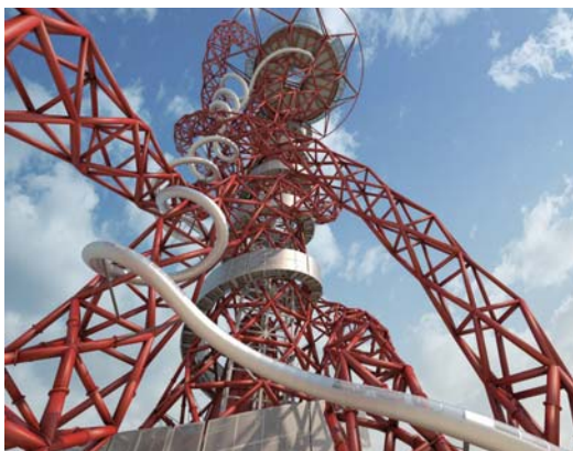
The Slide will twist and turn 12 times in total

Slide manufacturer Wiegand and British firm Interkey are also involved in connecting the attraction's 30 steel sections, using a complex