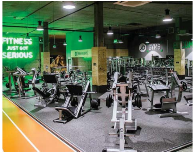
The recently-launched gym in Coventry has a strong emphasis on design

The venue also features saunas, a sprint track, prowler track, tri-rig and the area’s largest free weights area with more than 30 benches. A large studio and group cycling studio play host to over 60 classes a week, all of