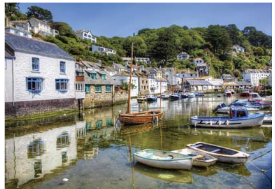
The Fund has been set up to build 'world-class' tourism products

"To fight for our market share and stay competitive in this fast-moving, fast-growing industry we need to be able to offer world-class tourism products to the right customers at the right time. By converting aspiration to visit into bookings we can drive more visitors across