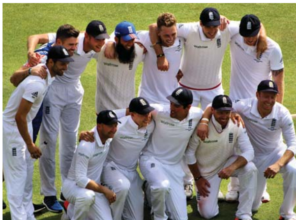
The ECB still increased its funding for the England Teams

Aside from the financial aspect of the report, the document revealed its strategy for increasing grassroots numbers among young people, which is being led by head of participation and growth Matt Dwyer.