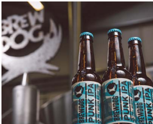
£19m has been raised in funding to develop the new hotel

The company's year-long crowdsourcing campaign Equity for Punks IV – the fourth it has launched for various projects over its lifetime – raised more than £5m in the first 20 days and reached £19m by the time it ended on 20 April 2016. This will now be spent on developing the hotel project.