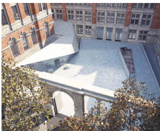
The courtyard is also expected to be completed later this year

Groundworks began in 2014 and more than 22,000 cubic metres of soil were removed in 2015. The gallery structure has been created