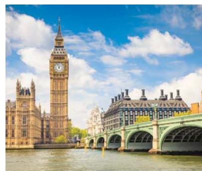
The work will take three years to complete

An on-site spa will also feature steam-baths, a sauna and treatment facilities. Details: http://lei.sr?a=M3Q6h_O