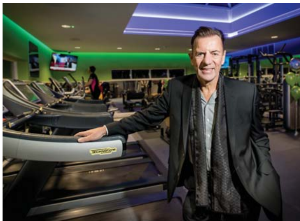
The chain founded by Duncan Bannatyne enjoyed a strong 2015