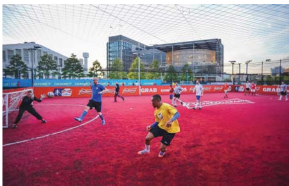
The £40m outlay is being provided by owner Patron Capital