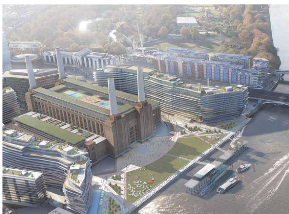
Circus West is due to be completed in October 2016

Six other phases will include schemes designed by Frank Gehry, Norman Foster and potentially Bjarke Ingels. Overseen by the Battersea Power Station Development Company (BPSDC), the 40-acre project will create 18 acres of new public space, including a six-acre public park, approximately 200 shops