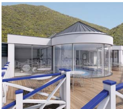
The new Cary Spa opens in August

YouSPA’s European search site, youspa.eu , features more than 100 search parameters to enable users to find the best spa for their wellness requirements. Details: http://lei.sr?a=G5j2R_O