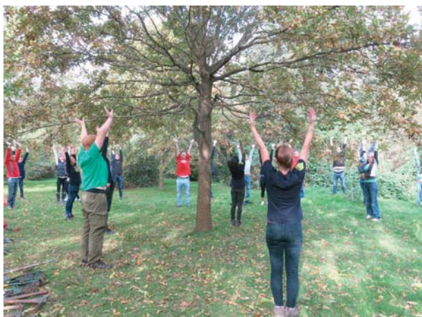
Green Gym generates £4.02 worth of social value for every £1 invested

Green Gym aims to improve the health and wellbeing of its participants – typically harder to reach demographics who may be experiencing joblessness, ill health due to lifestyle conditions, or have mental health conditions – by boosting their activity levels, reducing