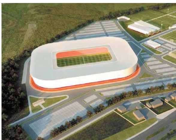
The stadium is expected to be ready for the start of the 2019/20 season