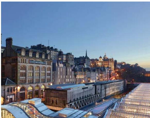
The development will transform a key under-used site on Market Street

He said his studio have created a site-specific "biogeographical" response to these