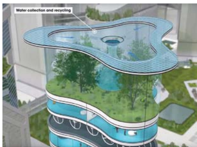
Holistic design will be key for future buildings