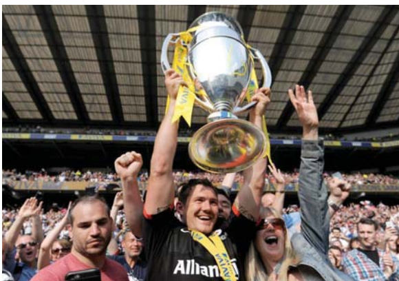
Saracens won the Premiership Rugby title last season (2015-16)

The agreement is made up of two payment timescales: the first four-year payment fixed at £112m (US$147.1m, €133.9m), while the second four-year payment could potentially be higher than £112m depending on the English Qualified Player threshold being met by clubs and academy standards achieved. Those academy standards should improve, however, with a