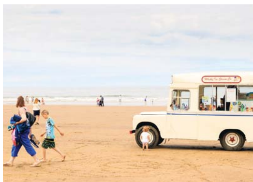
Domestic tourism bookings have increased as a result of Brexit

While many are predicting doom and gloom for the UK's economy as a result of the Brexit, the inbound tourist industry is buoyant as operators plan to increase levels of investment into their product. According to the Tourism Alliance, 20 per cent of those