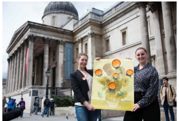
The renewal of BP's sponsorship deal has drawn the ire of protesters

“At a time when the world needs to shift away from fossil fuels, the idea that these