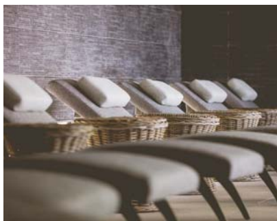
The design of Gaia Spa has been inspired by nature