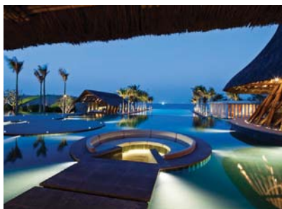
The Naman Resort is among the winners