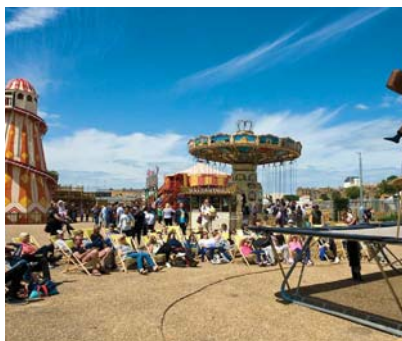
Things are looking up for the theme park

The museum announced plans to relocate in March 2015, with management citing a number of problems at its current site including difficult accessibility, an ageing building and a poor location. Details: http://lei.sr?a=F9u8d_O