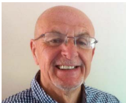
McCarthy is one of the true industry veterans