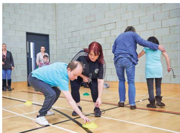
Individuals will be able to take part in a number of physical activities

Participation in sport has "significant physical, mental and emotional benefits"