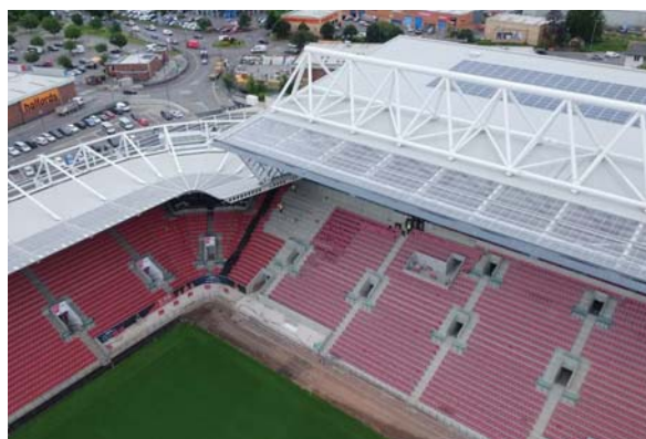
The solar panels are estimated to save the club £150,000 in energy bills

The rebuilt stadium will include air-to-air heat recovery, low energy lighting, automatic controls, low water consumption