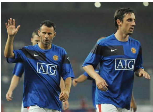
Giggs and Neville have moved into the world of hotel development

Studio Plant Intelligent Environments will landscape the site, including an outdoor covered garden over multiple levels, linked by a 15m "architectural staircase" edged by bars and restaurants. The scheme, with an estimated cost of £200m has proven