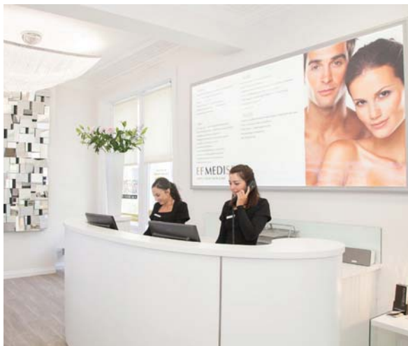
The company opened its first franchised site in Bristol in June

EF Medispa offers face and body treatments, ranging from non-invasive and minimally invasive technologies through to more complex, surgical options. Its Drip & Chill