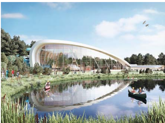
A water park will be the main feature of Center Parcs Longford Forest

According to Center Parcs, the economic value of the attraction will be significant for both County Longford and the wider Midlands region of Ireland, with an estimated €1bn (US$1.1bn, £841m) being added to the national GDP over the course of the next two decades. Center Parcs was purchased by Canadian