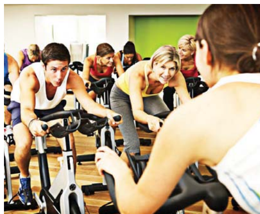
Inactive members who revisit their club are less likely to quit