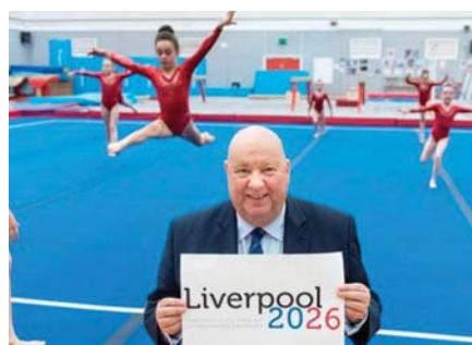
Anderson said the Games would rejuvenate the city

The government will make a final decision as to whether Liverpool will be nominated as