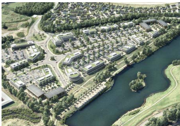
the Llanelli Wellness Village will include a wellness hotel and spa

"The village is designed to bring together tourism – specifically wellness tourism – health services, life science and wellbeing research and innovation, housing, sport and