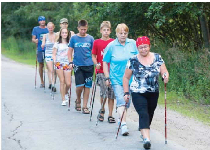
The PHE guidance calls for increased emphasis on creating “active environments”

“Persuading inactive people (those doing less than 30 minutes per week) to become