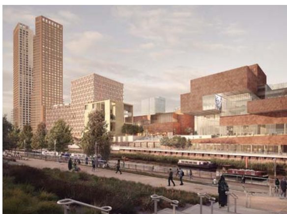
The new facilities are being designed by Allies and Morrison architects