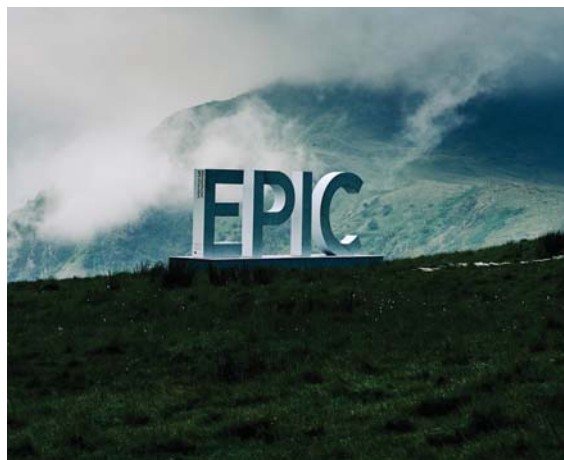
The installation will travel throughout Wales during the summer

The £4m campaign will also include television and cinema advertising airing to a domestic market across the UK and