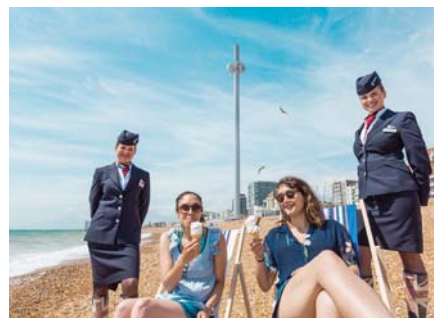
The i360 opened on Brighton’s seafront last week