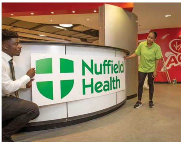
Nuffield's green shield logo being installed at a Virgin Active club

A multi-million pound investment programme will now begin to turn the sites into Nuffield Health Fitness & Wellbeing Centres. Plans include enhancing current facilities with the addition of medical clinics within a number of the gyms, featuring services such as physiotherapy, in-depth health assessments, nutritional therapy and private GP appointments. Once up and running, the services will be made available to both non-members and members.