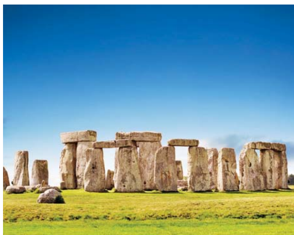
The scheme will award grants of between £3,000 and £250,000

Under the new scheme there are two levels of funding. For grants of £10,000 or less, the application, assessment and monitoring process will be much simpler than for grants above that sum. The programme has no deadline, with all applications being assessed in an eight-week period. Grants will be awarded by local HLF officers or a deputy director of operations.