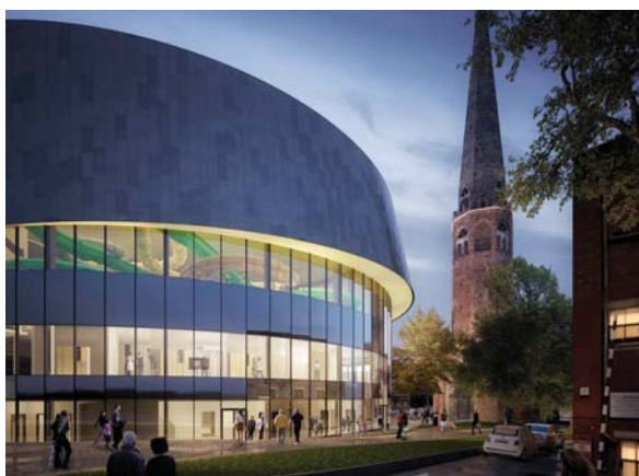
The water features and high-octane rides will be on the upper level

Hall said the planning the venue had signalled a change in the funding of aquatics facilities which had been "driven by lane swimming" over the last 20 years.