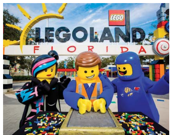
Merlin expects further recovery for its theme park businesses

Reporting its half-year results, Merlin, which operates more than 100 attractions worldwide,