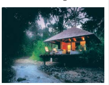
The resort's spa is integrated into the surrounding tropical rainforest

Signature treatments on offer at The Datai Langkawi spa include The Datai massage, Balinese Massage, Warm Stone Massage, and