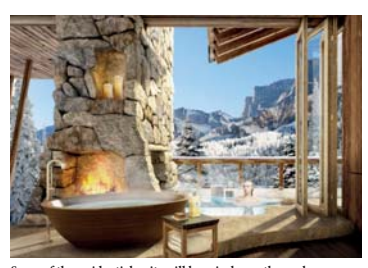
Some of the residential units will have in-home thermal spas

Included in the spa complex will be a number of thermal water pools; a Russianstyle Banya Suite connected to an indoor/