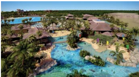
The plans for the huge resort include a number of luxury spas, hotels and attractions

Situated along the resort's 17km beachfront, the first property to launch will be Aman Country Club and Villas, opened in partnership with Aman Resorts International. It will be followed by Sheraton Resort and Convention