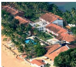
The resort was formerly known as Kani Lanka

Further facilities at the resort include a Nick Faldo-designed golf course, a health club and a watersports centre. There is also a range of dining options including Azura, a beachfront restaurant serving Italian food and seafood while The Watercourt restaurant serves French cuisine with hints of Vietnamese influence.