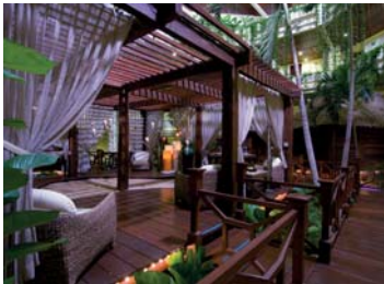
The luxury resort's Yhi Spa will feature outdoor treatment rooms

Six restaurants and five bars are on offer including Tempo by Michelin starred chef Martin Berasategui, who partnered with