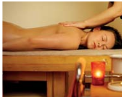
The Majestic Spa has seven treatment rooms

There is also a tea garden where guests can enjoy a selection of healthy beverages and snacks. Details: http://lei.sr?a=z1c1t