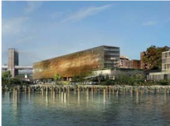
The first new spa will be located at the 1 Brooklyn Bridge hotel in NY

Under a Tree is also working on the luxury 51* Spa Residence, being developed by the Swiss Development Group, in the alpine thermal town of Loeche les Bains in Switzerland. The 8,000sq ft (743sq m) site will provide a