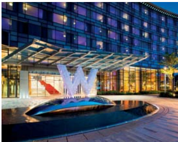
The hotel was created by architects WATG and designers Rockwell Group

iLA products are used in the spa and treatments include massages, facials, body and beauty treatments and wraps and scrubs. The spa also offers nine Away guest rooms