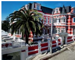
The historic Palacio Astoreca in Valparaíso, Chile

Designed by Alvano and Riquelme architects, the hotel features art by contemporary painters such as Ricardo Yrarrázaval and Frederic Clot. A key feature of the hotel is the Palacio Astoreca Spa which features a covered pool, a hammam, a massage room and a hot tub heated with firewood. It also houses a steam bath and a heated indoor pool.