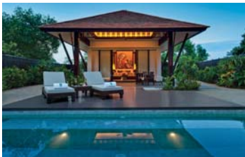
Facilities at the resort include two hotels, two spas and a range of pools

One of the signature therapies is the 150-minute Royal Banyan Herbal Pouch Therapy, which includes a lemongrass cucumber body scrub, a royal Banyan Herbal pouch therapy, a jade face therapy and a therapeutic herbal bath. Other treatments on offer include a range of body wraps, scrubs and massages.