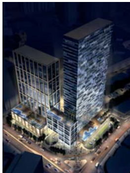
An artist's impression of the Raffles Residences

Fairmont's Makati City features six restaurants and lounges as well as more than 1,700 sq m (18,298sq ft) of versatile meeting and function space including a 900sq m ballroom. All the new restaurants and bars in the complex