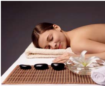
The Celestine spa has five treatment rooms and three massage lounges