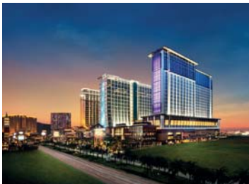
The resort hotel has 3,896 bedrooms and houses a 1,700sq Shine Spa

Signature treatments include Shine Champagne Bath, offering guests the fizzy champagne-scented sensation of tiny bubbles surrounding the body while they sip champagne from a flute. Other treatments on offer are the 24K Gold Massage, Bamboo Lava Massage and Red Algae and Aquatic Mint Wrap.