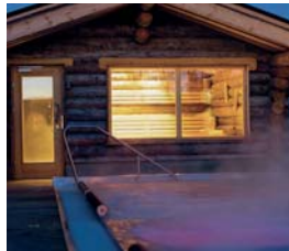
The spa's kelo-wood sauna - one of the firsts in the UK

A signature feature of Y Spa is one of the UK's first authentic Finnish kelo saunas, a standalone outdoor cabin which has been constructed using 100-year-old imported kelo logs. This overlooks a hydrotherapy pool which