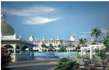
The 538-room resort is located on the Matapalo beach in Guanacaste

It also houses saunas, steam-rooms, spa pools and relaxation rooms. A range of signature treatments are on offer, including Renova Combination, an 80-minute treatment focusing on energy balance, mind and body tranquility and stress relief. Guests have a choice of four restaurants; the Japanese Tokio,